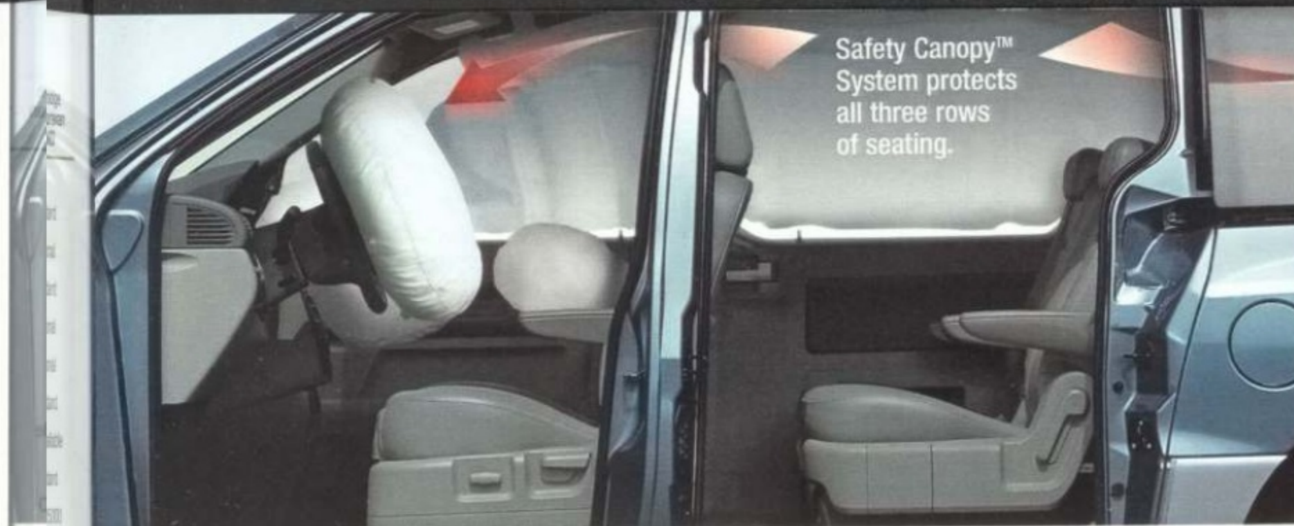
Safety Canopy TM System protects all three rows of seating.