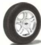
16" Painted Aluminum 5-Spoke Sport Wheels