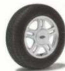
16" Painted Aluminum 5-Spoke Wheels