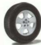
16" Bright Machined Aluminum 5-Spoke Wheels