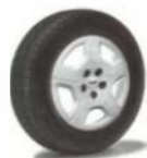
16" Steel Wheel with Full Wheel Covers

S = Standard 0 = Optional -- = Not Available *Under normal driving conditions with regular fluid and filter changes. **Always wear your safety belt and secure children in the rear seat.