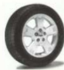
17" Aluminum Alloy Wheels (Late Availability)