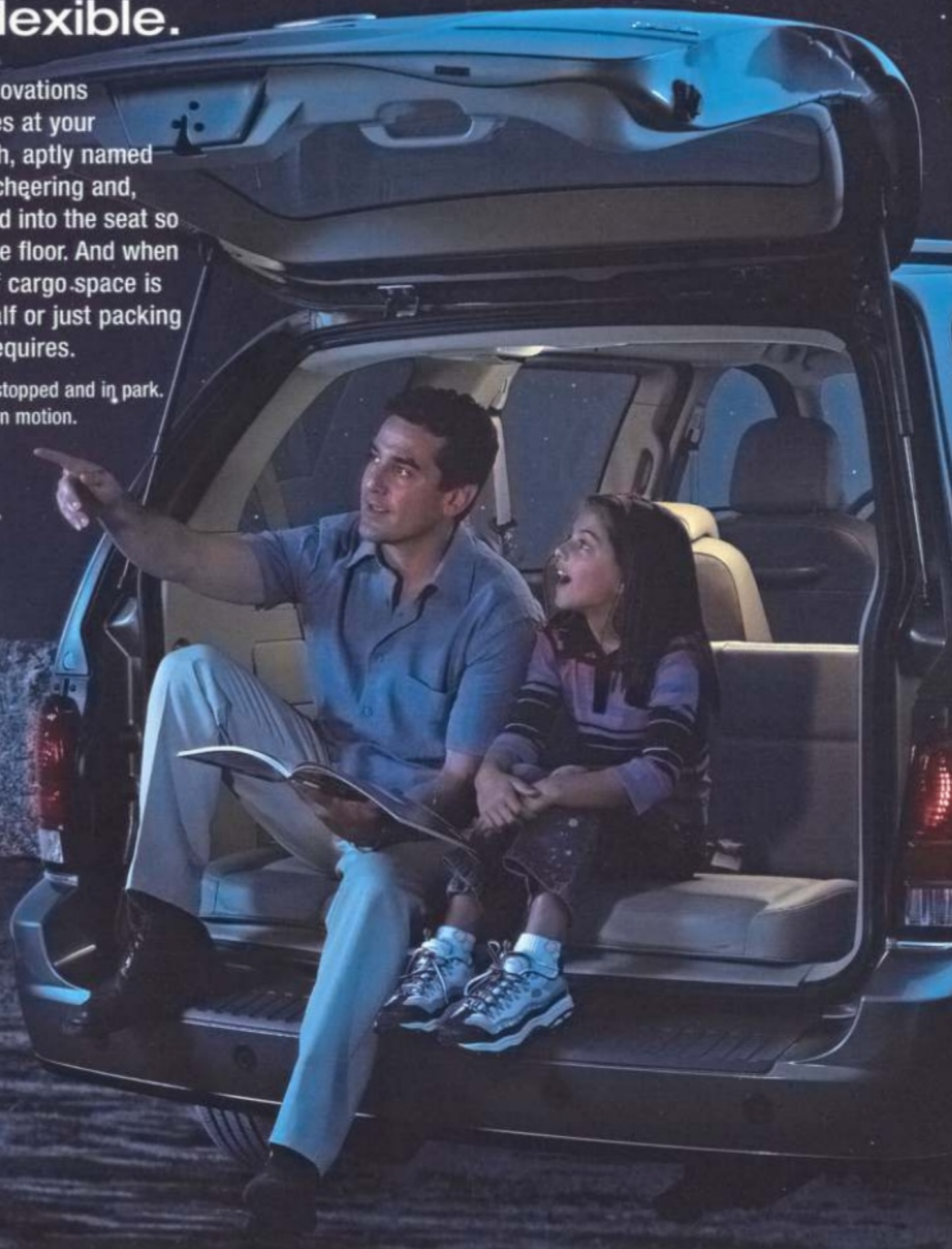
The innovative 3rd-row Tailgate Bench Seat™