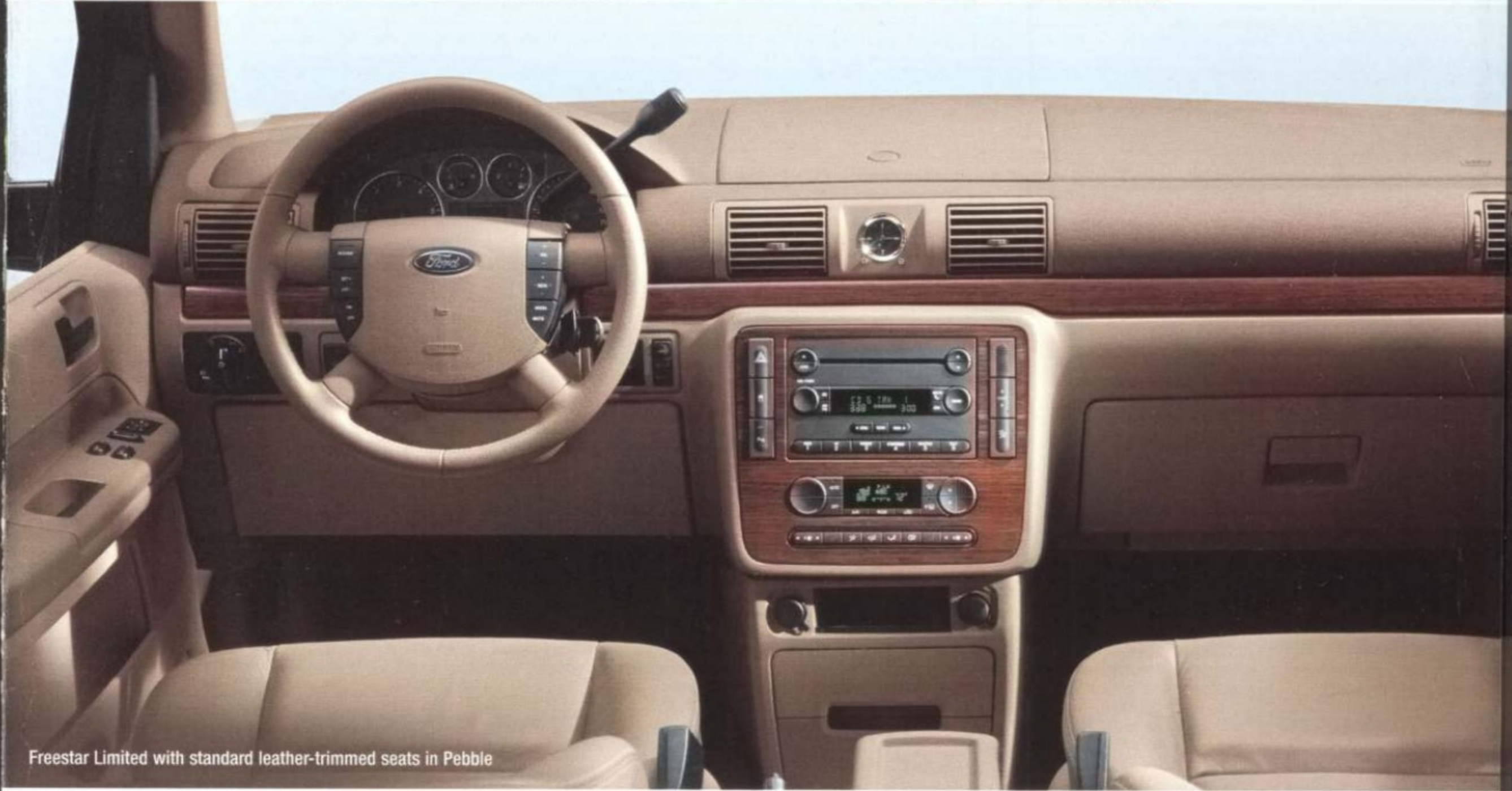
Freestar Limited with standard leather-trimmed seats in Pebble

1 With life comes stuff. And we made sure Freestar has the features you need to accommodate all that you collect. Like an in-dash storage compartment that opens with the push of a button and holds small items like maps and CDs. 2 And the third-row cargo well that's extra deep for keeping groceries and other items in their place. 3 Or a best-in-class front-door storage system with two