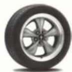
17" Premium Painted Aluminum Wheel w/Bright Flange