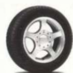
16" Bright Machined Aluminum Wheel