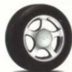
16" Painted Aluminum Wheel

†Always wear your safety belt and secure children in the rear seat