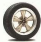
17" Premium Painted 40th Anniversary GT Premium Wheel