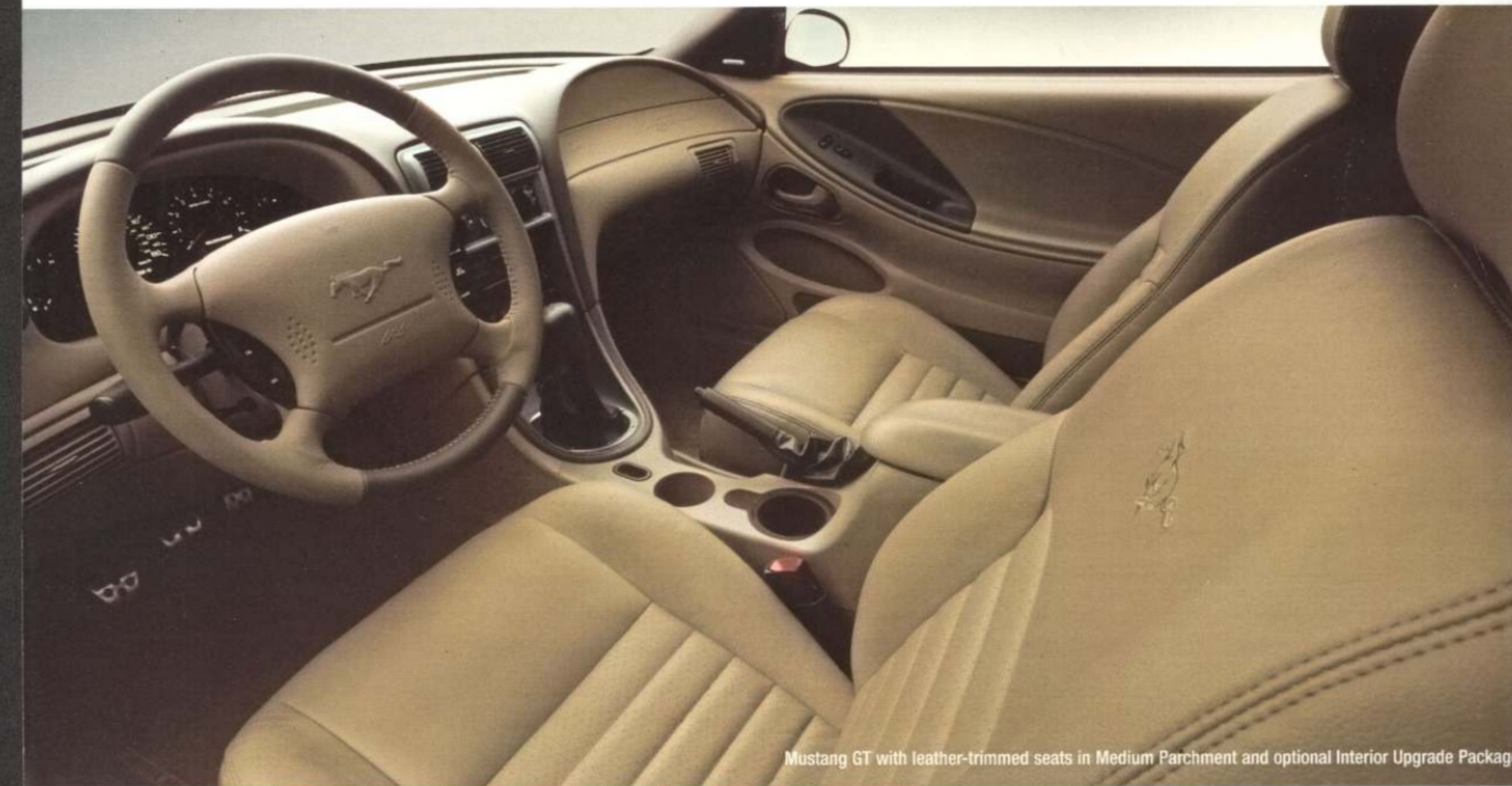
Mustang GT with leather-trimmed seats in Medium Parchment and optional Interior Upgrade Package

You have been pre-approved by Ford Credit and your local Ford Dealer for $30,001.* Offer expires 1/16/04.