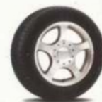
16" Bright Aluminum 40th Anniversary V6 Premium Wheel