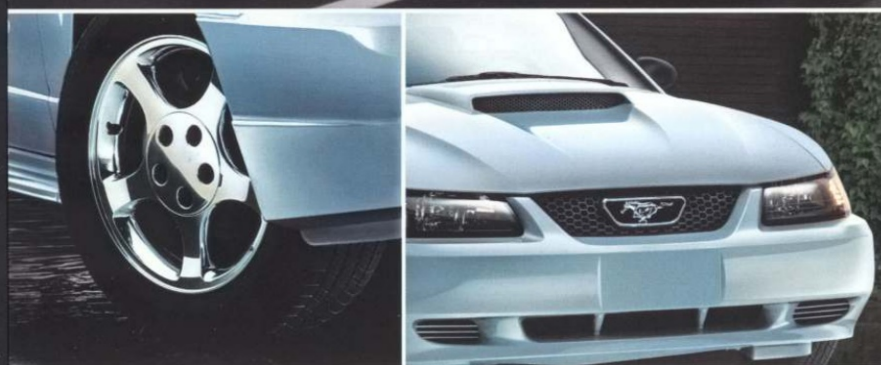
Mustang Mach 1

1 Once an icon, always an icon. The Mach 1 Mustang came back in 2003 in limited quantities as a Living Legend. A reinterpretation of its predecessor, even the 17" wheels were styled after the originals as were the one-of-a-kind "comfort weave" leather-trimmed seats shown here. 2 Underneath the functional shaker hood of a Mach 1 is a 4.6L DOHC 32-valve V8 engine that