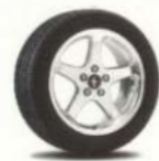
17" Bright Aluminum Wheel