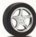
17" Painted Aluminum Wheel