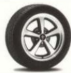
17" Heritage Aluminum Wheel