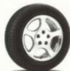
16" Polished Aluminum Wheel