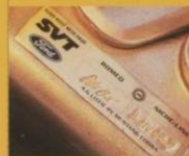
PERSONAL CRAFTSMANSHIP: Every hand-built SVT Cobra engine is inscribed with the names of its two-person assembly team.

SVT engineers also worked diligently on the Cobra's 2.25-inch stainless-steel exhaust system to produce a special sound that proclaims the engine's high flow rates and abundant power.