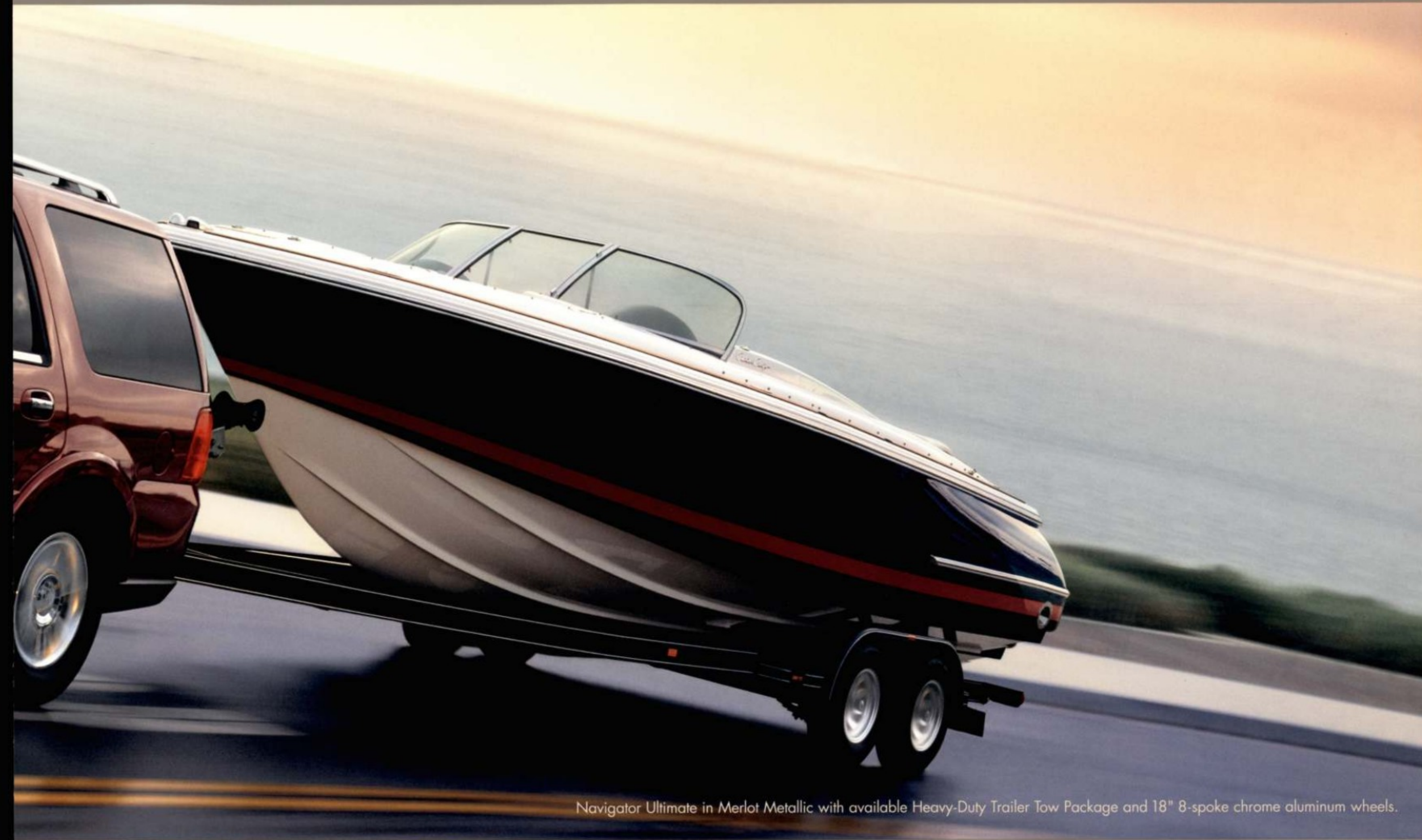
Navigator Ultimate in Merlot Metallic with available Heavy-Duty Trailer Tow Package and 18" 8-spoke chrome aluminum wheels.

STAY ON TRACK Navigator's AdvanceTrac® Electronic Stability Enhancement System** automatically provides more control in slick conditions. In certain understeer or oversteer situations, AdvanceTrac adjusts braking, traction control and engine output to correct vehicle direction to better follow steering input. The system's Roll Stability Control utilizes gyroscopic sensors to help the driver maintain control during an obstacle-avoidance maneuver and reduces the likelihood of a rollover event. Standard on Ultimate, available on Luxury.