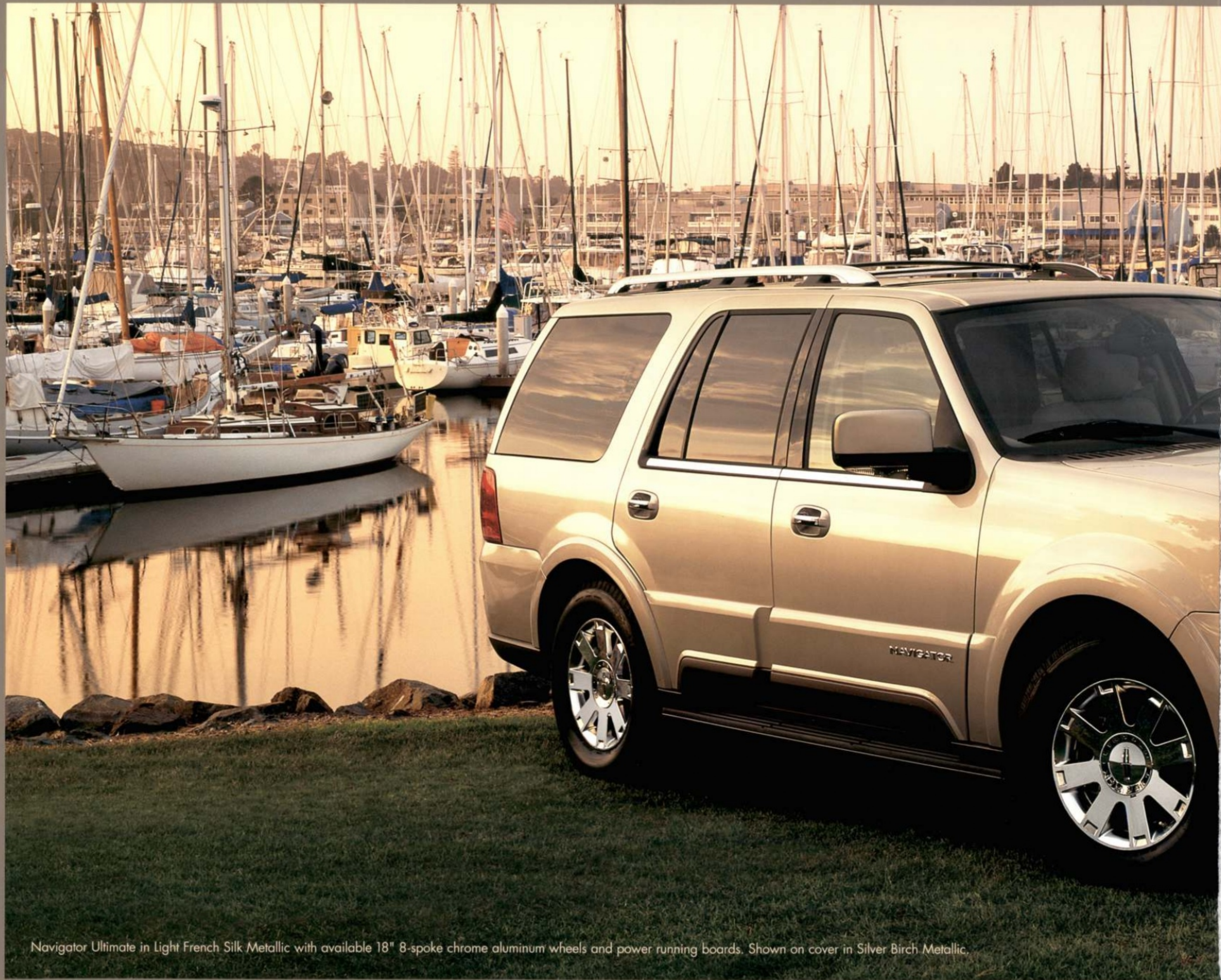
Navigator Ultimate in Light French Silk Metallic with available 18" 8-spoke chrome aluminum wheels and power running boards. Shown on cover in Silver Birch Metallic.