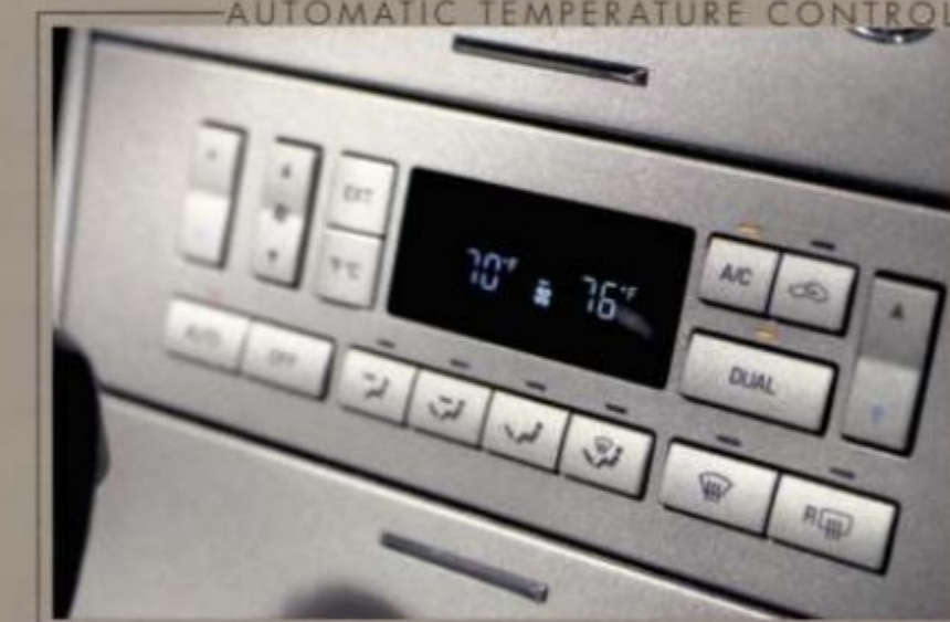
AUTOMATIC TEMPERATURE CONTROL

YOUR OWN ZONE Dual-zone Electronic Automatic Temperature Control lets driver and front passenger select different temperatures. The system automatically maintains the desired settings on either side of the front cabin.