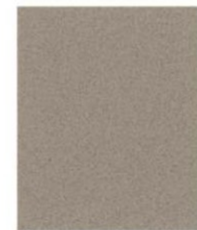
LIGHT FRENCH SILK METALLIC