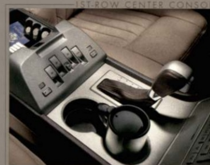
1ST-ROW CENTER CONSOLE

AS YOU CHOOSE Navigator's available 2nd-row 40/20/40 split-fold bench seat accommodates 3 passengers and provides multiple seating options. In addition, an adjustable center section moves forward 11" giving the driver and front passenger convenient access to a child.