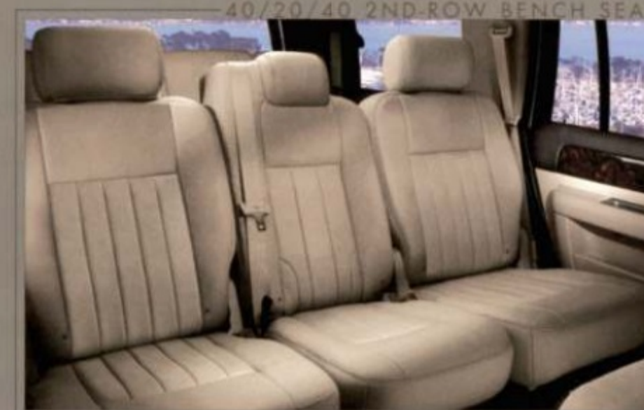
40/20/40 2ND-ROW BENCH SEAT

D O I T A L L . E N D L E S S V E R S A T I L I T Y F O R E V E R Y O N E .