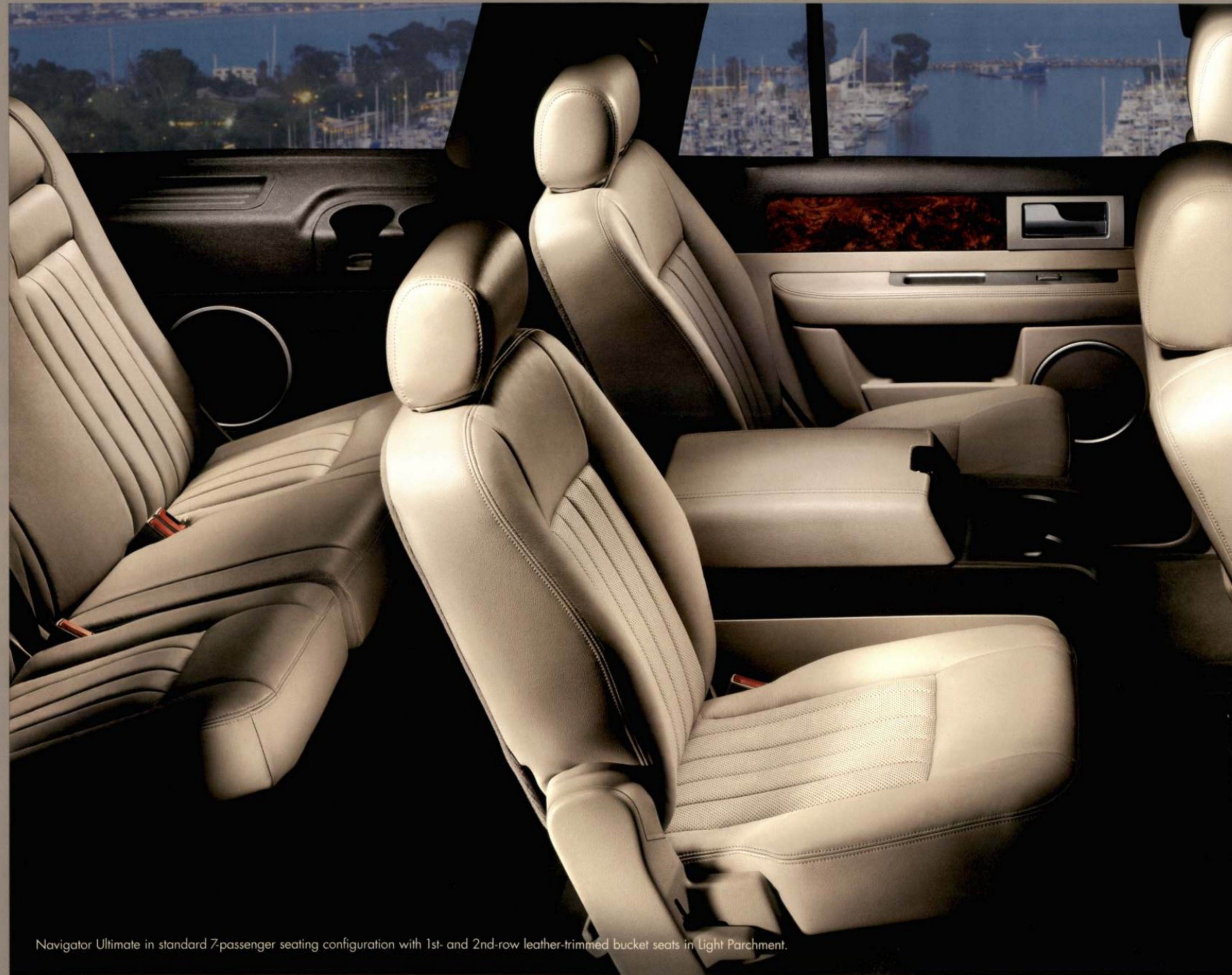
Navigator Ultimate in standard 7-passenger seating configuration with 1st- and 2nd-row leather-trimmed bucket seats in Light Parchment.