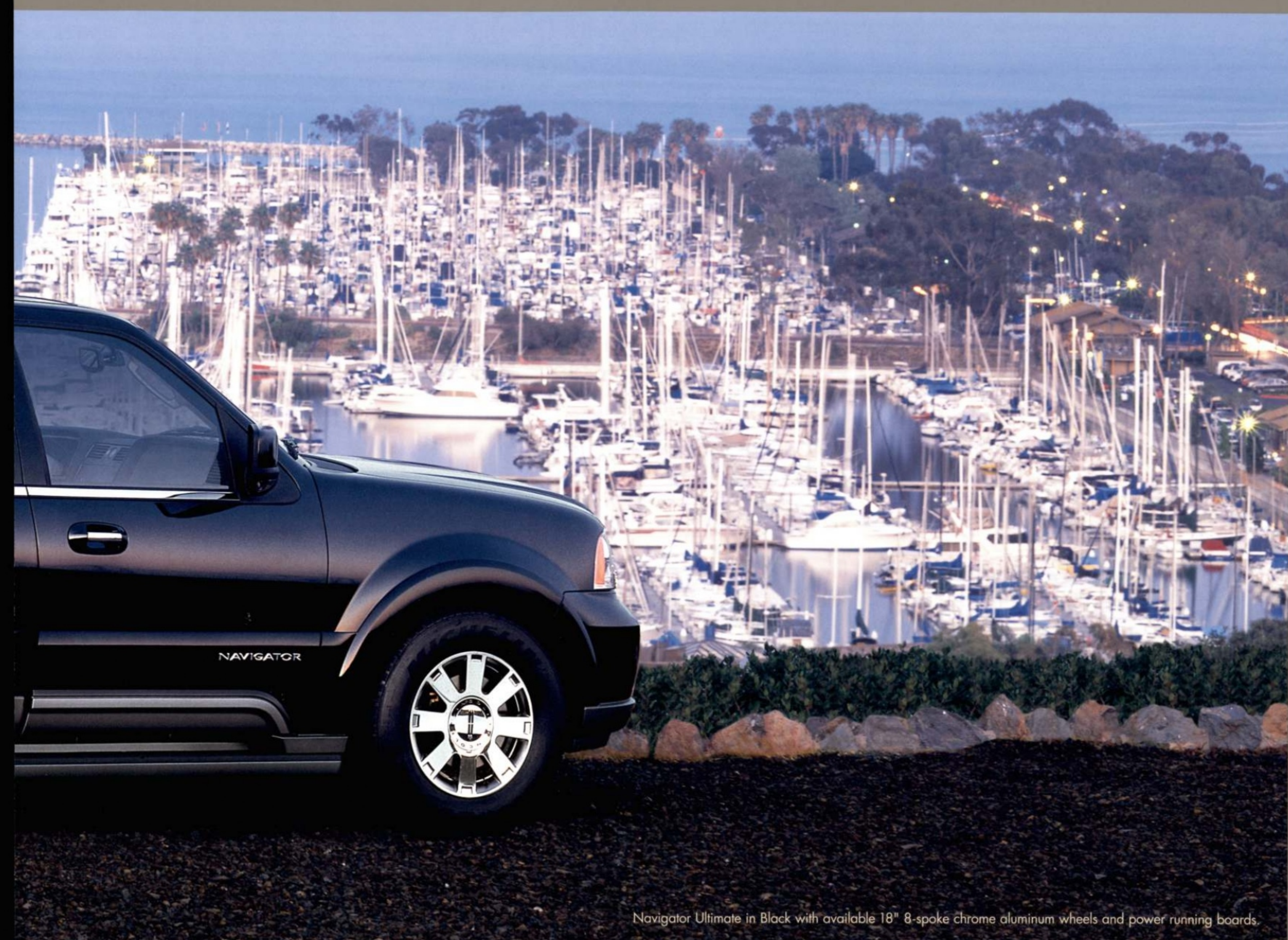
Navigator Ultimate in Black with available 18" 8-spoke chrome aluminum wheels and power running boards.