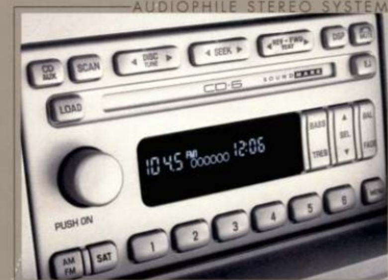
AUDIOPHILE STEREO SYSTEM

REVELATION IN SOUND The Audiophile AM/FM stereo system includes an integrated 6-disc in-dash CD player, high-power amplifier, 9 Audiophile speakers with sail-mounted tweeters and a subwoofer. The system is specifically tuned to Navigator's interior to ensure crystal-clear reproduction. Signals from radio stations equipped with Radio Data Systems (RDS) display the station's name on the receiver.