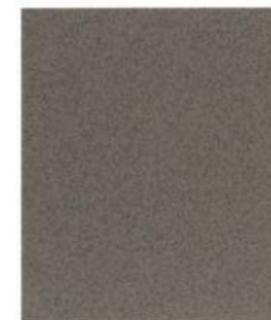
MINERAL GREY METALLIC