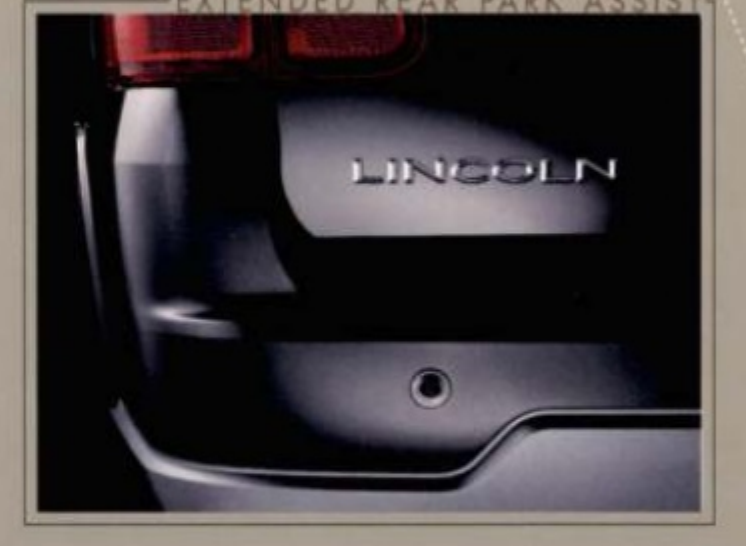
EXTENDED REAR PARK ASSIST

LOOKING OUT BEHIND Extended Rear Park Assist alerts you with a beeping tone if an object comes within 20 feet of the rear bumper when in Reverse.