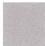
Silver Birch Metallic