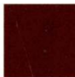
Dark Toreador Red Metallic