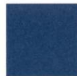
Norsea Blue Metallic