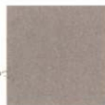
Arizona Beige Metallic