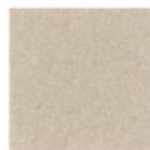
Gold Ash Metallic