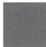
Spruce Green Metallic