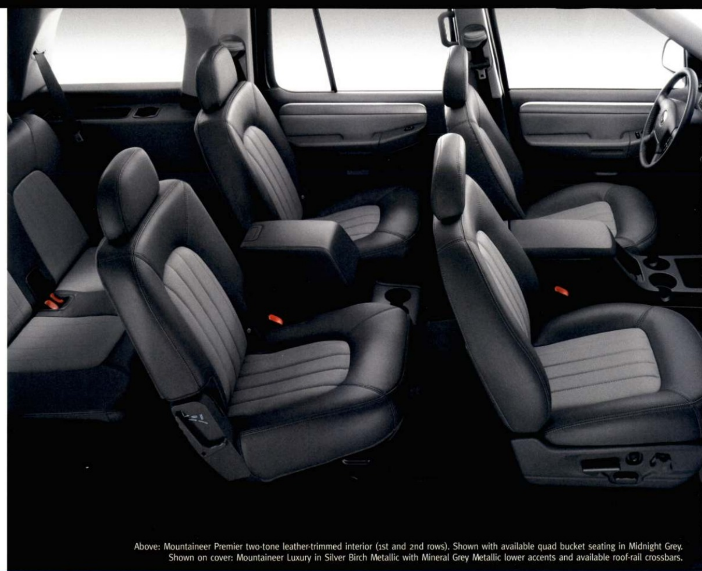
Above: Mountaineer Premier two-tone leather-trimmed interior (1st and 2nd rows). Shown with available quad bucket seating in Midnight Grey. Shown on cover: Mountaineer Luxury in Silver Birch Metallic with Mineral Grey Metallic lower accents and available roof-rail crossbars.

Meet Mercury Mountaineer for 2004. From the outside, its character is defined by distinctive attention to detail and the confidence provided by available All-Wheel Drive and the available AdvanceTrac® Electronic Stability Enhancement System. In certain understeer and oversteer situations, AdvanceTrac automatically adjusts braking, traction control and engine output to correct vehicle direction to better follow steering input.