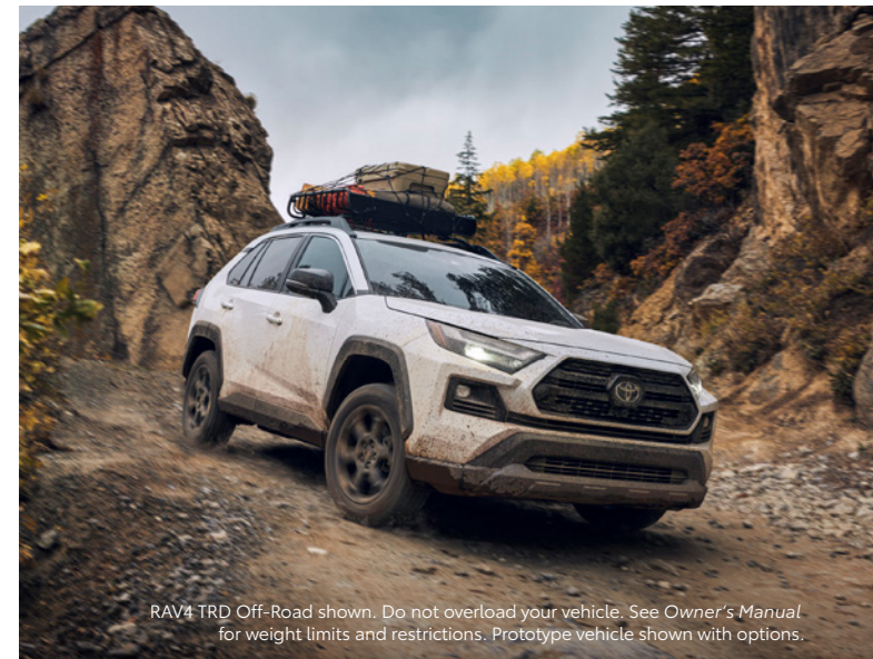
RAV4 TRD Off-Road shown. Do not overload your vehicle. See Owner's Manual for weight limits and restrictions. Prototype vehicle shown with options.