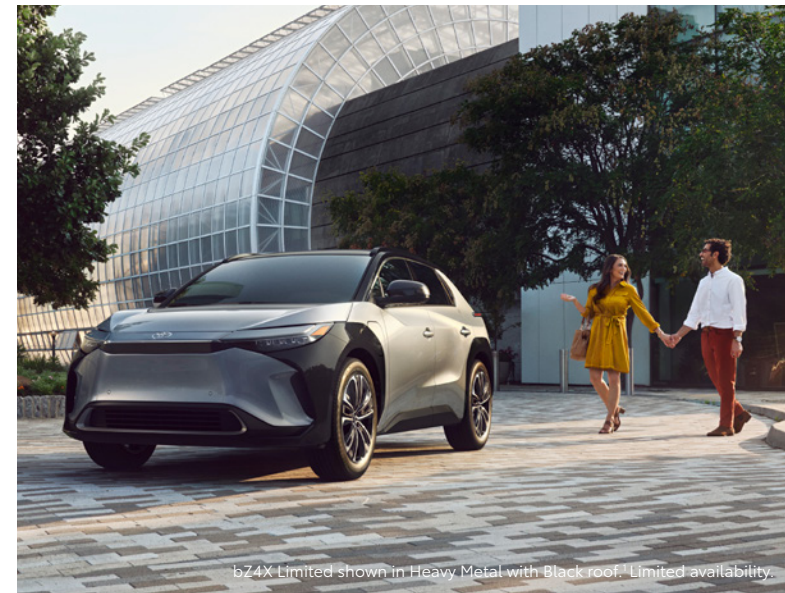
bZ4X Limited shown in Heavy Metal with Black roof. 1 Limited availability.