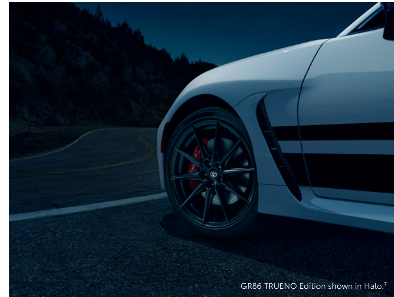
GR86 TRUENO Edition shown in Halo. 7