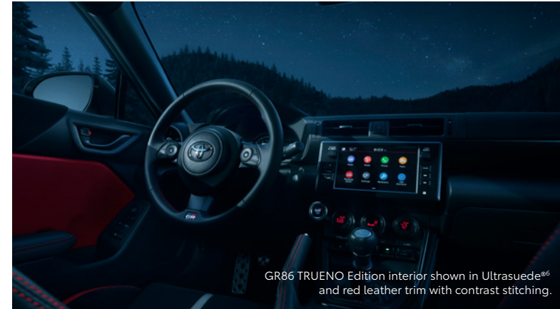
GR86 TRUENO Edition interior shown in Ultrasuede ®6 and red leather trim with contrast stitching.