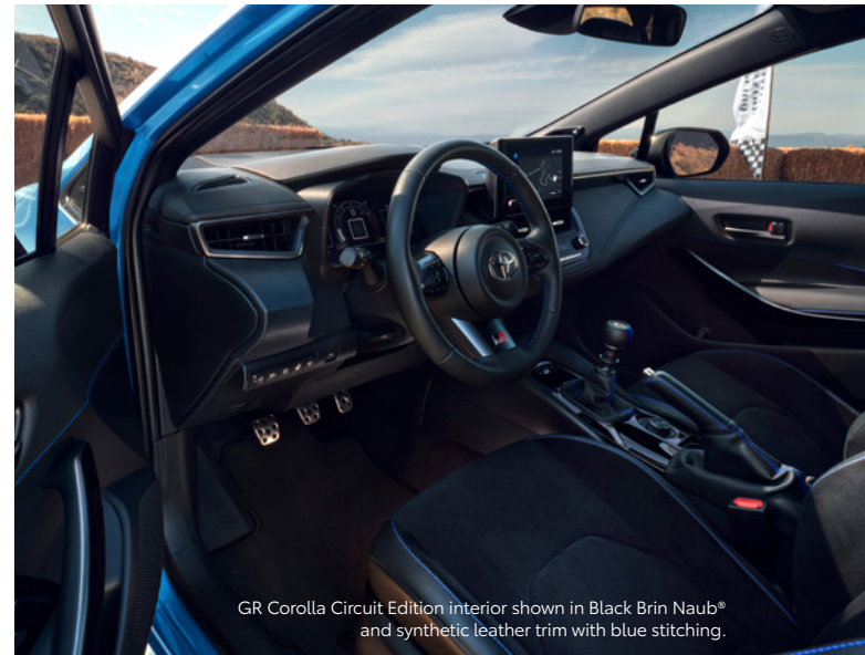
GR Corolla Circuit Edition interior shown in Black Brin Naub® and synthetic leather trim with blue stitching.