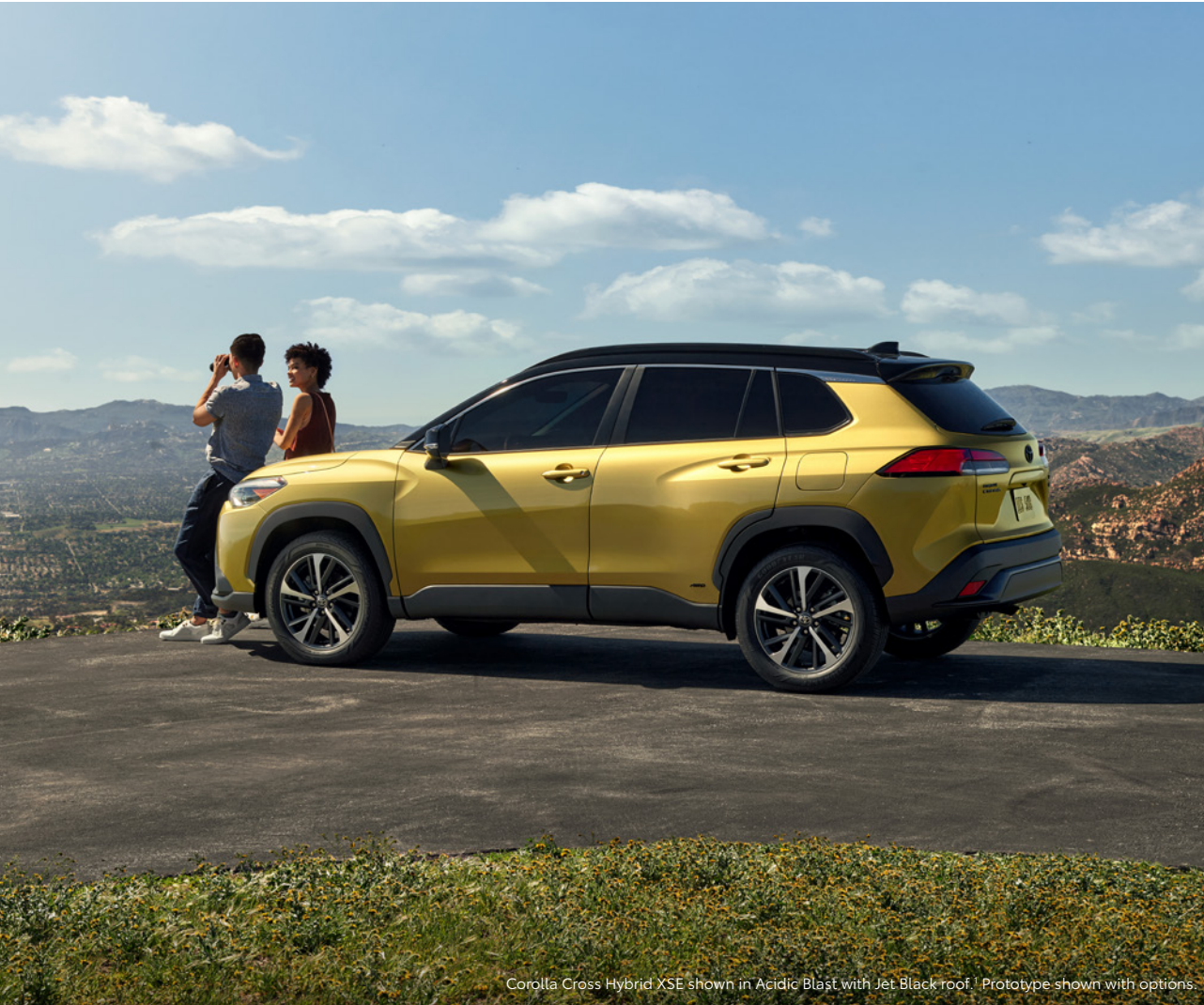
Corolla Cross Hybrid XSE shown in Acidic Blast with Jet Black roof. † Prototype shown with options.

Corolla Cross Hybrid is a versatile ride that's ready to take on your most spontaneous trips. Its slick exterior and sporty feel behind the wheel bring out the joy in every day, while its efficient performance encourages you to explore much more.