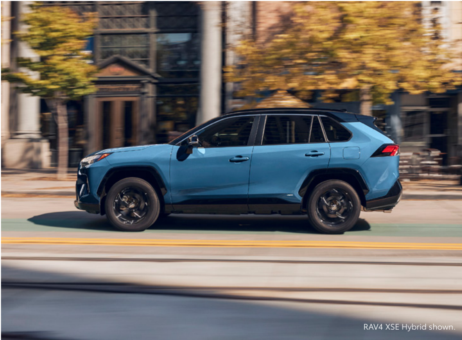
RAV4 XSE Hybrid shown.