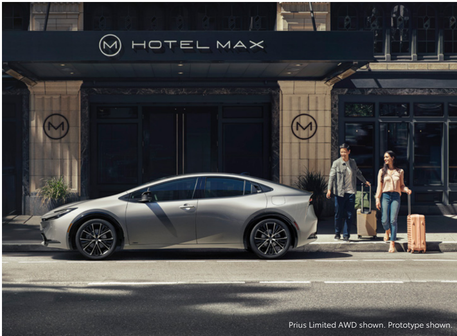
Prius Limited AWD shown. Prototype shown.