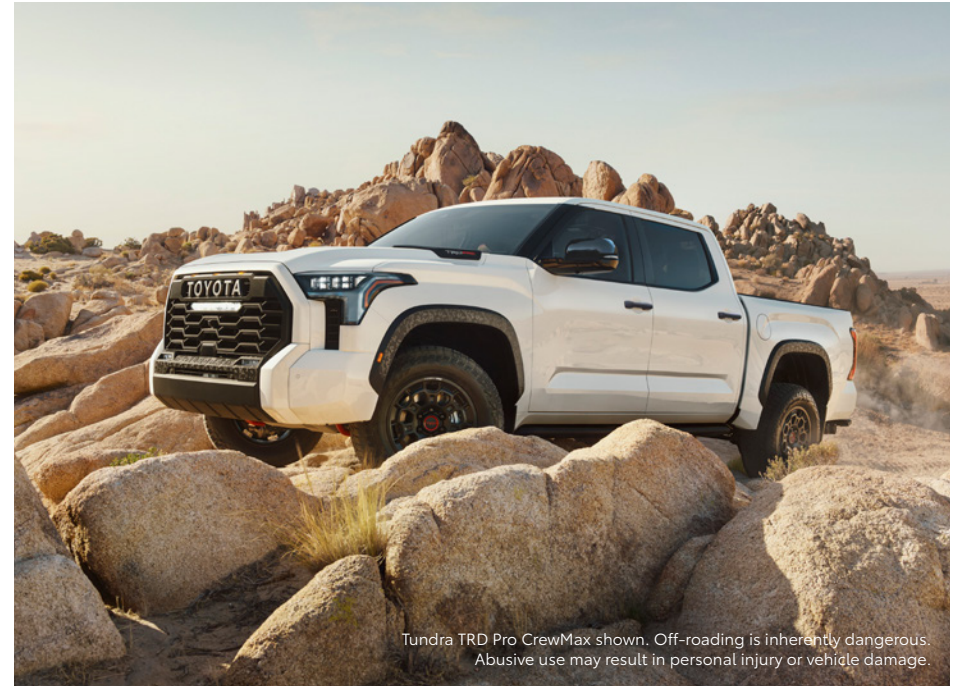
Tundra TRD Pro CrewMax shown. Off-roading is inherently dangerous. Abusive use may result in personal injury or vehicle damage.

Built to last and dominate trails, Tacoma and Tundra are legends through and through. Play harder than ever before with a truck capable of conquering the earth.