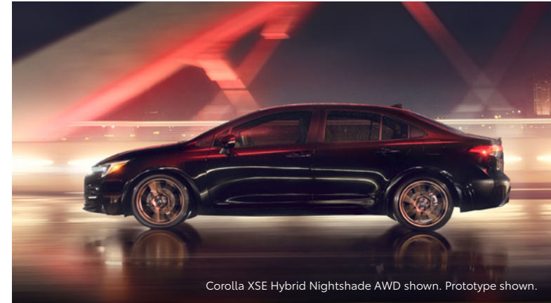
Corolla XSE Hybrid Nightshade AWD shown. Prototype shown.