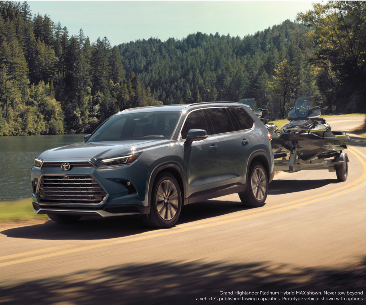
Grand Highlander Platinum Hybrid MAX shown. Never tow beyond a vehicle's published towing capacities. Prototype vehicle shown with options.

Get ready to conquer highways and country roads with electrified power. The performance-focused Grand Highlander Hybrid MAX has an EPA-estimated combined rating of up to 27 mpg, 4 so you can take your next spontaneous Saturday farther than ever.