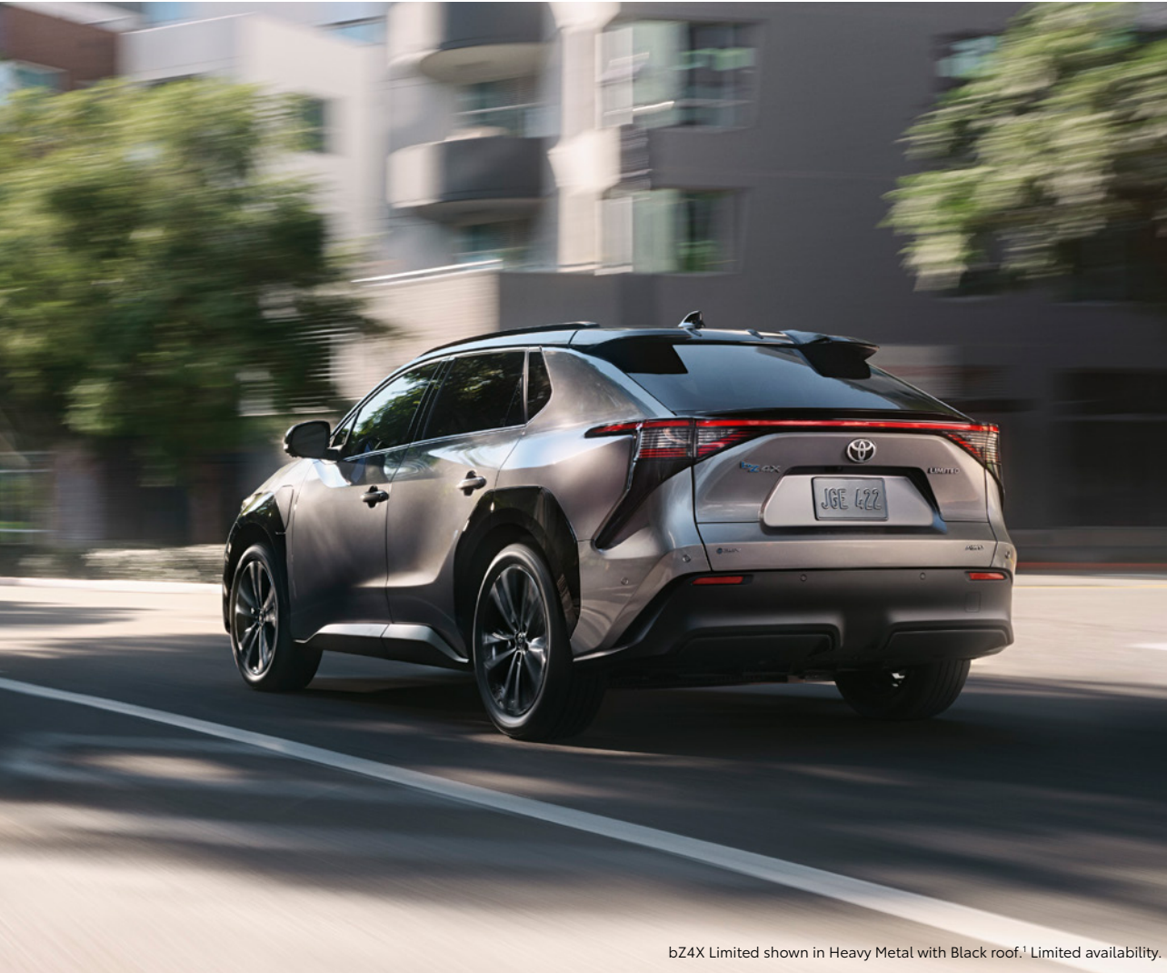
bZ4X Limited shown in Heavy Metal with Black roof. 1 Limited availability.

bZ4X is an all-electric way to jump-start your day. With its electrified powertrain that produces up to 214 hp with 248 lb.-ft. of max torque, and a battery made to last all day, you'll find yourself riding confidently for miles.