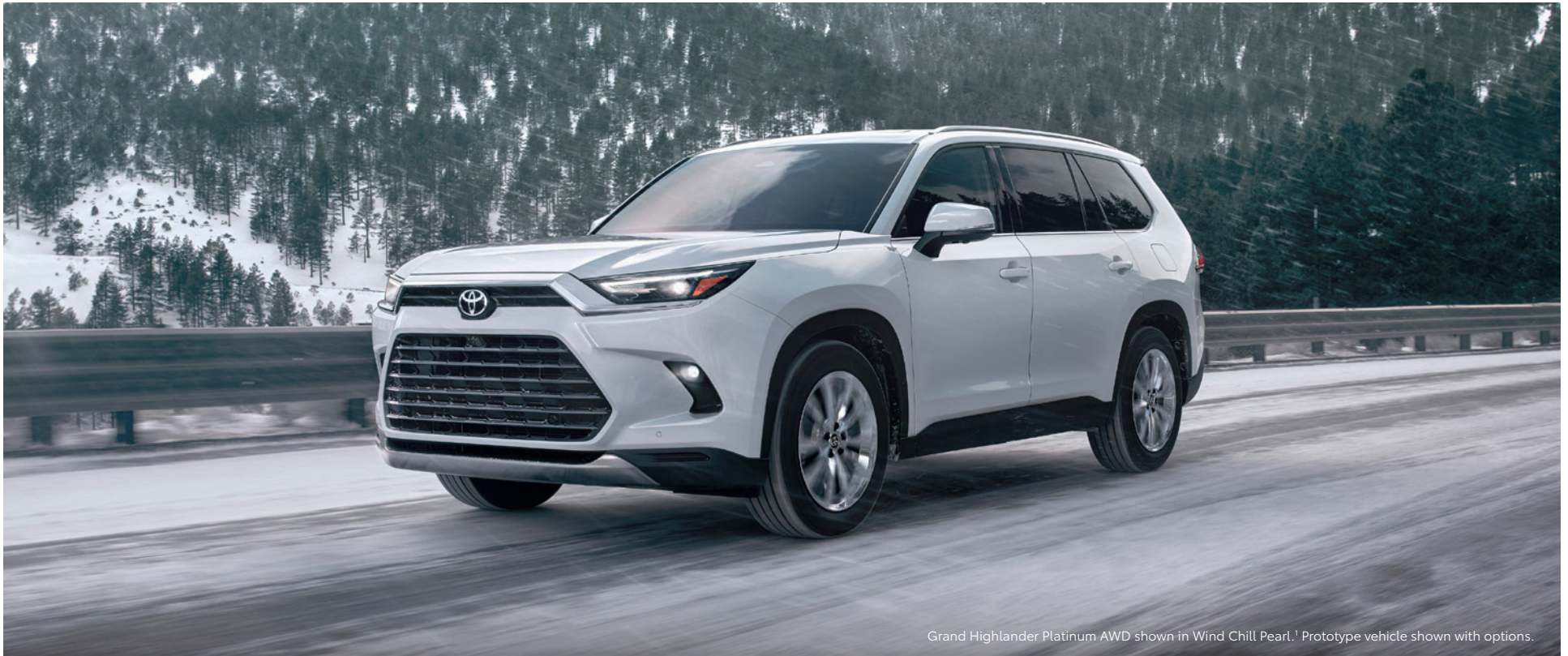
Grand Highlander Platinum AWD shown in Wind Chill Pearl. 1 Prototype vehicle shown with options.