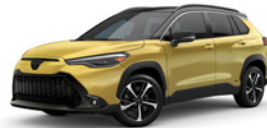
COROLLA CROSS HYBRID