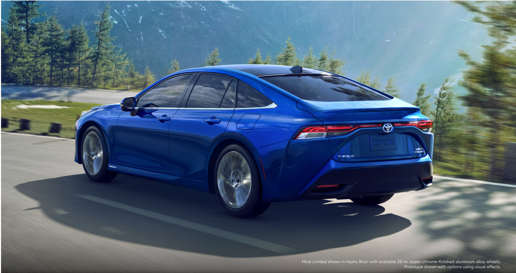
Mirai Limited shown in Hydro Blue 1 with available 20-in. super-chrome-finished aluminum alloy wheels. Prototype shown with options using visual effects.

Zero emissions and super efficient. Mirai's innovative Fuel Cell Stack creates power out of hydrogen and thin air — literally. Available in California.