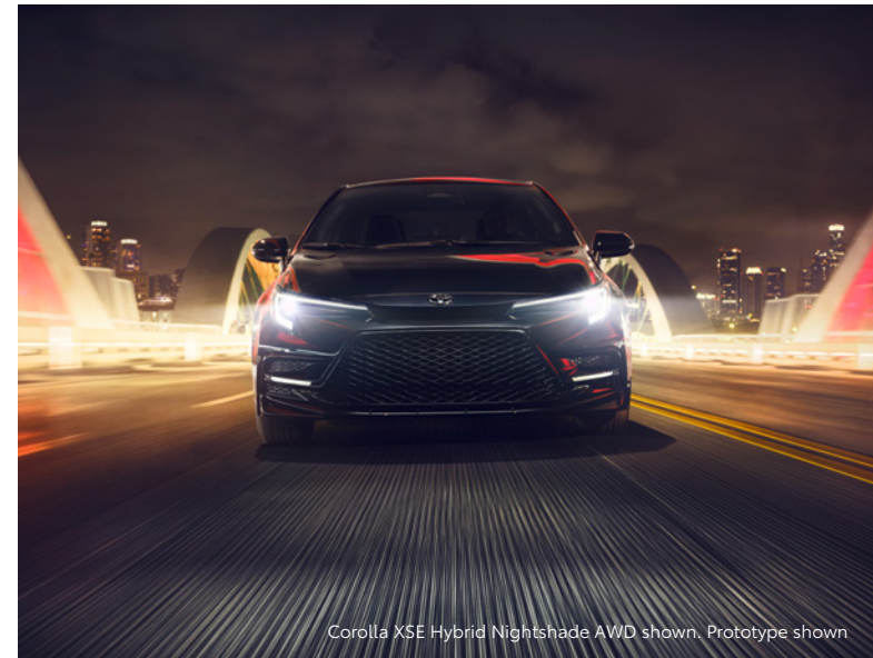
Corolla XSE Hybrid Nightshade AWD shown. Prototype shown.