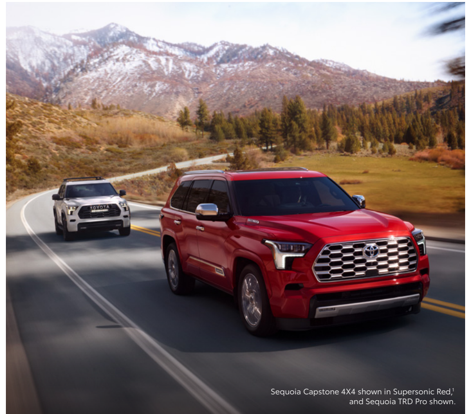
Sequoia Capstone 4X4 shown in Supersonic Red, 1 and Sequoia TRD Pro shown.