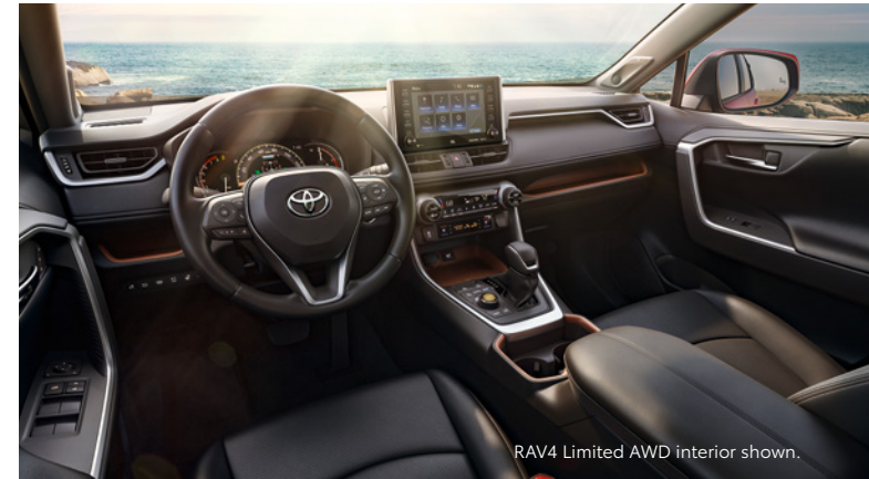
RAV4 Limited AWD interior shown.