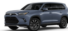
GRAND HIGHLANDER HYBRID MAX