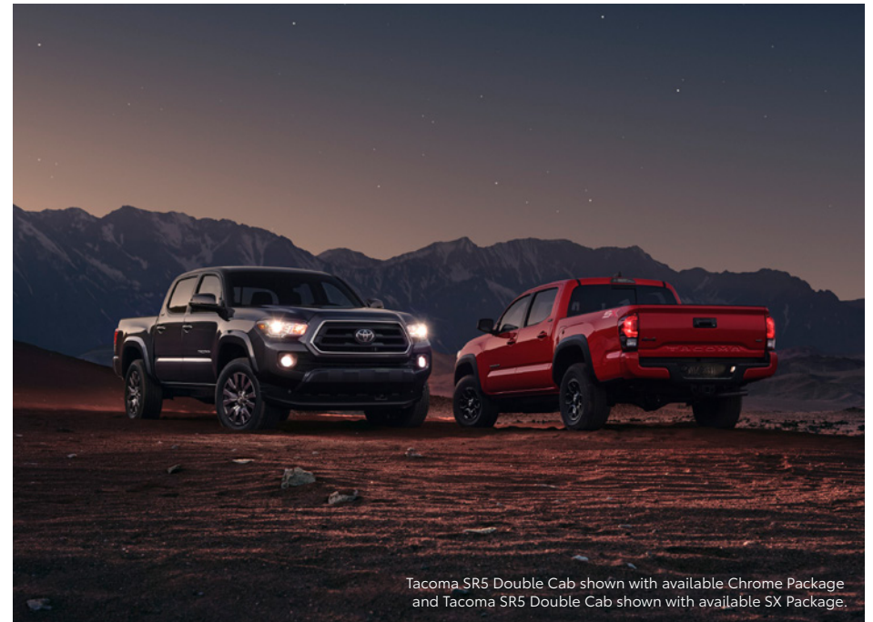
Tacoma SR5 Double Cab shown with available Chrome Package and Tacoma SR5 Double Cab shown with available SX Package.