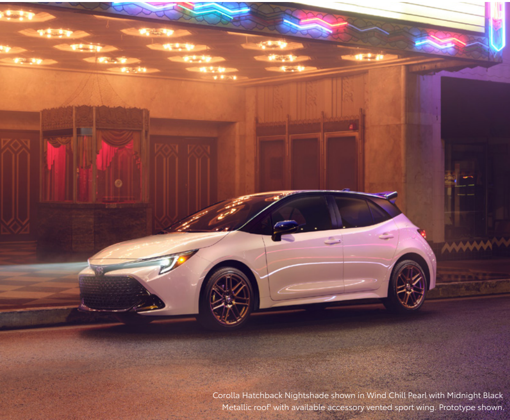
Corolla Hatchback Nightshade shown in Wind Chill Pearl with Midnight Black Metallic roof* with available accessory vented sport wing. Prototype shown.