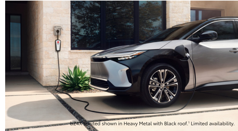
bZ4X Limited shown in Heavy Metal with Black roof. 1 Limited availability.