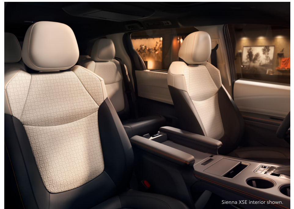
Sienna XSE interior shown.