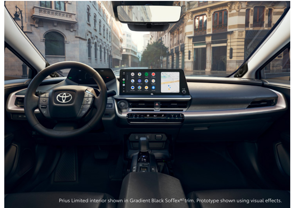
Prius Limited interior shown in Gradient Black SofTex ®2 trim. Prototype shown using visual effects.

Stunning design and an inspiring drive, with the advanced tech, fuel efficiency and reliability you've come to know and trust.