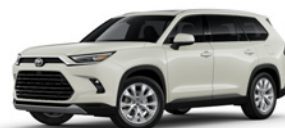
GRAND HIGHLANDER HYBRID