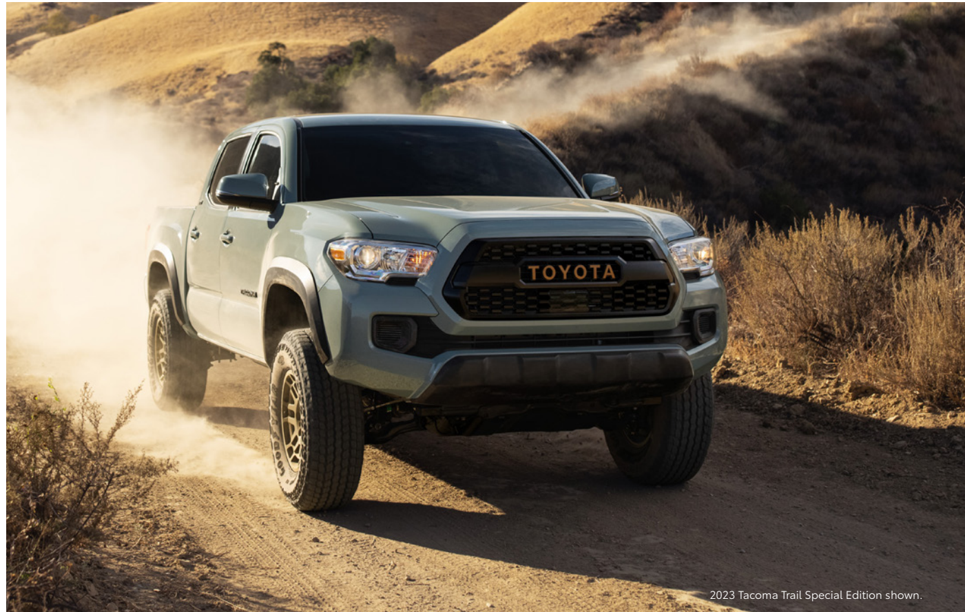
2023 Tacoma Trail Special Edition shown.