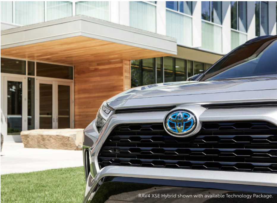
RAV4 XSE Hybrid shown with available Technology Package.