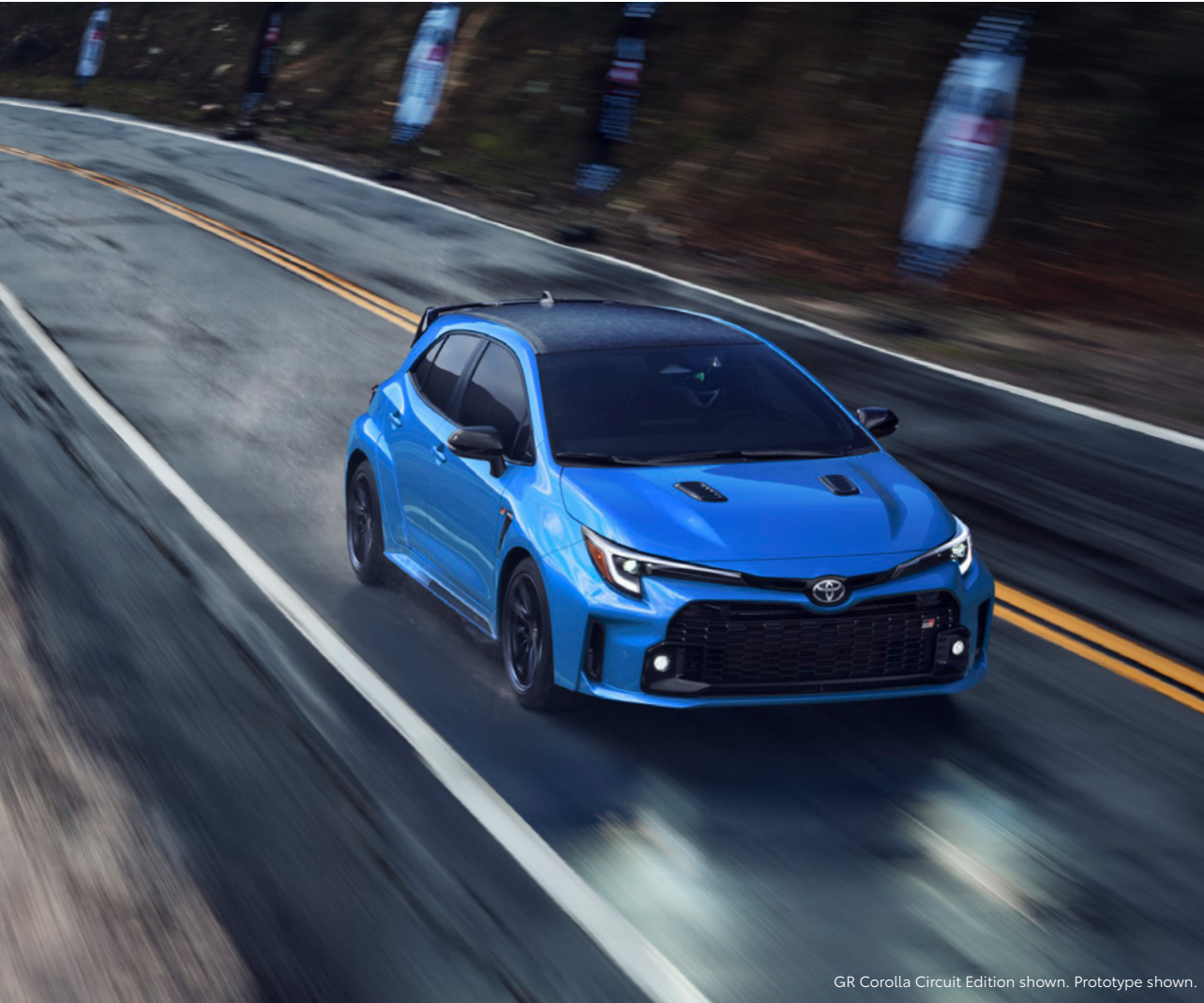
GR Corolla Circuit Edition shown. Prototype shown.