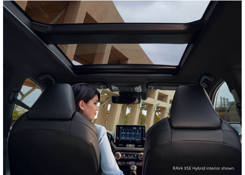
RAV4 XSE Hybrid interior shown.