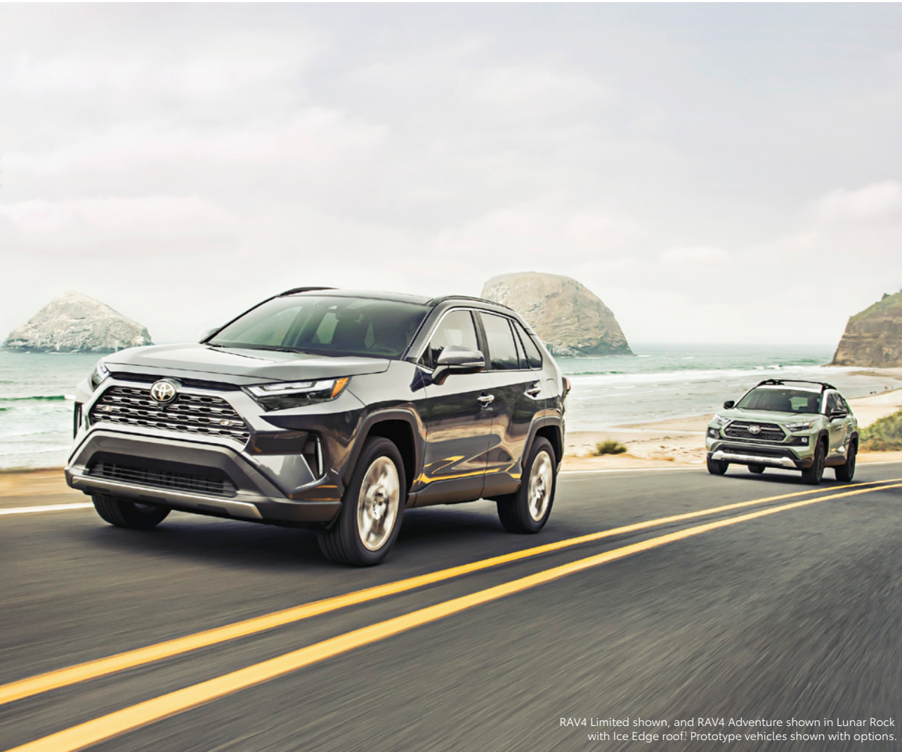
RAV4 Limited shown, and RAV4 Adventure shown in Lunar Rock with Ice Edge roof. 1 Prototype vehicles shown with options.