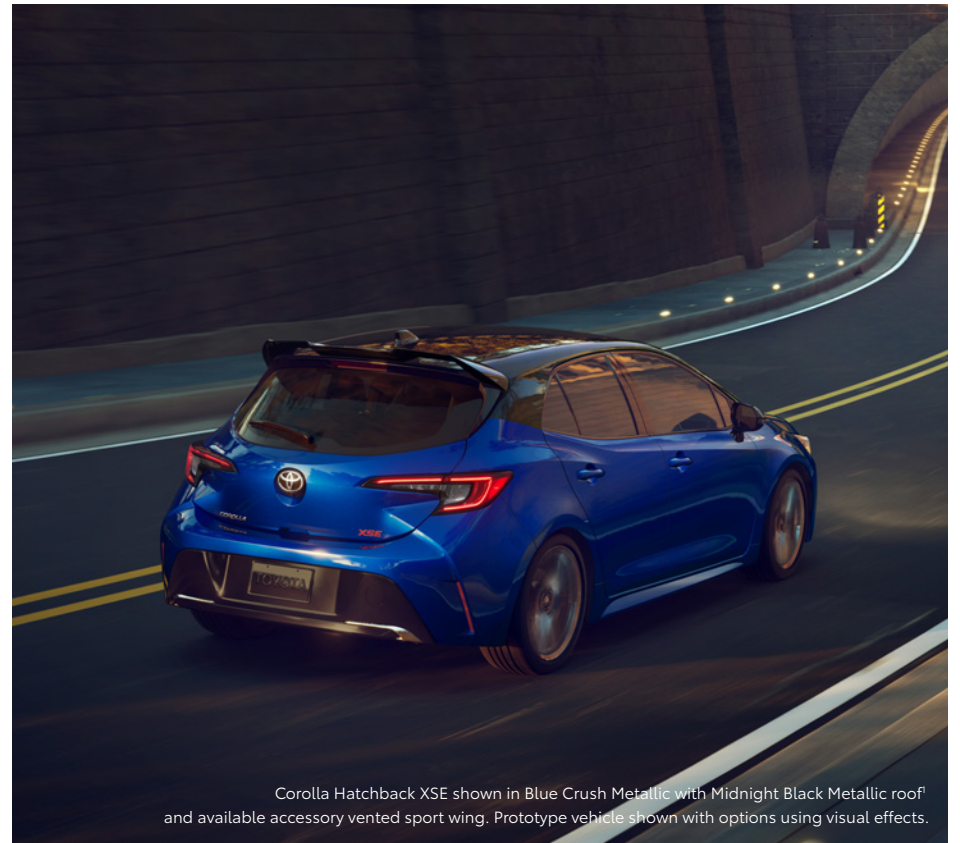
Corolla Hatchback XSE shown in Blue Crush Metallic with Midnight Black Metallic roof* and available accessory vented sport wing. Prototype vehicle shown with options using visual effects.