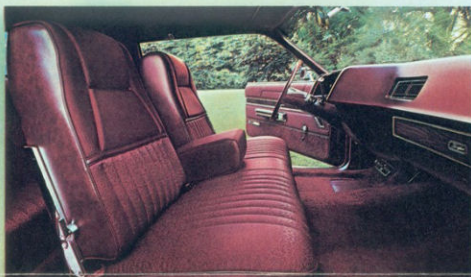
LTD Brougham interior • High Back Flight Bench Seat with folding armrest.

In luxury, few cars offer more than LTD, best-seller in its class. Elegant interior (right). Deep-cushioned comfort of LTD Brougham's High Back Flight Bench Seat. The spaciousness of Ford's Front