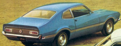
Sporty economy Maverick Grabber.