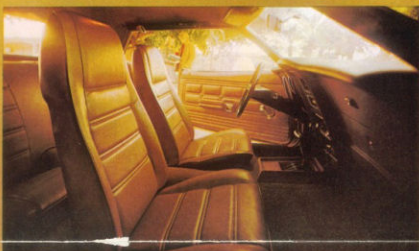
High Back Buckets, all-vinyl trim, full carpeting . . . all standard Mustang features.

Consider the sporty, luxurious Grandé. Rich vinyl roof and body accent striping hint at the elegant upholstery and trim details you'll find inside. If you're a nature-lover, select the sporty, sun-loving Convertible. Or choose the