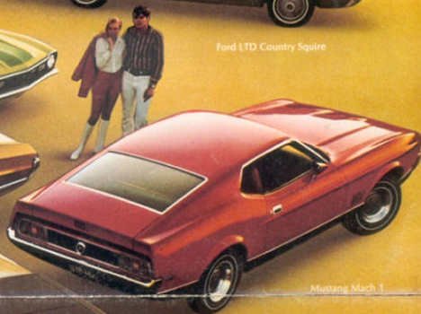
Mustang Mach 1