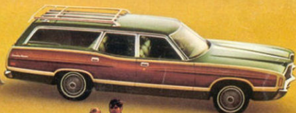
Ford LTD Country Squire