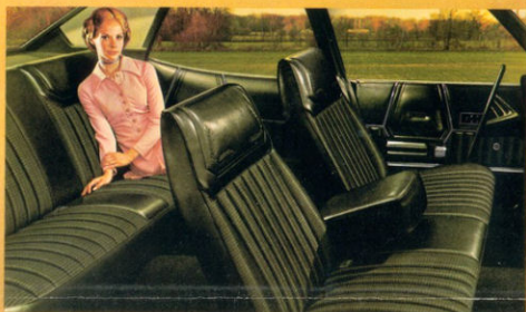
Brougham Interior Trim Group. Roomy Flight Bench front seat has pull-down armrest.

There are three all-new wagons led by Gran Torino Squire—with woodgrain paneling, 3-Way Magic Door-gate, power front disc brakes,