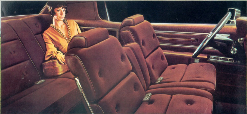
Split Bench Seat with individual front folding armrests, luxurious fabrics offered in five color choices.