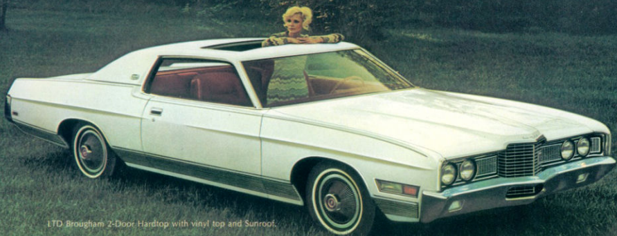
LTD Brougham 2-Door Hardtop with vinyl top and Sunroof.