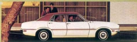
Luxury Decor Option exterior with vinyl roof-plus, adds flair.