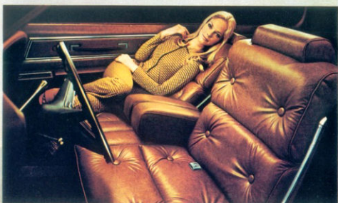
Split Bench Seat with leather and vinyl trim, Reclining Passenger Seat.

Options shown: (top) vinyl roof with Landau "S" bars, Split Bench Seat, Glamour Paint Group (Gold Fire), bodyside and rocker panel moldings, front cornering lights, white sidewalls; (center) Split Bench Seat in leather and vinyl, reclining passenger seat; (bottom) Split Bench Seat in Lamont Cloth, deluxe seat belts, driver's control console, left-hand remote control mirror, Fingertip Speed Control.