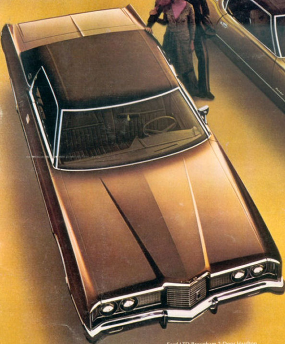
Ford LTD Brougham 2-Door Hardtop

FORD FORD TORINO FORD MUSTANG FORD MAVERICK FORD PINTO THUNDERBIRD