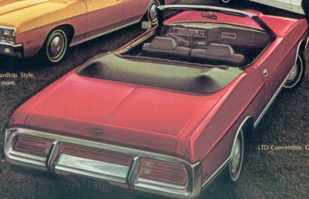
LTD Convertible. Great favorite with sun-lovers.