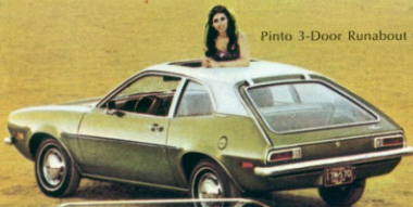
Pinto 3-Door Runabout with Luxury Decor Group, Vinyl Top and Sunroof.

Options illustrated: Luxury Decor Group, vinyl top, dual racing mirrors, bumper guards (top), white sidewall tires (all Pintos shown). (Center) Sports Accent Group interior, SelectShift, radio. Runabout with Sports Accent Group, dual racing mirrors, Wide Oval Raised White Leather tires. (Bottom) Runabout with Luxury Decor Group, vinyl top, Sunroof. Wagon (right) with Accent Group, bumper guards. Wagon (foreground) with Squire option, luggage rack, bodyside protection molding.