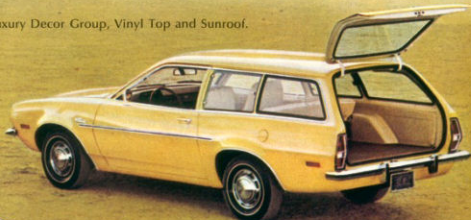
Pinto Wagon equipped with Accent Group and Bumper Guards. Loadspace, with rear seat folded down, is 60.5 cubic feet big.