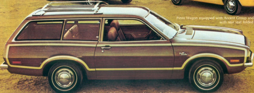
Pinto Wagon with Squire Option and Luggage Rack. Wagon utility with extra luxury throughout.