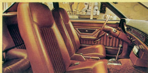
Relax in handsome luxury. Sports Accent interior of "super-soft" vinyl with cut-pile carpeting provides a distinctive sporty Pinto flair.