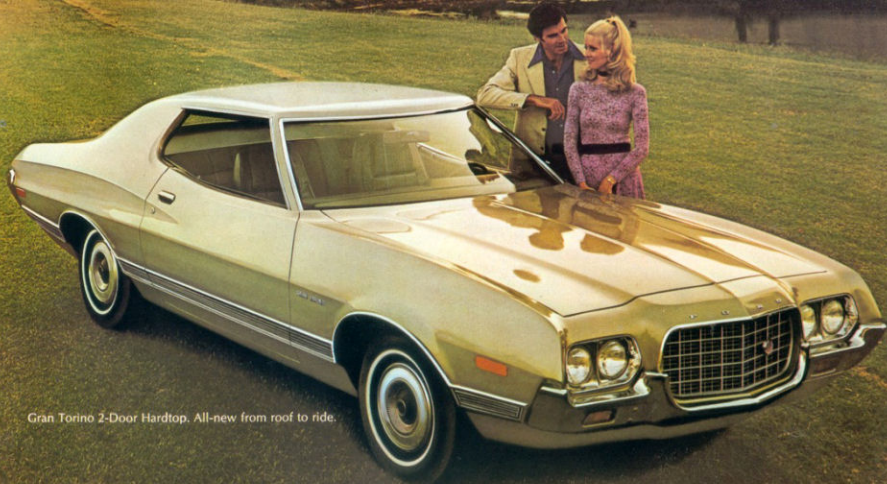
Gran Torino 2-Door Hardtop. All-new from roof to ride.