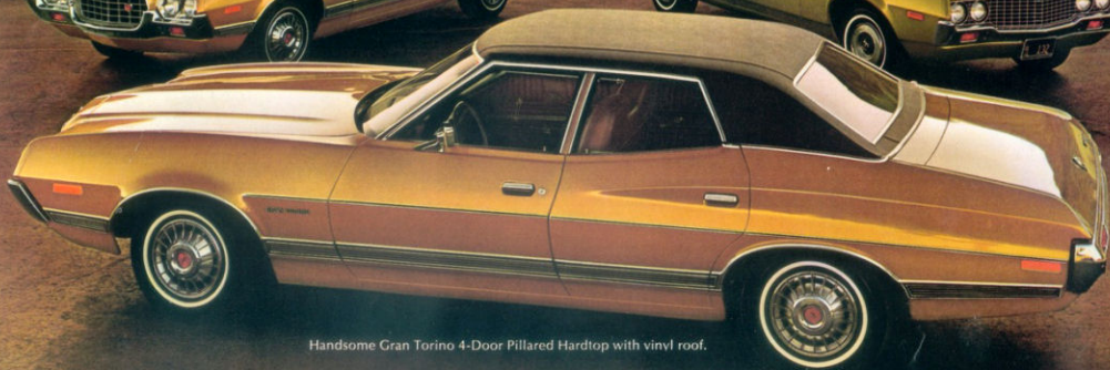
Handsome Gran Torino 4-Door Pillared Hardtop with vinyl roof.