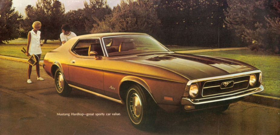
Mustang Hardtop—great sporty car value.