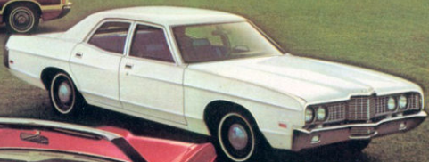
Custom 500 4-Door Sedan... quiet plus value.