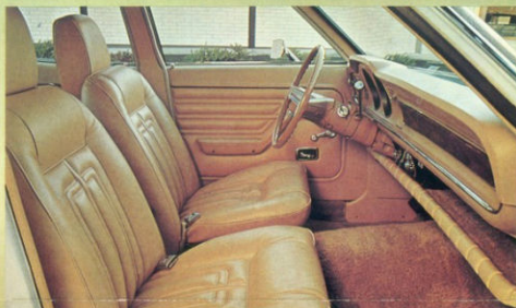
Plush interior (Luxury Decor Option) has reclining bucket seats.

Options illustrated: White sidewall tires, 2-Door Sedan—Accent Group. 4-Door Sedan—vinyl roof, Accent and Protection Groups.