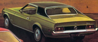
Mustang Grandé mixes driving fun with luxury.