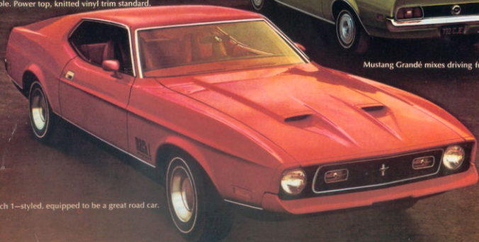
Mustang Mach 1—styled, equipped to be a great road car.