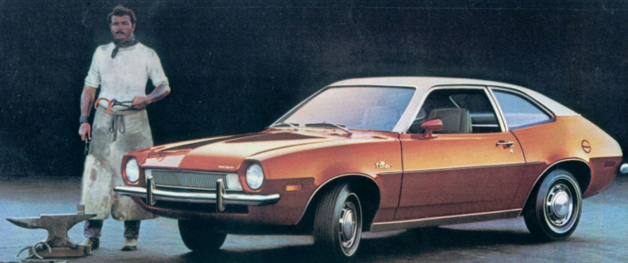
Basic Pinto 2-Door Sedan with Vinyl Top, Luxury Decor Group and Bumper Guards.