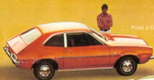
Pinto 2-Door Sedan