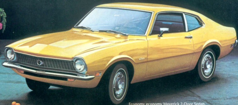
Economy economy Maverick 2-Door Sedan.