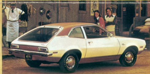
3-Door Runabout shown with Sports Accent Group. Available with or without Vinyl Top. Wide Oval Tires, Color-Keyed Dual Racing Mirrors also featured.

The Model T . . . the Model A . . . the first mass-produced station wagon. Name a basic idea, and chances are Ford built it. Apply this heritage of solid, sensible transportation to '72 and you've got Pinto . . . back to basics.