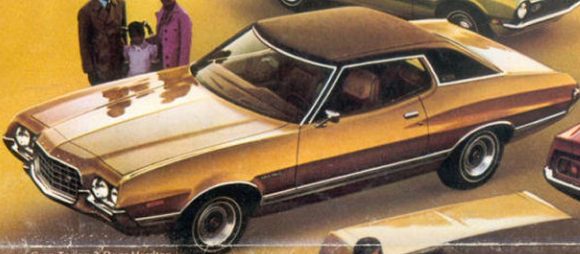
Gran Torino 2-Door Hardtop