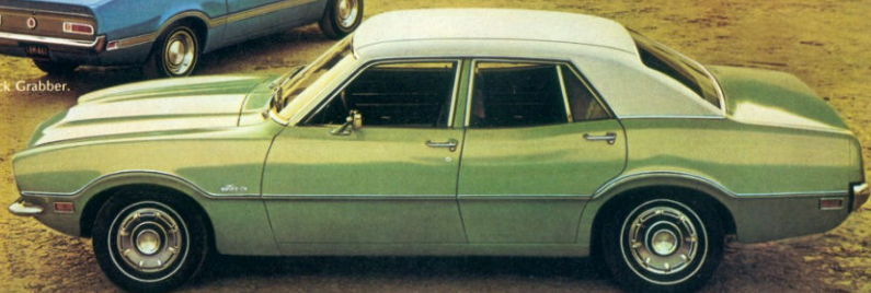
Family economy Maverick 4-Door Sedan.