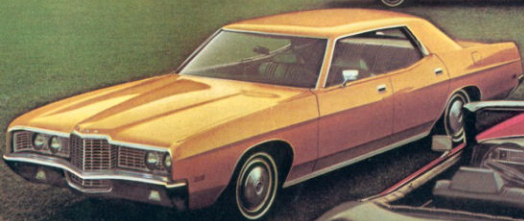
Galaxie 500 4-Door Hardtop. Style, room, quiet ride, and more.