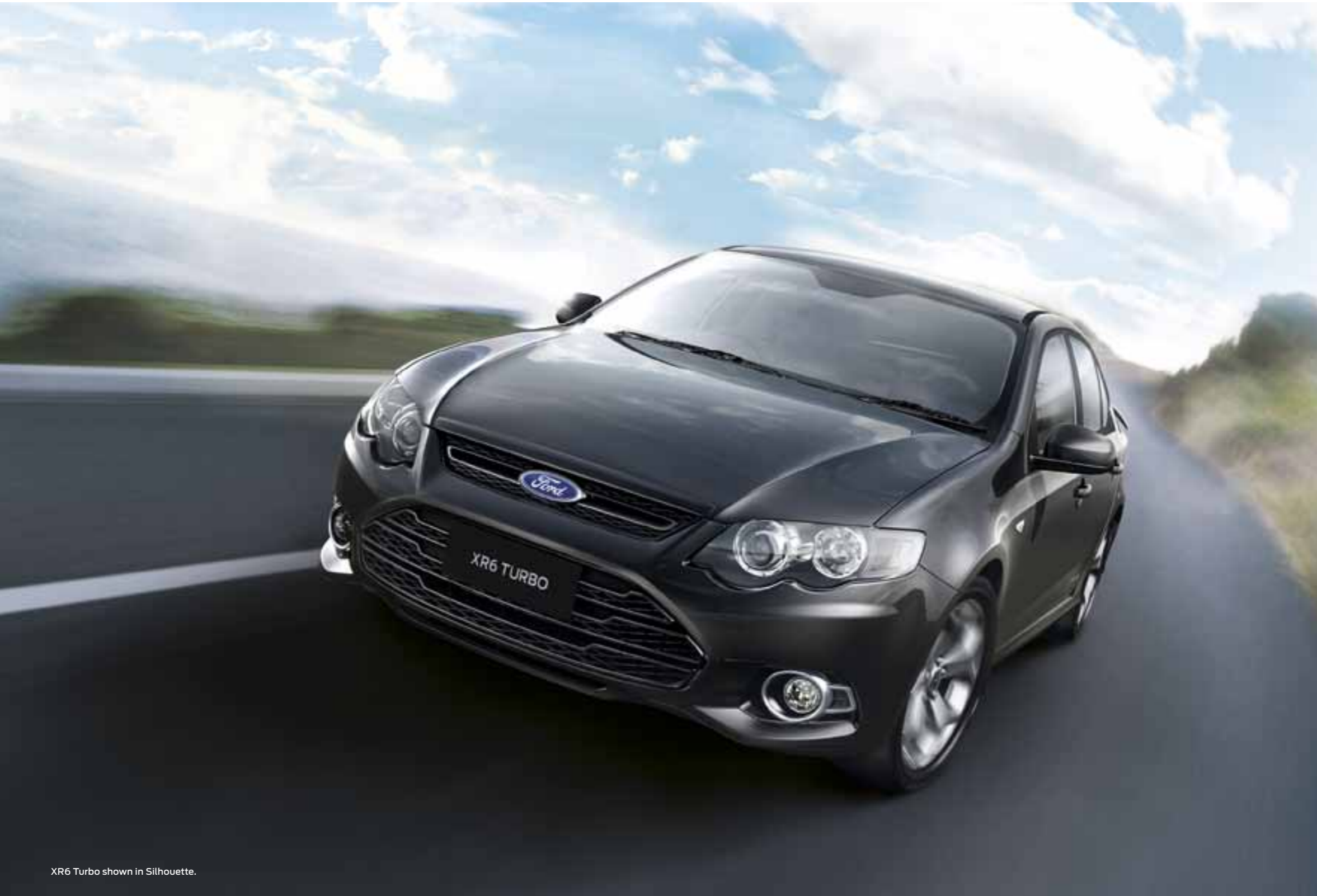
XR6 Turbo shown in Silhouette.

Enjoy a superior driving experience with advanced new engine technologies and the latest in high performance engineering and tuning.