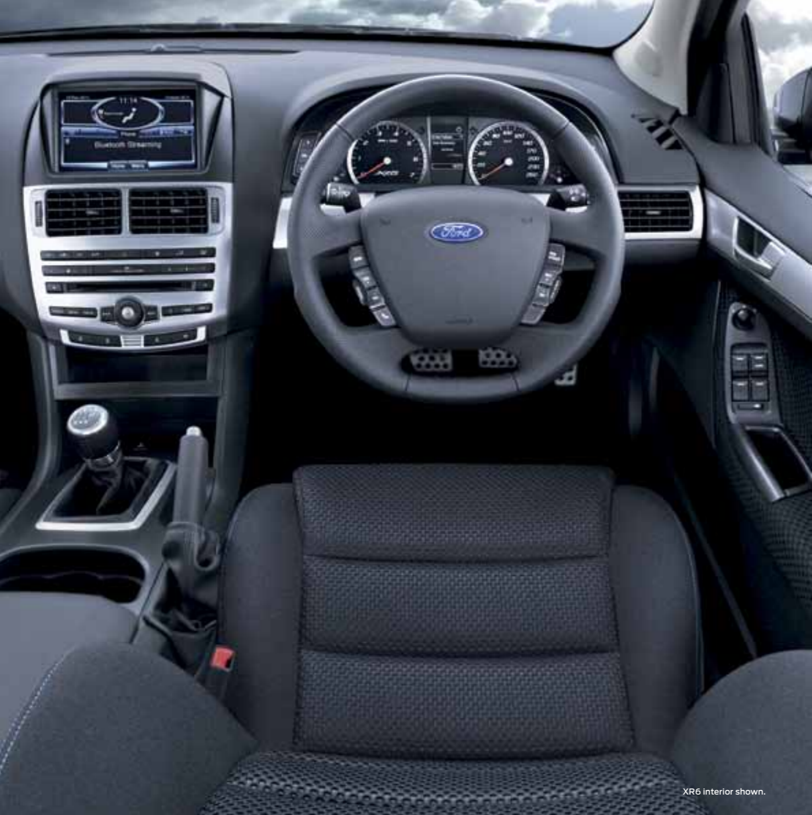
XR6 interior shown.