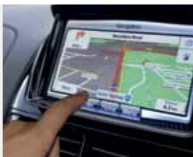
G6E Turbo interior shown.

With keyword search, Traffic Message Channel (TMC)§ and easy-to-read colour maps, you can get where you need to be quickly and efficiently.