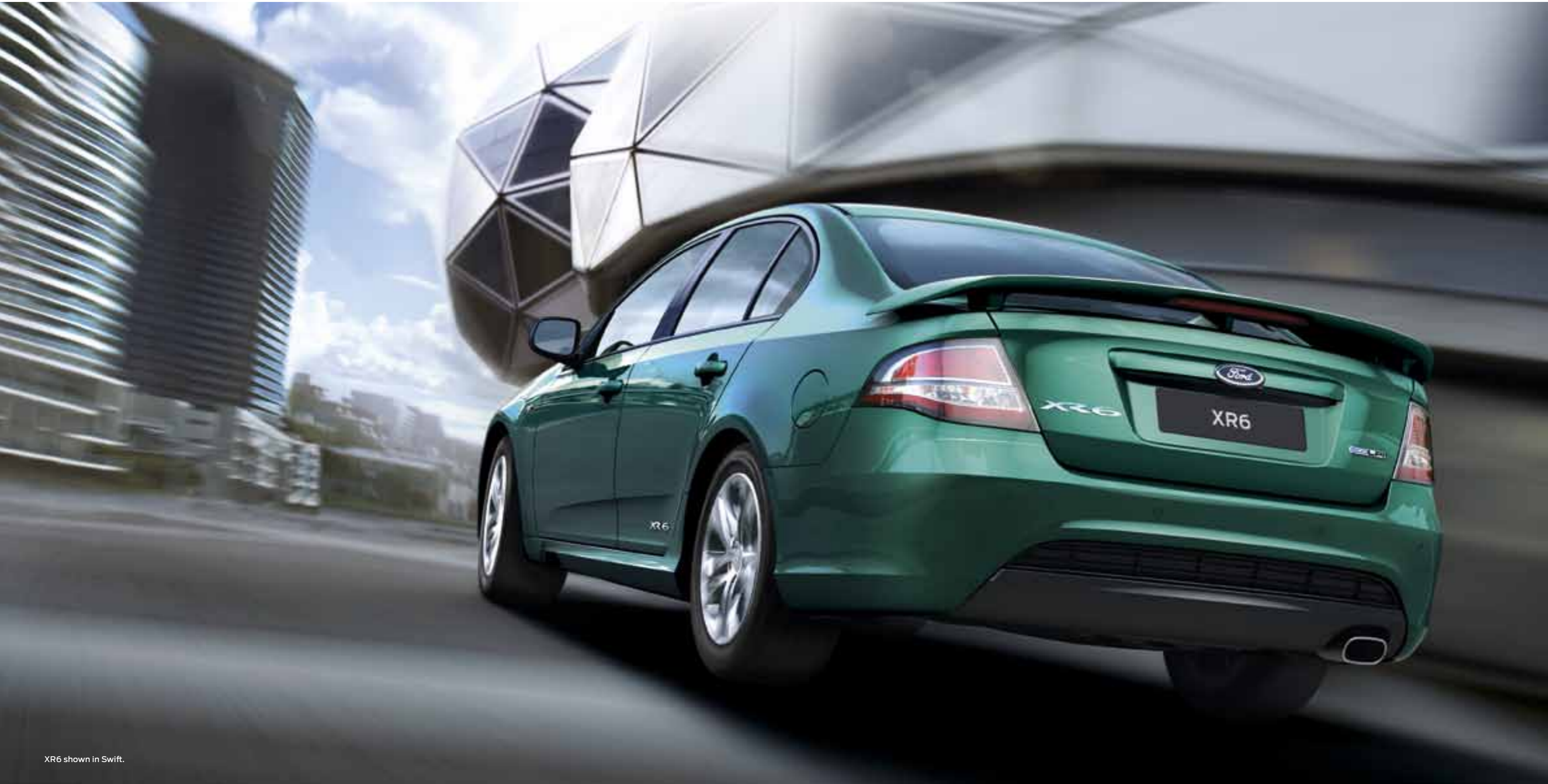
XR6 shown in Swift.

Enjoy outstanding power and torque and reduced carbon emissions while taking advantage of lower fuel costs.