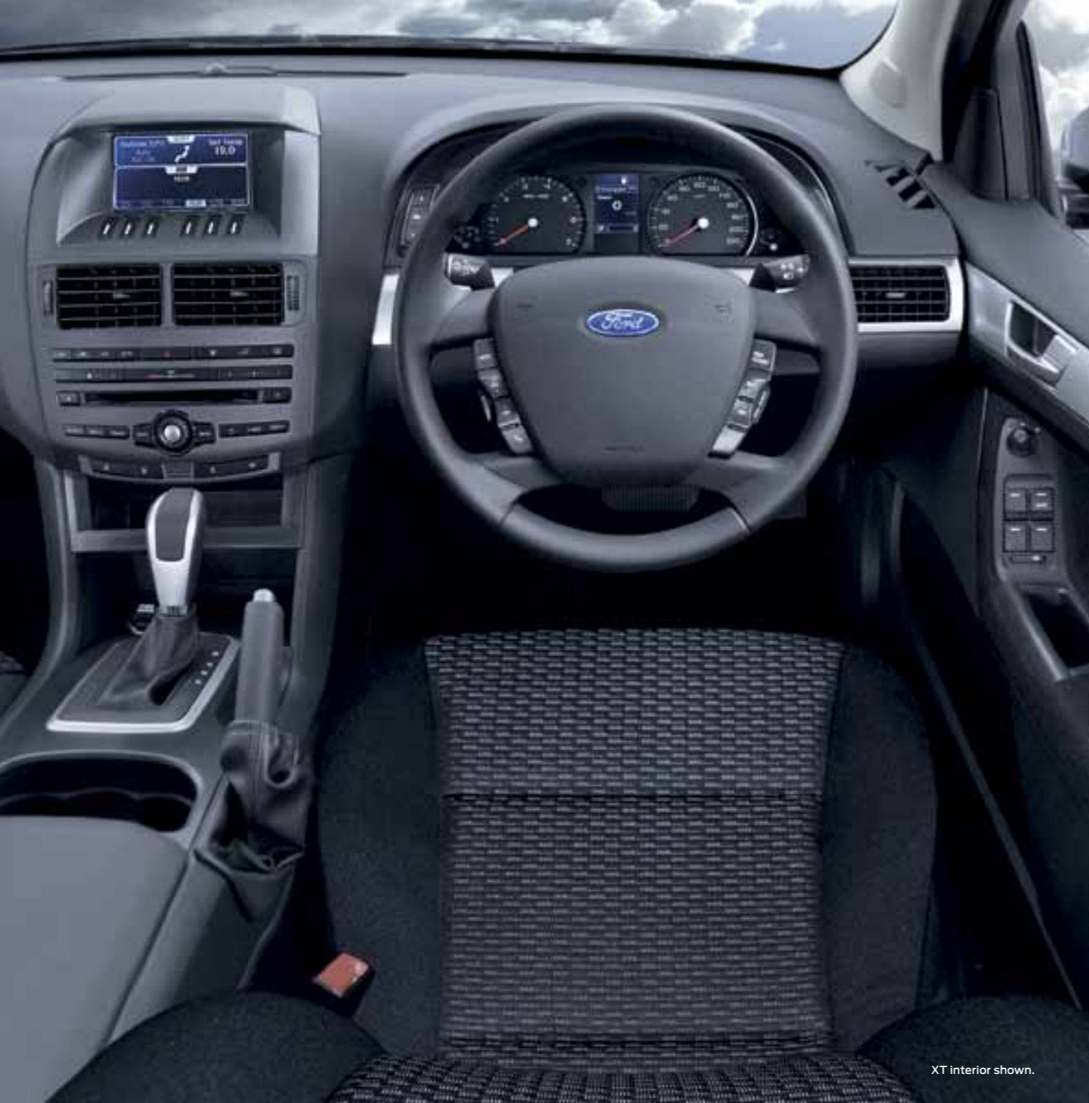
XT interior shown.