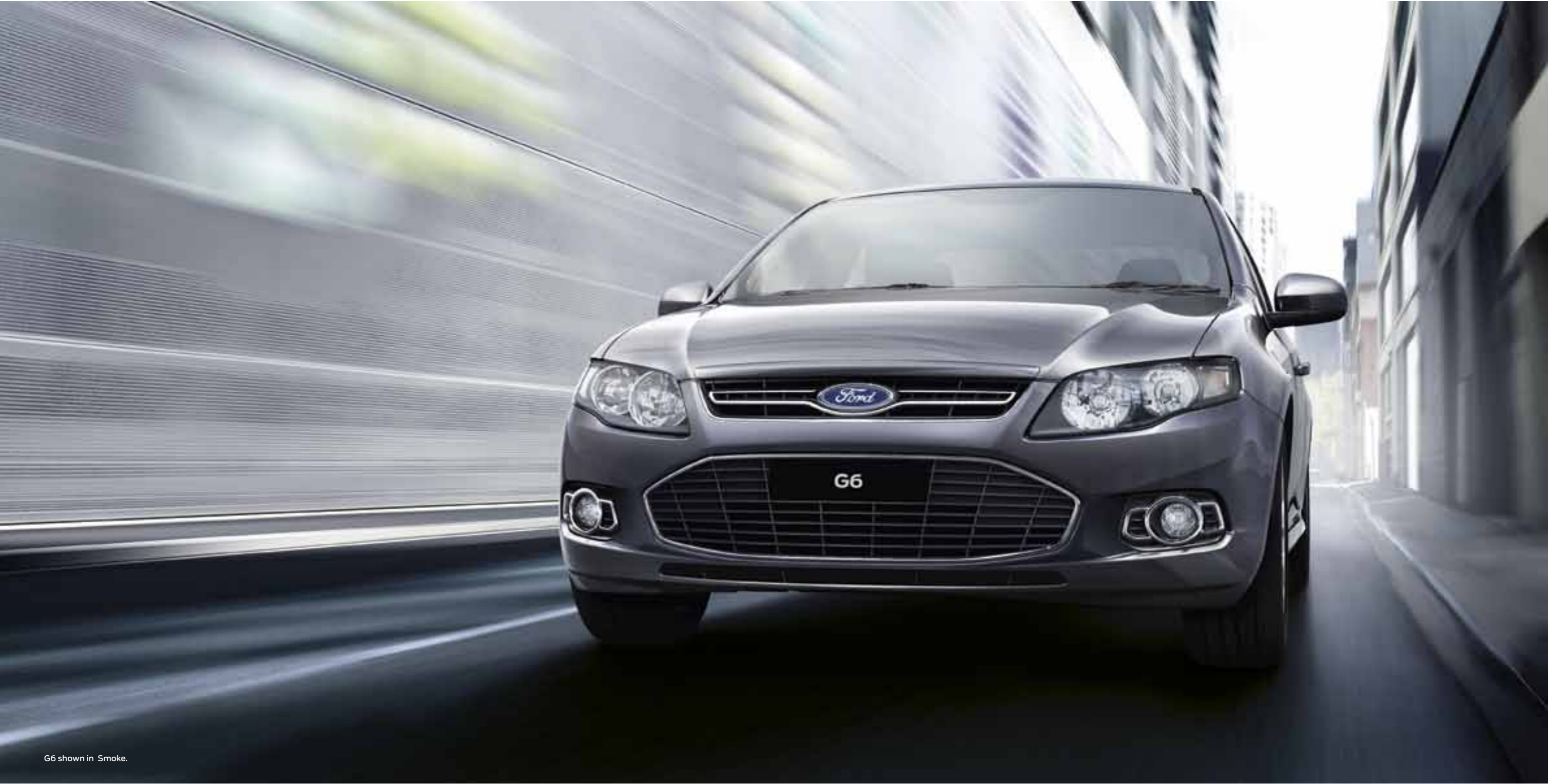
G6 shown in Smoke.

Enjoy the same levels of power and performance you're used to, but with improved fuel economy and reduced environmental impact.