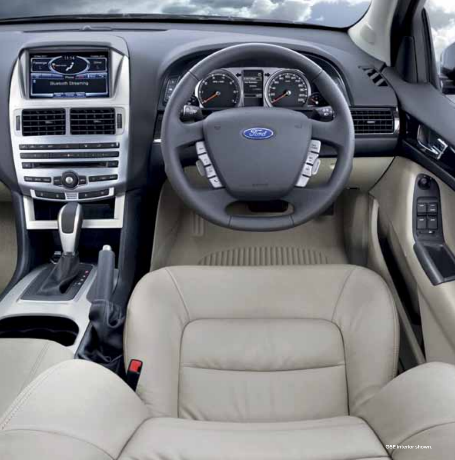
G6E interior shown.