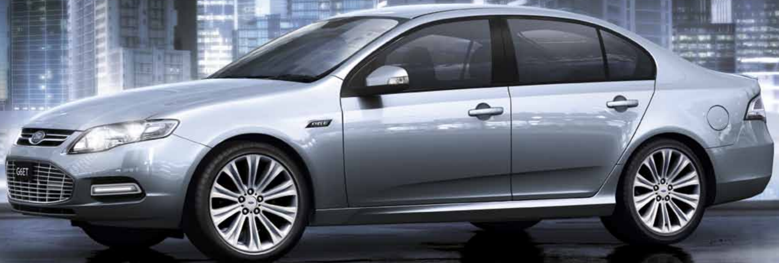
G6E Turbo shown in Lightning Strike.

The G Series offers plenty in the way of luxury and comfort, without ever compromising on power and driving pleasure.