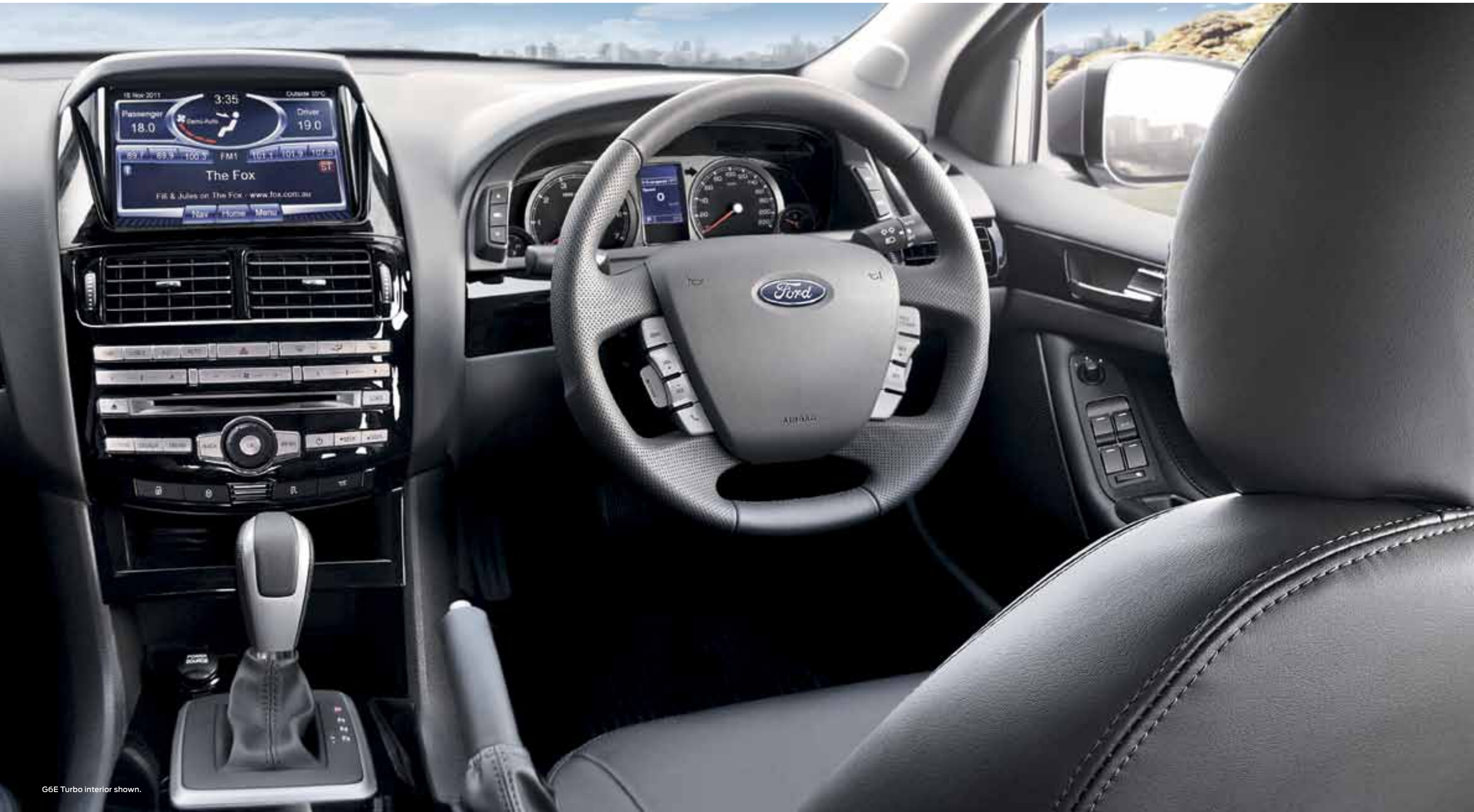
G6E Turbo interior shown.

Smart driving technologies and the latest in comfort and entertainment sit neatly within the Falcon's interior.