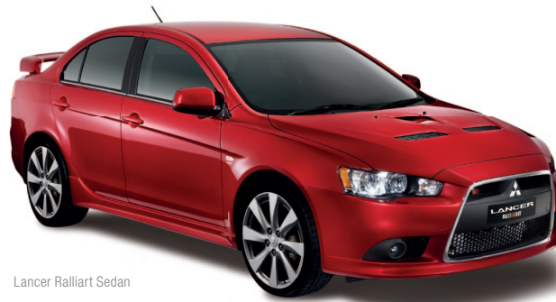
Lancer Ralliart Sedan