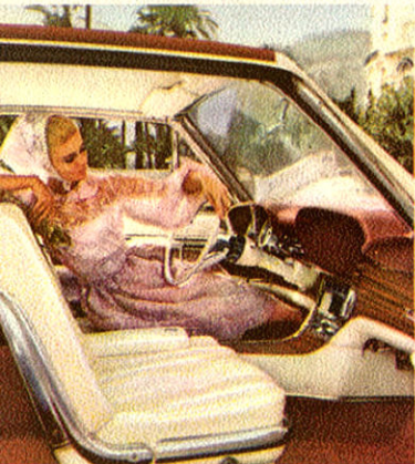
Swing-Away steering wheel—standard equipment

On a plaza in Monaco overlooking the Mediterranean, the Thunderbird Convertible