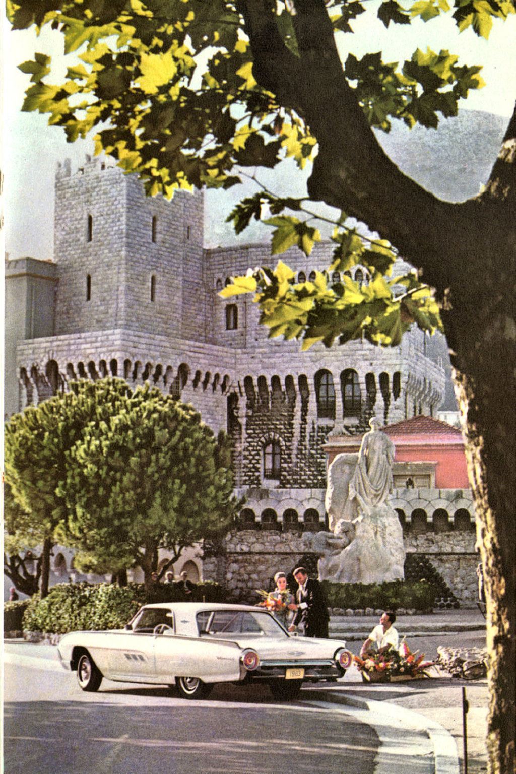
The Thunderbird Hardtop shown near the Palace of Monaco

All Thunderbird models—the elegant Landau, sleek Convertible, racy Sports Roadster, and distinguished Hardtop—are equally at home at fashionable European resorts or streaking along modern U.S. superhighways. An American classic with international appeal, Thunderbird is recognized wherever it is seen . . . admired and imitated at home and abroad. It is the world's classic personal car, a unique blending of luxurious comfort with the spirit, the flair, the nimble handling of a sports car. And while imitators strive to catch up, Thunderbird is forging ahead, pioneering new firsts in design and performance. For, in nine years since its debut, special care and attention—and constant improvement—have honed Thunderbird quality each year to a new level of perfection. This quality is reflected in countless ways . . . the mirror surface of Diamond Lustre Enamel, applied in a superb 8-coat enamel and primer process unmatched for quality and durability . . . the tailored luxury of exquisite interiors, set off by deep-foam bucket seats and personal convenience console . . . a suspension that whisks you along with all the exhilarating smoothness of four-wheeled flight, shielded from unwanted noise by more than twice the body insulation found in ordinary cars. For Thunderbird is no ordinary car, but a true classic which in nine years has achieved a singular standard of excellence . . . unique . . . and at home . . . around the world.