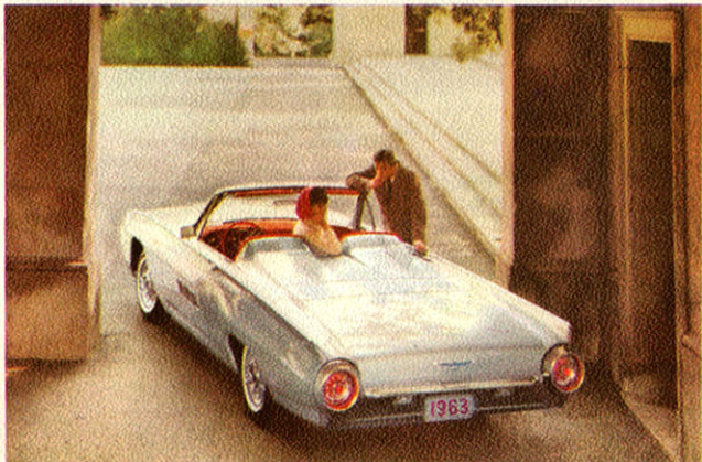
1963 Thunderbird Sports Roadster