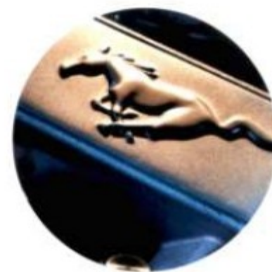
4.6L SOHC 16-Valve V8 Engine