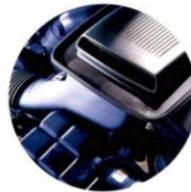
4.6L DOHC 32-Valve V8 Engine