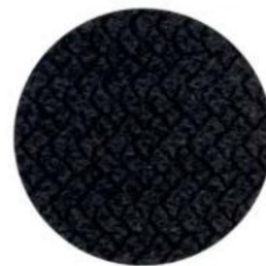
Dark Charcoal Cloth