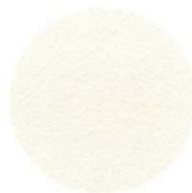
Oxford White Leather