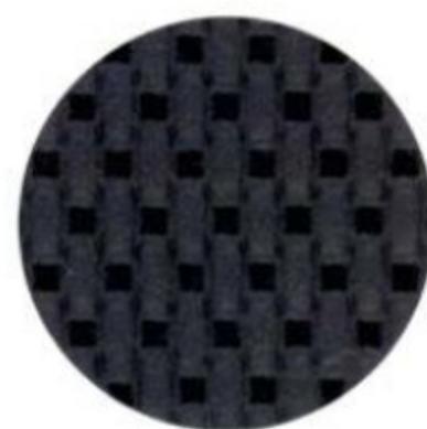
Dark Charcoal "Comfort-Weave" Leather (Mach 1 only)