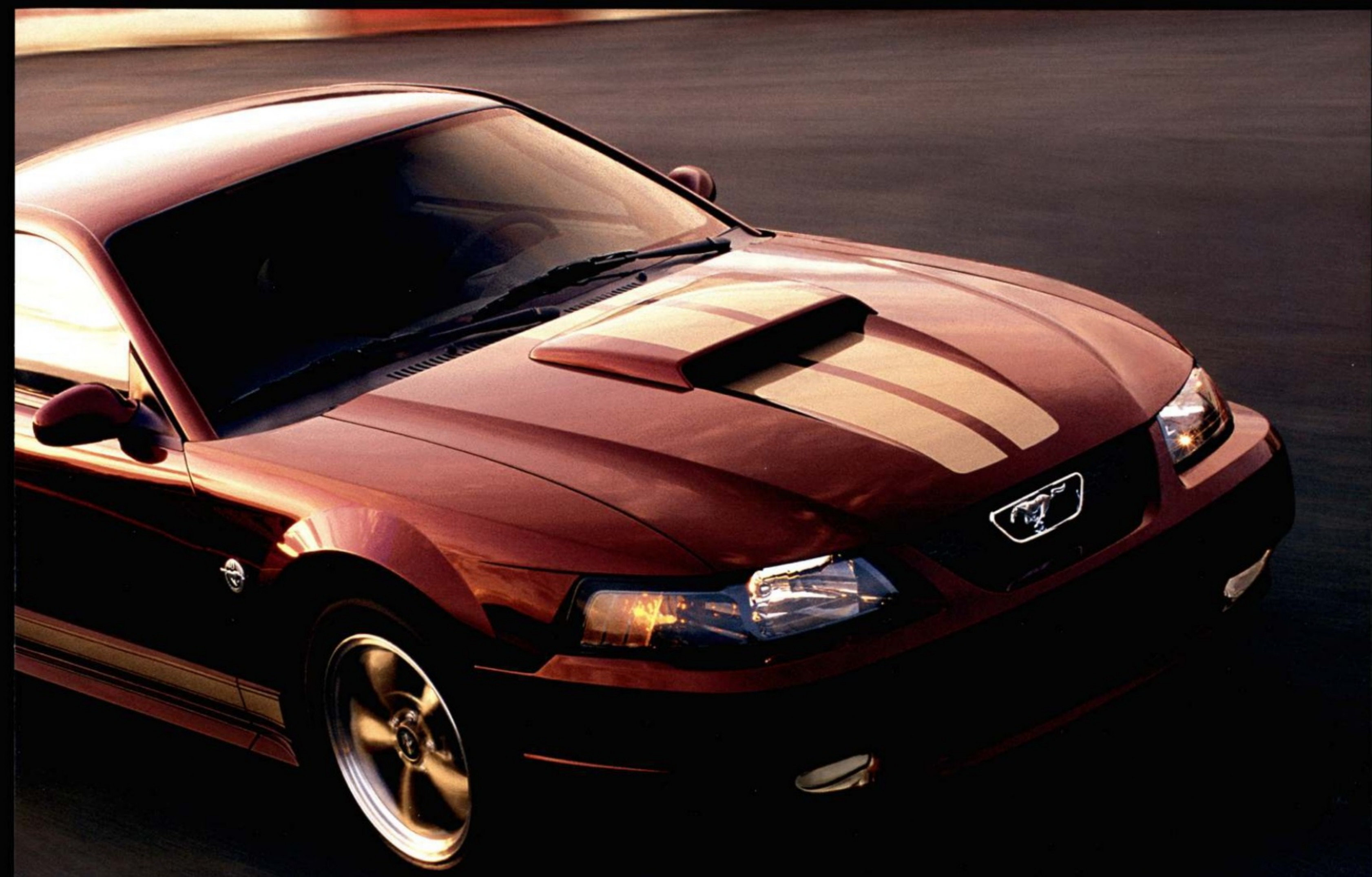
Mustang GT Premium Coupe in Crimson Red with 40th Anniversary Package. Shown on cover: GT Premium Convertible in Black.