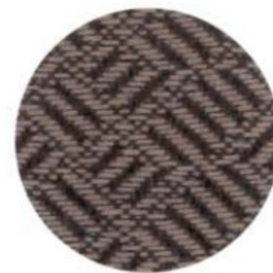
Medium Parchment Cloth