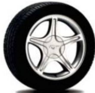
17" Painted Aluminum Wheel Standard on GT Deluxe