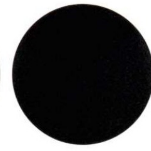
Dark Shadow Grey Metallic