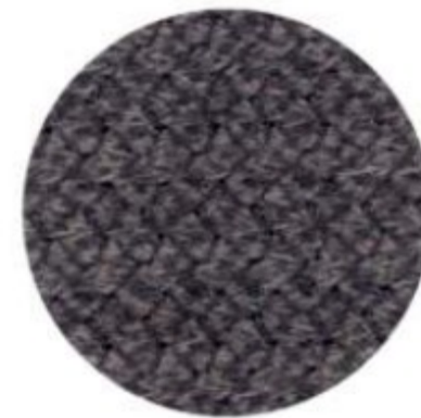
Medium Graphite Cloth