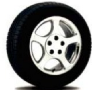
16" Polished Aluminum Wheel Pony Appearance Package