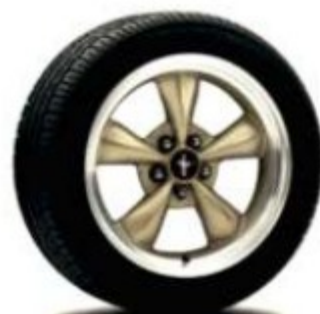
17" Premium Painted Aluminum Wheel with Bright Flange 40th Anniversary GT Premium