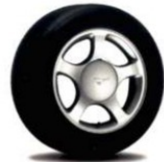
16" Painted Aluminum Wheel (Coupe only) Standard on V6 Coupe and Deluxe Coupe