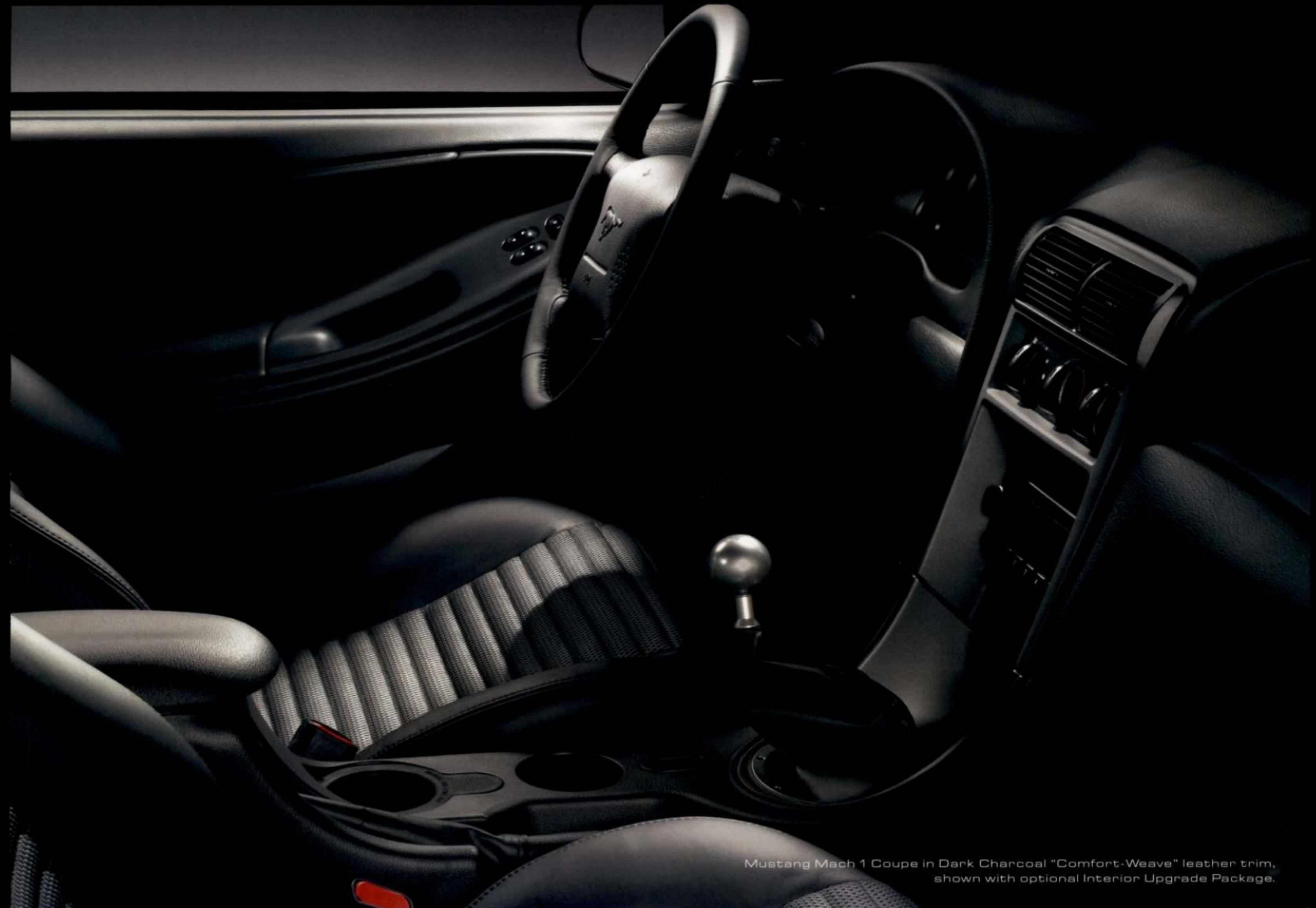
Mustang Mach 1 Coupe in Dark Charcoal "Comfort-Weave" leather trim, shown with optional Interior Upgrade Package.