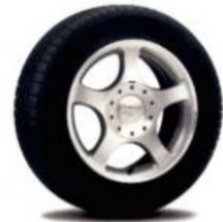
16" Bright Machined-Aluminum Wheel Standard on V6 Deluxe, Premium Convertible and Premium Coupe