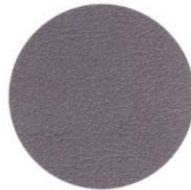
Medium Graphite Leather