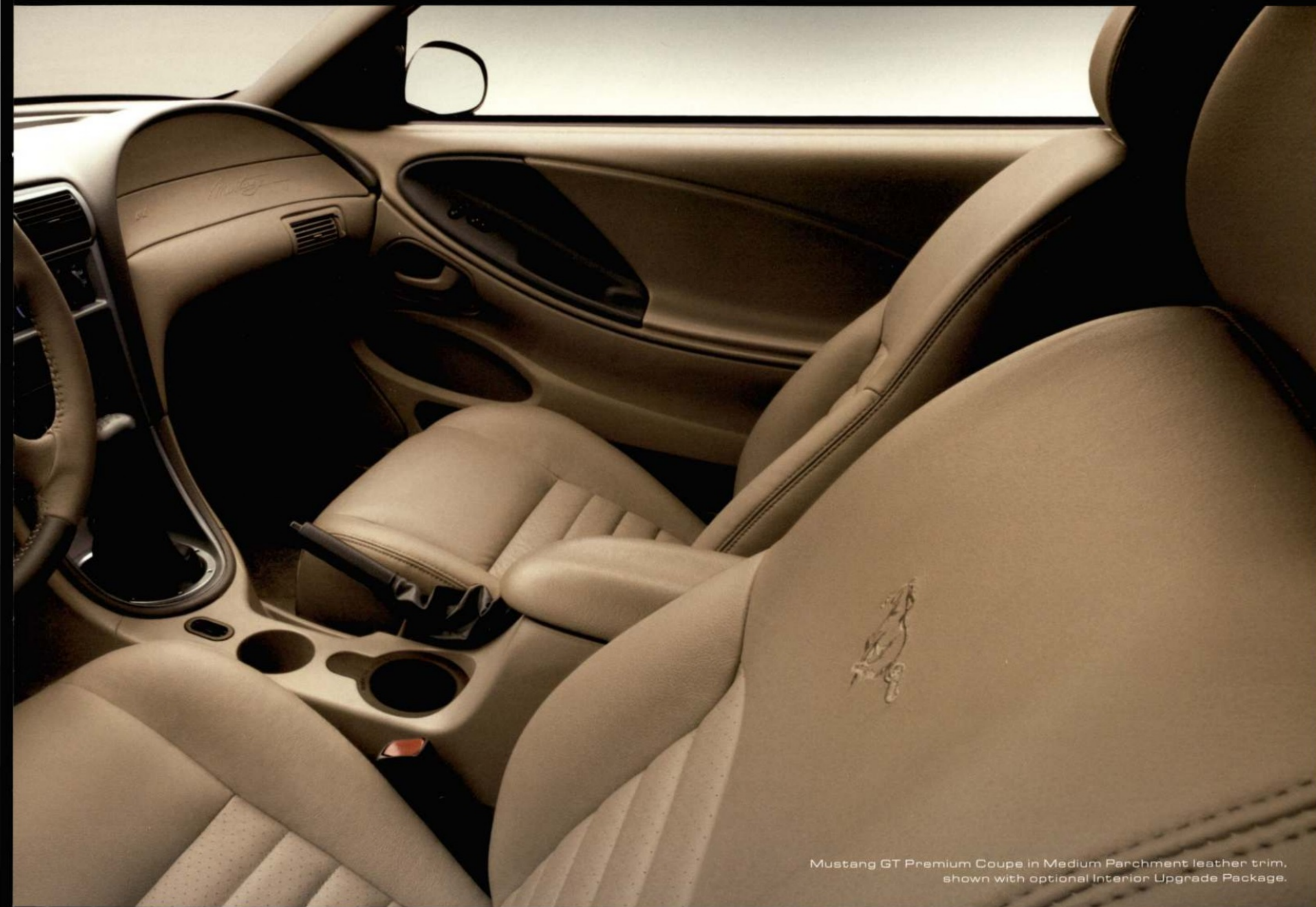
Mustang GT Premium Coupe in Medium Parchment leather trim, shown with optional Interior Upgrade Package.