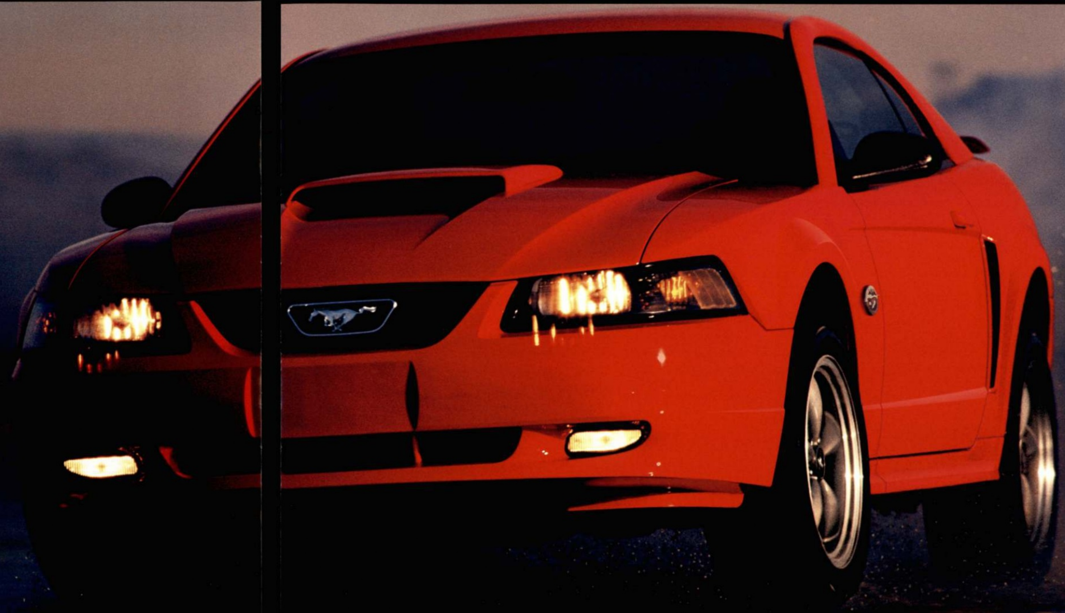
Mustang GT Premium Coupe in Torch Red.