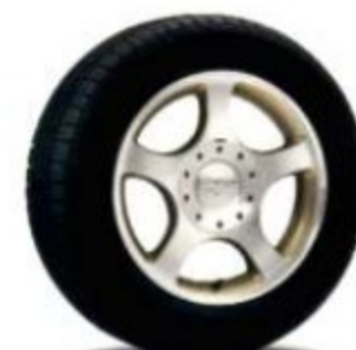
16" Bright Aluminum Wheel 40th Anniversary V6 Premium