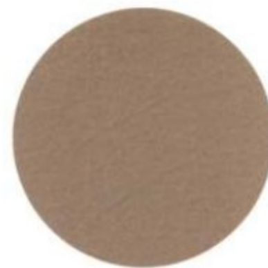
Medium Parchment Leather