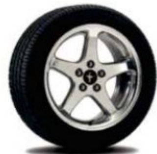
17" Bright Aluminum Wheel Optional on GT Premium