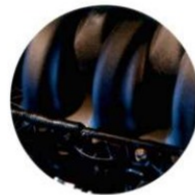
OHV V6 Engine