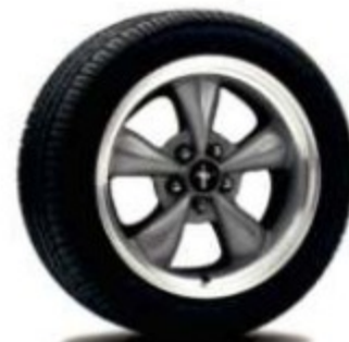
17" Premium Painted Aluminum Wheel with Bright Flange Standard on GT Premium