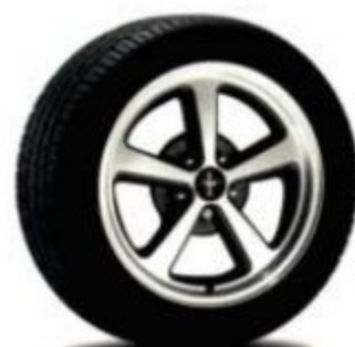
17" Heritage Aluminum Wheel Standard on Mach 1