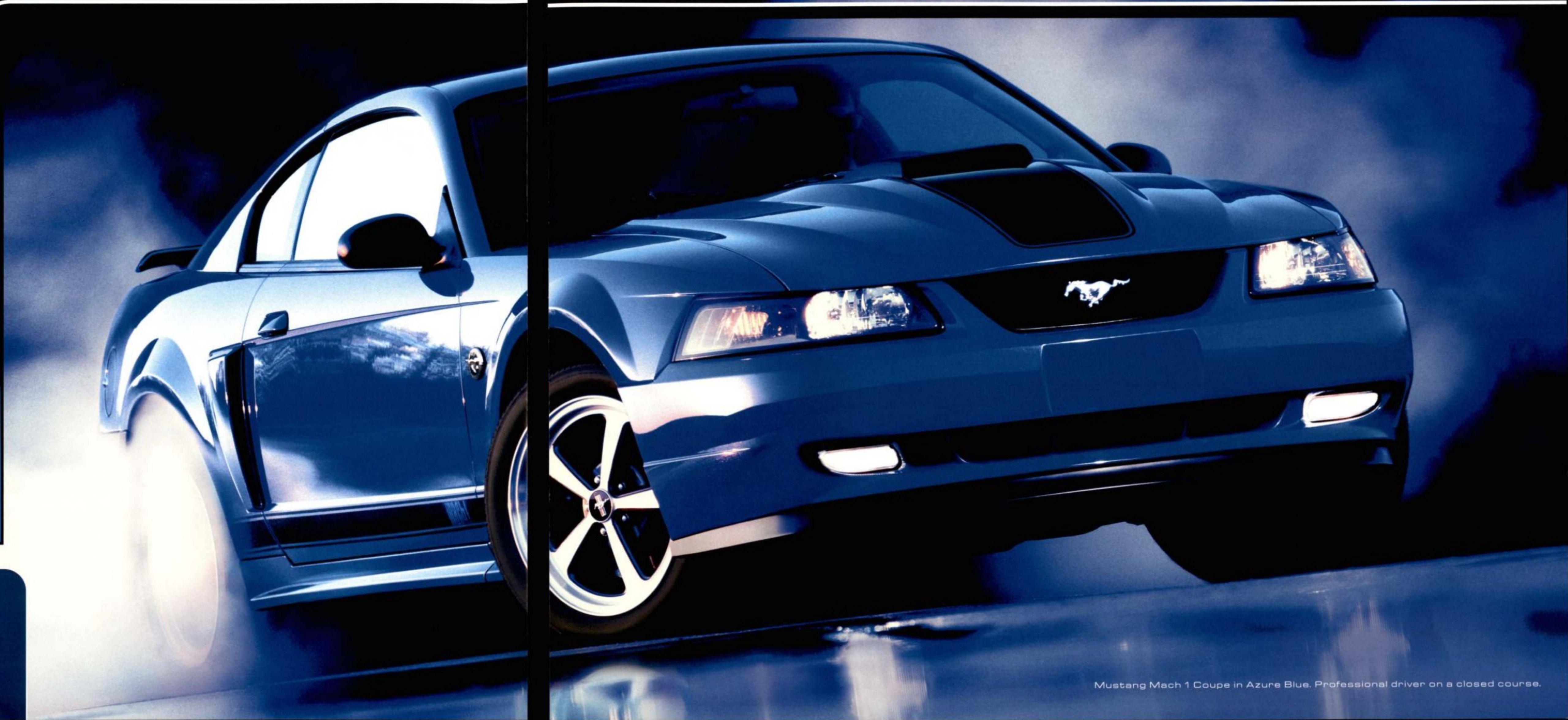
Mustang Mach 1 Coupe in Azure Blue. Professional driver on a closed course.

There's something about a V8. Especially when it's packed into a Mustang. In the Mach 1, it's teamed with a unique "shaker" hood scoop for that sweet, low rumble you can hear coming from a mile away.