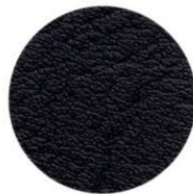
Dark Charcoal Leather