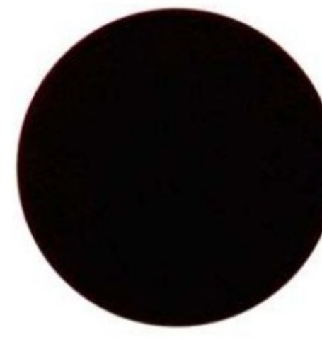
40th Anniversary Crimson Red