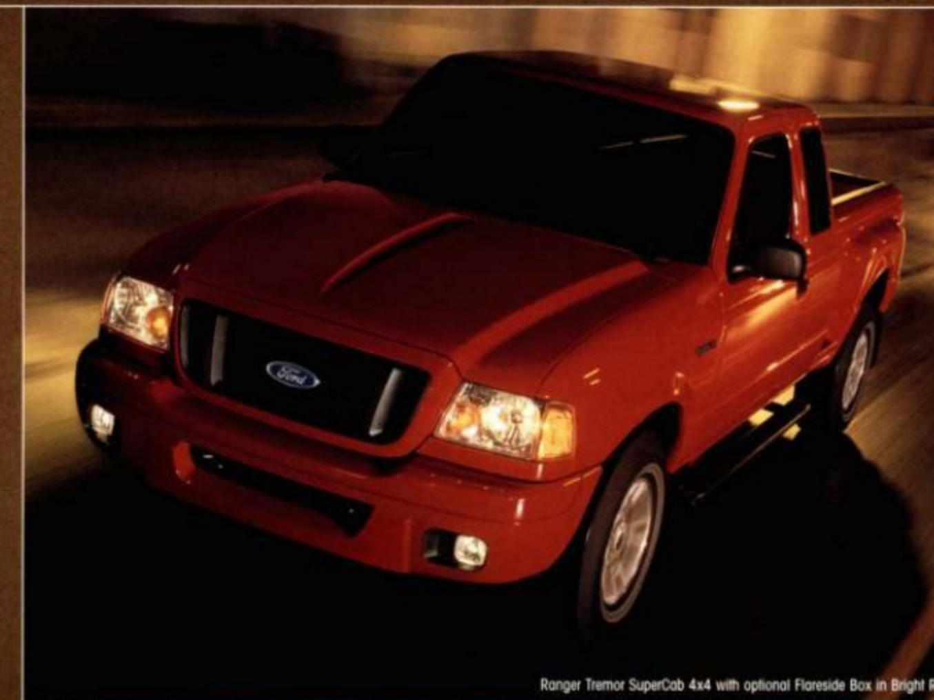
Ranger Tremor SuperCab 4x4 with optional Flareside Box in Bright Red.

Inside the FX4 Level II there is a place to settle in for the ride. There are new two-tone cloth sport front bucket seats and center console. Add an optional Power Equipment Group and you get power windows, power door locks, power sideview mirrors and remote keyless entry system at your service.