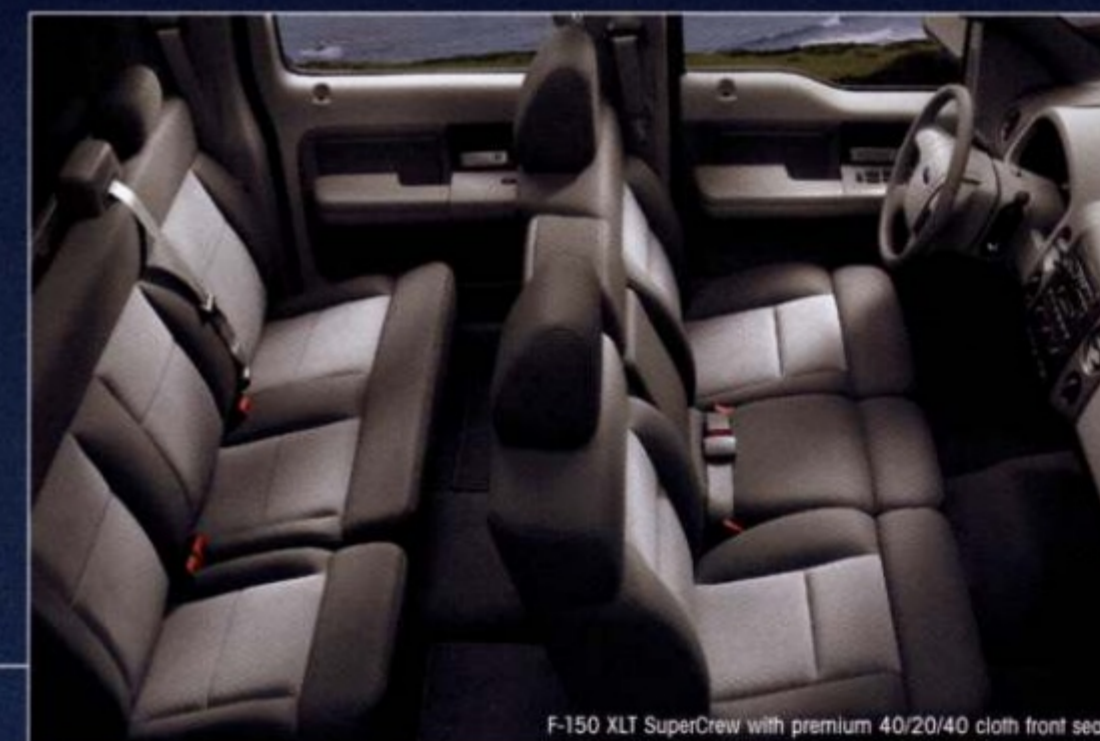
F-150 XLT SuperCrew with premium 40/20/40 cloth front seat.