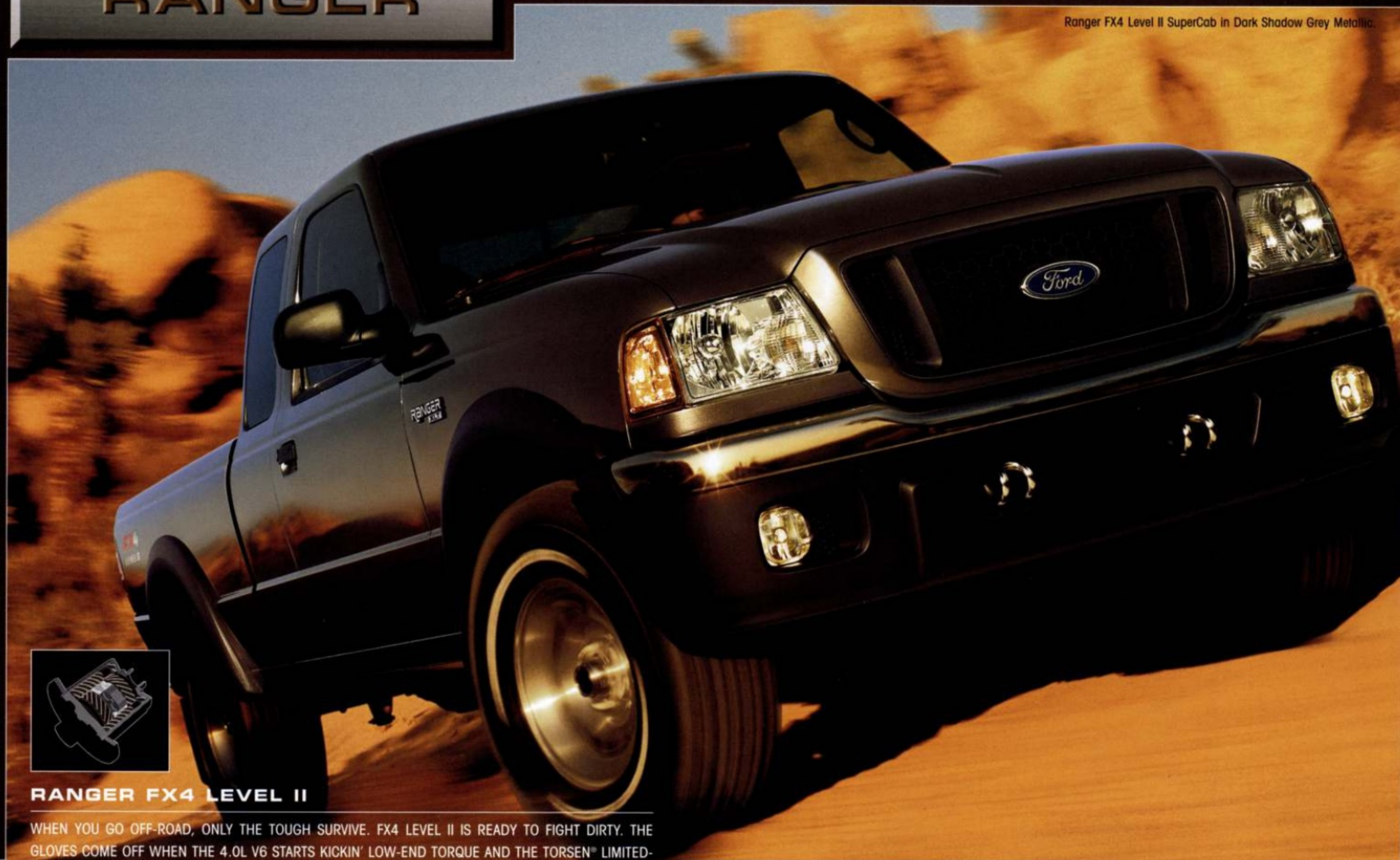
Ranger FX4 Level II SuperCab in Dark Shadow Grey Metallic.