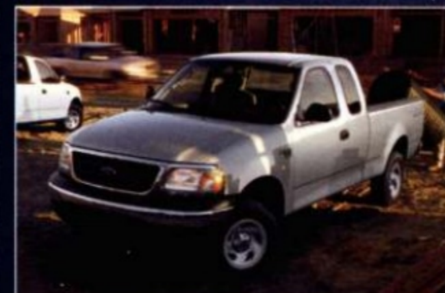
F-150 HERITAGE p.10