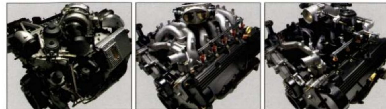
6.0L Power Stroke® Diesel V8