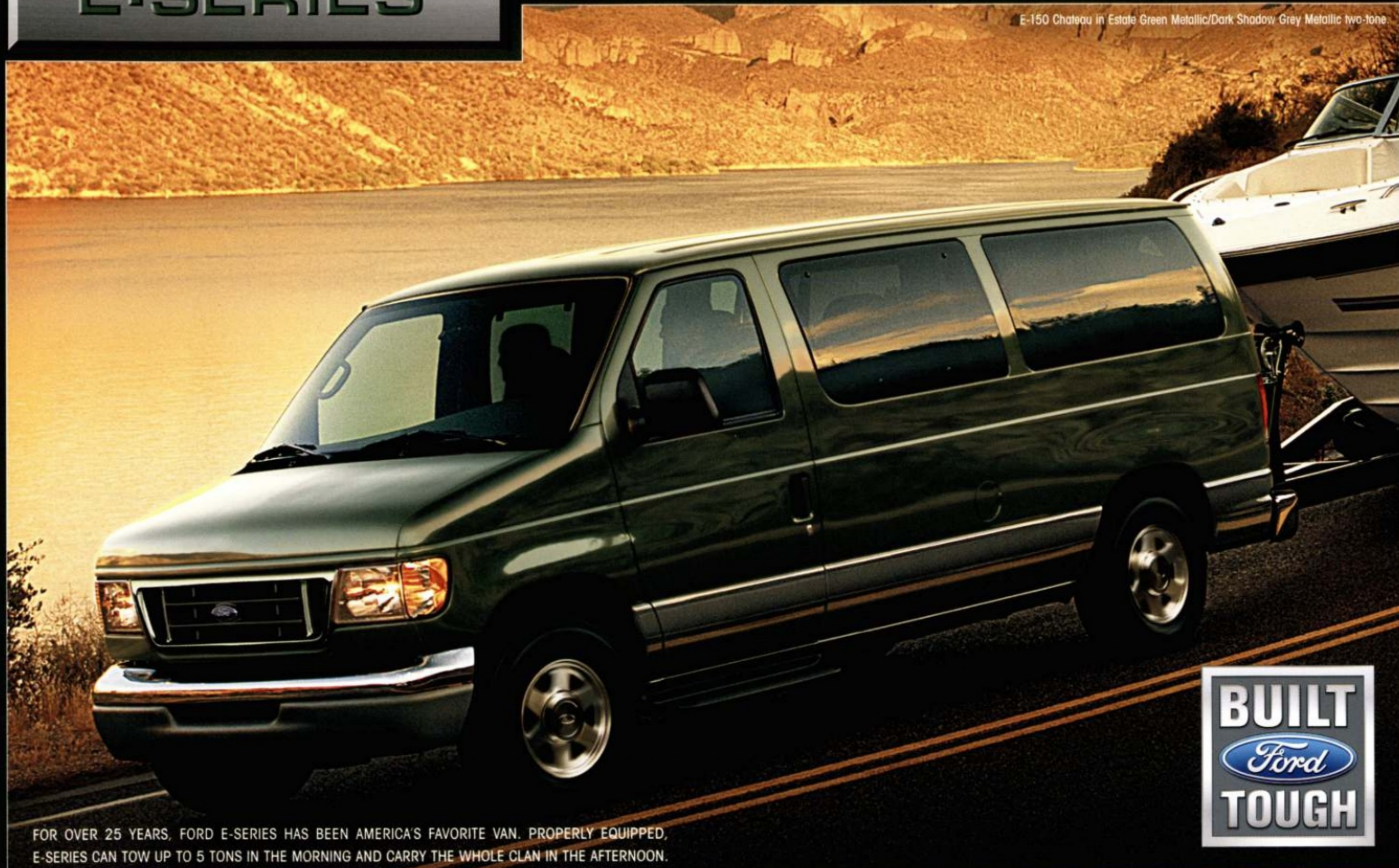
E-150 Chateau in Estate Green Metallic/Dark Shadow Grey Metallic two-tone