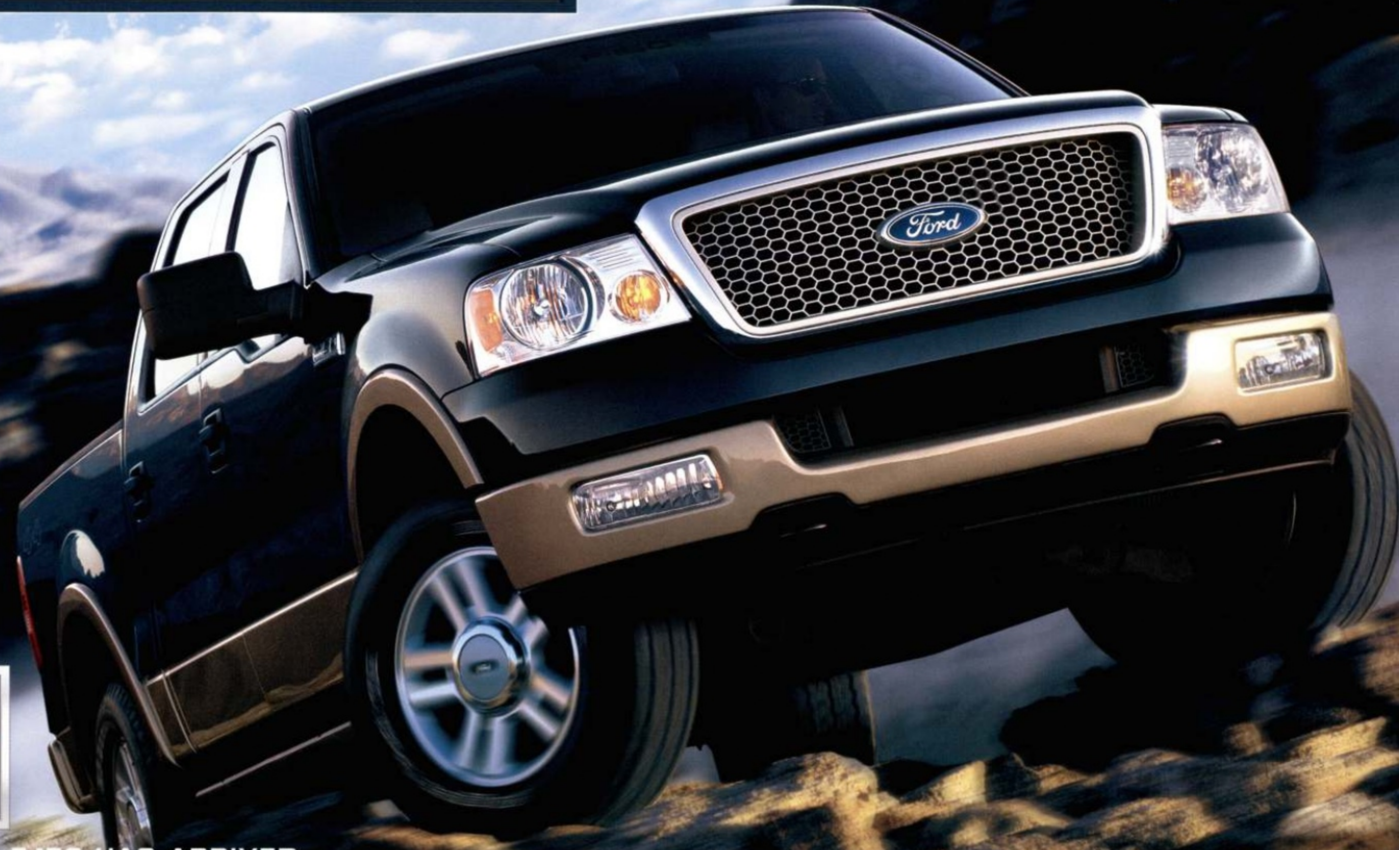
F-150 Lariat SuperCrew 4x4 shown in Medium Wedgewood Blue/Arizona Beige Two-Tone.