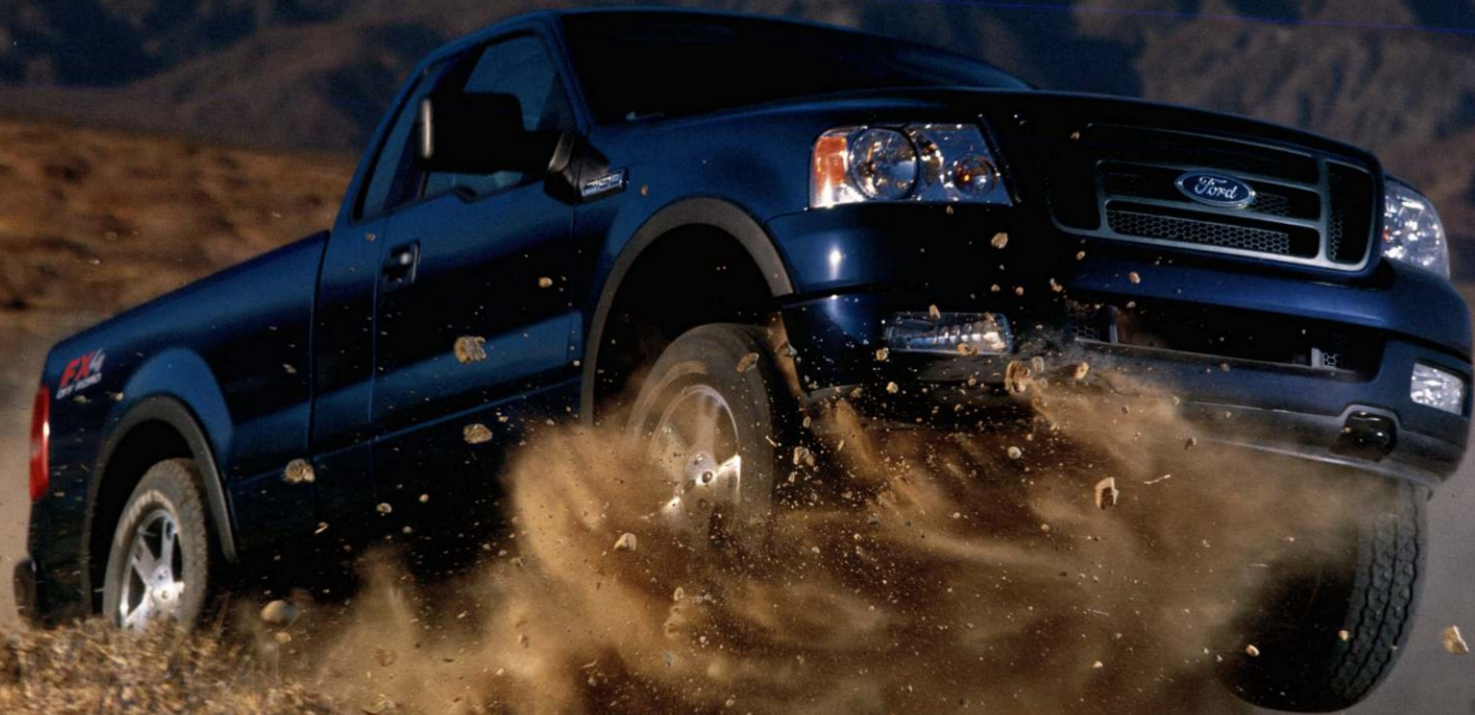
F-150 FX4 Off-Road Regular Cab in True Blue Metallic. The new F-150 shown on a closed course with a professional driver demonstrating the off-road abilities that exemplify F-150 toughness and capability.