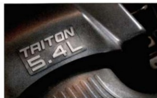
5.4L SOHC Triton™ V8