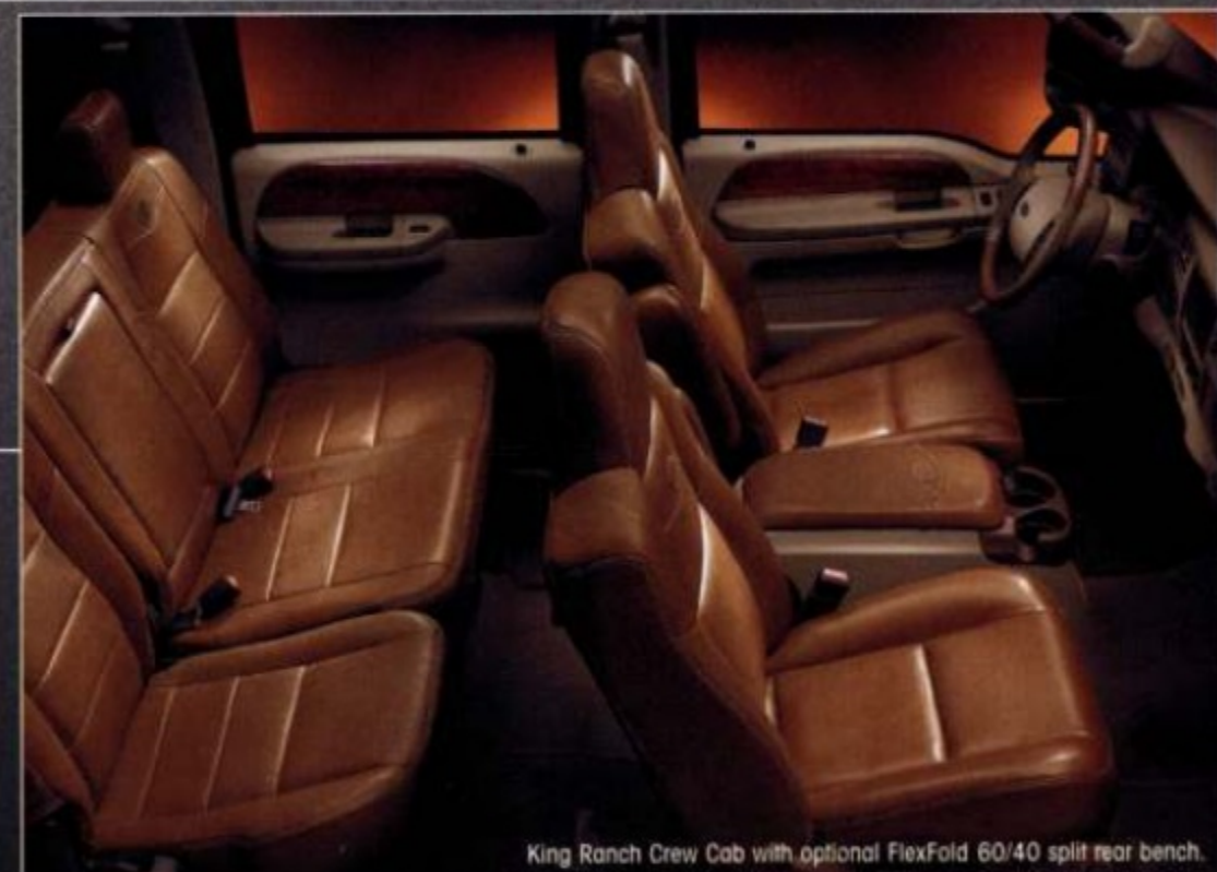
King Ranch Crew Cab with optional FlexFold 60/40 split rear bench.

King Ranch F-Series Super Duty is here. Beyond the leather-wrapped steering wheel, there's the King Ranch logo on the instrument panel and front and rear floor mats. Rich Castañón leather trim covers the quad captain's chairs and new, available FlexFold 60/40 split rear bench. Even the assist handles are leather wrapped. Welcome to "The Ranch."