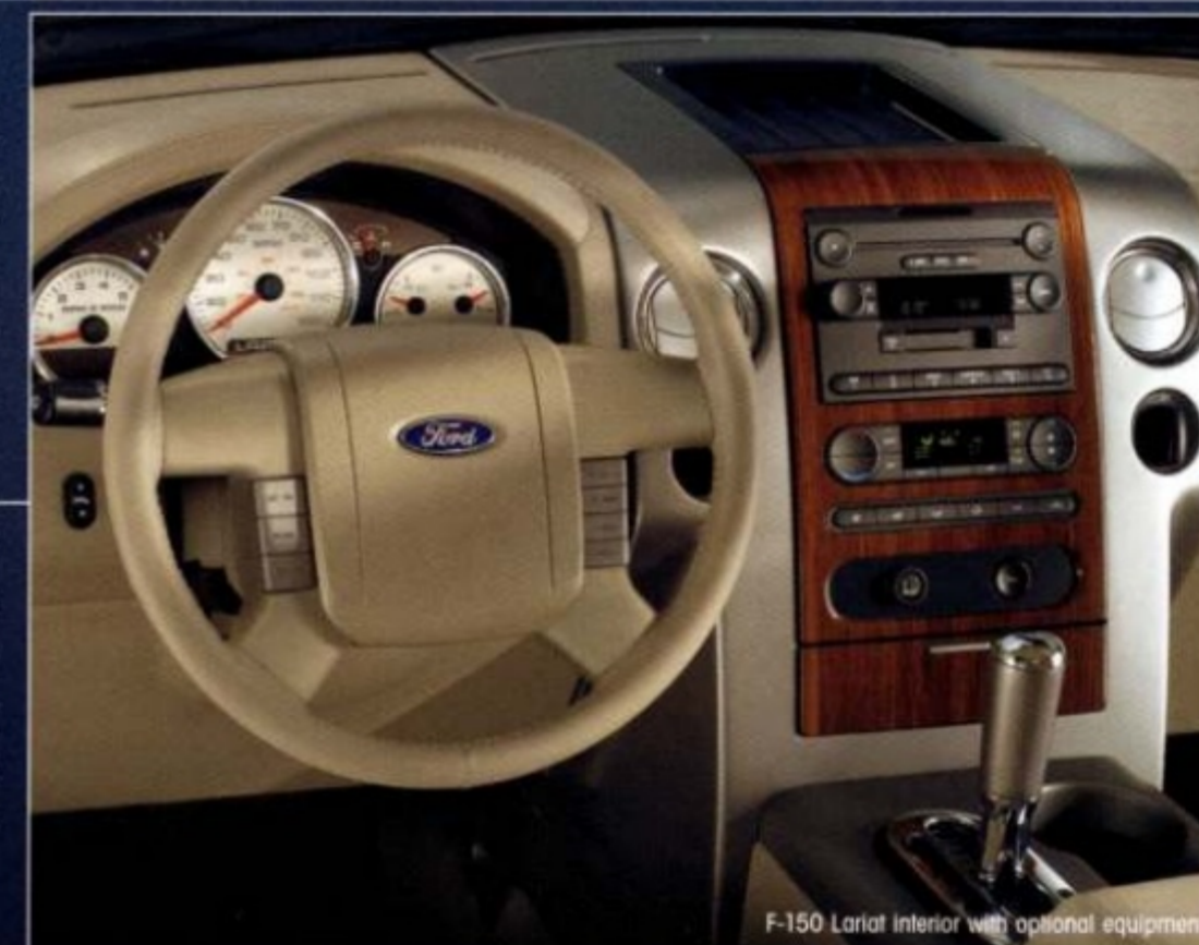
F-150 Lariat interior with optional equipment.

Lariat sets new standards for comfort wherever you're sitting. Leather-trimmed 40/20/40 front seats and steering wheel, woodgrain appliqué, power driver's seat, adjustable pedals, Electronic Automatic Temperature Control, HomeLink,® and much more are all standard. Then there are exclusive options like the front captain's chairs featuring the first-in-class flow-through console with floor shifter.