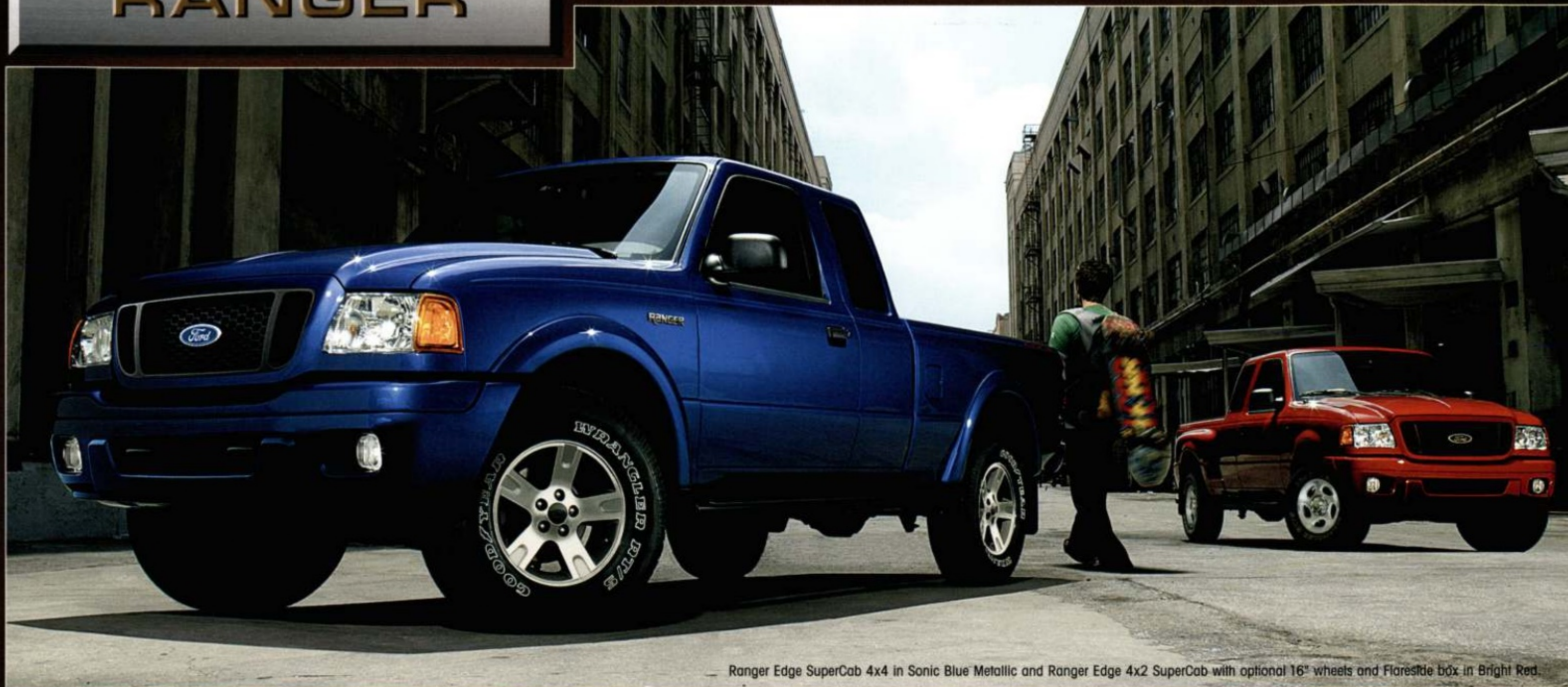
— Ranger Edge SuperCab 4x4 in Sonic Blue Metallic and Ranger Edge 4x2 SuperCab with optional 16" wheels and Flarestyle box in Bright Red.