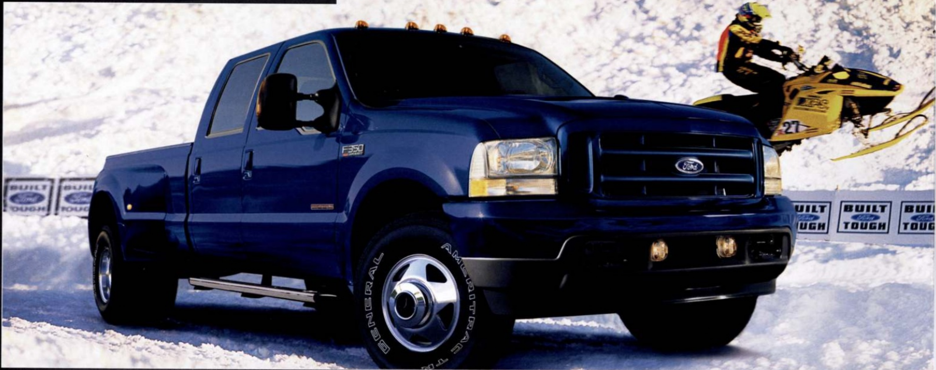
F-350 DRW 4x4 Crew Cab with optional XLT Sport and FX4 Off-Road Packages and other optional equipment, shown in True Blue Metallic.