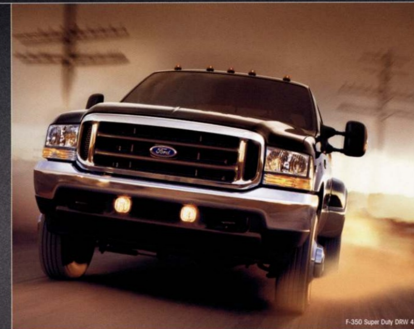
F-350 Super Duty DRW 4x4.