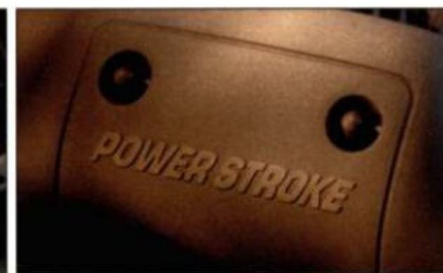
6.0L Power Stroke® V8 Turbo Diesel