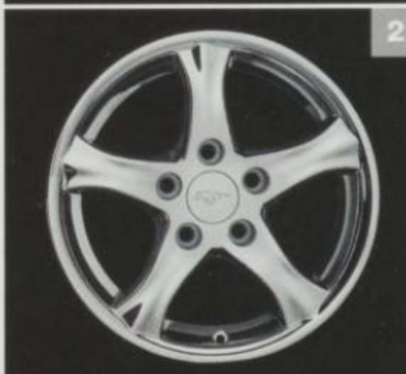
2. XR3Z-1007-AA Fits 1994 – 2001 Mustang. 15" x 7" Chromed aluminum 5-spoke style. Includes chromed "Pony" center cap and chromed lug nuts. Wheel lock kit: F2LY-1A043-A