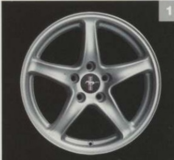
1. 1R3Z-1007-AB Fits 1994 – 2004 Mustang. 17" x 8" Painted aluminum 5-spoke, Cobra-style. Includes "Pony" center cap and chromed lug nuts. Wheel lock kit: F2LY-1A043-A