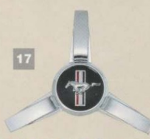
17. 5R3Z-1130-AA; Mustang "Pony Spinner-Style" Center Caps "Pony Spinner-Style" center caps (set of four). Fits all 2005 Mustang wheels, except 17" bright machined cast aluminum wheel.