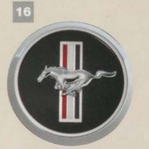
16. 5R3Z-1130-BA; Mustang Chrome Center Caps "Pony Chrome Ring" center caps (set of four). Fits all 2005 Mustang wheels, except 17" bright machined cast aluminum wheel.