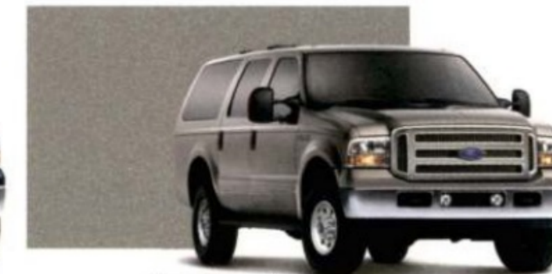
Silver Birch Metallic