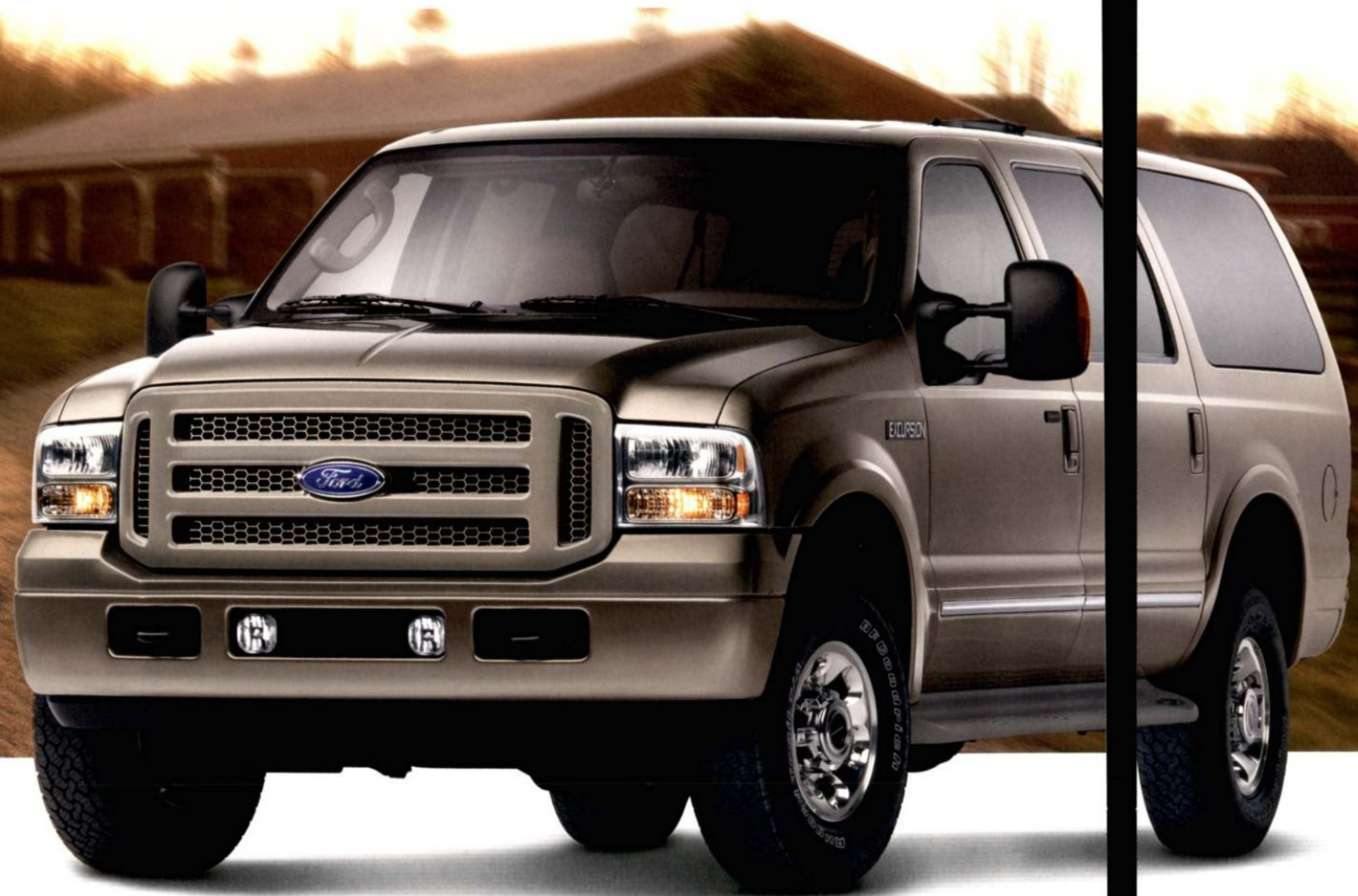
Excursion Limited 4x4 _ Pueblo Gold Metallic available 4x4 Trailer Tow Group

6.0L Power Stroke® V8 Turbo Diesel Engine – With 325 hp and a massive 560 lb.-ft. of torque, the low-end grunt of Excursion's available class-exclusive diesel is unmatched. Its Electronic Variable Response Turbocharger (EVRT™) provides increased airflow during steep grade climbing and high-altitude towing, while responding quickly to low-speed launch demands.