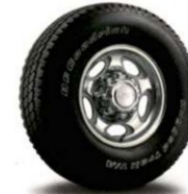
16" Premium Aluminum Wheel with Bright Center Cap Standard on Eddie Bauer