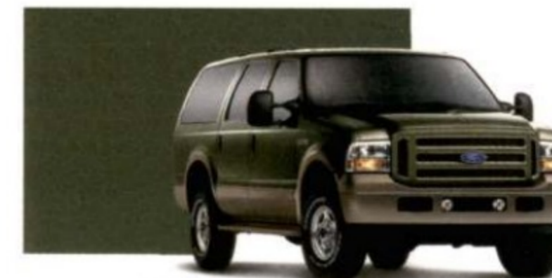
Estate Green Metallic