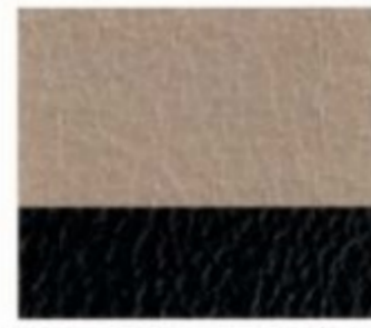
Medium Pebble and Charcoal Black Two-Tone Leather Standard on Eddie Bauer