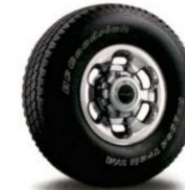
16" Premium Aluminum Wheel with Limited Center Cap Standard on Limited