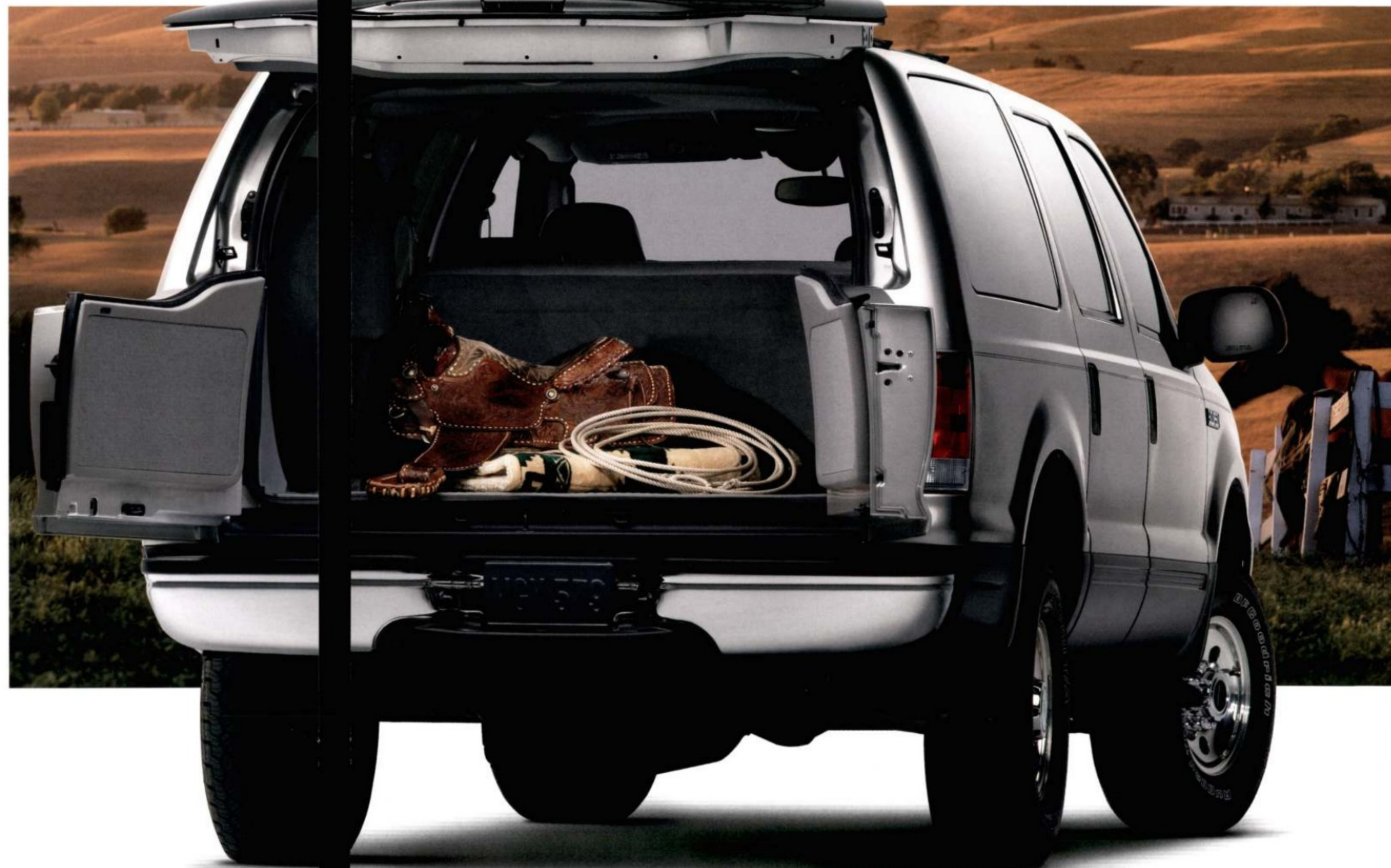
Excursion XLT 4x4 _ Silver Birch Metallic

Cargo and load capacity limited by weight and weight distribution.