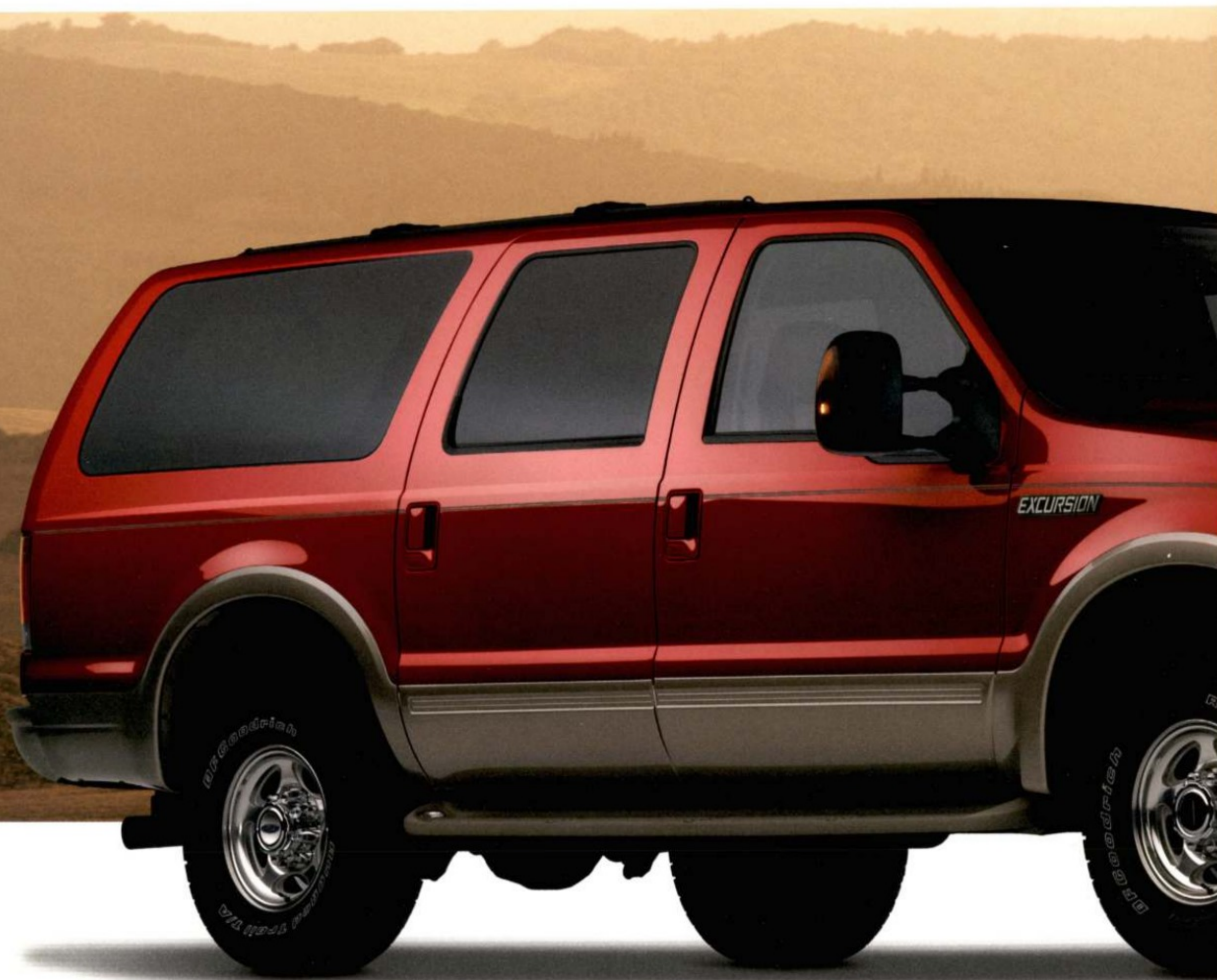
Excursion Eddie Bauer 4x4, Toreador Red Metallic available 4x4 Trailer Tow Group