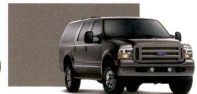
Mineral Grey Metallic

Ford uses clearcoat paint for beauty and protection. Shown with optional equipment. Colors shown are representative only. Not all colors are available on all models. See your dealer for actual paint/trim options.