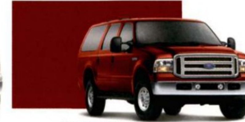
Toreador Red Metallic