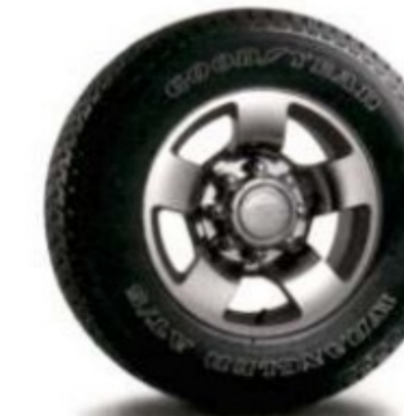
18" Forged-Aluminum Wheel with Center Cap Optional on Eddie Bauer and Limited (4x4 only) (late availability)