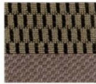
Medium Pebble Cloth Standard on XLS and XLT

Cargo and load capacity limited by weight and weight distribution.