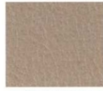
Premium Medium Pebble Leather Standard on Limited