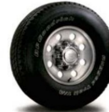
16" Polished-Aluminum Wheel Standard on XLS and XLT