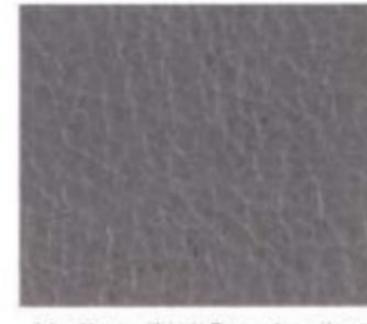
Medium Flint Grey Leather Optional on XLT