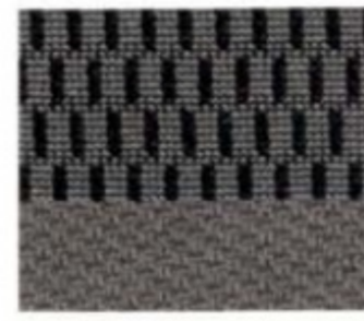
Medium Flint Grey Cloth Standard on XLS and XLT