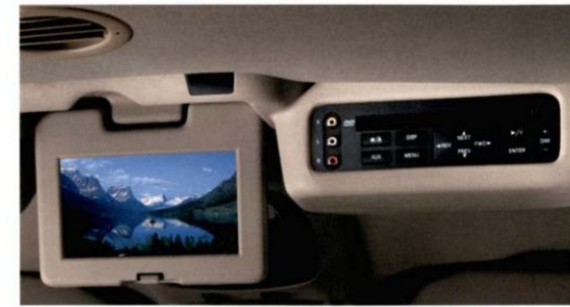
Excursion Limited – Medium Pebble Leather-Trimmed Interior

Rear-Seat DVD Entertainment System – Showtime in Excursion features a built-in DVD player with a flip-down 7" LCD color screen, remote control and wireless headphones. Your favorite movie can help time fly if the scenery outside starts looking the same. This first-in-class system is available on Excursion XLT, Eddie Bauer and Limited.