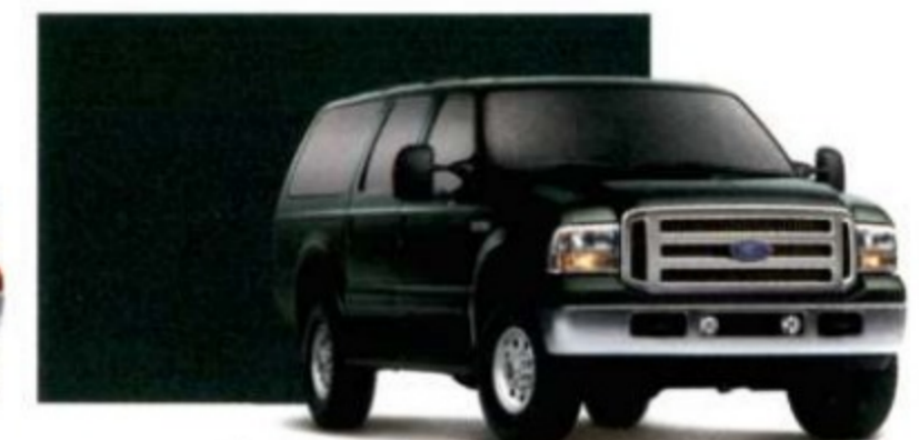
Aspen Green Metallic