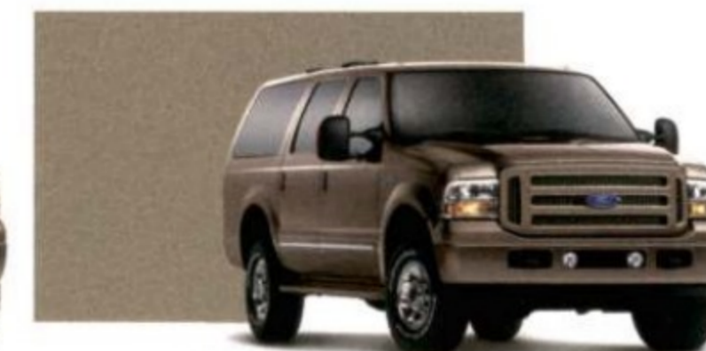
Pueblo Gold Metallic