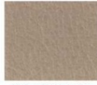
Medium Pebble Leather Optional on XLT