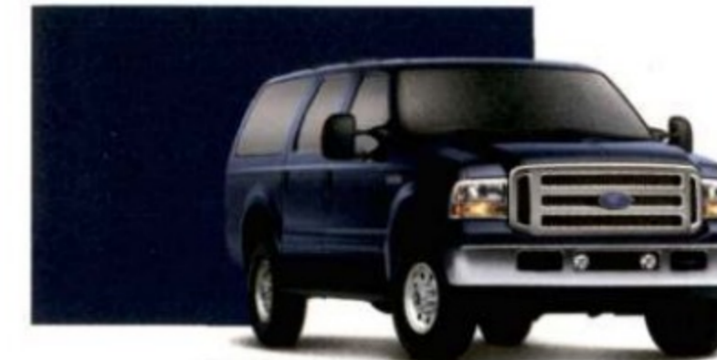
True Blue Metallic