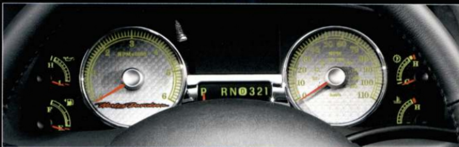
Spun metal gauges surrounded by chrome, just like your motorcycle