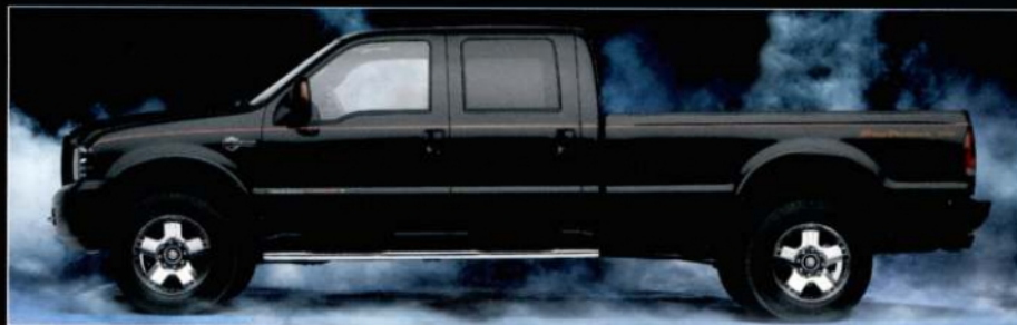
Black with orange graphics standard