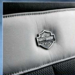
HARLEY-DAVIDSON Bar & Shield logo graces each seatback