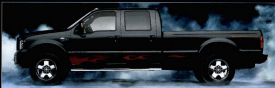
Black with available wet-on-wet Dark Toreador Red painted flames optional