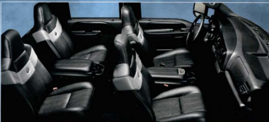
Four standard captain's chairs are trimmed in full-grained leather and embossed with the HARLEY-DAVIDSON Bar & Shield logo. A custom serial-number plate on the center console IDs your truck as one of a limited edition.