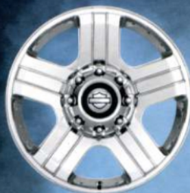
20" polished forged-aluminum wheels with Bar & Shield logo on center caps