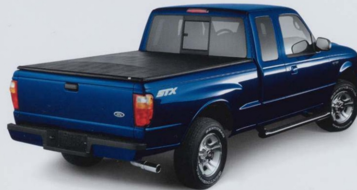
Ranger STX in Sonic Blue Metallic, shown with optional equipment.

Built Ford Tough and styled to steal the spotlight, this new Ford Ranger STX has got it all going on. Low-profile effects and high design detail make the STX cool from the ground up. Inside and out, it's all about new attitude for Ranger. From its machined split spoke aluminum wheels to its exclusive body color trim touches, STX makes a statement to the street. For more information about Ranger, visit us at fordvehicles.com .