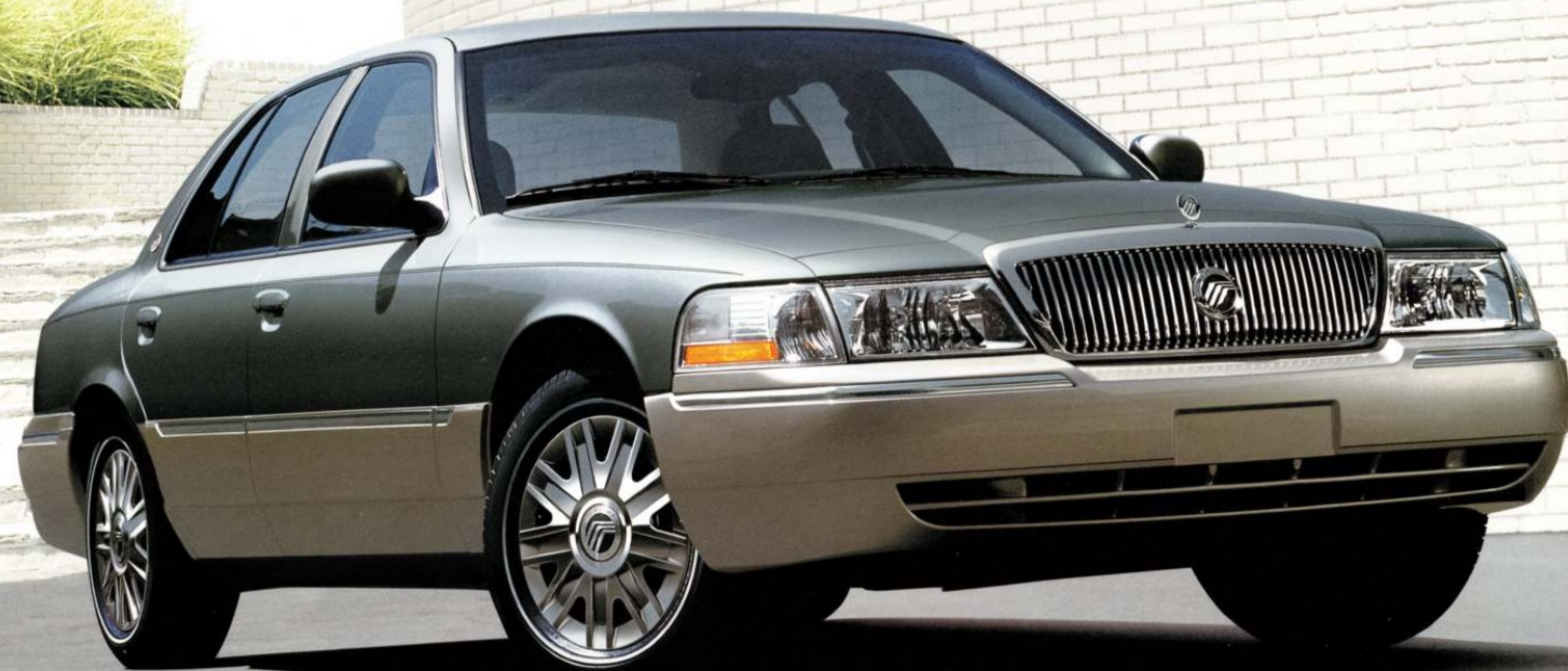
Grand Marquis GS Two-Tone Edition in Light Tundra Metallic with Gold Ash Metallic accent and available 16" chromed wheel covers.

HIGHEST GOVERNMENT SAFETY RATING For 9 consecutive years, Grand Marquis has received the highest government frontal crash safety rating (1996-2004). In addition, when equipped with available side-impact airbags, Grand Marquis is the only vehicle in its class to receive the highest government crash safety rating in all 5 categories (driver frontal impact, passenger frontal impact, front-seat side impact, rear-seat side impact, and Rollover Resistance Rating). This exceptional record of safety is built on innovative safety systems.