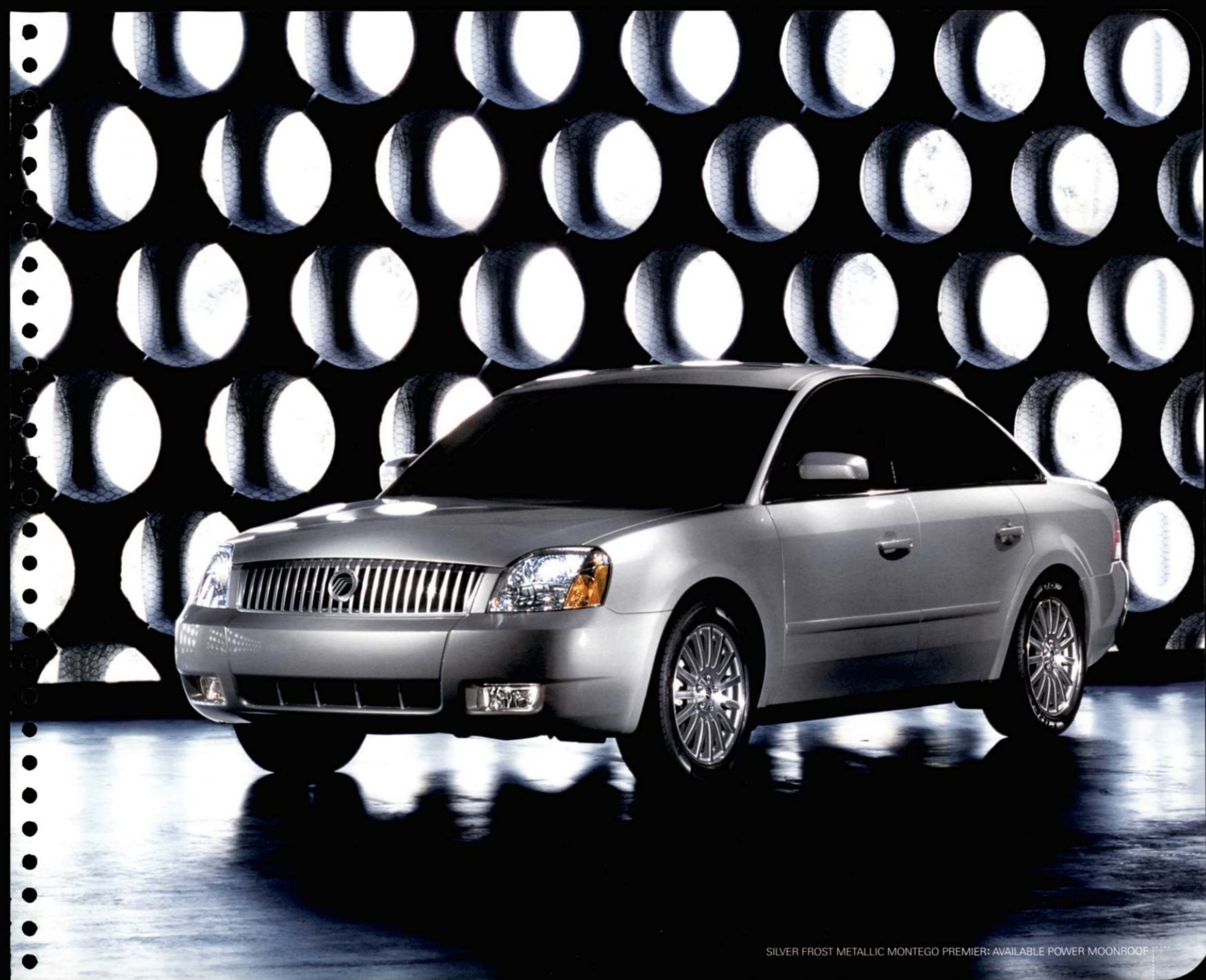
SILVER FROST METALLIC MONTEGO PREMIER: AVAILABLE POWER MOONROOF