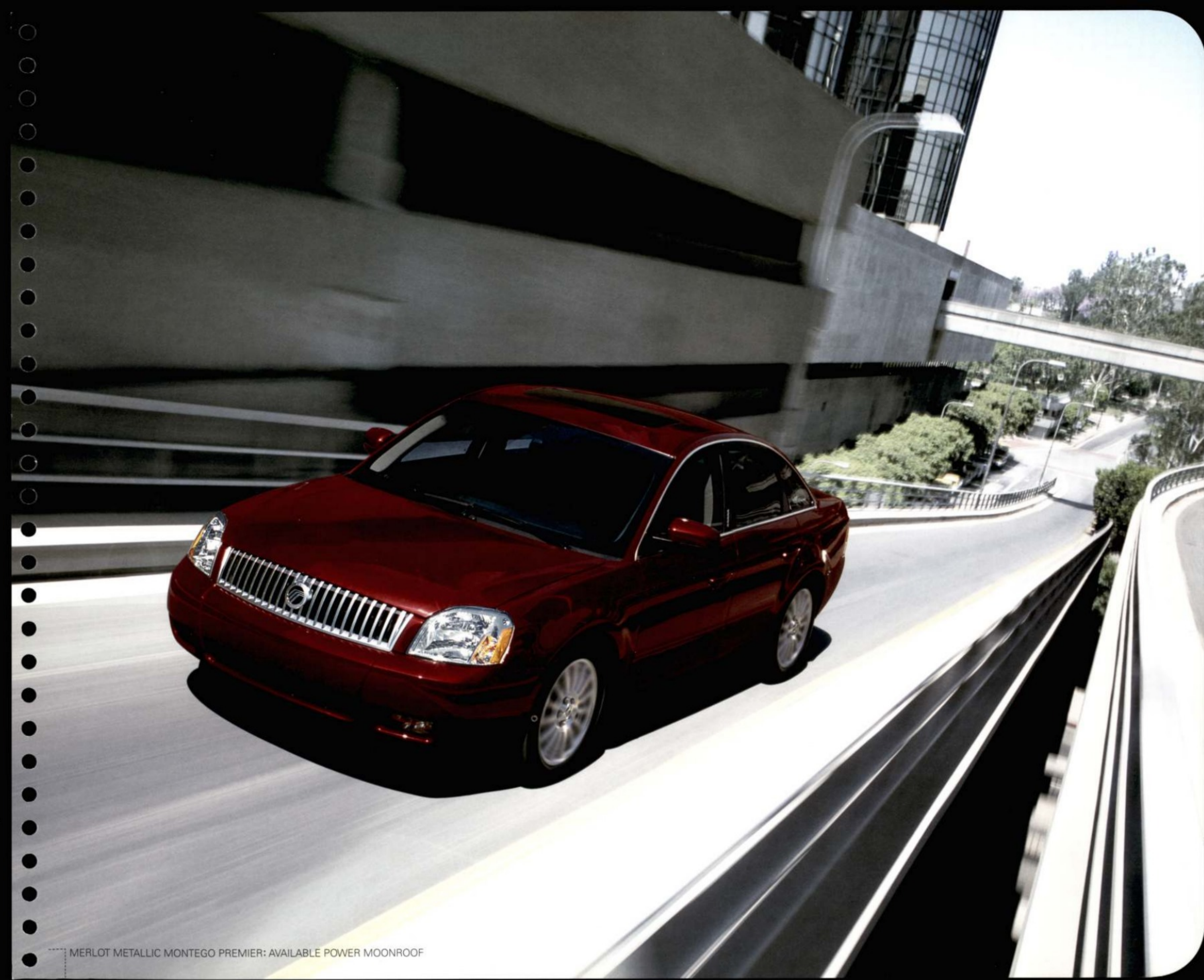
MERLOT METALLIC MONTEGO PREMIER: AVAILABLE POWER MOONROOF