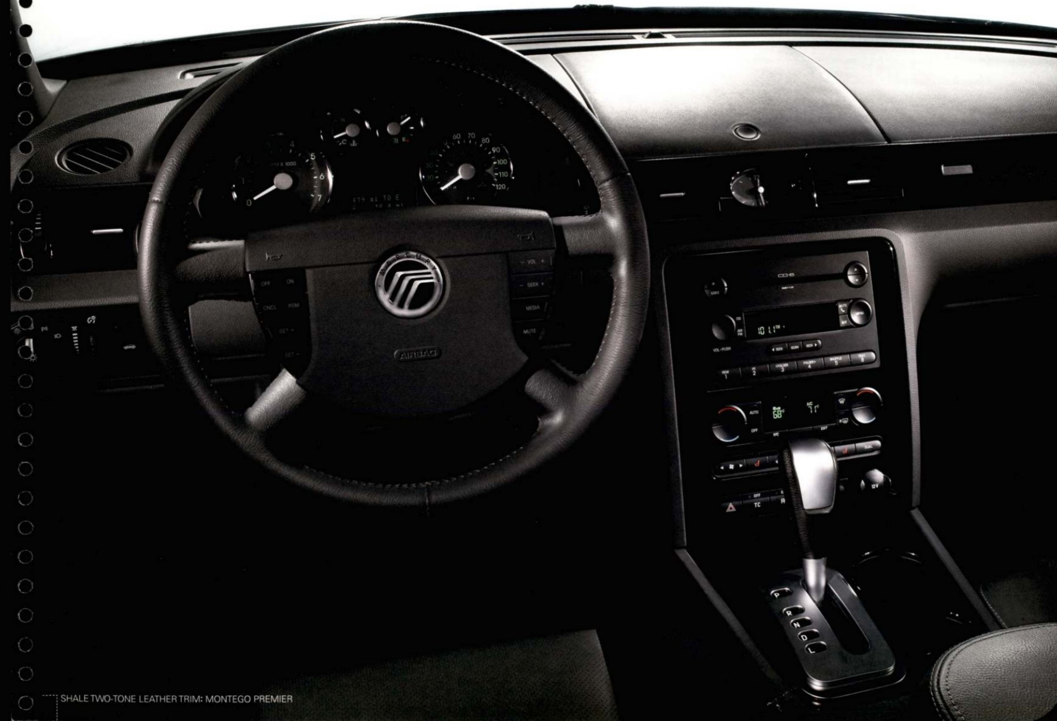
SHALE TWO-TONE LEATHER TRIM: MONTEGO PREMIER