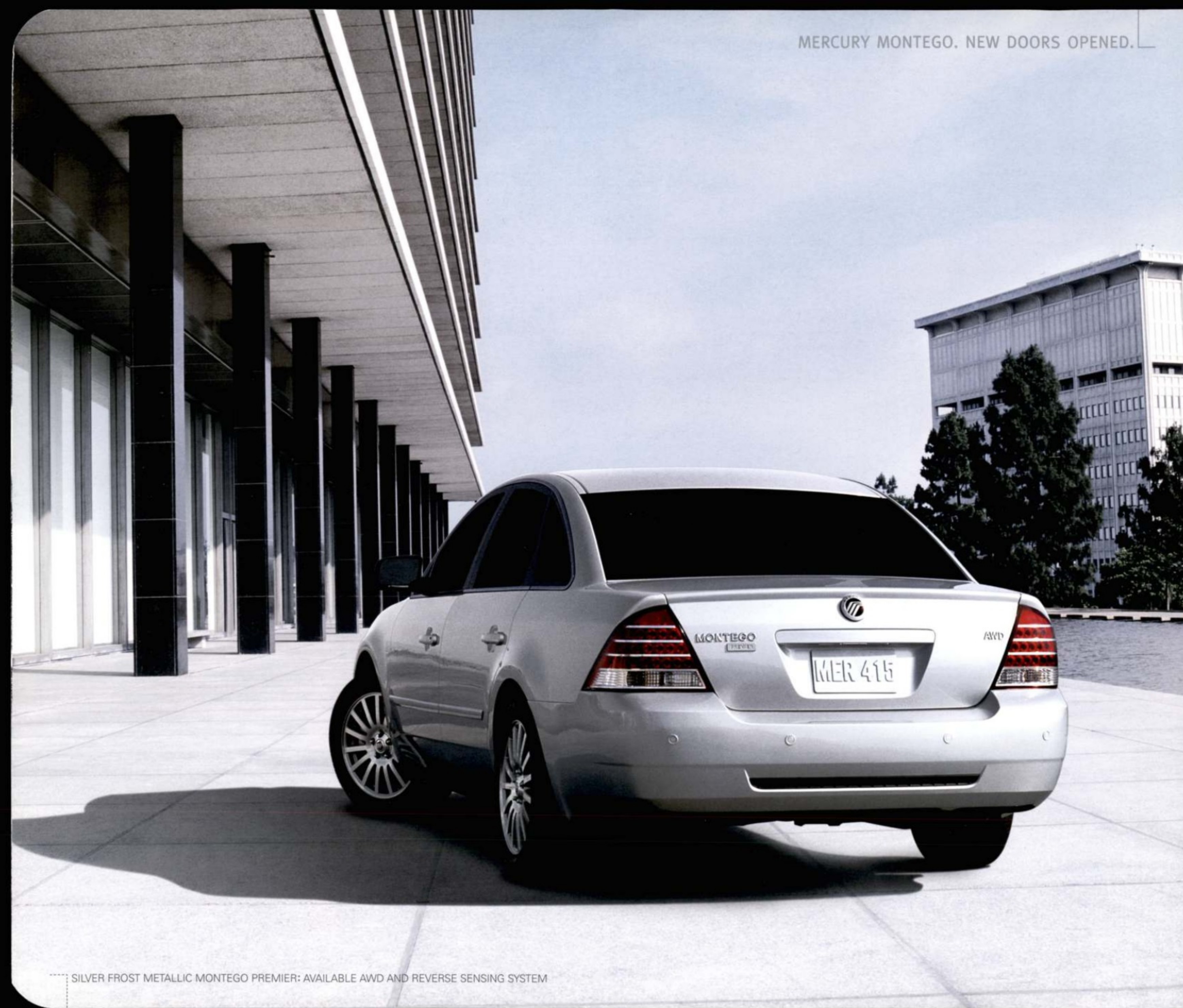
SILVER FROST METALLIC MONTEGO PREMIER: AVAILABLE AWD AND REVERSE SENSING SYSTEM

EXTERIOR PAINT AND INTERIOR FABRIC SWATCHES