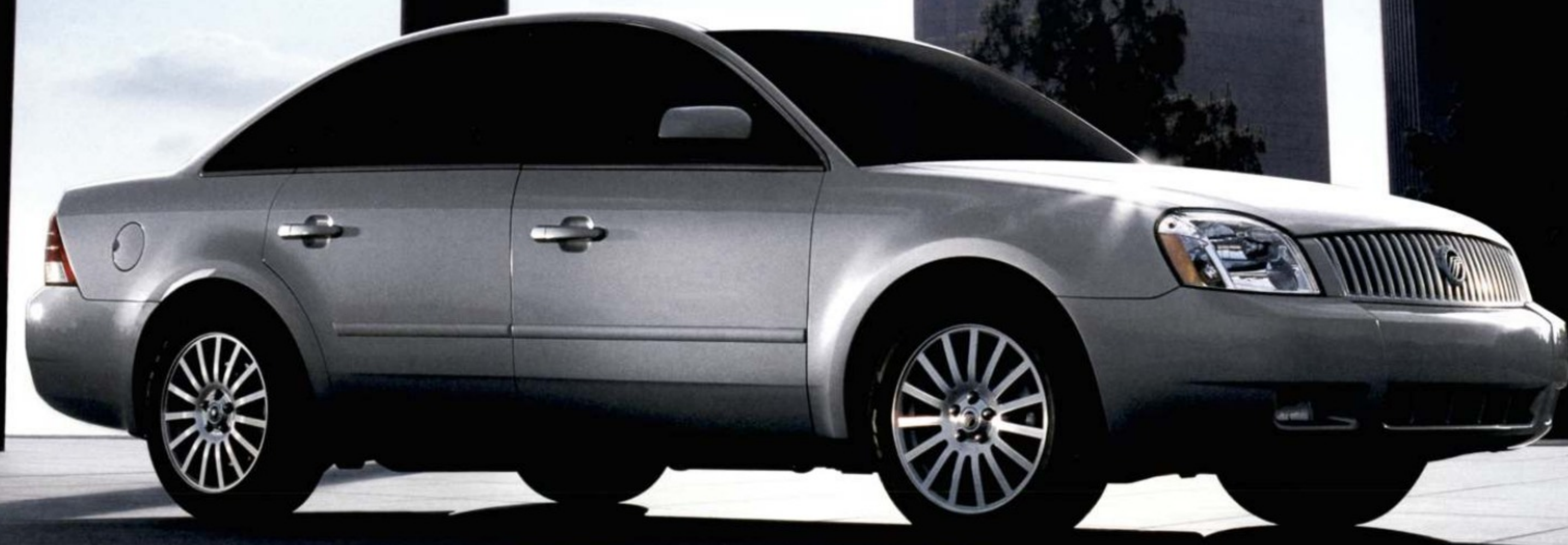
SILVER FROST METALLIC: MONTEGO PREMIER