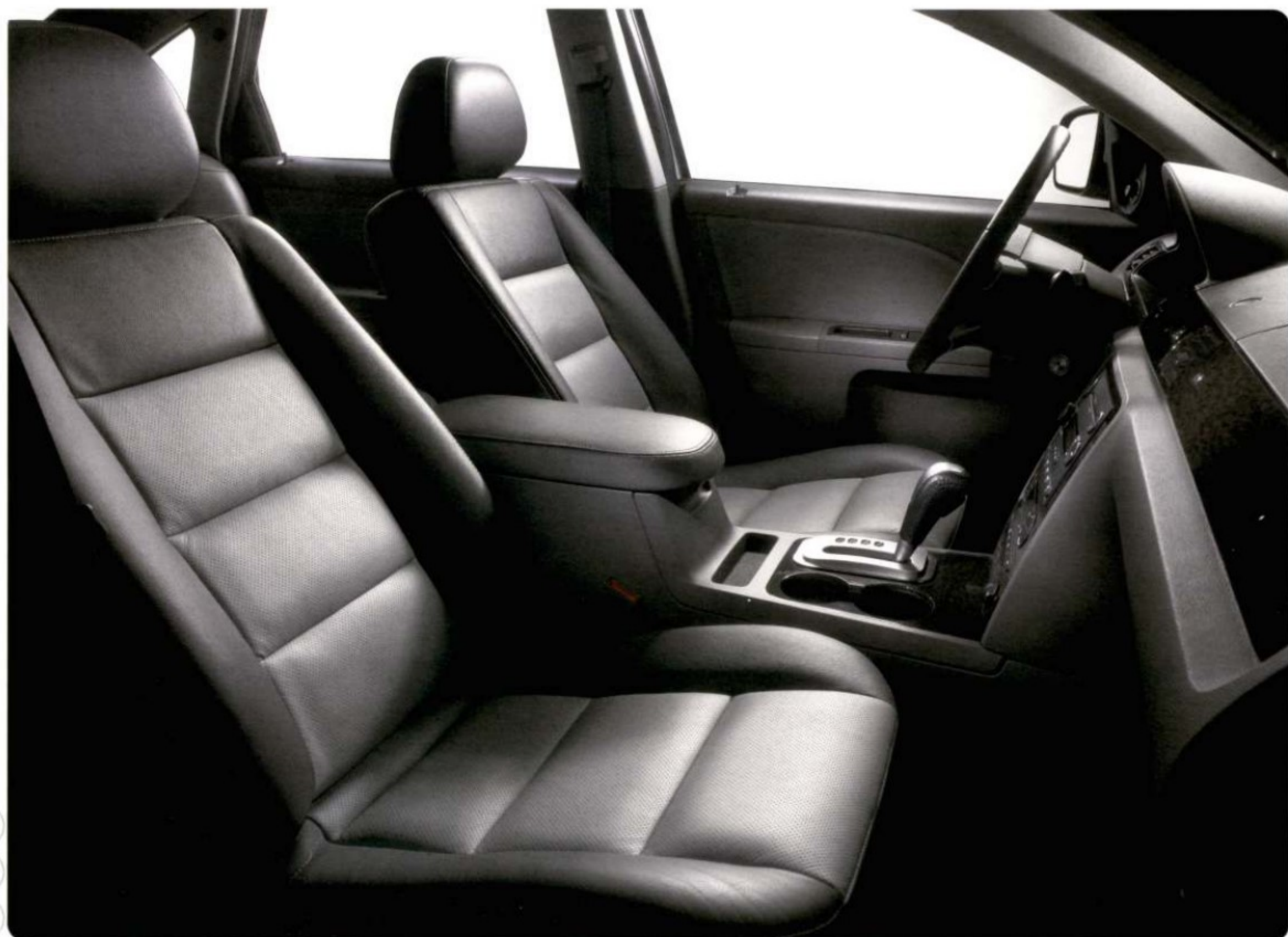
SHALE TWO-TONE LEATHER TRIM: MONTEGO PREMIER