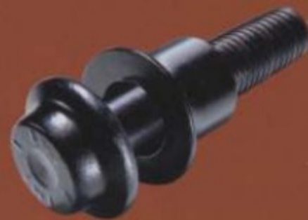
CLASS-EXCLUSIVE HUCK BOLTS

The best-selling line of commercial trucks just got stronger. Introducing the all-new 2006 Ford LCF. Its best-in-class* turning radius sets new standards for maneuverability on tight urban streets. A new 4.5L Power Stroke® V6 Diesel leads the class in horsepower and torque. Power 4-wheel disc anti-lock brakes are standard. And of course, it's Built Ford Tough, with the strongest standard frame and class-exclusive Huck Bolt™ construction for outstanding integrity and longevity. So if your list of must-haves includes visibility, maneuverability, operating ease and overall efficiency – look no further. Ford LCF is the right truck for you. As a bonus, you can order it in your choice of 9 vibrant exterior colors – no extra charge, no extra waiting.