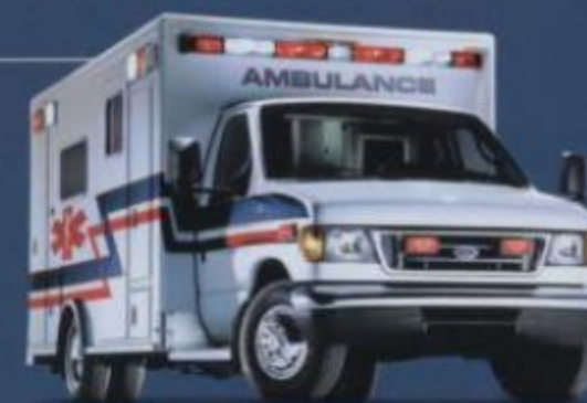
EMERGENCY RESPONSE VEHICLES 96% SHARE OF MARKET

Since it first arrived over 40 years ago, Ford E-Series has earned votes of confidence from thousands upon thousands of satisfied customers. That's because it handles so many jobs so well. Need to haul building materials to a construction site? E-Series can tow up to 5 tons with ease. Have to get 15 people to the airport? Here's a wagon that can take them all. Want choices? Only E-Series offers so many models and configurations, including Super Duty, Extended Length, Cutaway and Stripped Chassis. They say people vote with their wallets. Well, E-Series has been the leader* in sales for 26 years in a row.