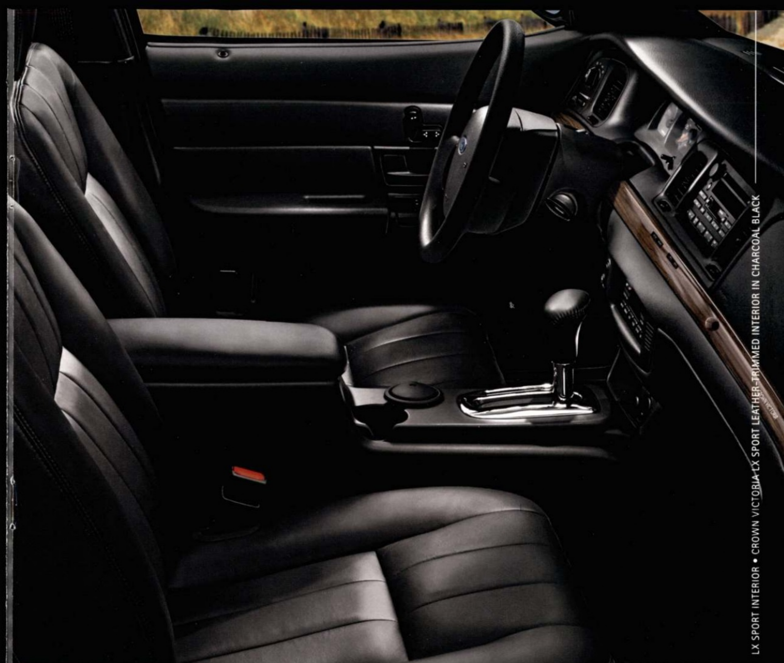
LX SPORT INTERIOR • CROWN VICTORIA LX SPORT LEATHER-TRIMMED INTERIOR IN CHARCOAL BLACK