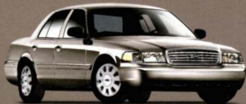
Crown Victoria LX in Arizona Beige Metallic with available equipment

Stretch out, relax and enjoy the bountiful space as you rediscover the road. Comfort and style: that's Crown Victoria LX. From the 8-way power driver and right-front-passenger seats and available driver and right-front-passenger power lumbar supports, to the available leather-wrapped steering wheel and the distinctive woodgrain-appearance trim, you'll revel in its luxurious touches.