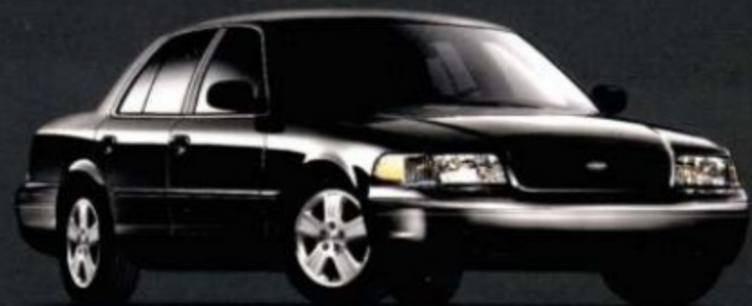
Crown Victoria LX Sport in Black

Remember when driving was fun? Well, it can be again with Crown Victoria LX Sport. Slip behind the wheel and take pleasure in the smooth, even ride, as the 239-hp 4.6L SEFI V8 engine supplies all the power and confidence you need. The clear analog instrumentation, center console shifter, and leather-wrapped steering wheel with speed control and secondary audio and climate controls all enhance your total driving experience. Luxurious leather-trimmed seating, Dual-Media audio system, Electronic Automatic Temperature Control, woodgrain and chromed accents, and overhead console with compass and map lights are included as well.