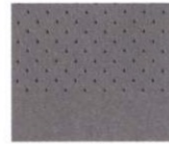
Medium Flint Grey Leather with Mini-Perf. insert Standard on Limited*