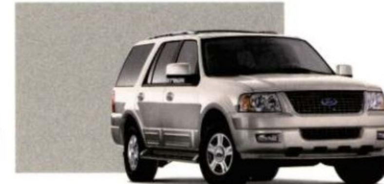
Cashmere Tri-Coat Metallic