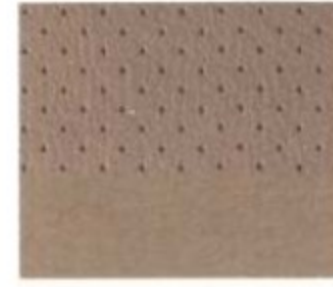
Medium Parchment Leather with Mini-Perf. insert Standard on Limited