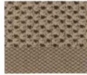
Medium Parchment Two-Tone Cloth Standard on XLT and XLT Sport