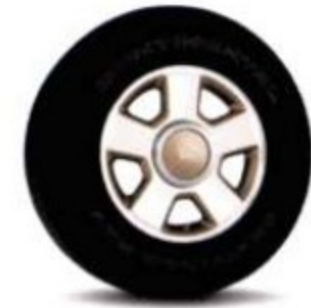
17" 5-Spoke Machined-Aluminum Wheel Standard on King Ranch