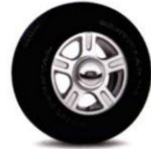
17" Machined-Aluminum Wheel Standard on Eddie Bauer