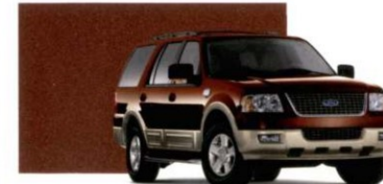
Dark Copper Metallic

Ford uses clearcoat paint for beauty and protection. Colors shown are representative only. Not all colors are available on all models. See your dealer for actual paint/trim options. Vehicles shown may contain optional equipment.