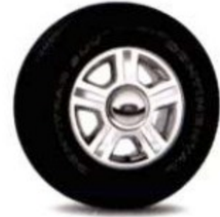
17" Chrometec Aluminum Wheel Standard on Limited