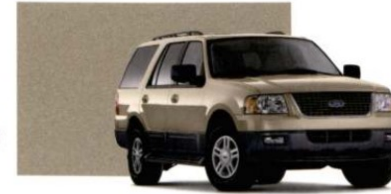
Pueblo Gold Metallic