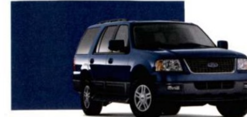
Medium Wedgewood Blue Metallic