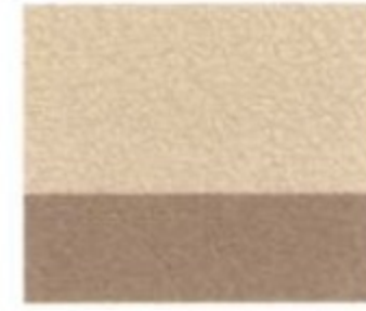
Medium Parchment Two-Tone Leather Standard on Eddie Bauer