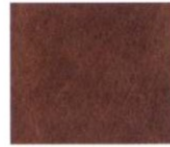
Medium Parchment environment features Castaño Leather Standard on King Ranch