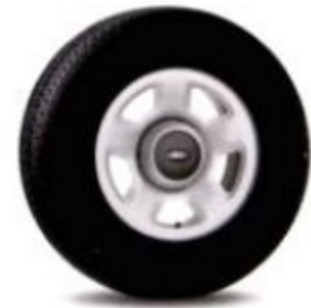
17" Painted-Steel Wheel Standard on XLS