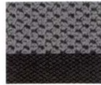
Medium Flint Grey Two-Tone Cloth Standard on XLS, XLT and XLT Sport