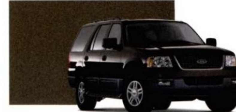
Dark Stone Metallic