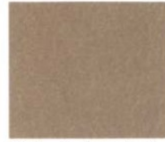
Medium Parchment Leather Optional on XLT and XLT Sport