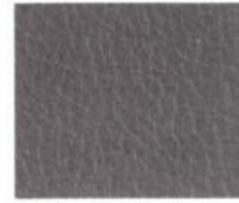
Medium Flint Grey Leather Optional on XLT and XLT Sport