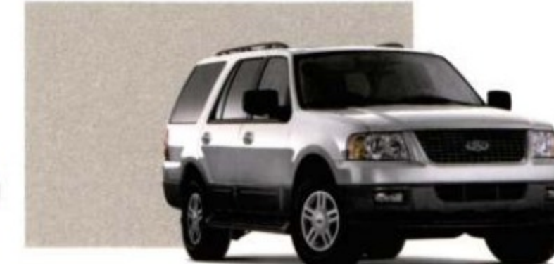
Silver Birch Metallic