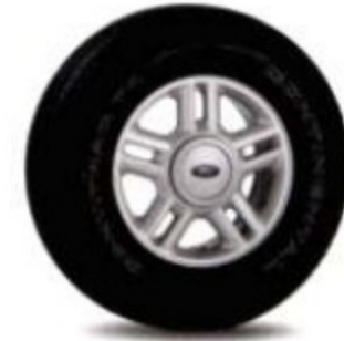
17" Aluminum Wheel Standard on XLT and XLT Sport