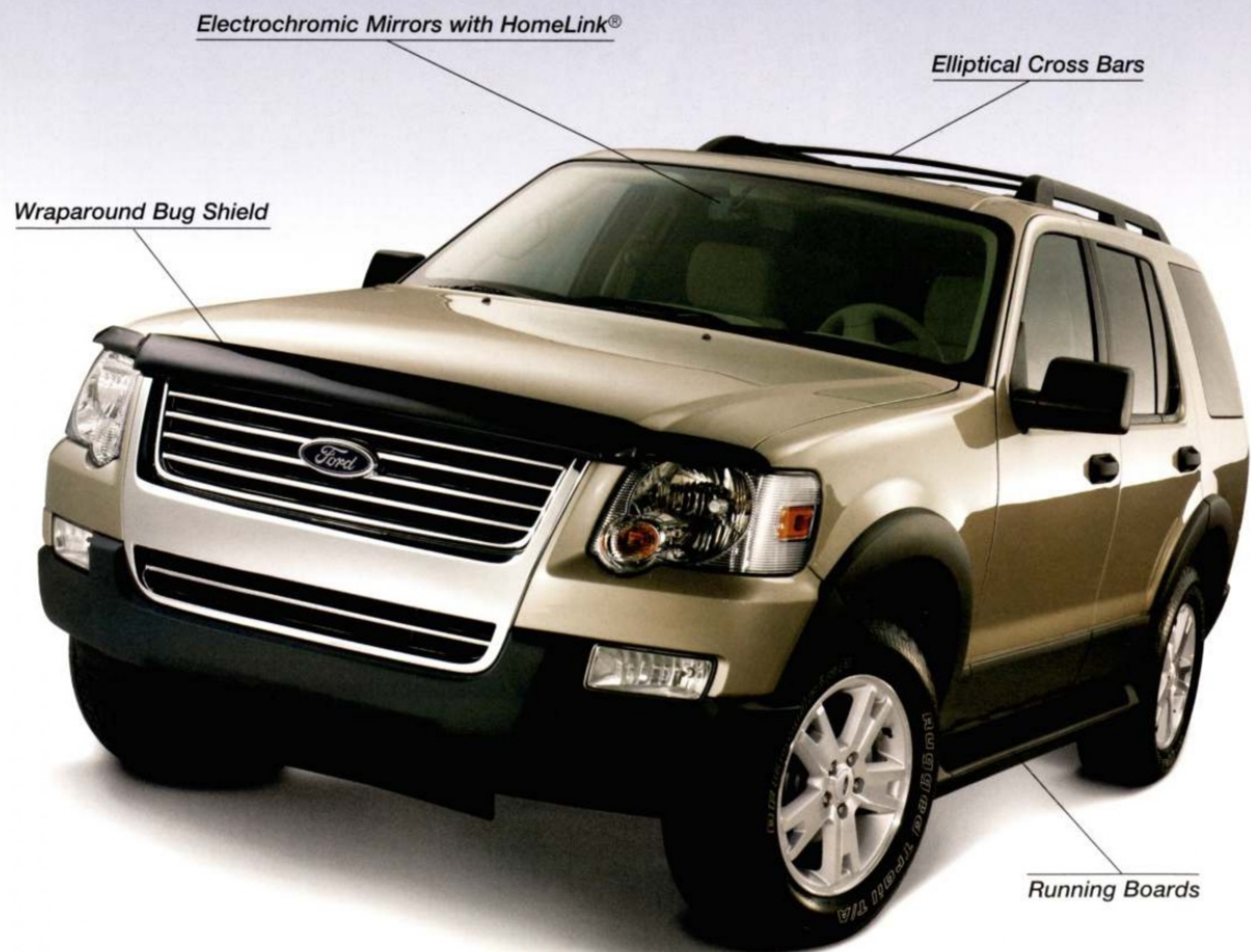
Electrochromic Mirrors with HomeLink®