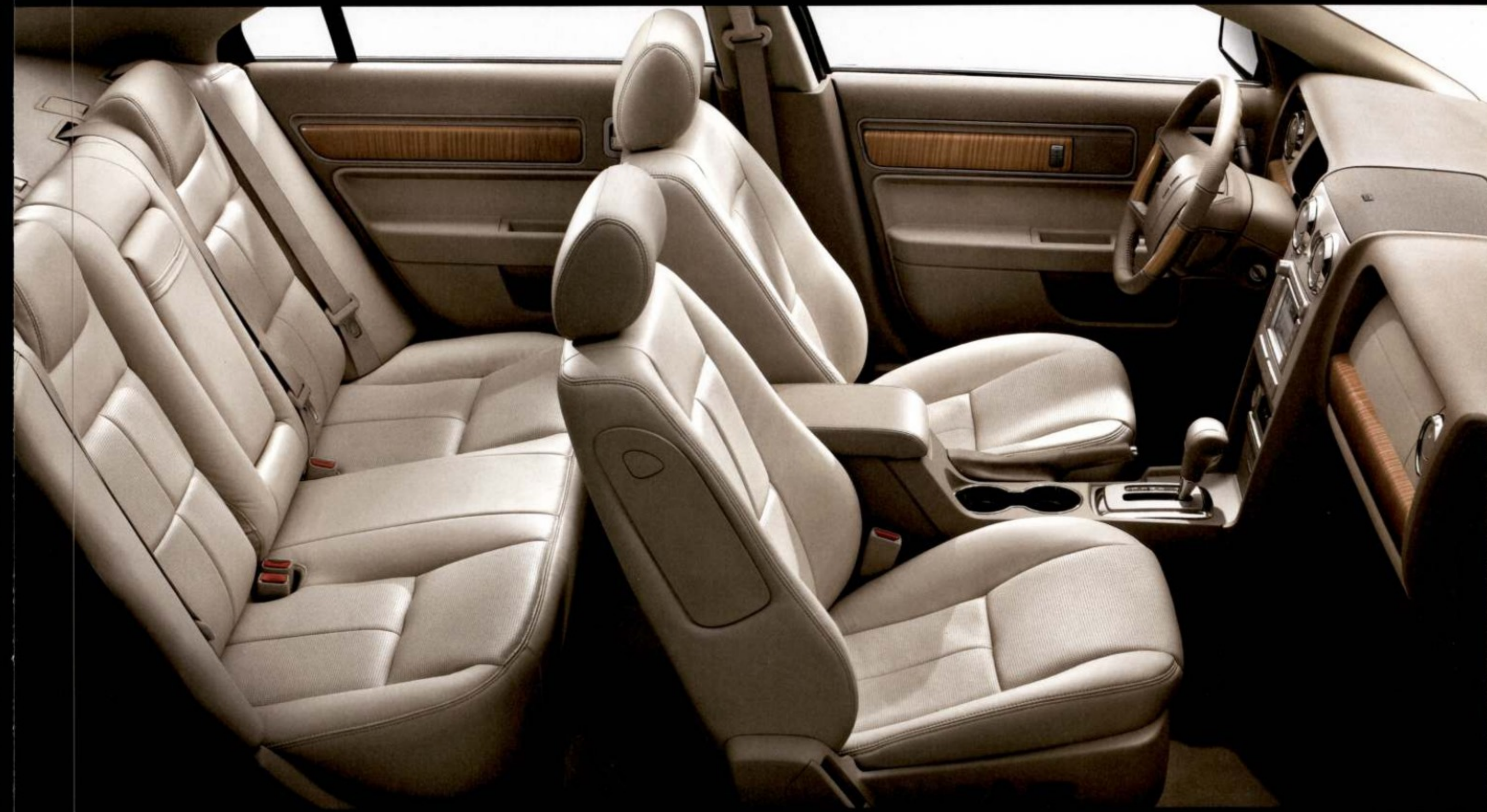
With 10-way power, heated driver and front-passenger seats, you might never want to leave Zephyr's sumptuous leather-trimmed interior. Shown with available equipment.

FOR MORE INFORMATION, PLEASE VISIT WWW.LINCOLN.COM OR DETACH AND MAIL THIS CARD.