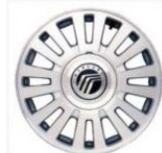
16" 16-SPOKE MACHINED-ALUMINUM Standard on LS Premium and LS Ultimate