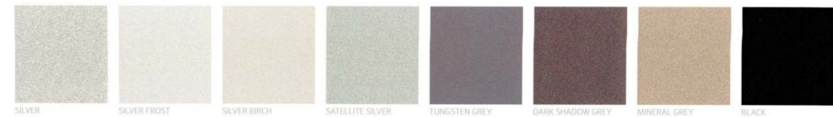
SILVER SILVER FROST SILVER BIRCH SATELLITE SILVER TUNGSTEN GREY DARK SHADOW GREY MINERAL GREY BLACK