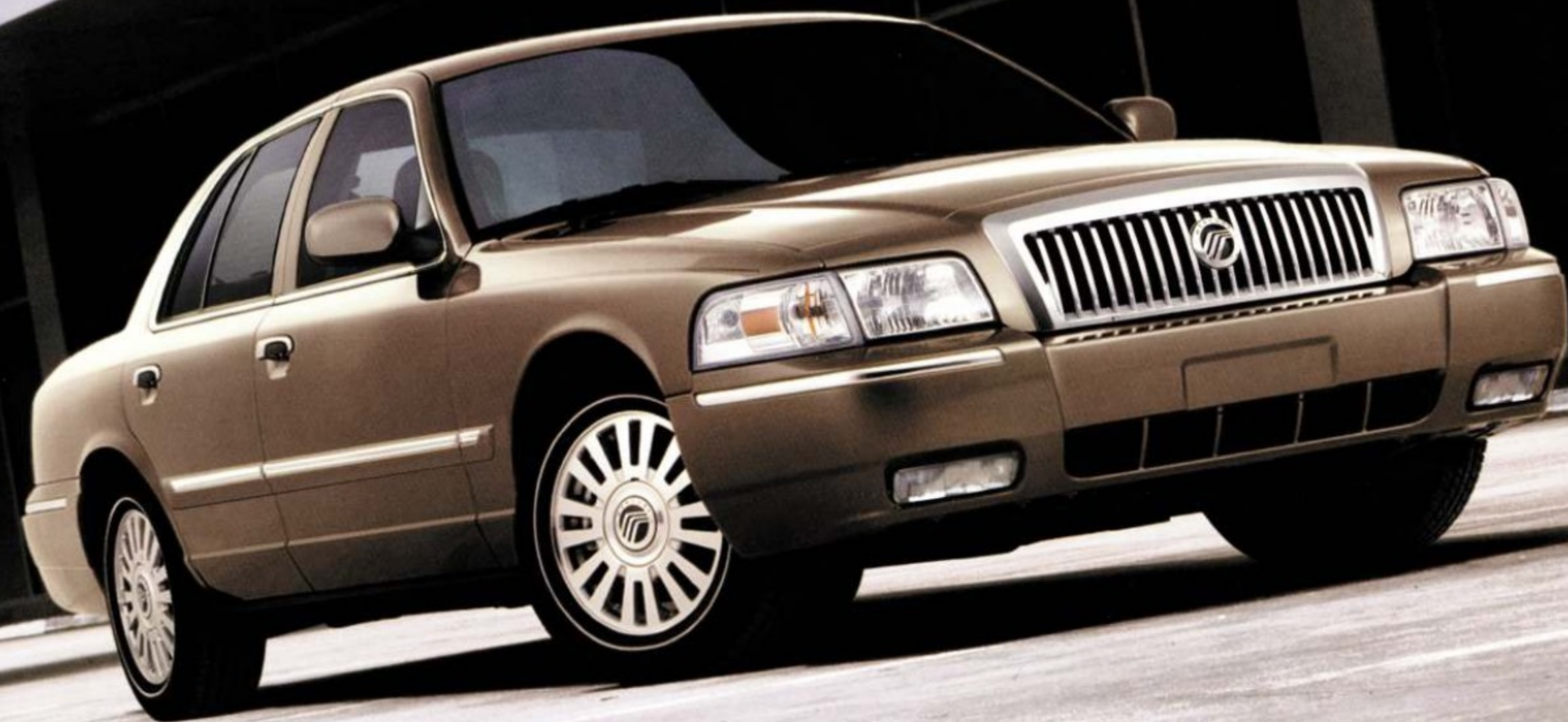
ARIZONA BEIGE METALLIC: GRAND MARQUIS LS PREMIUM WITH AVAILABLE EQUIPMENT

3 little words for 1 very big trunk: best-in-class.