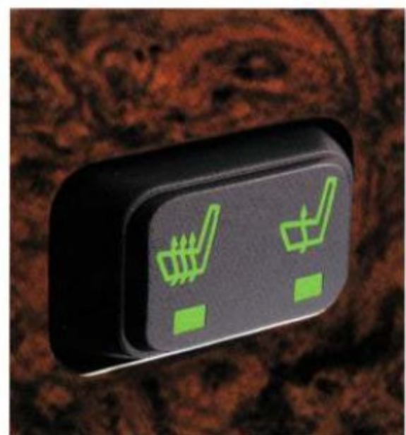
HEATED FRONT SEATS