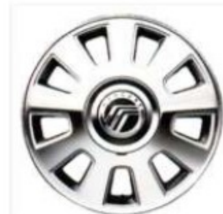
16" 9-SPOKE CHROMED Available on LS Premium, LS Ultimate and Limited Edition