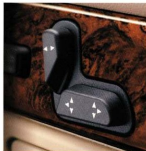
POWER DRIVER'S SEAT