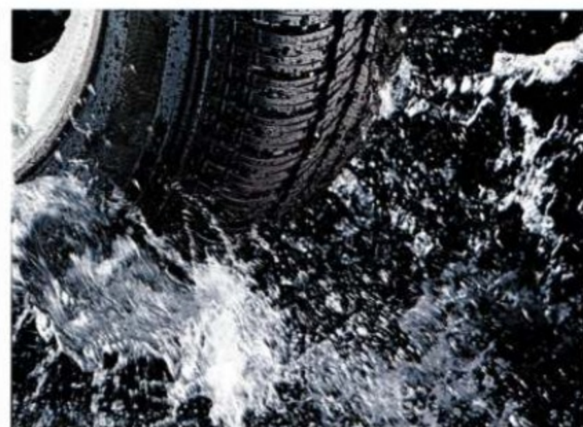
ANTI-LOCK BRAKE SYSTEM