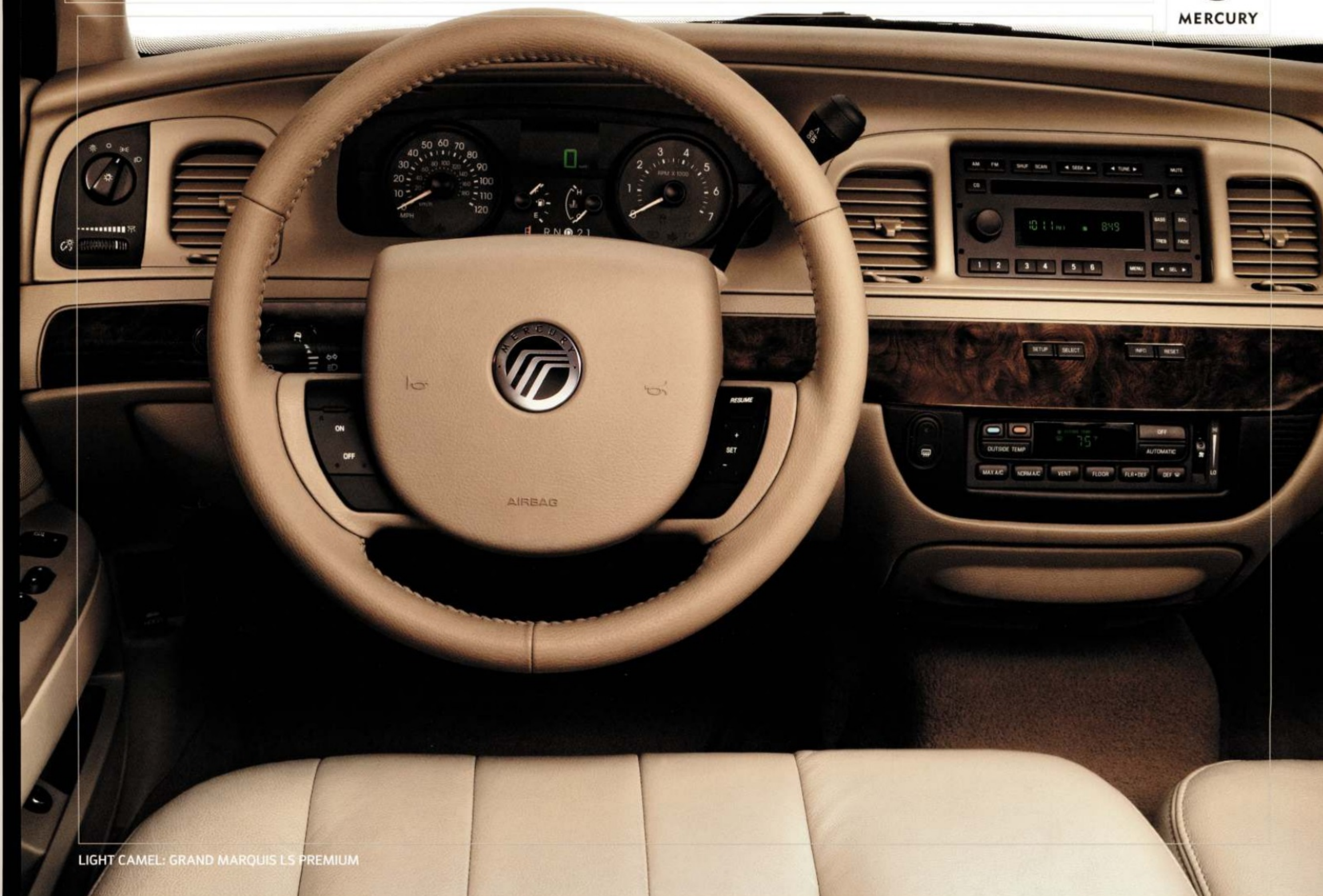
LIGHT CAMEL: GRAND MARQUIS LS PREMIUM