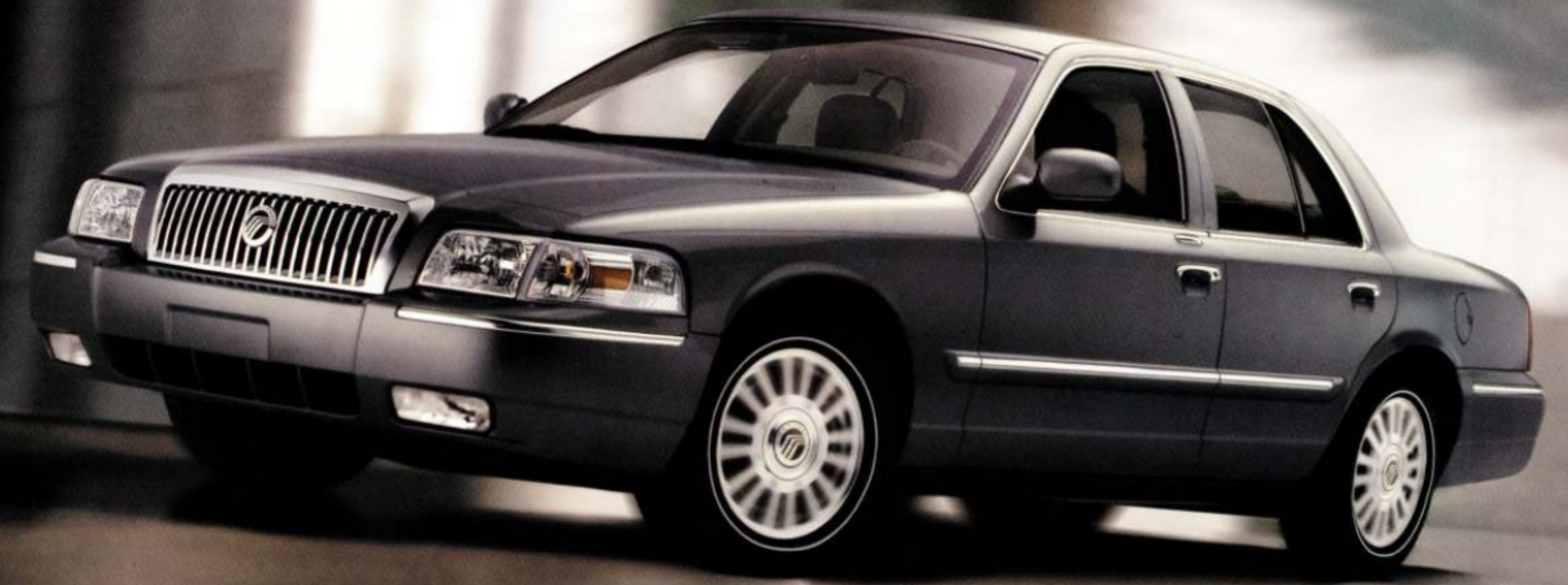
TUNGSTEN GREY METALLIC: GRAND MARQUIS LS PREMIUM WITH AVAILABLE EQUIPMENT