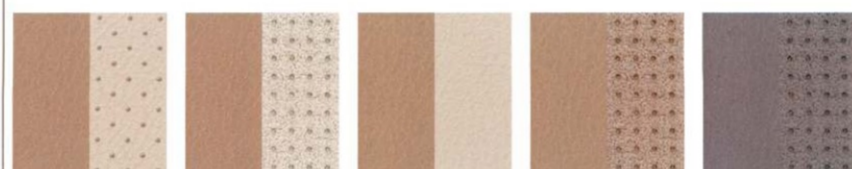
PEBBLE/LIGHT PARCHMENT PERFORATED INSERTS PEBBLE/LIGHT PARCHMENT PREFERRED SUEDE INSERTS PEBBLE/LIGHT PARCHMENT TWO-TONE PEBBLE TWO-TONE WITH MINI-PERFORATED INSERTS SHALE TWO-TONE WITH MINI-PERFORATED INSERTS