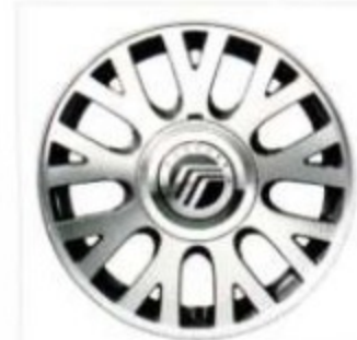
16" SPLIT-SPOKE ALUMINUM Standard on Handling Package