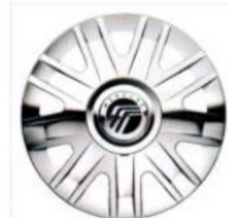
16" CHROMED WHEEL COVERS Standard on GS and GS Convenience