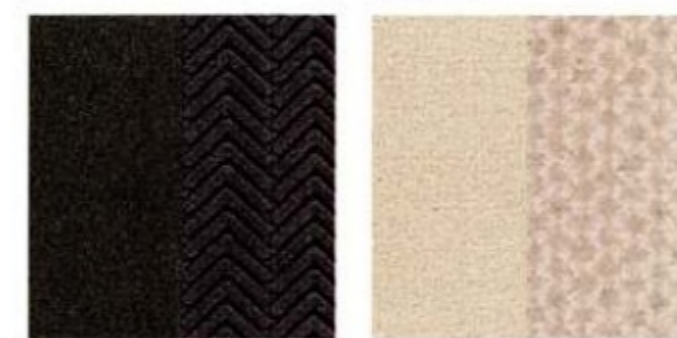
DARK CHARCOAL LIGHT CAMEL TWO-TONE