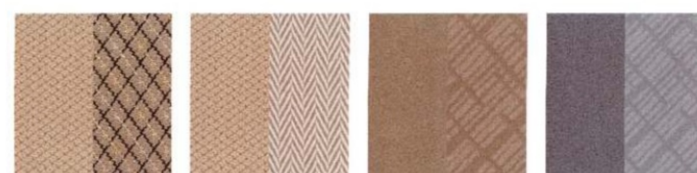
PEBBLE PEBBLE/LIGHT PARCHMENT INSERTS PEBBLE TWO-TONE SHALE TWO-TONE