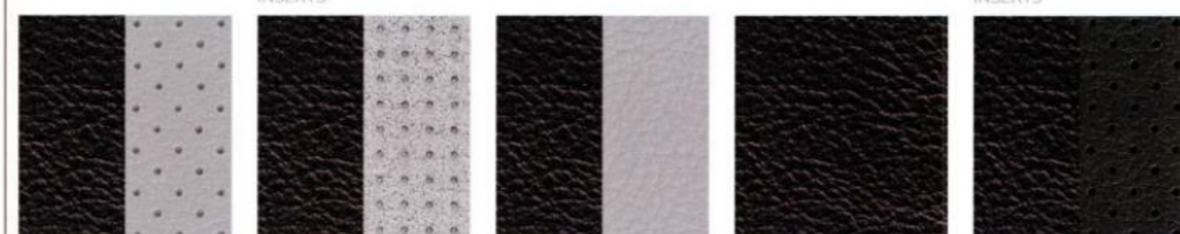
CHARCOAL/LIGHT FLINT PERFORATED INSERTS CHARCOAL/LIGHT FLINT PREFERRED SUEDE INSERTS CHARCOAL/LIGHT FLINT TWO-TONE CHARCOAL BLACK CHARCOAL BLACK WITH PERFORATED INSERTS