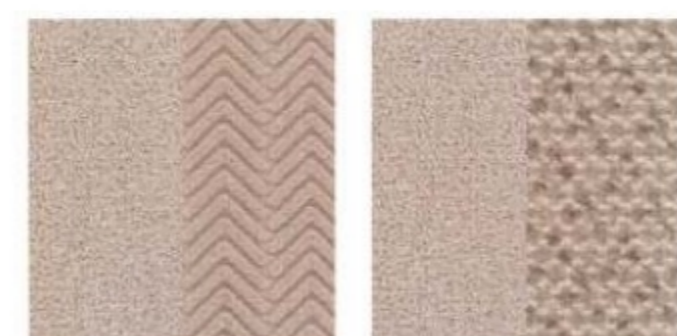
MEDIUM LIGHT STONE MEDIUM LIGHT STONE TWO-TONE