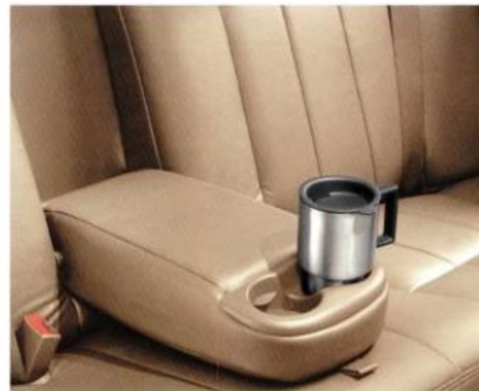
REAR-SEAT CENTER ARMREST