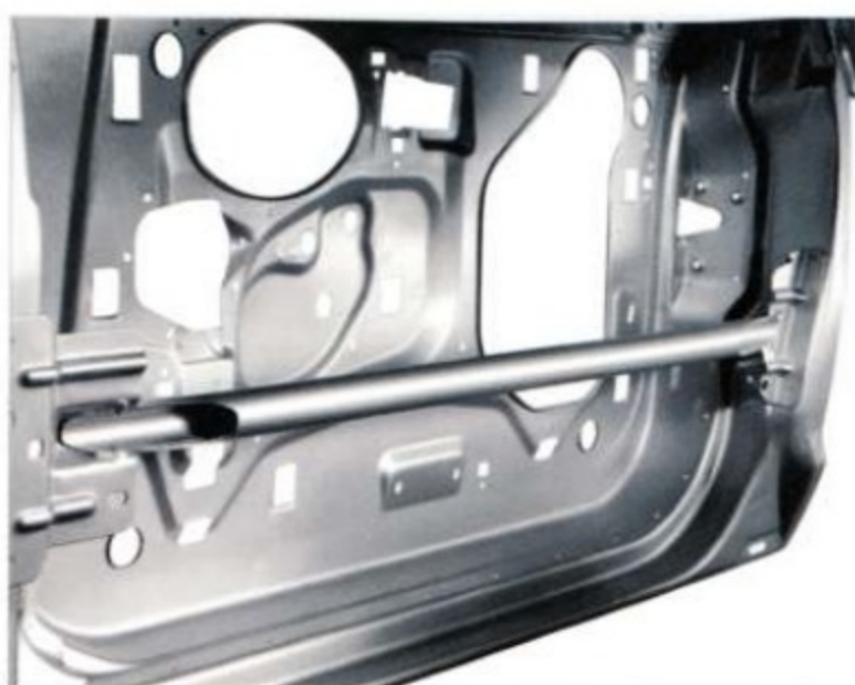
SIDE-INTRUSION DOOR BEAMS