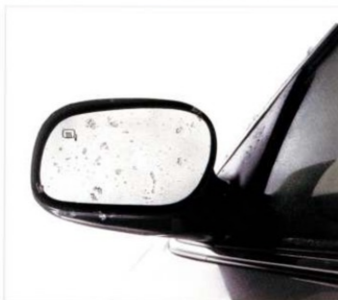
POWER, HEATED MIRRORS

Grand Marquis brings you some of the most advanced, reliable, and effective safety and security technologies on the road. For your peace of mind, we're more than happy to provide them.