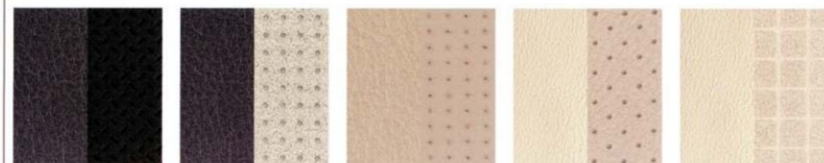
BLACK WITH DIAMOND PLATE INSERTS BLACK/LIGHT PARCHMENT PREFERRED SUEDE® INSERTS CAMEL CAMEL WITH PERFORATED INSERTS CAMEL/SAND EMBOSSED PREFERRED SUEDE INSERTS