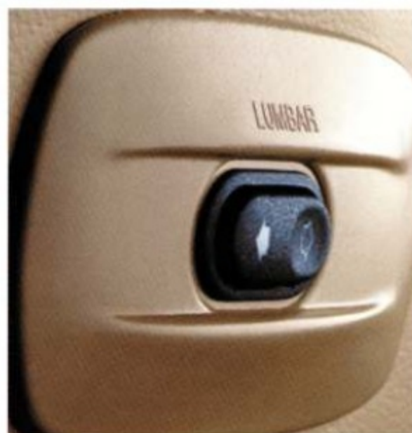
POWER DRIVER'S LUMBAR