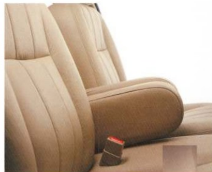
FRONT CENTER ARMRESTS