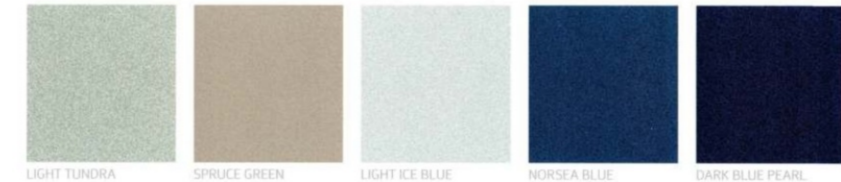
LIGHT TUNDRA SPRUCE GREEN LIGHT ICE BLUE NORSEA BLUE DARK BLUE PEARL