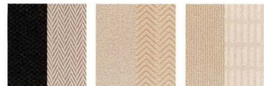
BLACK/LIGHT PARCHMENT INSERTS CAMEL CAMEL/SAND INSERTS