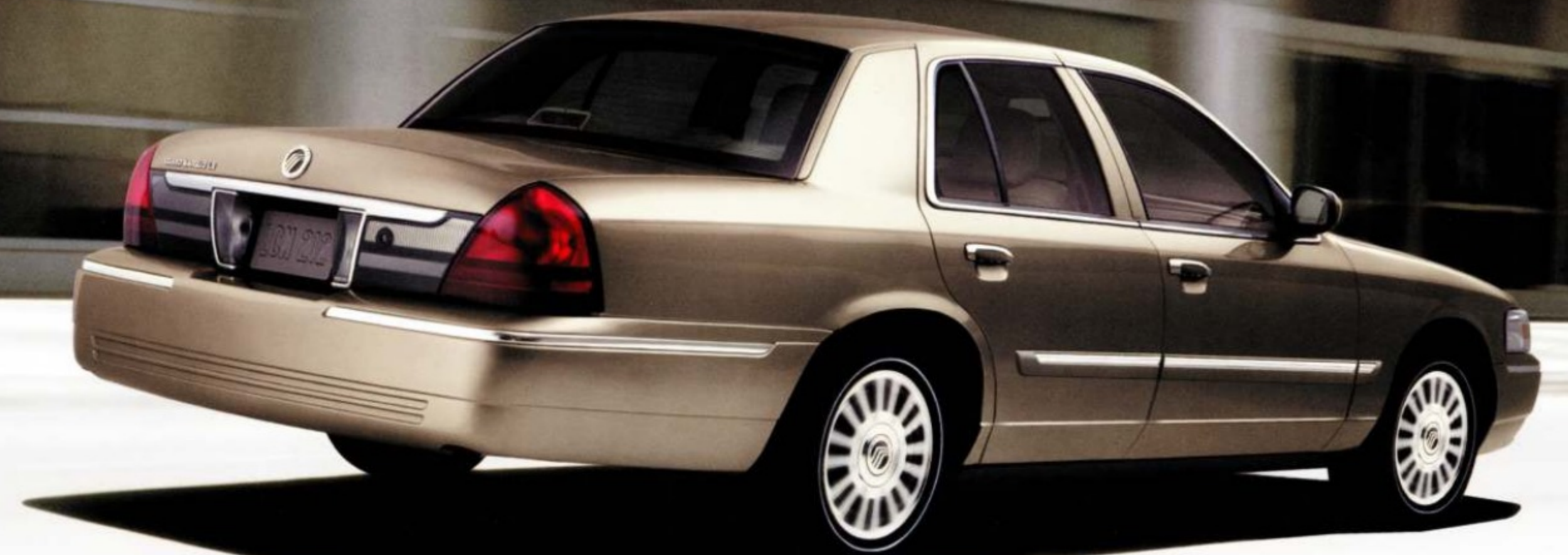
ARIZONA BEIGE METALLIC: GRAND MARQUIS LS PREMIUM