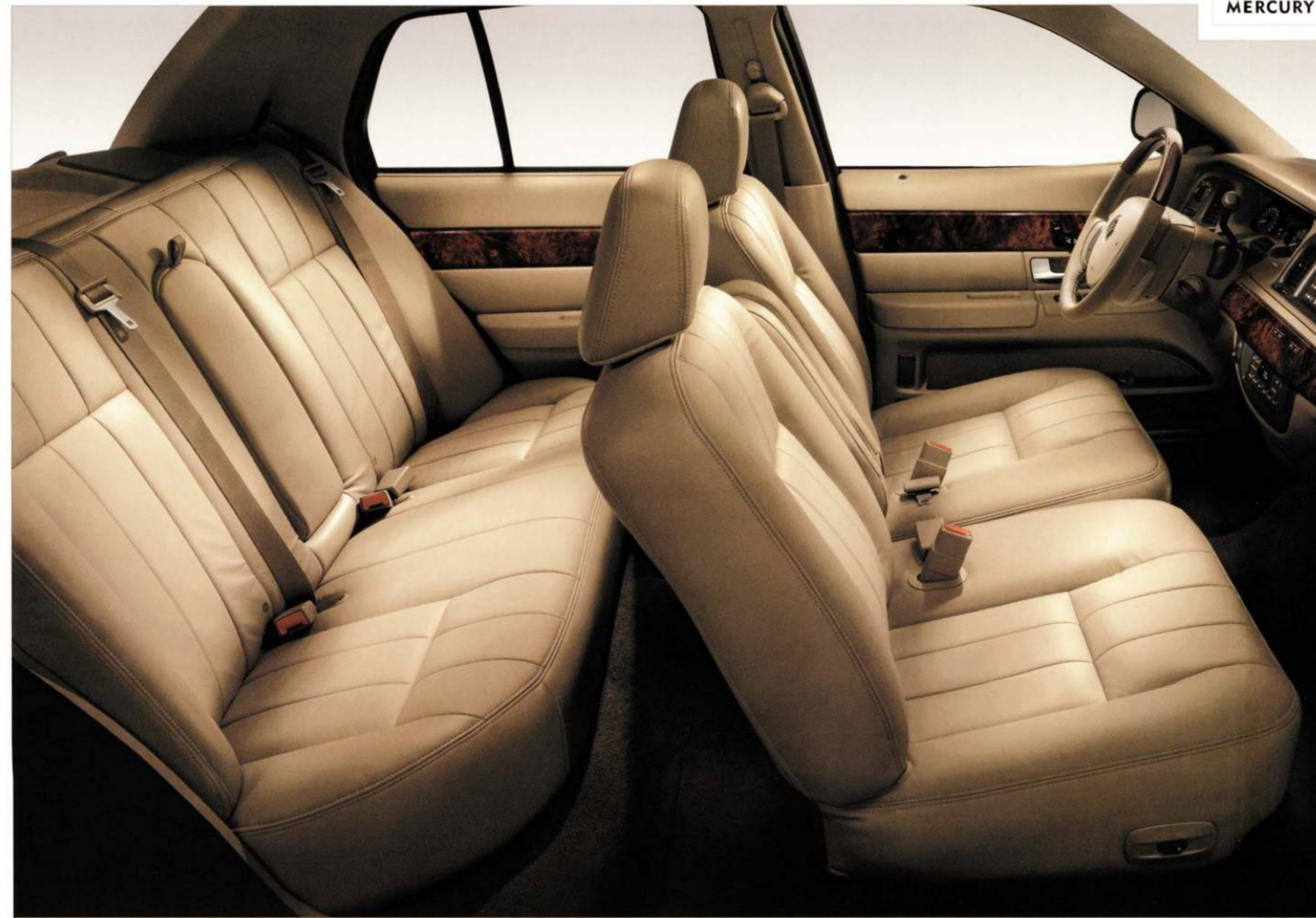
LIGHT CAMEL: GRAND MARQUIS LS ULTIMATE