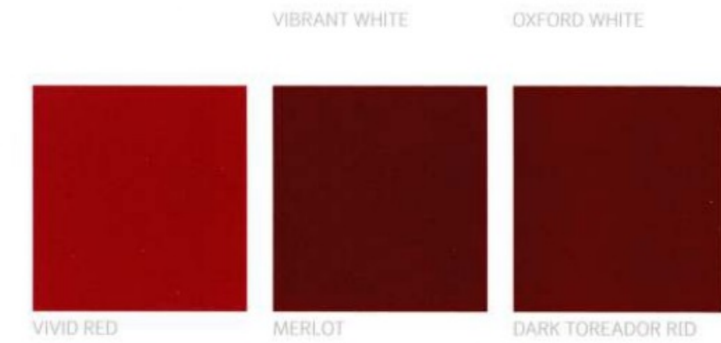
VIBRANT WHITE OXFORD WHITE VIVID RED MERLOT DARK TREADOR RID