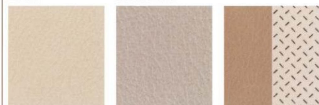
LIGHT CAMEL MEDIUM LIGHT STONE PEBBLE/LIGHT PARCHMENT DIAMOND PLATE INSERTS