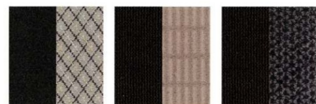
CHARCOAL/MEDIUM FLINT TWO-TONE CHARCOAL BLACK/MEDIUM LIGHT STONE INSERTS CHARCOAL BLACK TWO-TONE