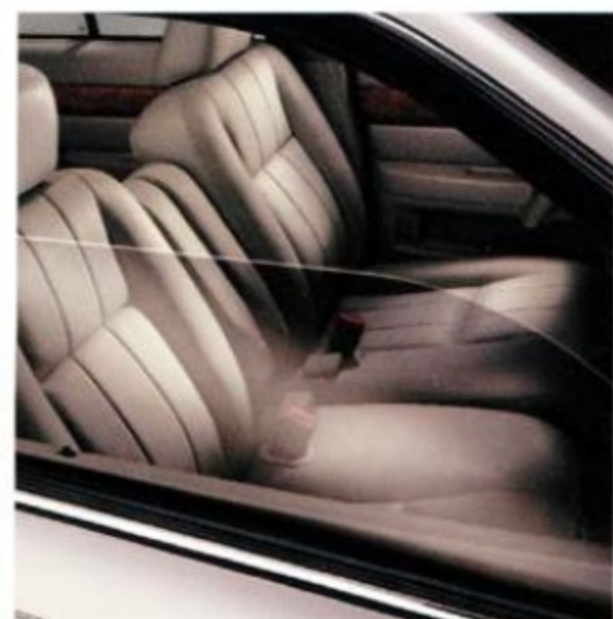
LAMINATED SIDE-WINDOW GLASS