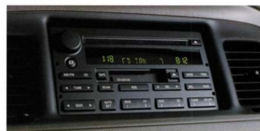
AUDIO SYSTEMS (DUAL-MEDIA SOUND SYSTEM SHOWN)

A range of audio systems accommodate your tastes in music as well as audio formats. All can play CDs with high-definition digital fidelity. The Dual-Media Sound System plays cassettes as well, while the Audiophile® Sound System includes a 6-disc CD changer. (See specifications for system availabilities.)