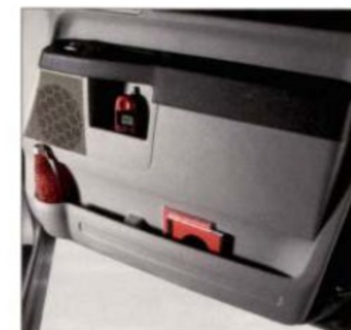
FRONT DOOR STORAGE