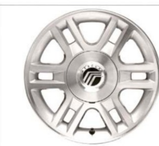
16" 6-SPLIT-SPOKE BRIGHT MACHINED-ALUMINUM Standard