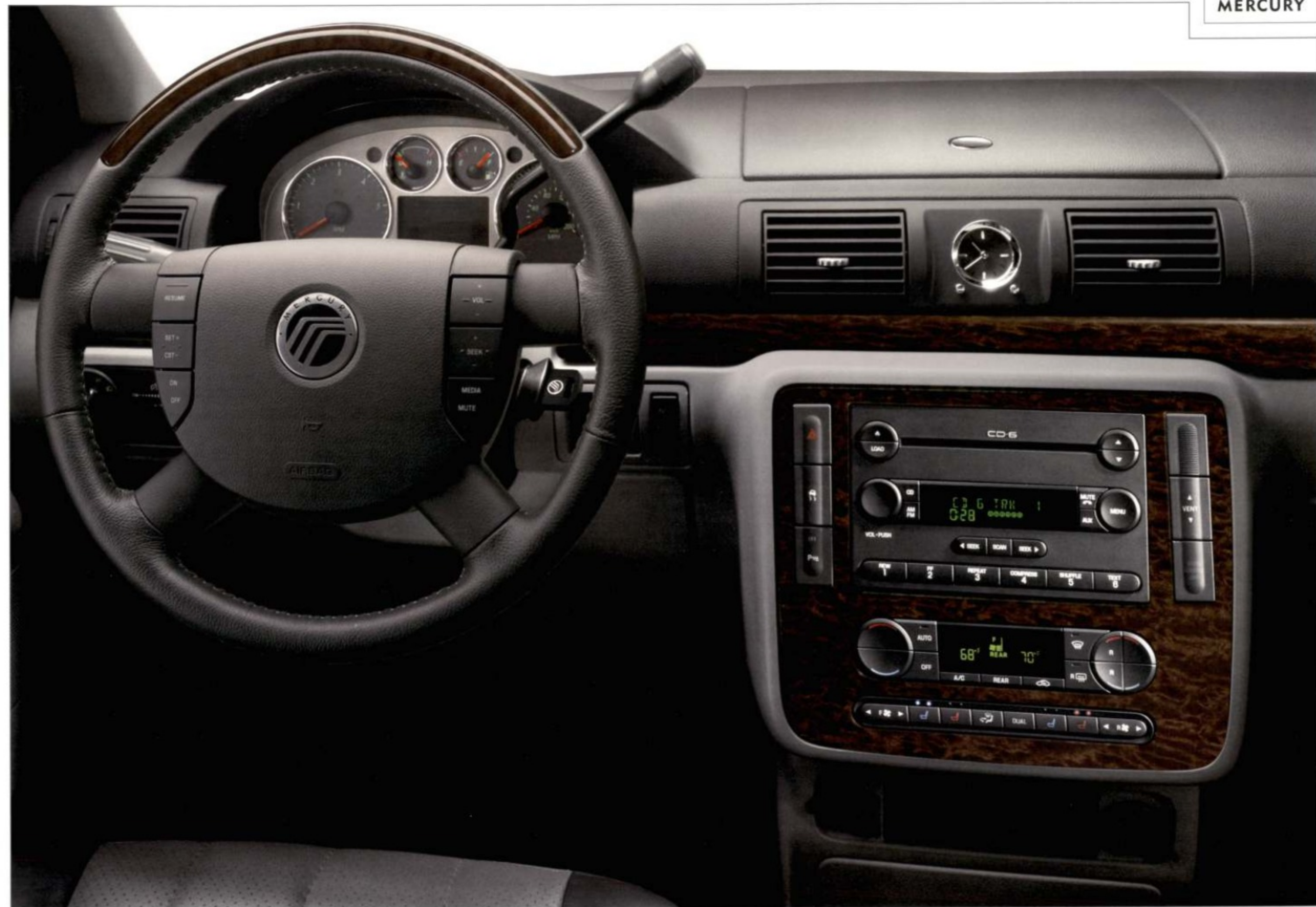
STANDARD WOOD- AND LEATHER-TRIMMED STEERING WHEEL (INTERIOR SHOWN WITH AVAILABLE EQUIPMENT)