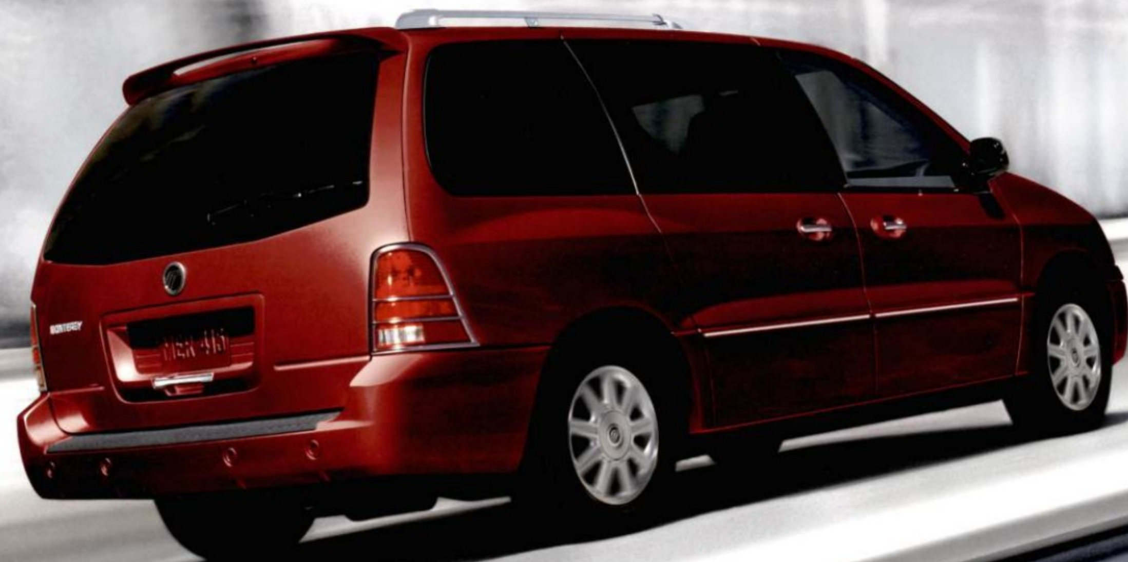
DARK TOREADOR RED METALLIC: MONTEREY WITH AVAILABLE EQUIPMENT