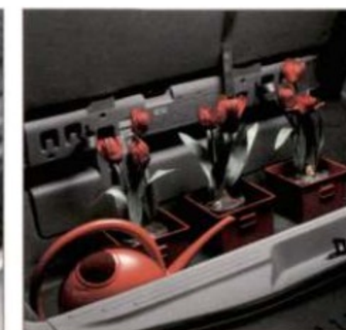
CARGO STORAGE WELL