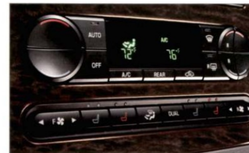
TRI-ZONE CLIMATE CONTROL