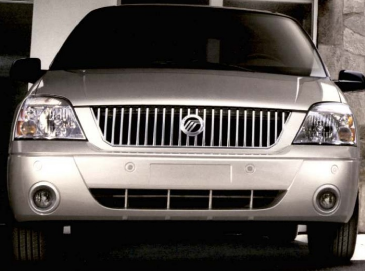
SILVER BIRCH METALLIC; MONTEREY