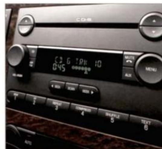
PREMIUM SOUND SYSTEM