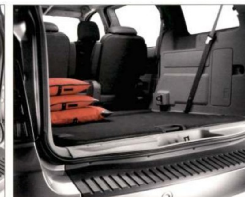
CREATING 71.6 CU. FT. OF CARGO SPACE

In here, just taking your seat is extraordinary.