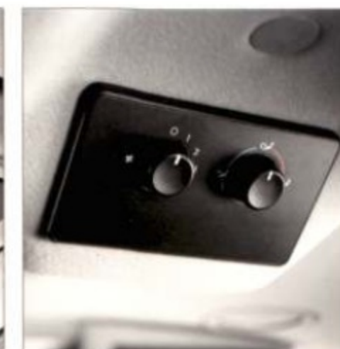
REAR CLIMATE CONTROLS