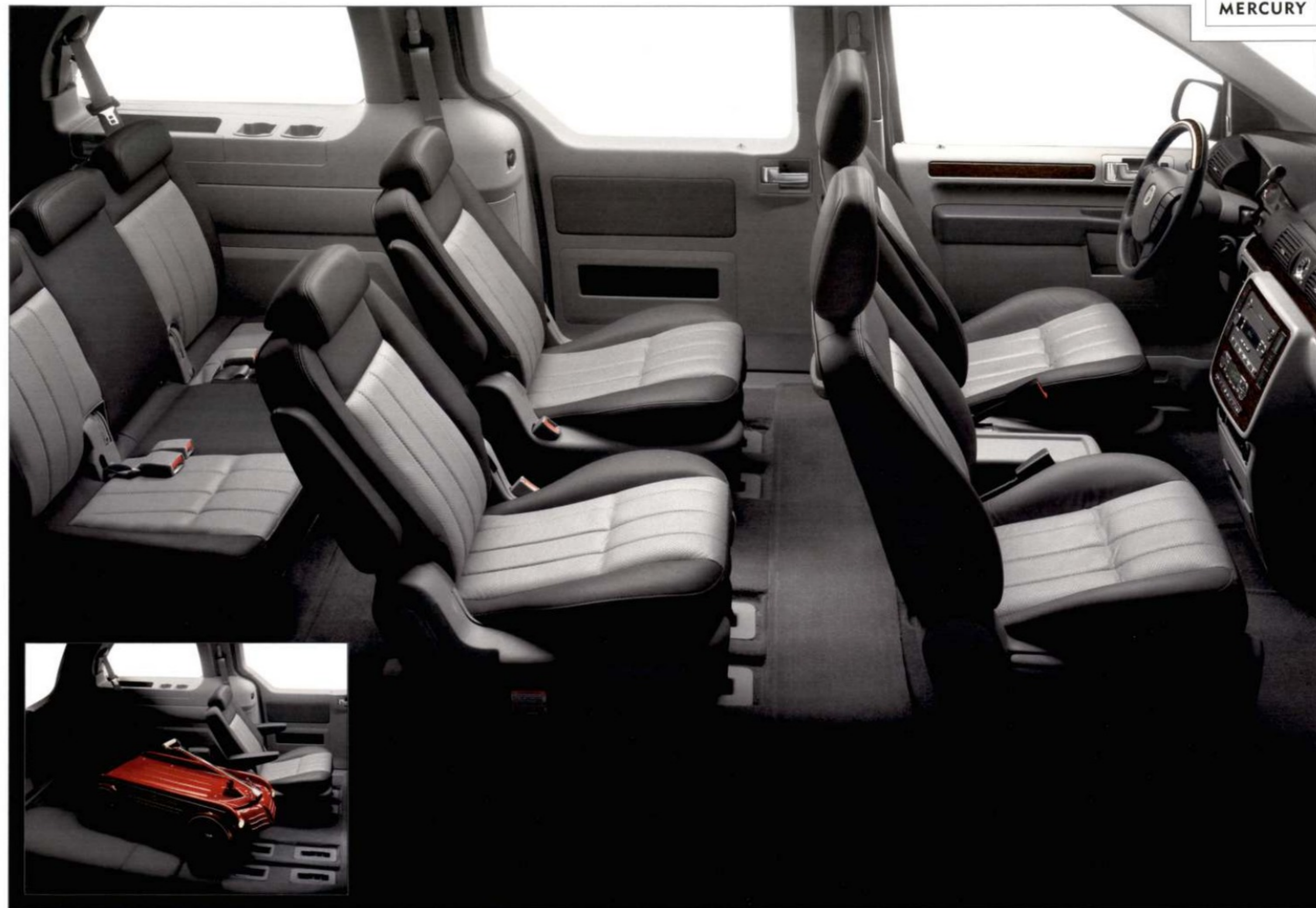
AVAILABLE LEATHER-TRIMMED SEATS IN CHARCOAL WITH LIGHT FLINT PERFORATED INSERTS