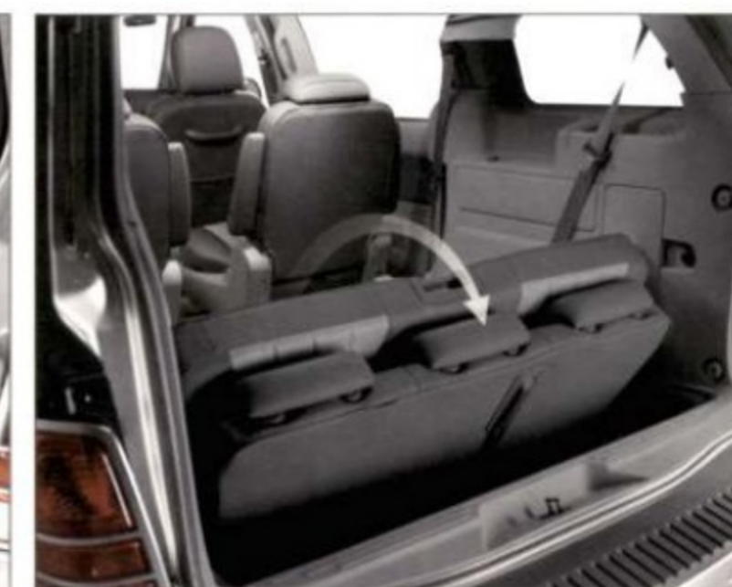
FOLDS FLAT INTO THE FLOOR...