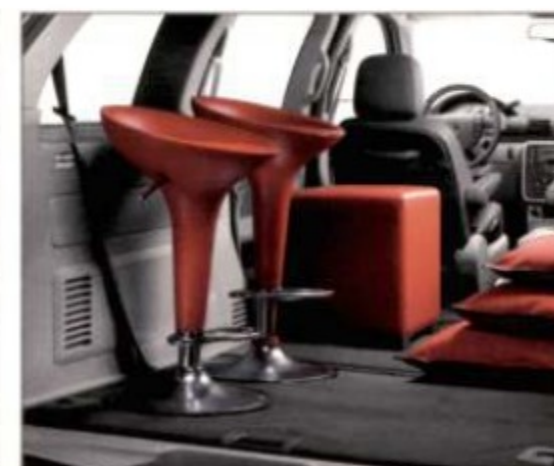
131.6 CU. FT. OF CARGO SPACE