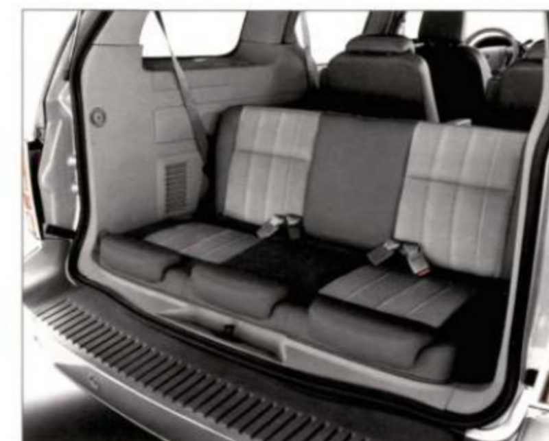
3RD-ROW TAILGATE BENCH SEAT...