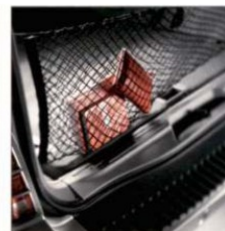
REAR CARGO NET