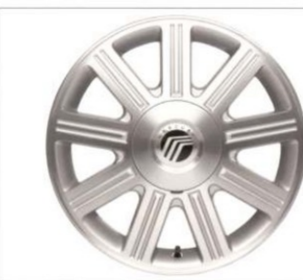
17" 9-SPOKE BRIGHT MACHINED-ALUMINUM Available