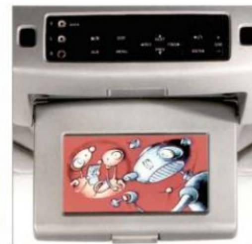
DVD ENTERTAINMENT SYSTEM