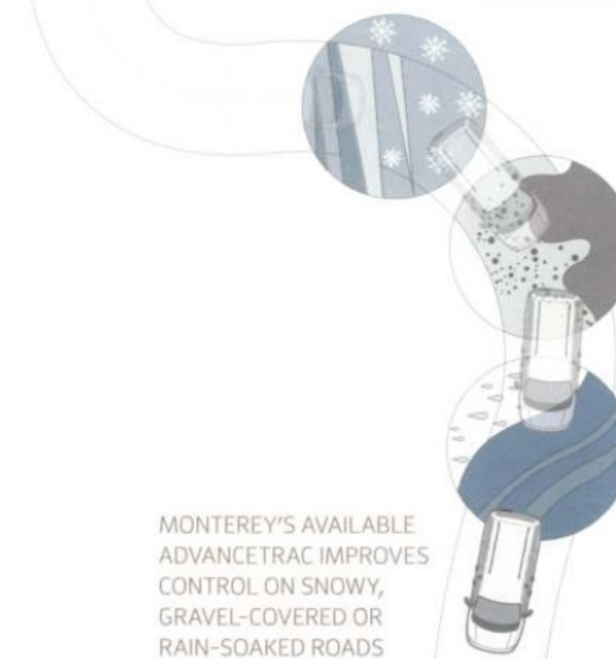
MONTEREY'S AVAILABLE ADVANCETRAC IMPROVES CONTROL ON SNOWY, GRAVEL-COVERED OR RAIN-SOAKED ROADS

You place a premium on safety. We do too.