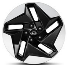
17" Aero alloy wheel