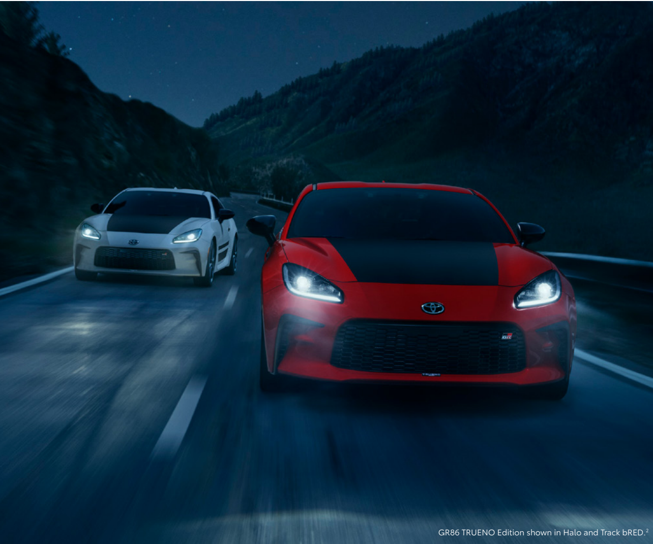
GR86 TRUENO Edition shown in Halo and Track bRED. 2