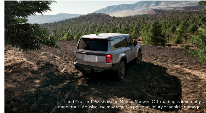
Land Cruiser 1958 shown in Meteor Shower. Off-roading is inherently dangerous. Abusive use may result in personal injury or vehicle damage.