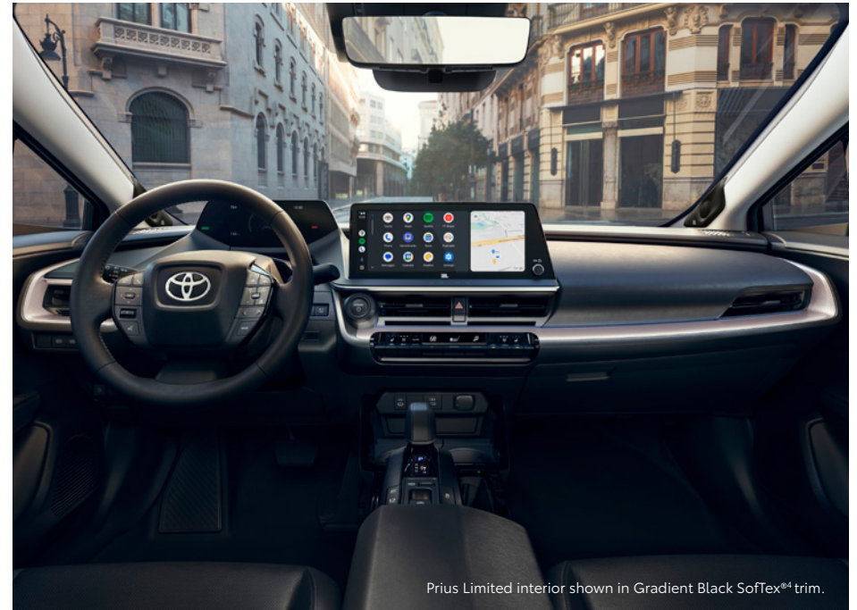
Prius Limited interior shown in Gradient Black SofTex ®4 trim.

Stunning design and an inspiring drive, with the advanced tech, fuel efficiency and reliability you've come to know and trust.