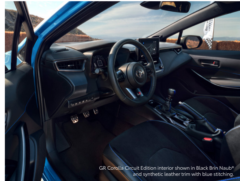
GR Corolla Circuit Edition interior shown in Black Brin Naub® and synthetic leather trim with blue stitching.