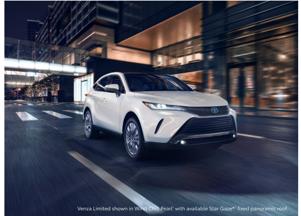
Venza Limited shown in Wind Chill Pearl 1 with available Star Gaze 87 fixed panoramic roof.

This all-hybrid crossover rides in a league of its own, with its elegant style, tech-focused interior and AWD performance. Explore beyond the ordinary in Venza.