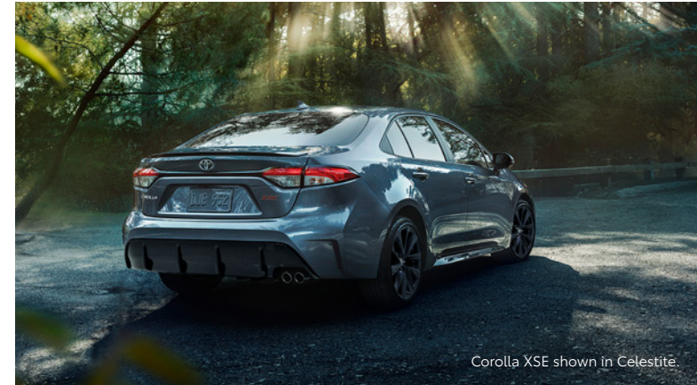
Corolla XSE shown in Celestite.