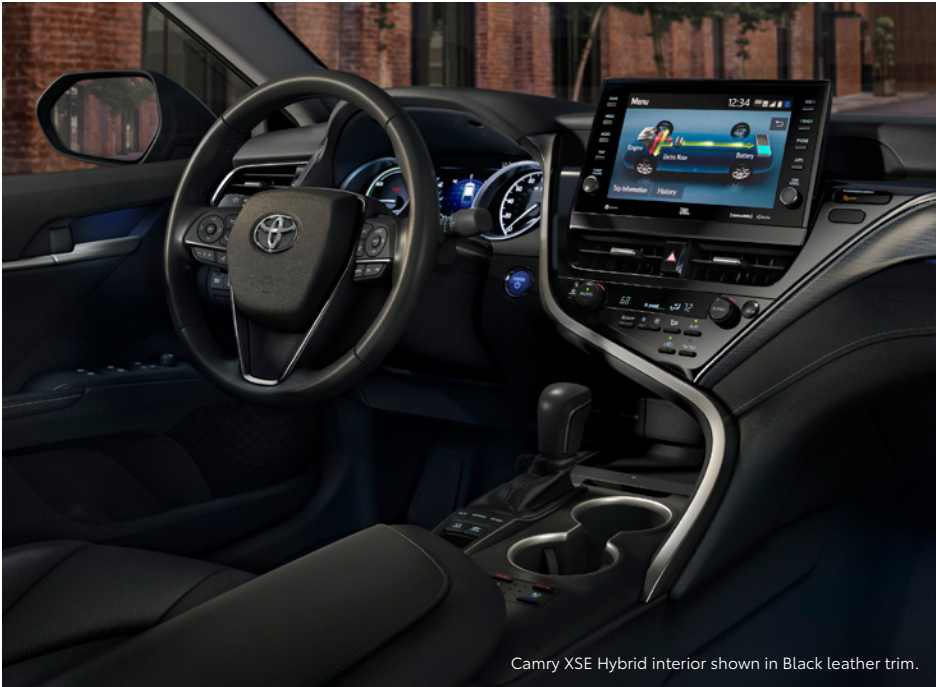
Camry XSE Hybrid interior shown in Black leather trim.

With its captivating style, Camry Hybrid is dressed to impress without compromising performance. Its Dynamic Force Engine, paired with Toyota's hybrid system, offers both power and exceptional fuel economy.