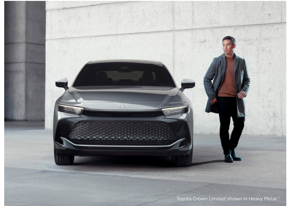
Toyota Crown Limited shown in Heavy Metal. 1