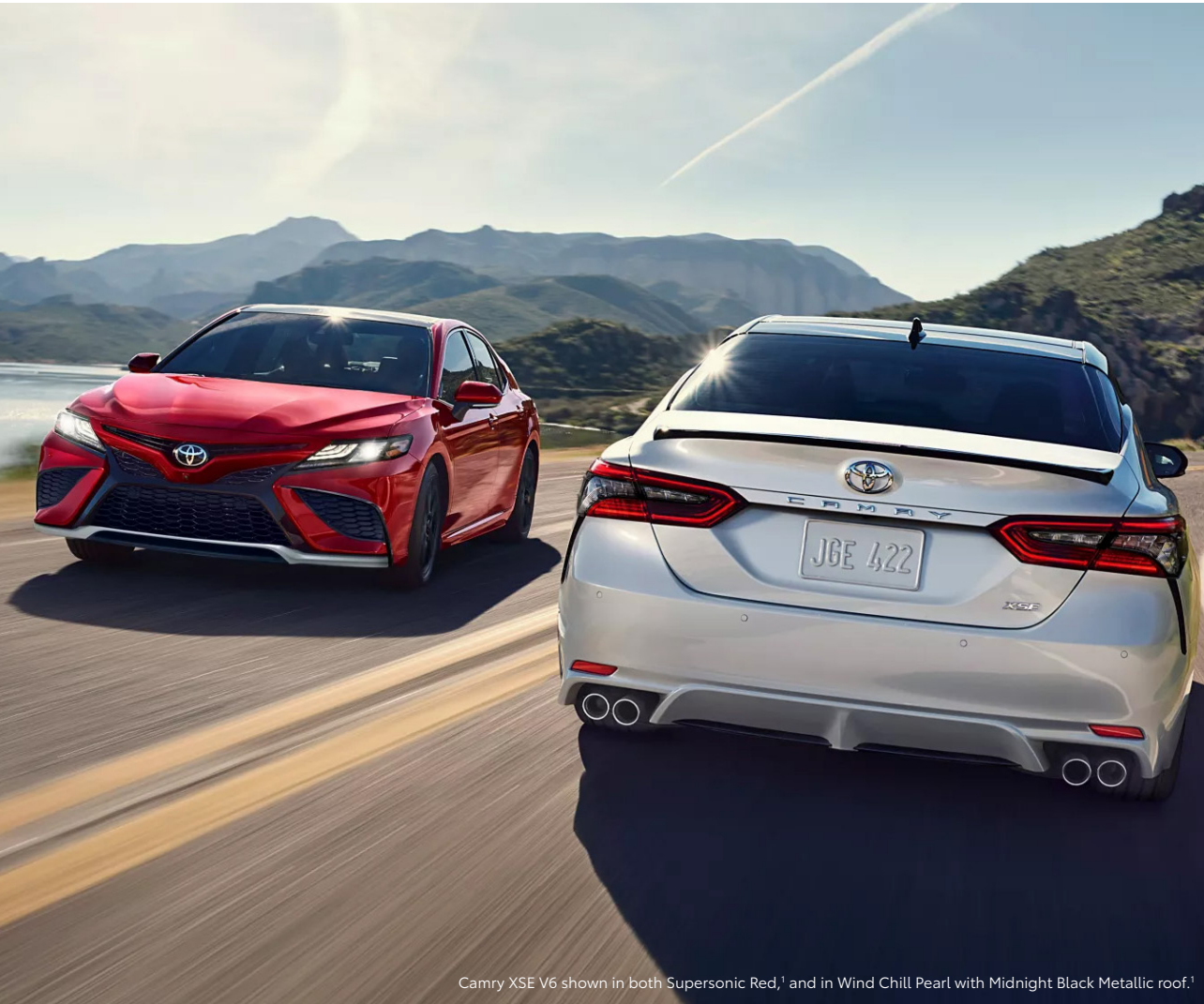
Camry XSE V6 shown in both Supersonic Red, 1 and in Wind Chill Pearl with Midnight Black Metallic roof. 1