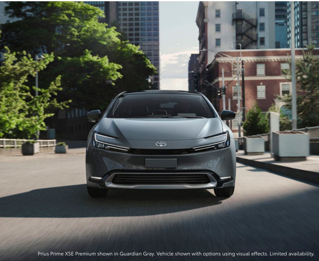
Prius Prime XSE Premium shown in Guardian Gray. Vehicle shown with options using visual effects. Limited availability.