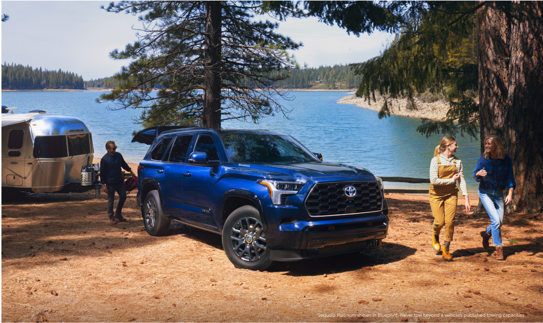
Sequoia Platinum shown in Blueprint. Never tow beyond a vehicle's published towing capacities.