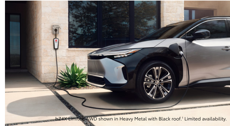
bZ4X Limited AWD shown in Heavy Metal with Black roof. 1 Limited availability.