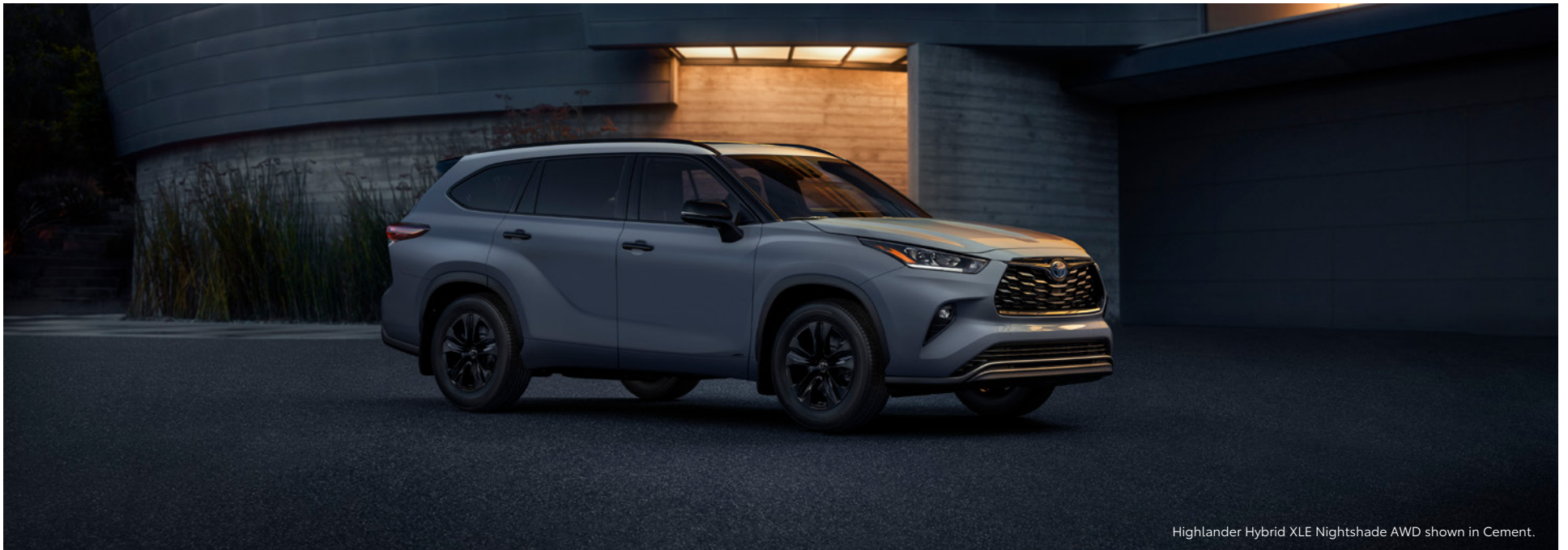
Highlander Hybrid XLE Nightshade AWD shown in Cement.