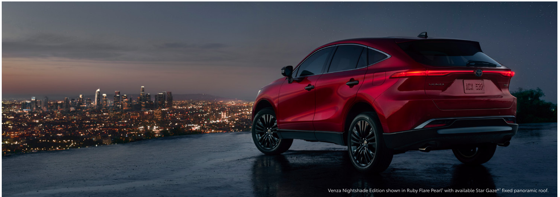
Venza Nightshade Edition shown in Ruby Flare Pearl 1 with available Star Gaze 87 fixed panoramic roof.