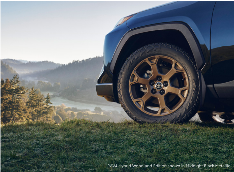
RAV4 Hybrid Woodland Edition shown in Midnight Black Metallic.