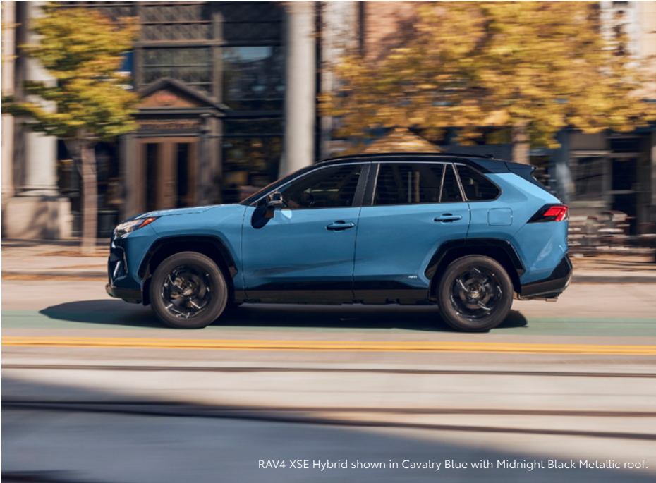
RAV4 XSE Hybrid shown in Cavalry Blue with Midnight Black Metallic roof.