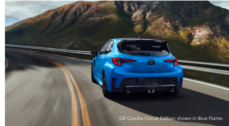
GR Corolla Circuit Edition shown in Blue Flame.