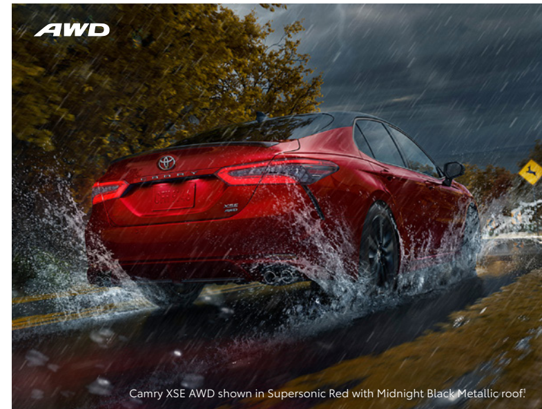
Camry XSE AWD shown in Supersonic Red with Midnight Black Metallic roof. 1