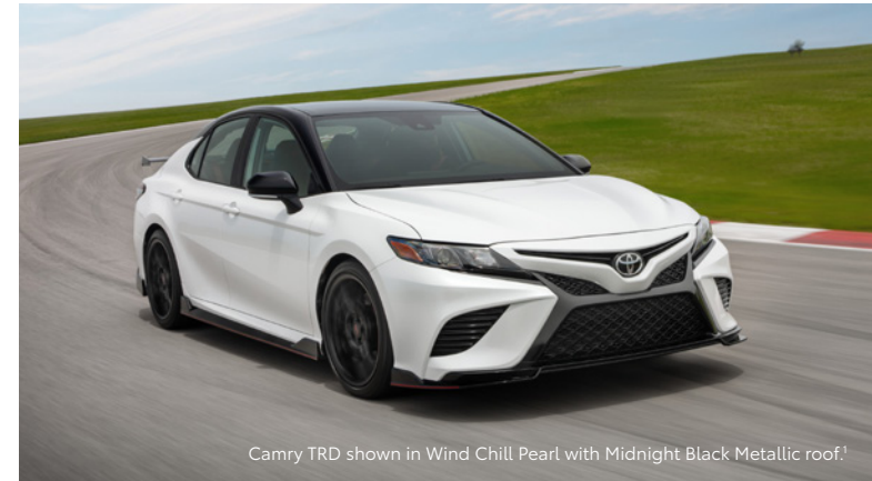
Camry TRD shown in Wind Chill Pearl with Midnight Black Metallic roof. 1