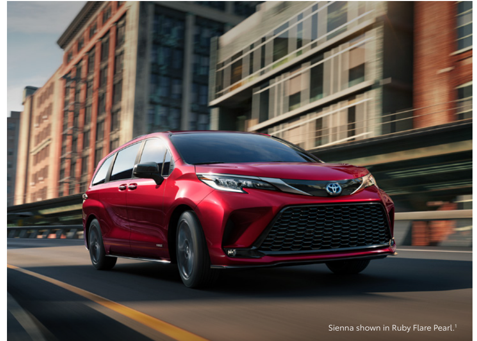
Sienna shown in Ruby Flare Pearl. 1

Unleash your spontaneous spirit in Sienna. Packed with impressive efficiency and the space you crave, Sienna is ready to fuel everything from your everyday errands to your exciting escapades.