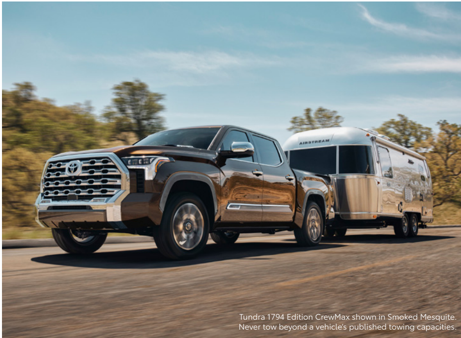
Tundra 1794 Edition CrewMax shown in Smoked Mesquite. Never tow beyond a vehicle's published towing capacities.