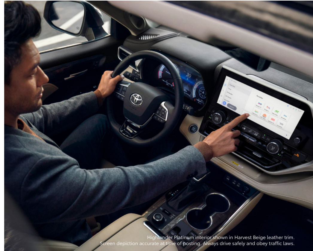
Highlander Platinum interior shown in Harvest Beige leather trim. Screen depiction accurate at time of posting. Always drive safely and obey traffic laws.