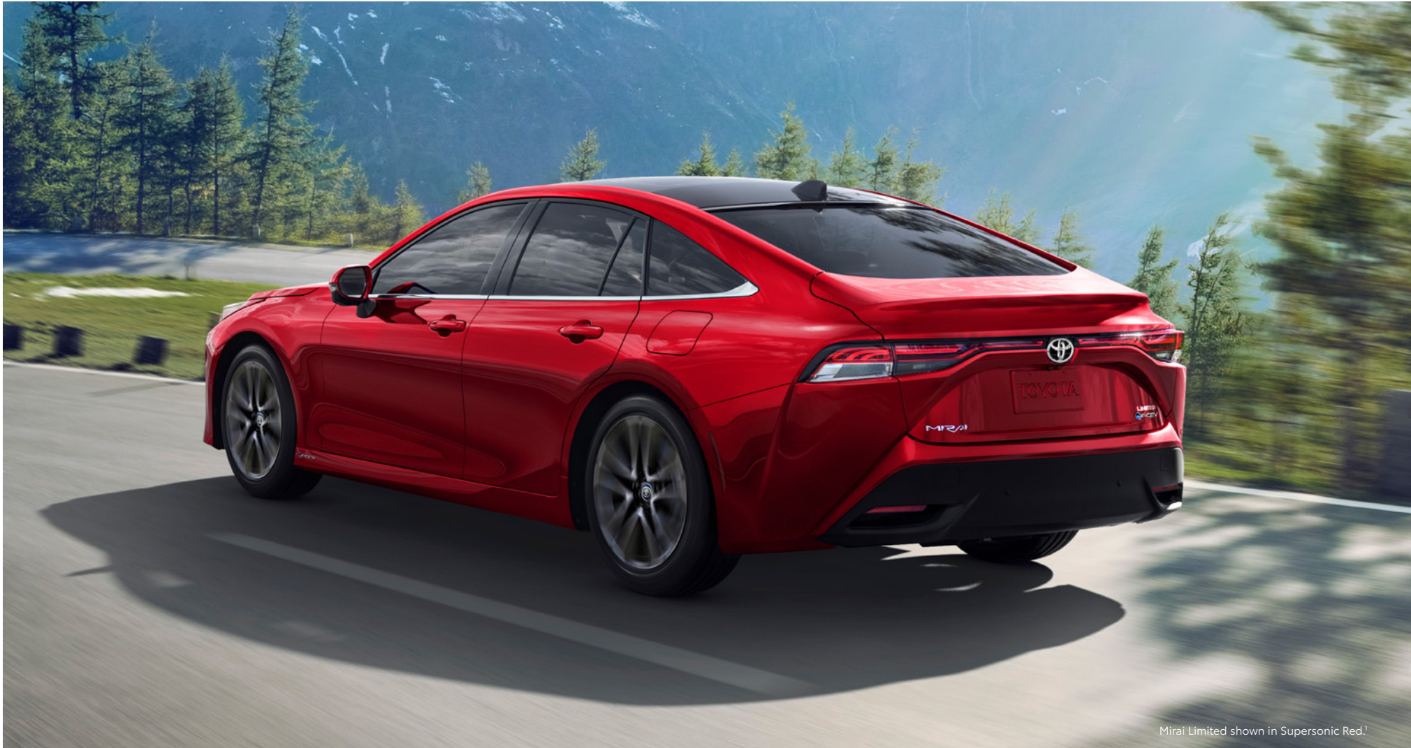
Mirai Limited shown in Supersonic Red. 1

Zero emissions and super efficient. Mirai's innovative Fuel Cell Stack creates power out of hydrogen and thin air — literally. Available in California.