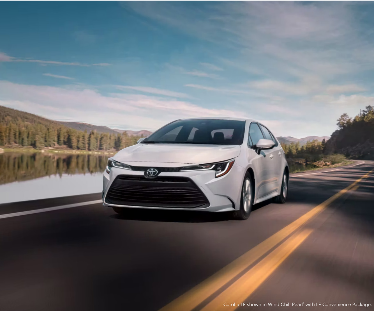
Corolla LE shown in Wind Chill Pearl 1 with LE Convenience Package.