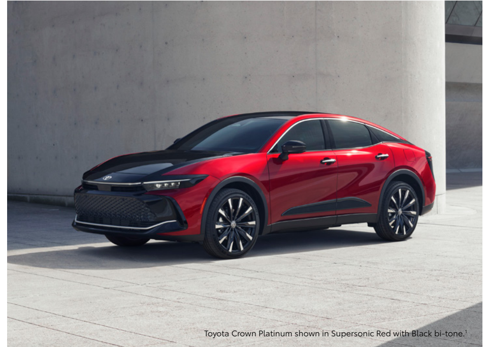
Toyota Crown Platinum shown in Supersonic Red with Black bi-tone. 1

Stunning design, with the performance to match. Toyota Crown's hybrid system gives you powerful and efficient driving, packaged with undeniable style.