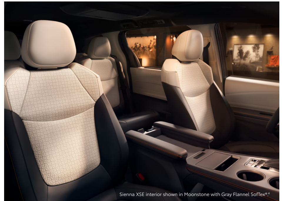
Sienna XSE interior shown in Moonstone with Gray Flannel SofTex. 4