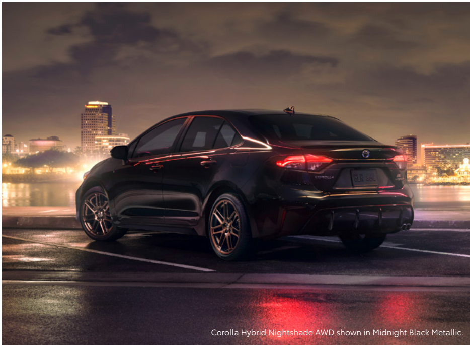
Corolla Hybrid Nightshade AWD shown in Midnight Black Metallic.