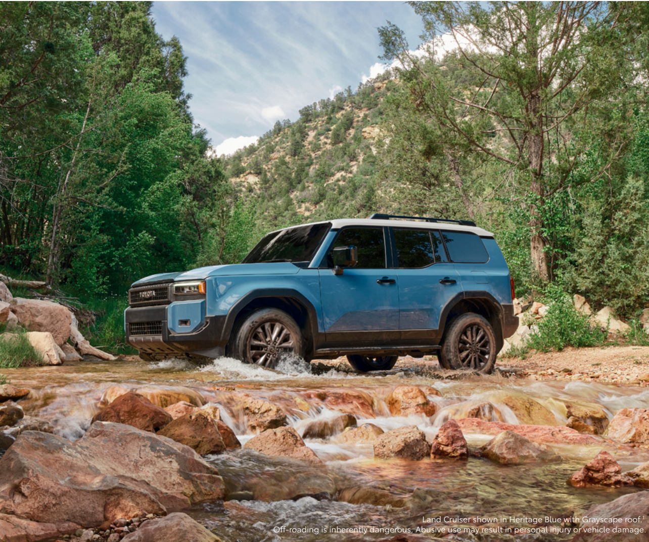
Land Cruiser shown in Heritage Blue with Grayscape roof. 1 Off-roading is inherently dangerous. Abusive use may result in personal injury or vehicle damage.

Land Cruiser is the ultimate off-road SUV. Fully loaded with terrain-tackling capability features and spacious enough to comfortably fit your whole crew, this revival of a classic Toyota heritage vehicle will take you on the trip of a lifetime, every time.