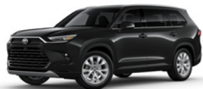
GRAND HIGHLANDER HYBRID