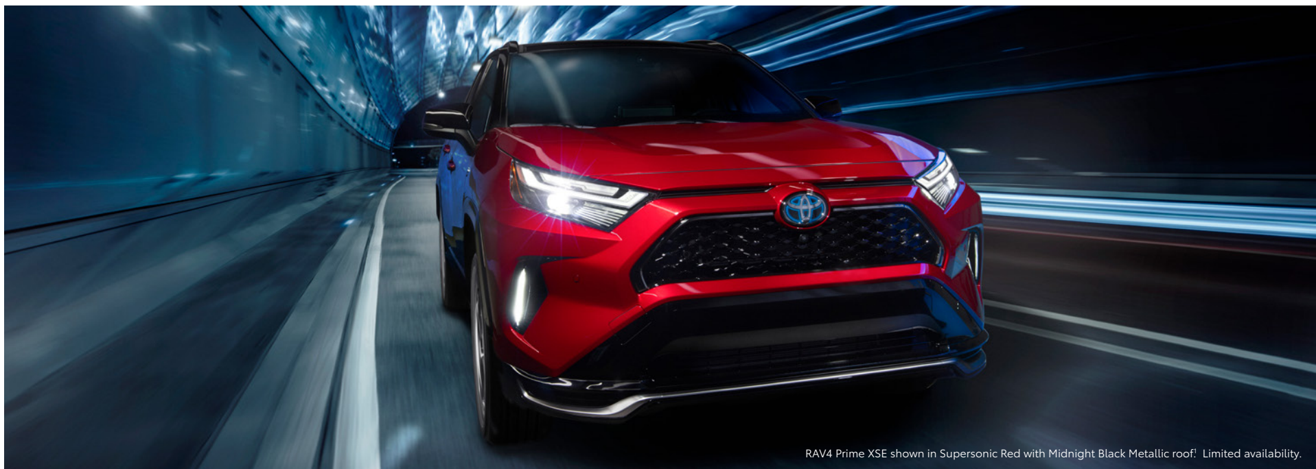
RAV4 Prime XSE shown in Supersonic Red with Midnight Black Metallic roof! Limited availability.