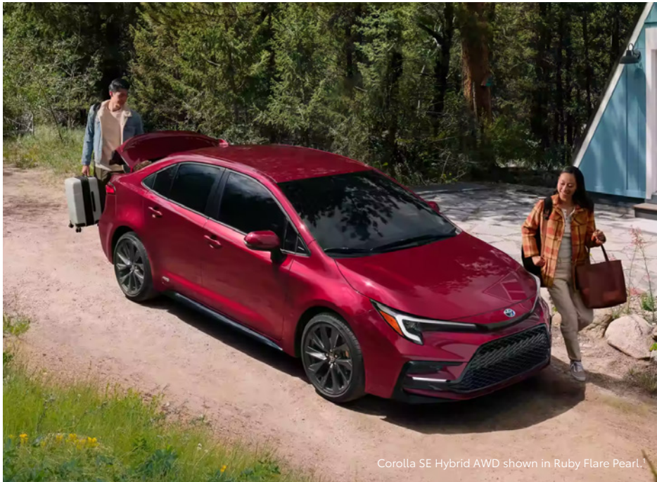
Corolla SE Hybrid AWD shown in Ruby Flare Pearl.