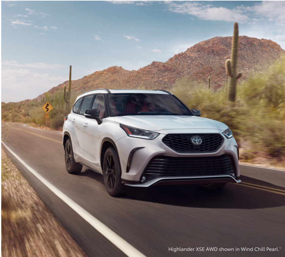
Highlander XSE AWD shown in Wind Chill Pearl. 1