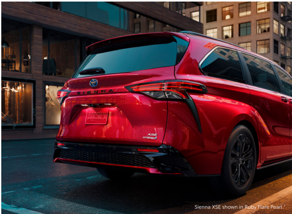
Sienna XSE shown in Ruby Flare Pearl. 1