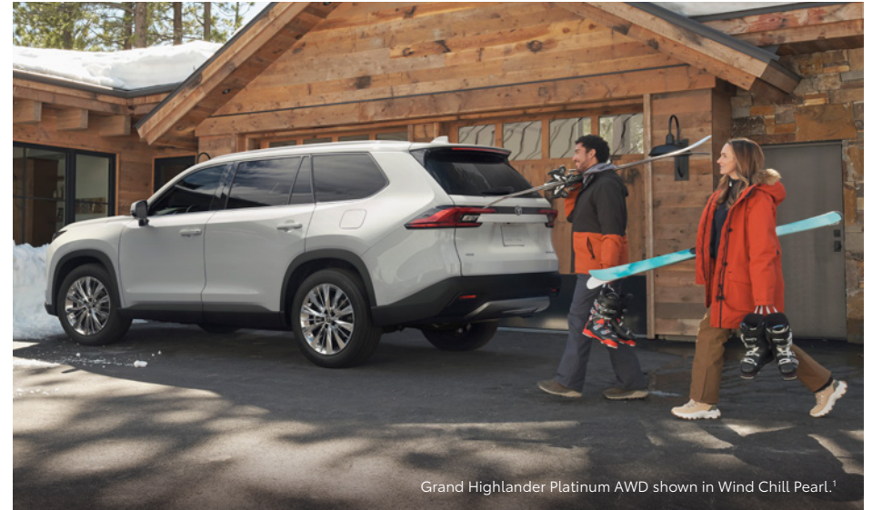
Grand Highlander Platinum AWD shown in Wind Chill Pearl. 1

Make family time more epic than ever. With the latest and greatest intuitive tech, smart storage where you'd least expect it, and plenty of room to comfortably fit the whole family, Grand Highlander is a real crowd-pleaser.