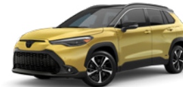
COROLLA CROSS HYBRID