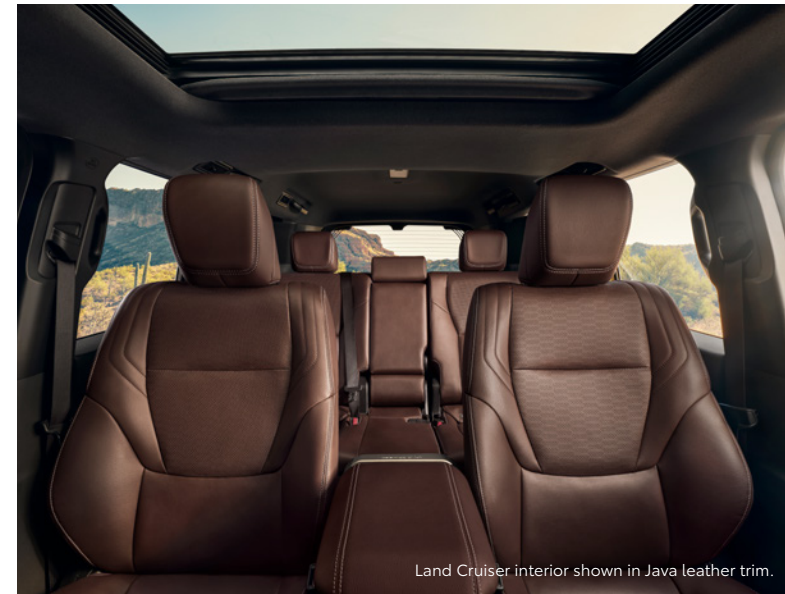
Land Cruiser interior shown in Java leather trim.