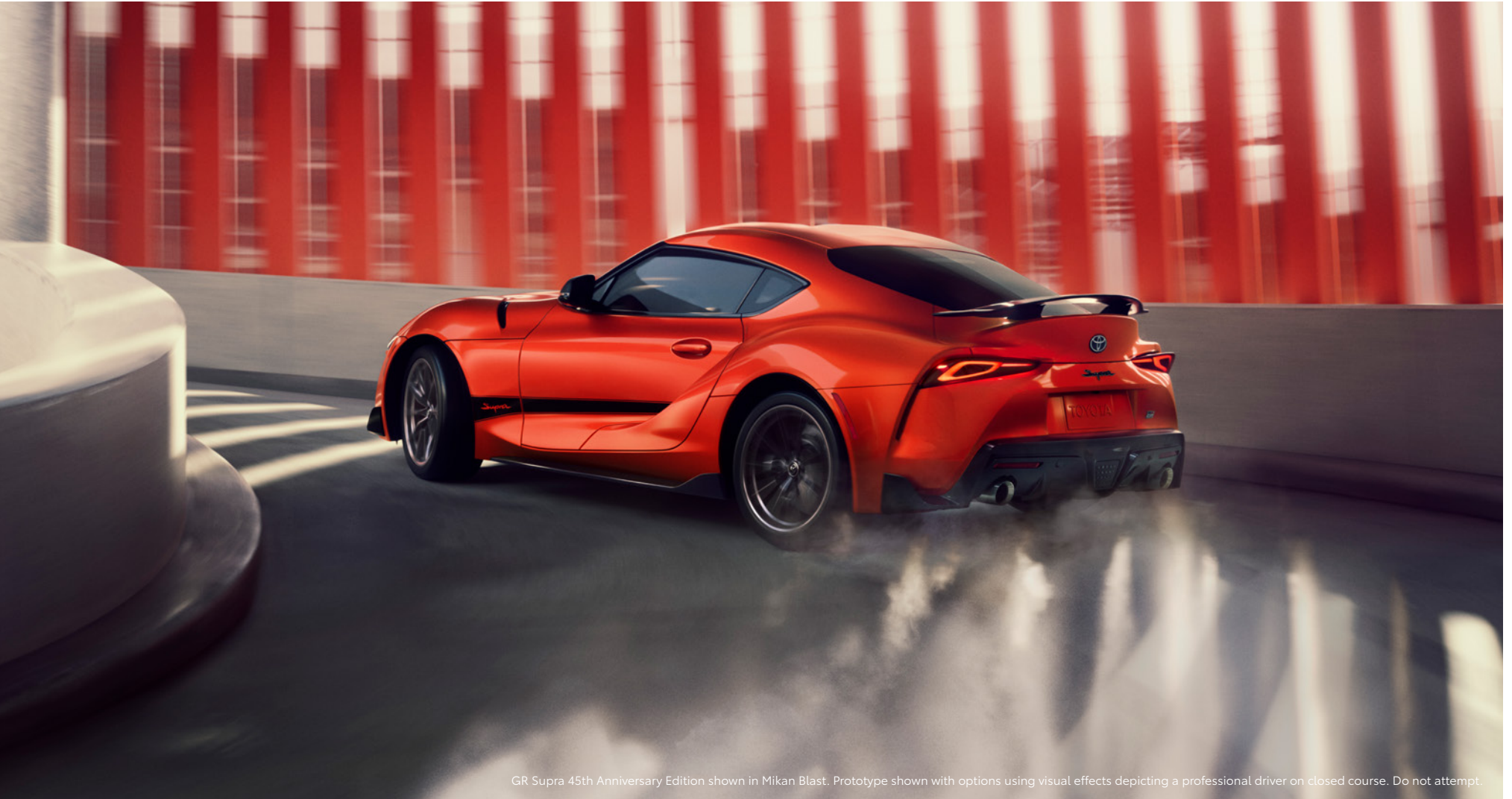
GR Supra 45th Anniversary Edition shown in Mikan Blast. Prototype shown with options using visual effects depicting a professional driver on closed course. Do not attempt.