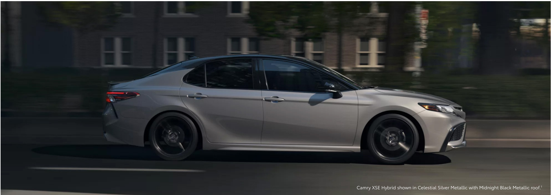
Camry XSE Hybrid shown in Celestial Silver Metallic with Midnight Black Metallic roof. 1