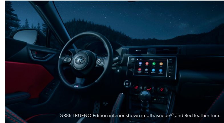
GR86 TRUENO Edition interior shown in Ultrasuede ®3 and Red leather trim.