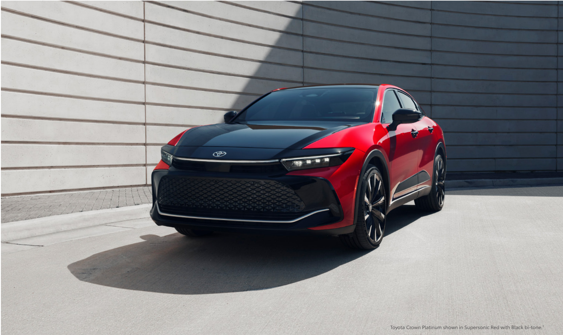
Toyota Crown Platinum shown in Supersonic Red with Black bi-tone. 1