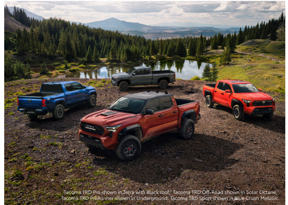
Tacoma TRD Pro shown in Terra with Black roof. Tacoma TRD Off-Road shown in Solar Octane. Tacoma TRD PreRunner shown in Underground. Tacoma TRD Sport shown in Blue Crush Metallic.