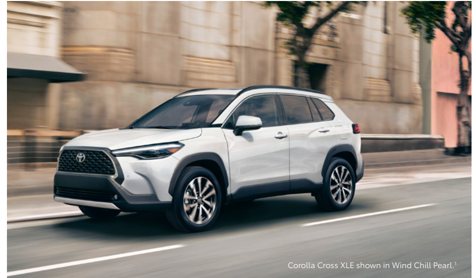
Corolla Cross XLE shown in Wind Chill Pearl. 1

Hop in Corolla Cross for a ride as bold as your ambitions. Enjoy the benefits of the crossover's versatile cargo space, designed for your on-the-go lifestyle. Whether you're commuting or exploring new cities, Corolla Cross is prepared for any plan you've got up your sleeve.