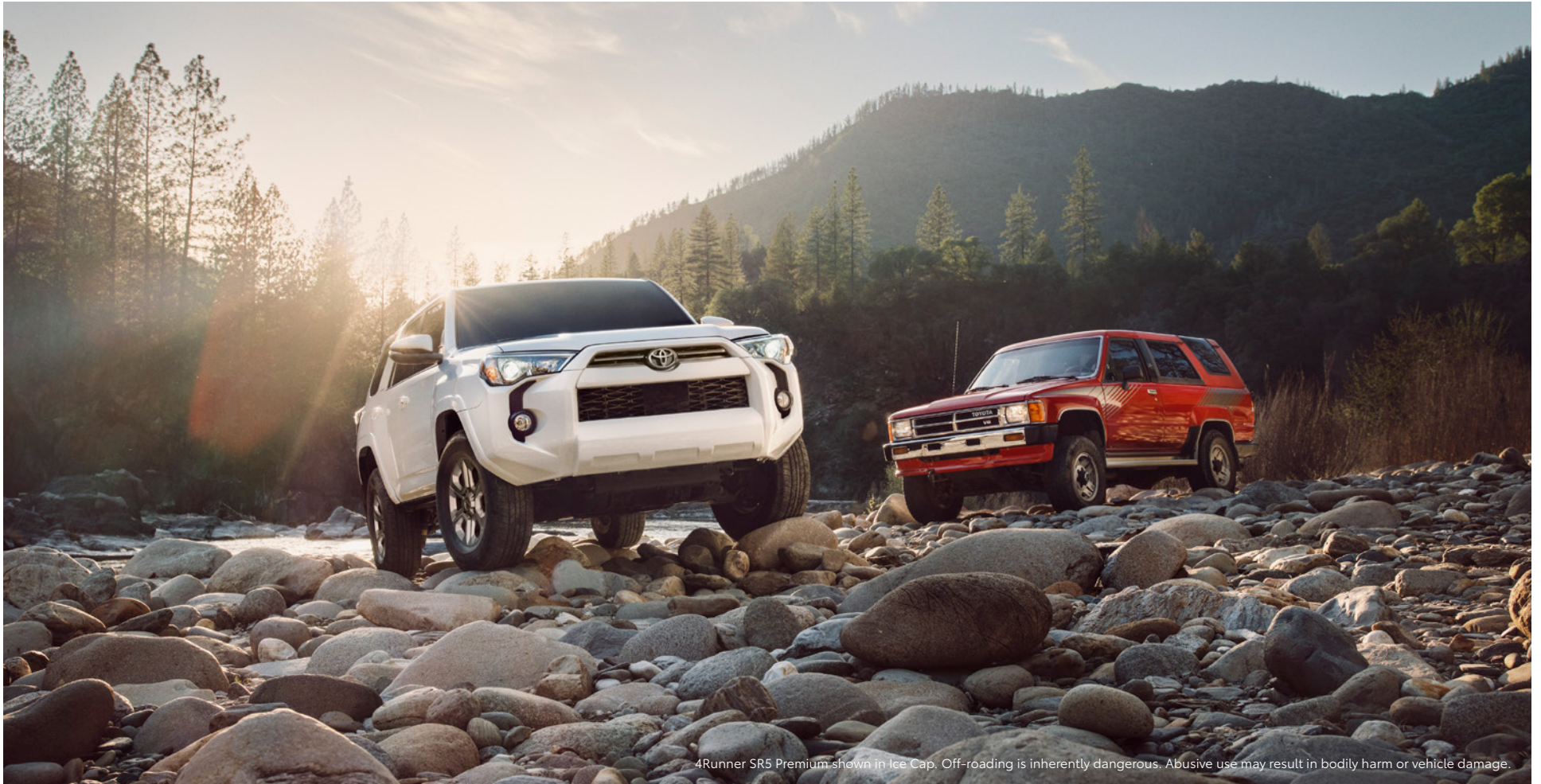
4Runner SR5 Premium shown in Ice Cap. Off-roading is inherently dangerous. Abusive use may result in bodily harm or vehicle damage.