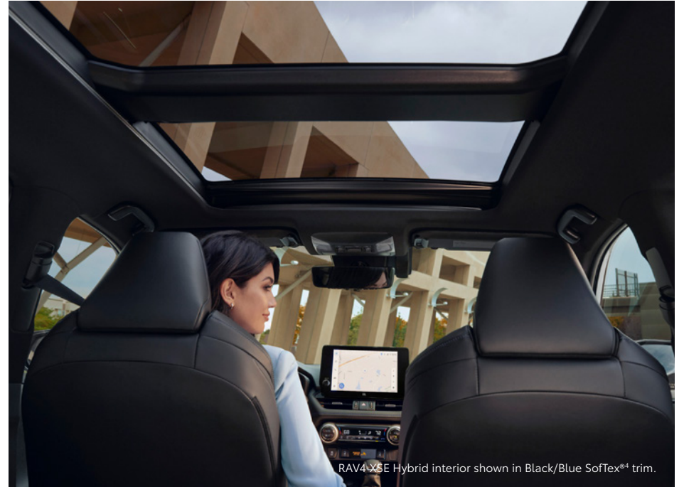
RAV4 XSE Hybrid interior shown in Black/Blue SofTex® trim.