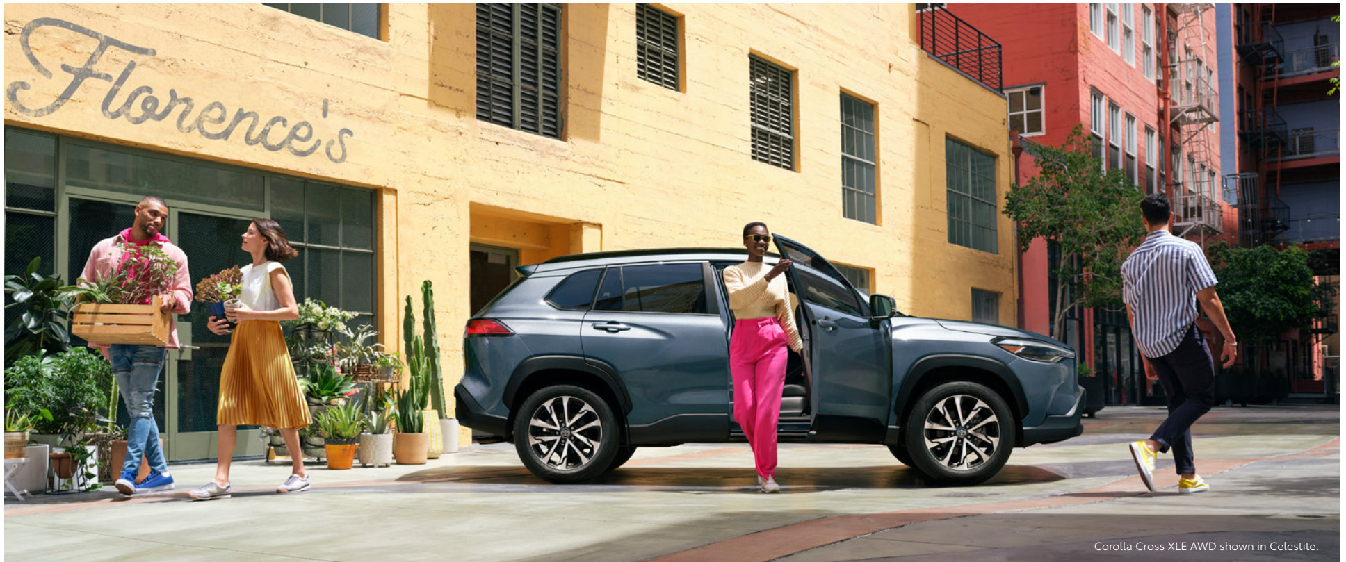
Corolla Cross XLE AWD shown in Celestite.