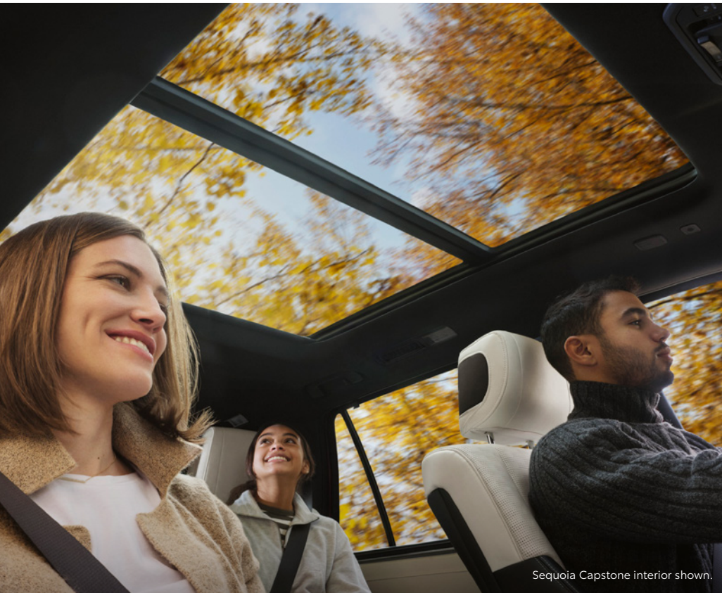
Sequoia Capstone interior shown.