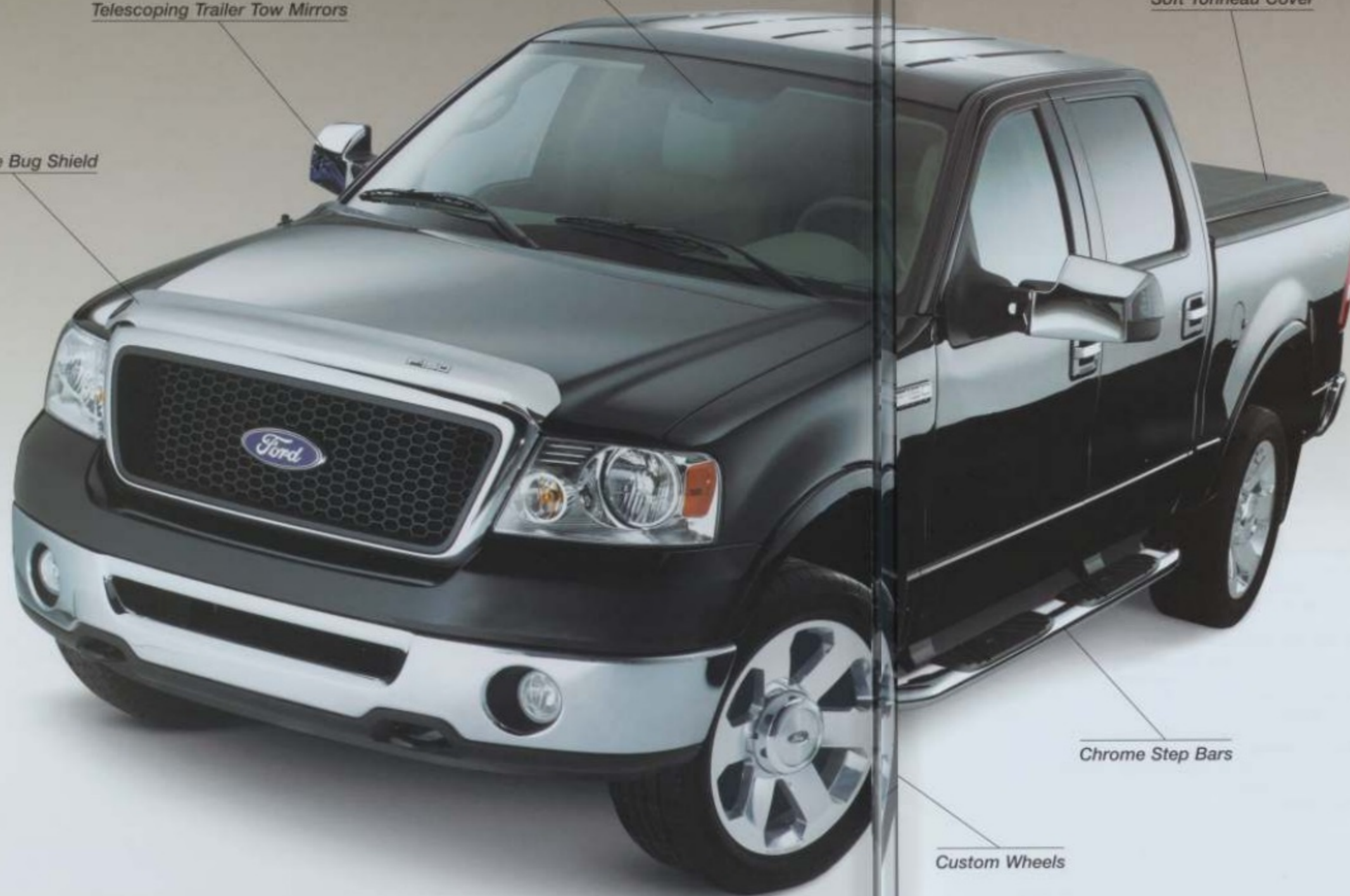
Soft Tonneau Cover