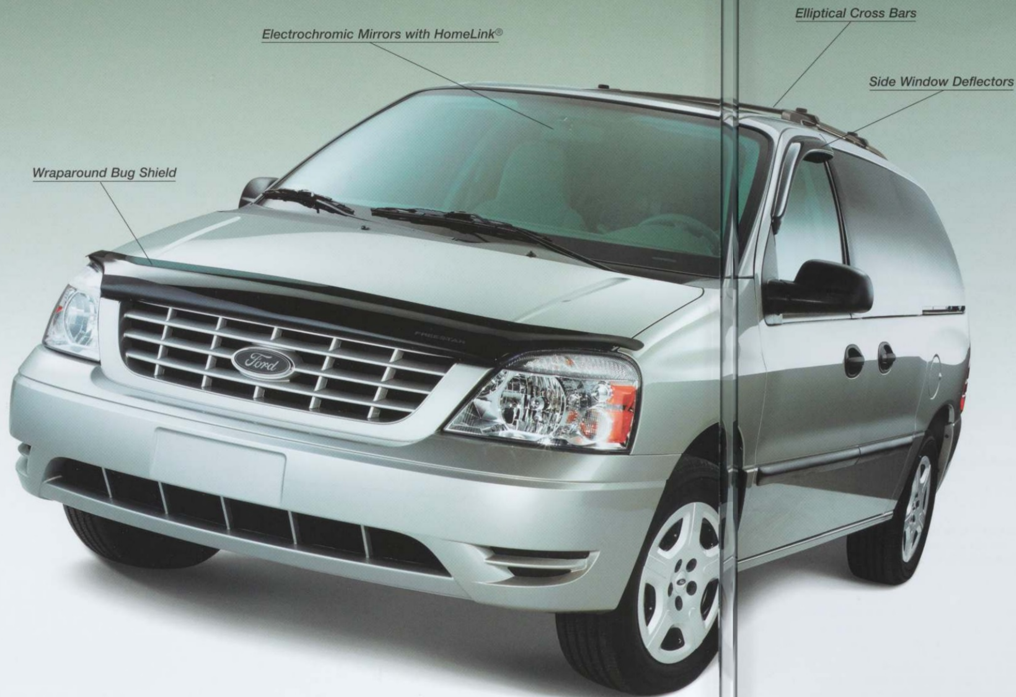
Wraparound Bug Shield

FORD'S NEW VEHICLE ACCESSORIZER PUTS PERSONALIZATION IN THE FAST LANE and takes the information superhighway to the next level! Our new online Accessorizer feature lets you see how Genuine Ford Accessories will look on your Freestar. Take it for a test drive at fordaccessoriesstore.com .