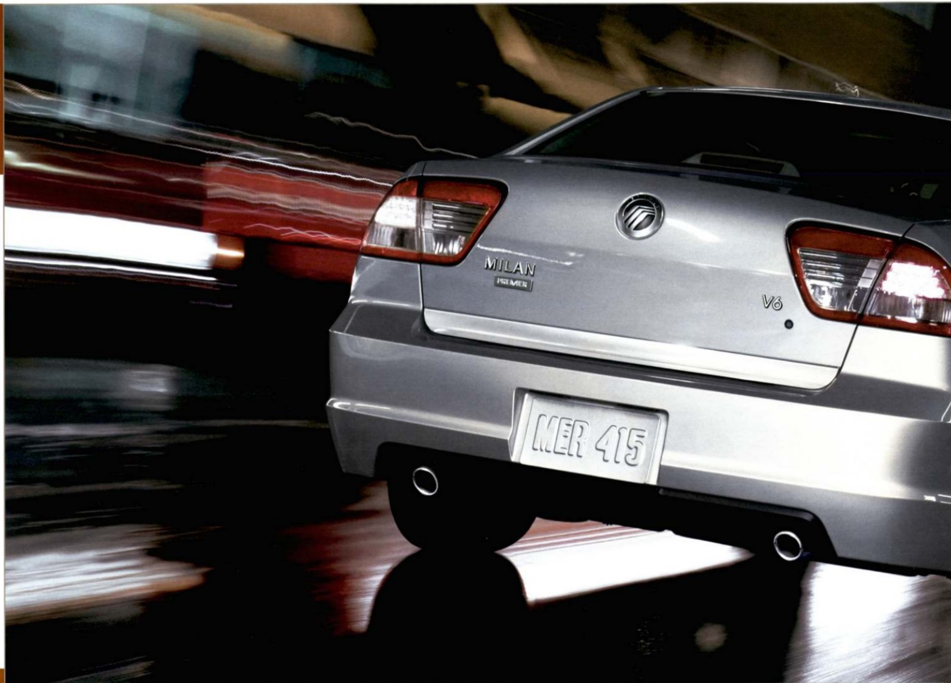
4 SILVER BIRCH METALLIC: MILAN PREMIER V-6