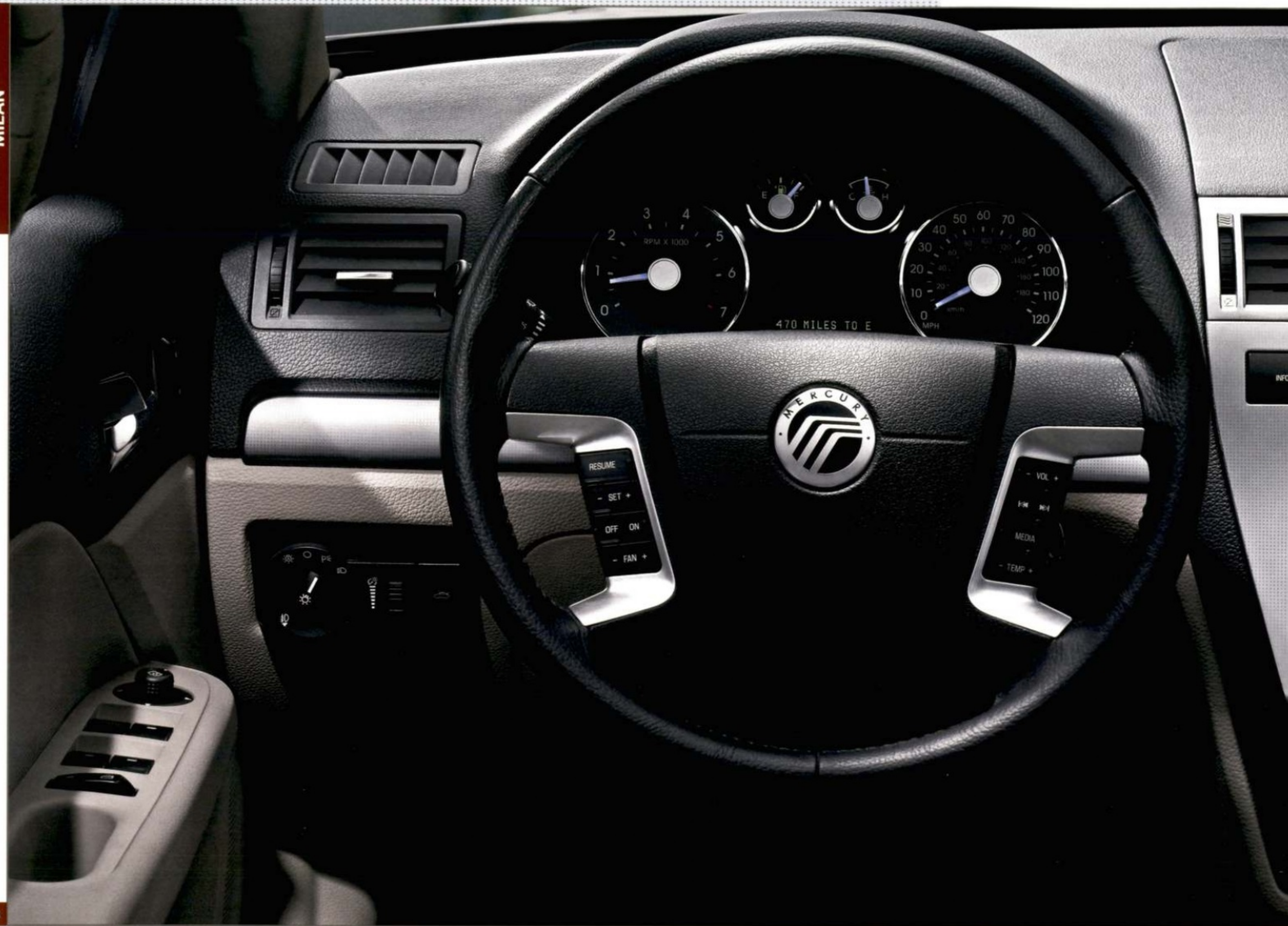
MILAN PREMIER INTERIOR WITH SATIN-ALUMINUM ACCENTS (SHOWN WITH AVAILABLE EQUIPMENT)