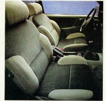
Raven Mallory cloth interior.

XR4Ti's attention to detail shows in little ways: the rear-seat armrest, a cargo tie-down net to keep luggage secured, unique individual cassette-tape storage drawers.