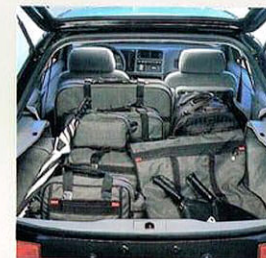
With rear seatbacks folded down, XR4Ti provides 1010 litres (35.7 cu. ft.) (MVMA specifications) of luggage space.

Likewise, the practical side of XR4Ti has not been forgotten. The rear seat is asymmetrically split—in 60% and 40% sections—allowing XR4Ti's owner to carry odd-sized objects like skis while still providing rear-seat room for two passengers. Combine this with XR4Ti's hatchback and you have a level of versatility few of its competitors can equal.