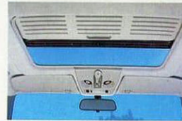
Optional moonroof with sun screen.

To that end, the driver will find in XR4Ti a collection of logically arranged analog gauges, as well as simple-to-use controls.