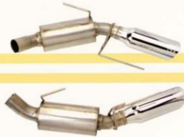
M-5230-5GT 2005-07 Mustang GT Exhaust Kit (Not Legal in CA)