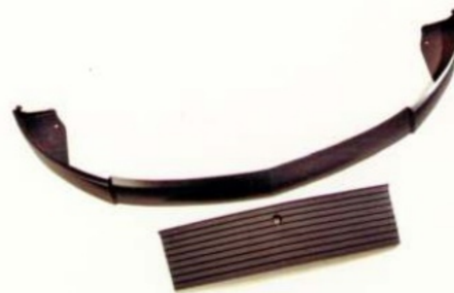
M-2784-M Mustang GT Styling Pack