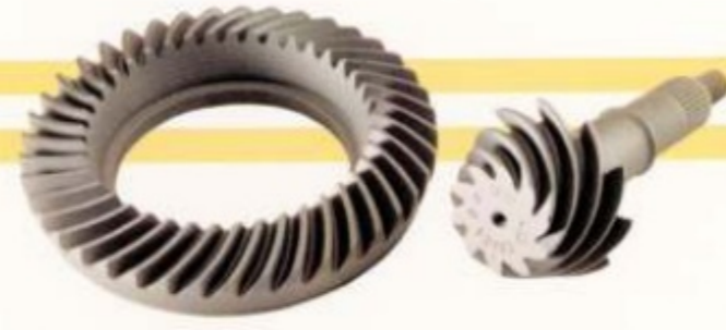
M-4209-* 8.8" Ring and Pinion Sets