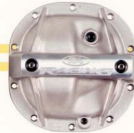
M-4033-G2 Mustang 8.8" Axle Girdle