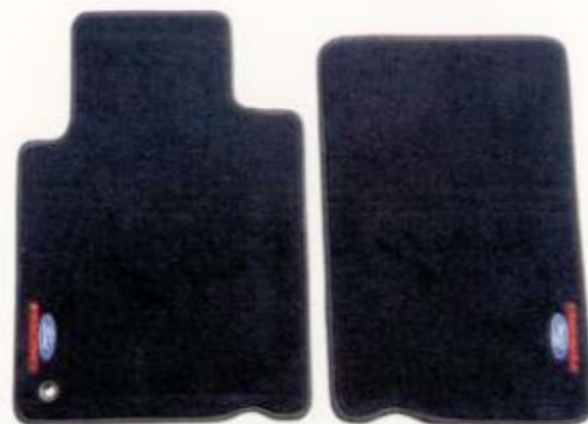
M-13086-C Ford Racing Floor Mats