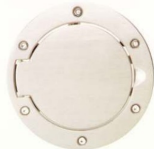
M-2301-5M Aluminum Fuel Fill Door