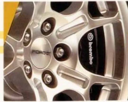
M-2300-S 14" Front Brake Upgrade Kit