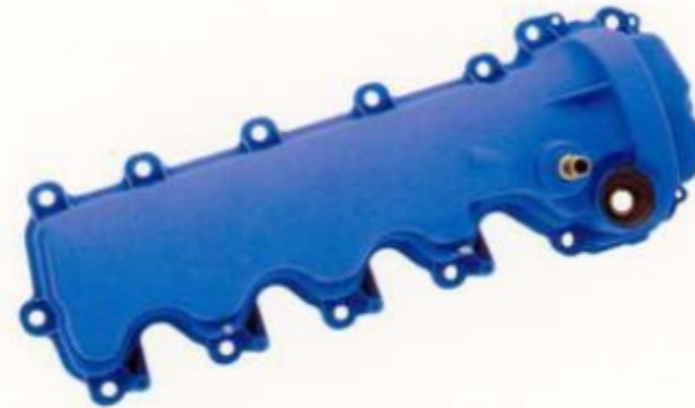
M-6582-3V* & M-6582-C543V Powder Coated Valve Covers available in Black, GT Blue and Smoked Chrome