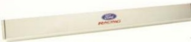
M-13208-M100 Ford Racing Entry Guards