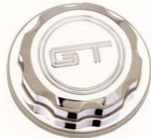
M-8006-GT GT Billet Coolant Cap Cover