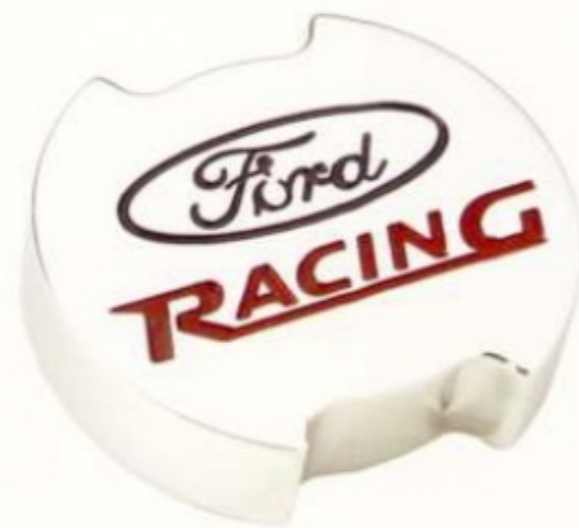
M-6766-MP46 Ford Racing Billet Oil Fill Cover