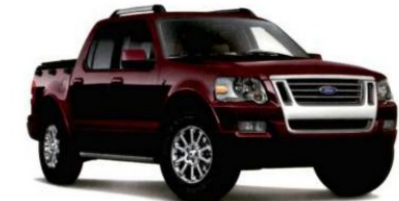
Dark Cherry Metallic