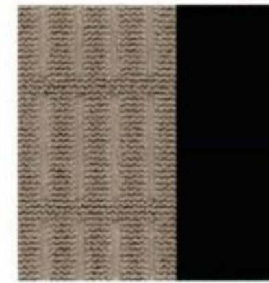
Dark Charcoal Cloth Standard on Limited