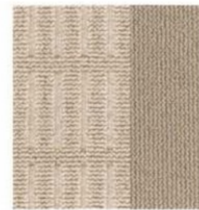
Camel Cloth Standard on XLT and Limited