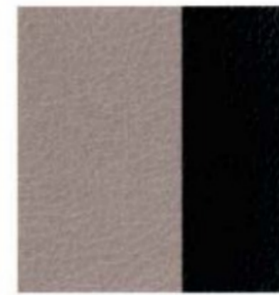
Dark Charcoal Leather Optional on Limited