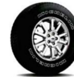
18" Machined-Aluminum Standard on Limited