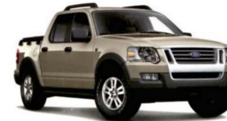
Pueblo Gold Metallic