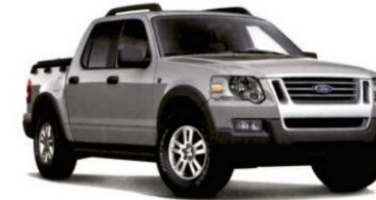
Silver Birch Metallic