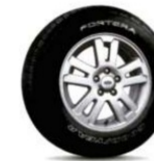
17" Cast-Aluminum Included in XLT Appearance Package