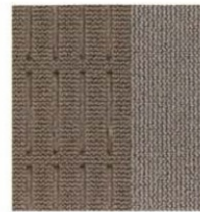
Light Stone Cloth Standard on XLT