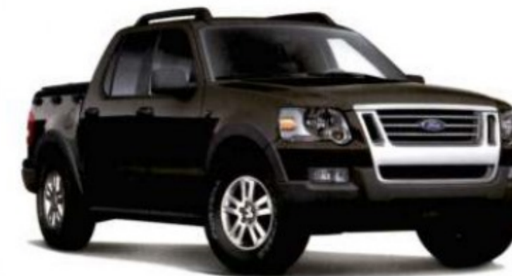
Dark Stone Metallic