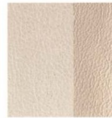
Camel Leather Optional on Limited