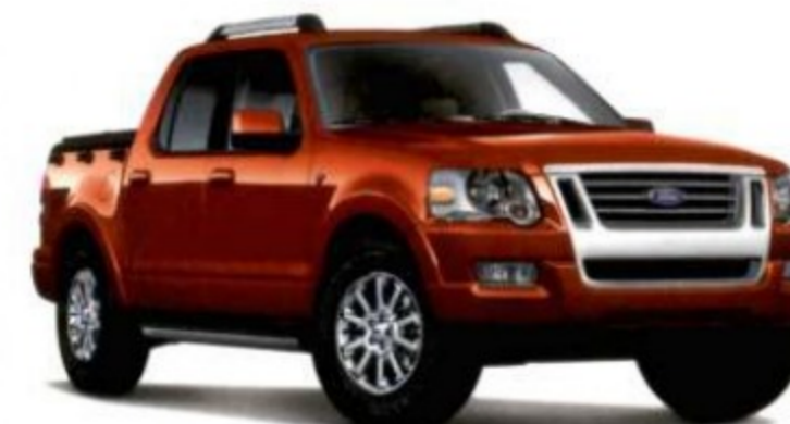
Orange Frost Metallic

Ford uses clearcoat paint for beauty and protection. Colors shown are representative only. Not all colors are available on all models. See your dealer for actual paint/trim options. Vehicles shown may contain optional equipment.