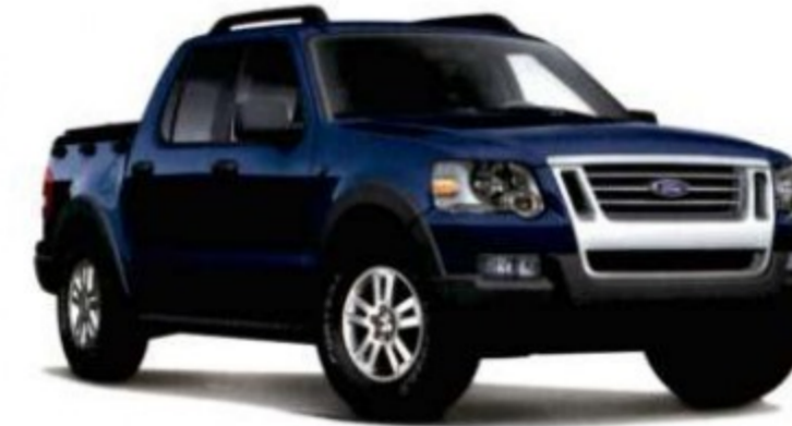
Dark Blue Pearl Metallic