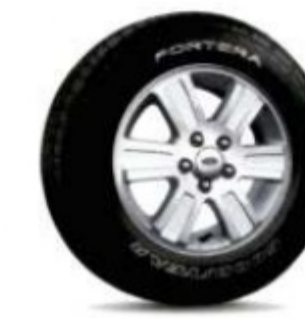
16" Cast-Aluminum Standard on XLT