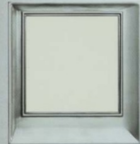
WHITE CHOCOLATE TRI-COAT*