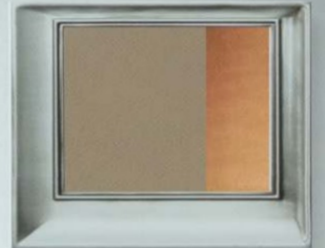
CAMEL LEATHER WITH LIGHT FIGURED MAPLE WOOD Available Premium Appearance Package features premium leather trim with Sand piping