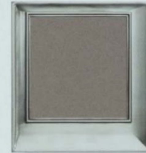
LIGHT FRENCH SILK