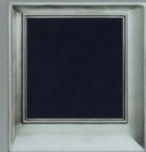
DARK BLUE PEARL*