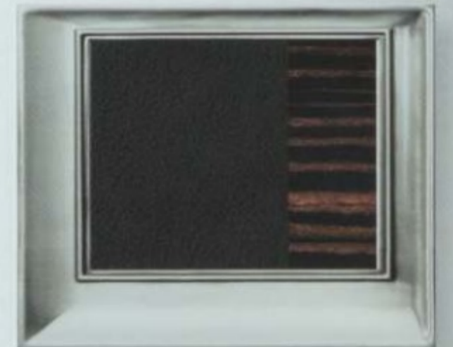
CHARCOAL BLACK LEATHER WITH EBONY WOOD Available Premium Appearance Package features premium leather trim with Caramel piping