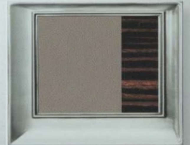
STONE LEATHER WITH EBONY WOOD Available Premium Appearance Package features premium leather trim with Black piping