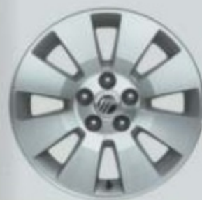
17" MACHINED-ALUMINUM Standard on Mountaineer; optional on Mountaineer Premier