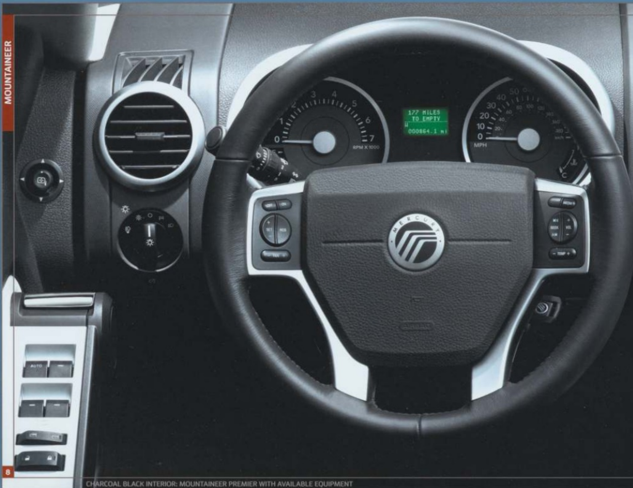
CHARCOAL BLACK INTERIOR: MOUNTAINEER PREMIER WITH AVAILABLE EQUIPMENT