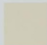
WHITE CHOCOLATE YR-COAT*