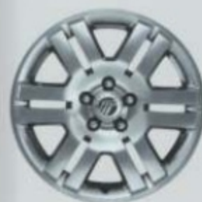
18" SATIN-ALUMINUM Standard on Mountaineer Premier; optional on Mountaineer