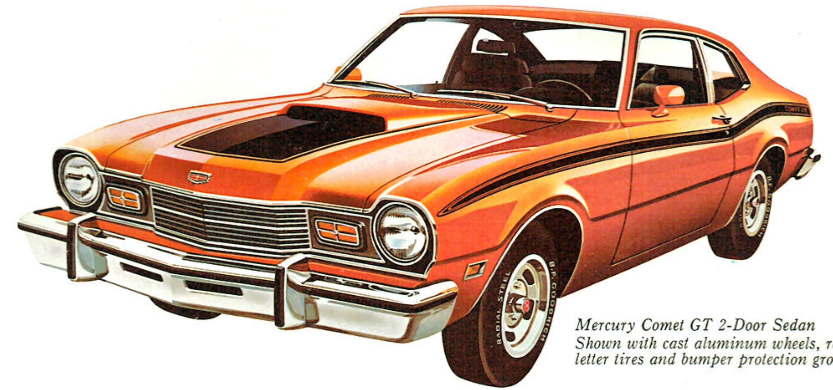
Mercury Comet GT 2-Door Sedan Shown with cast aluminum wheels, raised white letter tires and bumper protection group.

• Ford Motor Company Safety Design Features. Did you know your 1975 Comet has new-type door latches designed to remain secured in side impact? Exclusive added features on Mercury Comet GT (shown right): Colour-keyed hood scoop • Dual racing mirrors • Black hub caps with bright trim rings • Blackout grille, headlight doors and lower back panel • Reclining bucket seats in super-soft expanded vinyl • Black instrument panel with bright molding • Leather-wrapped steering wheel • Tape stripes with GT logo.