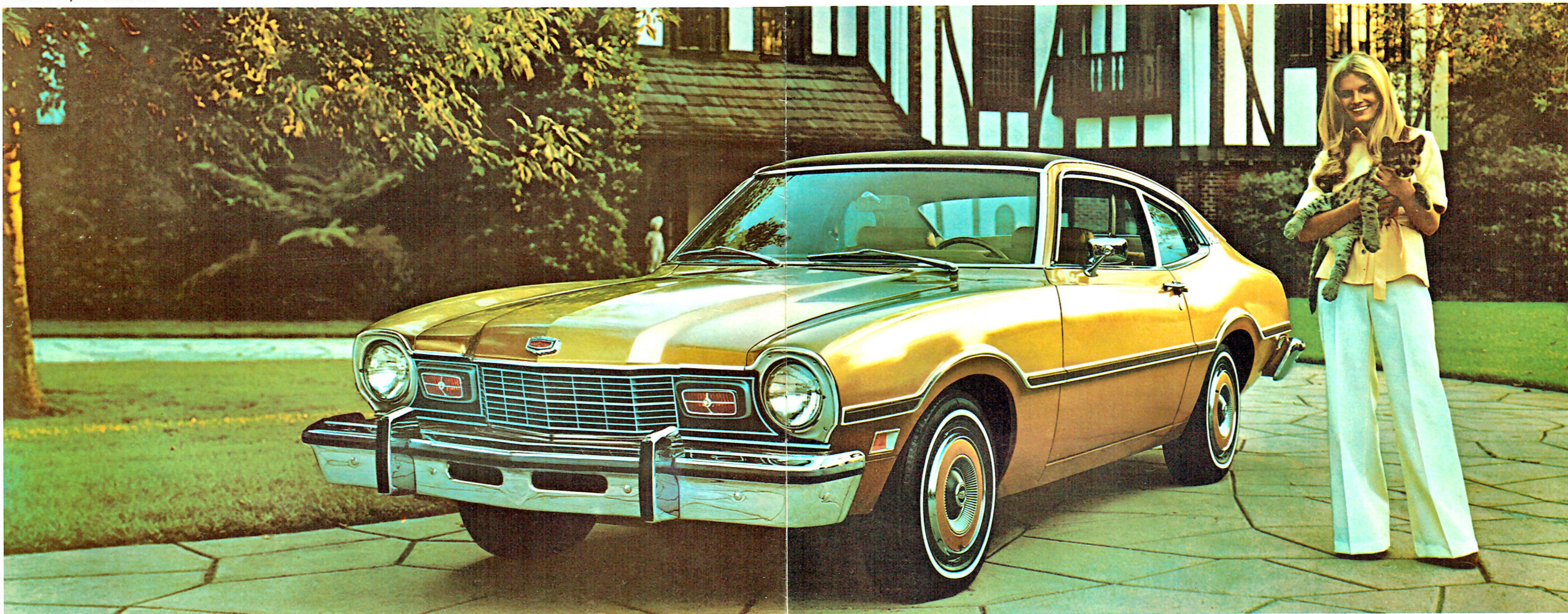
Mercury Comet 2-Door Sedan with Custom interior and exterior options also shown

Custom Interior Option: 22-oz. cut-pile carpeting • Deluxe colour-keyed seat belts • Leather-wrapped steering wheel • Dual beam dome lamp • Day/night rearview mirror • Reclining front bucket seats • Lighted glove box • Cigar lighter. Did you know every Mercury is engineered to reduce maintenance costs — such as a lifetime water pump and radiator hose that needn't be replaced for 50,000 miles?