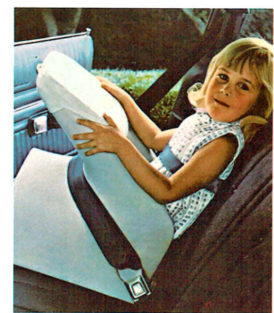
Tot-Guard Safety Seat shields children 19" to 25" tall and 20 to 50 lbs.