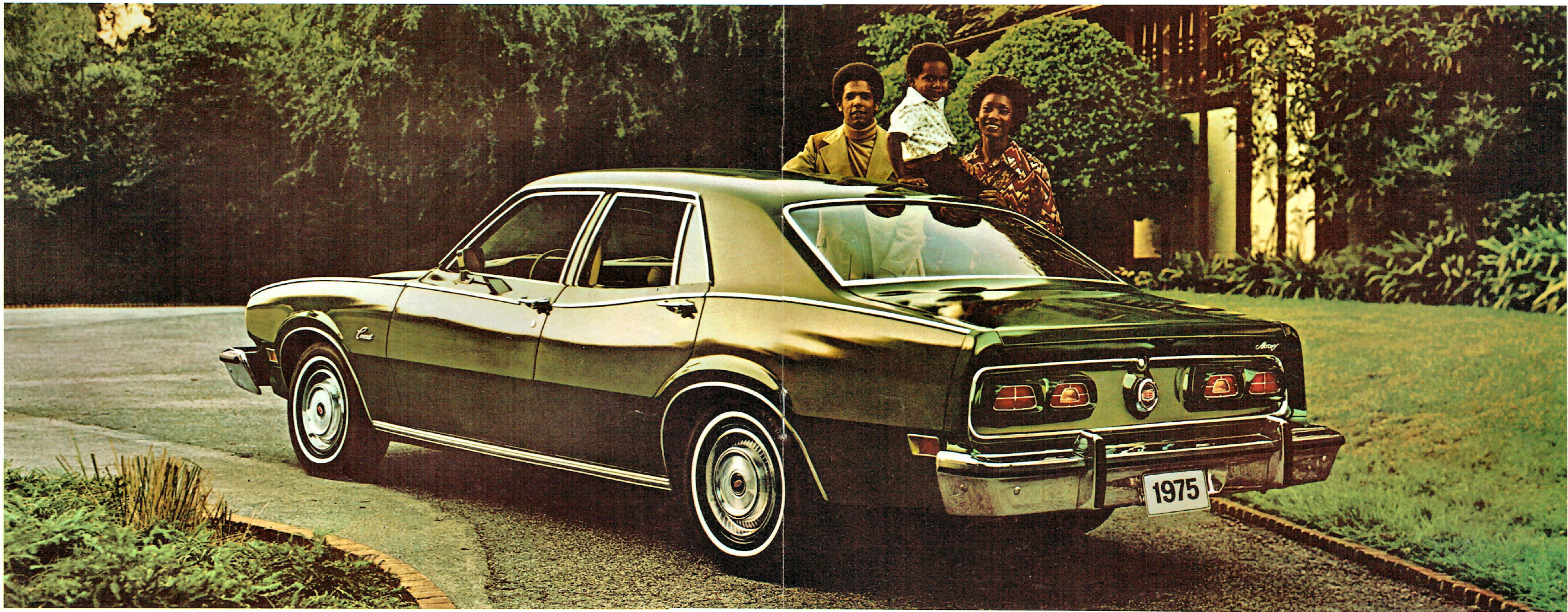
Mercury Comet 4-Door Sedan with Custom Options