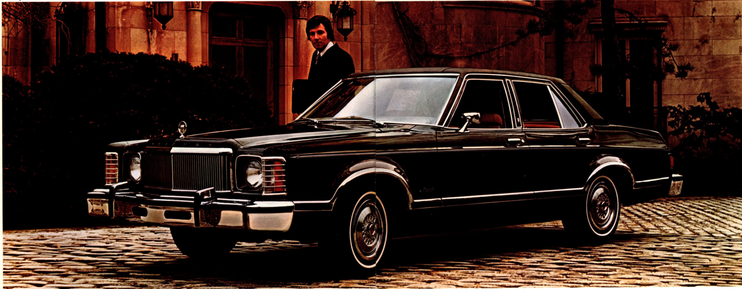
Mercury Monarch Ghia 4-Door Sedan.