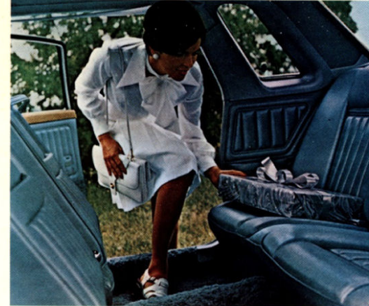
The Mercury Monarch 2-Door Sedan affords remarkable ease of entry and exit, this is a luxury touch unusual in a car of this size.