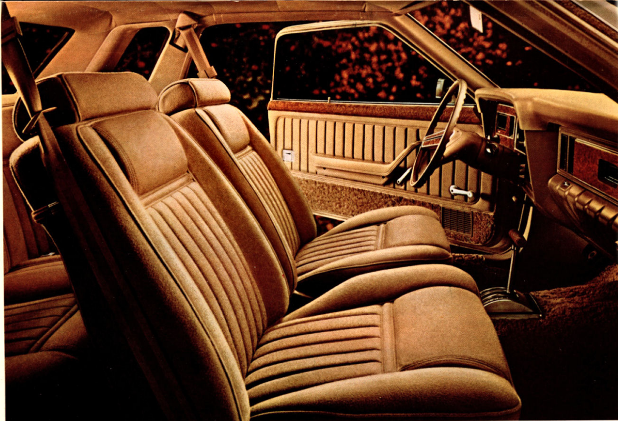
Above: Monarch Ghia's optional luxury cloth interior. Below: Optional leather interior. Both with floor mounted shift.