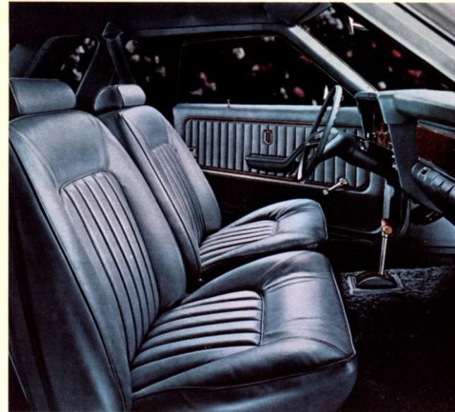
Mercury Monarch standard interior with optional floor mounted shift.

instrument panel with high-gloss vinyl woodgrain, there is a look of rich luxury about this interior (shown right). Individually reclinable bucket seats are upholstered in supple vinyl, available in black, dark red, silver blue, green and tan. A Decor Option is also available in super-soft vinyl seat trim with map pocket and assist rails. This interior includes 22-oz. cut-pile shag carpeting, luxury steering wheel and day/night mirror.