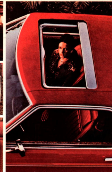
Options shown: illuminated visor vanity mirror, AM/FM stereo radio with tape, power windows and power glass moonroof.