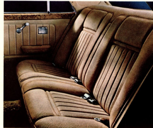
Mercury Monarch's rear contoured seats offer passengers rewarding comfort together with plush luxury.

Seldom has such a high level of interior luxury been presented in a car of such precision size. Monarch Ghia's seats are deeply contoured; the front seat backs individually reclinable. In front, you settle back in deep, glove-soft bucket seats with extra thickness and foam padding to cushion you in long distance comfort. Underfoot is thick shag carpeting. Instrument panel registers afford "comfort control" ventilation as you drive. Handsomely set off against vinyl woodgrain, instruments and digital clock are positioned for ideal visibility. Rear door hinges are canted to permit graceful entry and exit. Note the handsome detailing of map pockets, assist handles, grab bars and deep-padded door panels with large, cushioned armrests — all engineered with your comfort in mind.