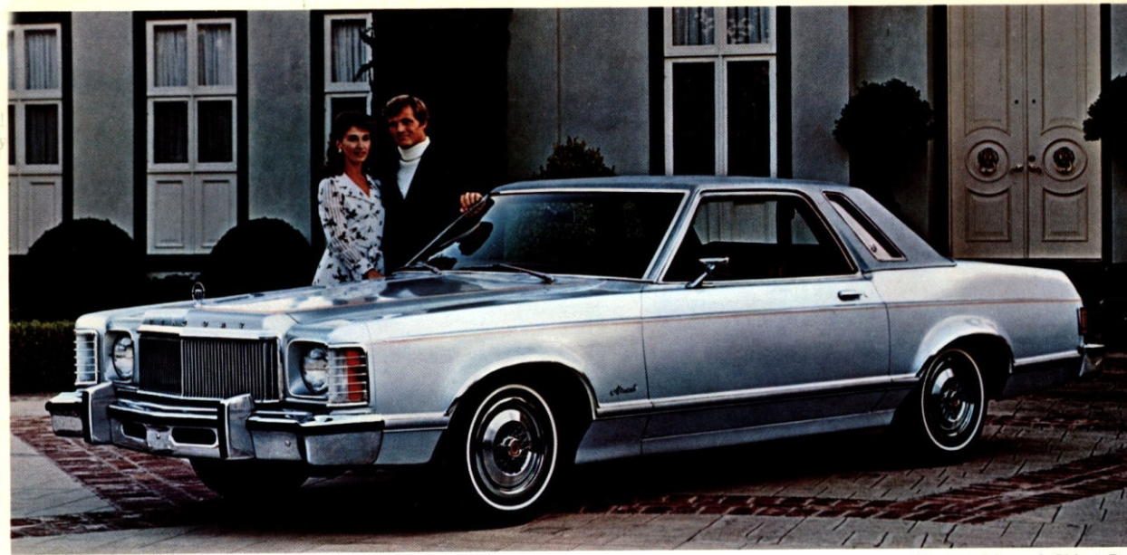
Mercury Monarch Ghia 2-Door

250-IV "Six" engine • 3-speed manual transmission • Front disc brakes • Solid-state ignition • High-level ventilation • Inside hood release • Foot-operated parking brake • WSW steel-belted radial tires • Odense grain bodyside molding • Energy absorbing bumper system with front and rear bumper guards • Articulated windshield wipers • Deluxe sound and ride package • Dual note horn • Digital clock • Luxury steering wheel • Day/night interior mirror • 22-oz. cut-pile carpeting • Left-hand remote control outside mirror • Odense grain vinyl roof • Unique Ghia wheel covers • Deluxe colour-keyed seat belts • Carpeted luggage compartment • Ford Motor Company Safety Design Features.