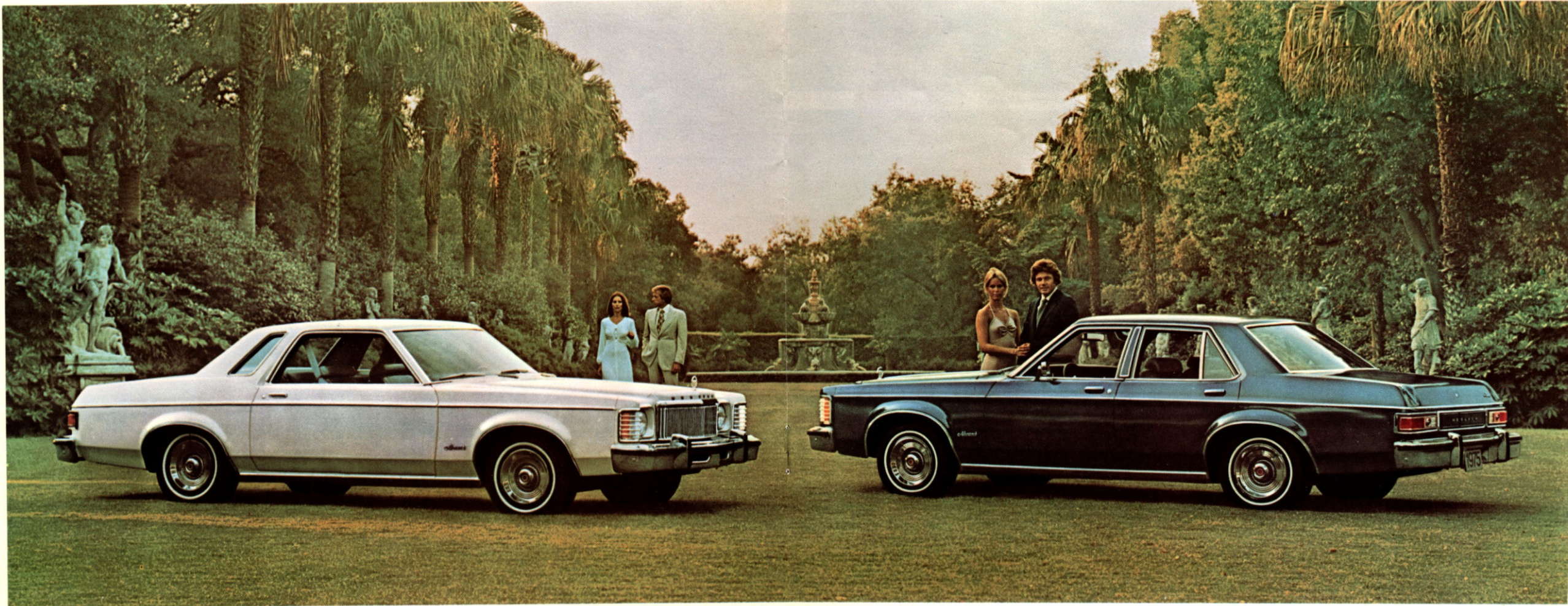
Mercury Monarch 2-Door