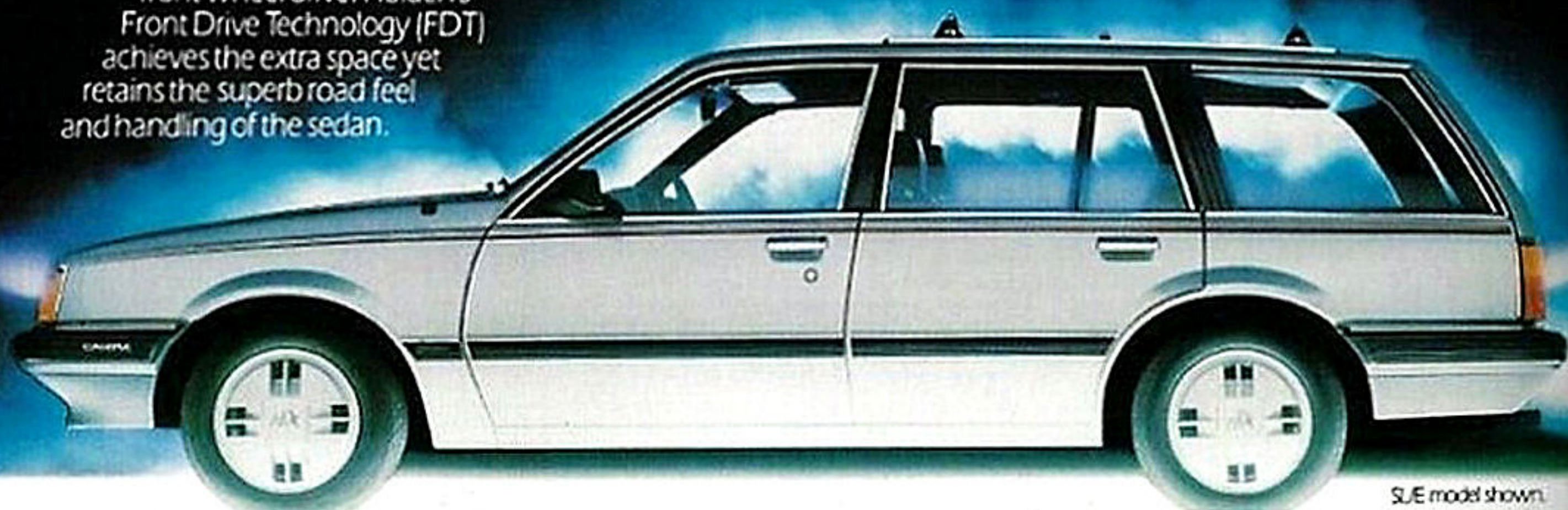
S/E model shown.

▲ Camira is a Superwagon in every sense, with technological innovation bringing practical benefits everywhere—there's even a built-in dust deflector on the tailgate.