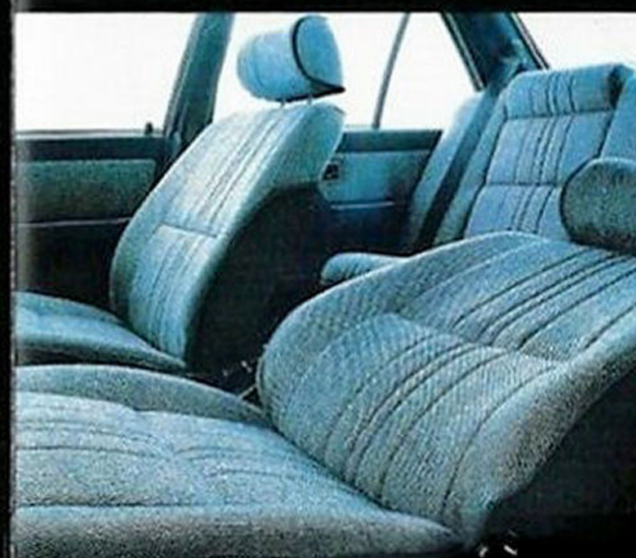
Camira SL/E interior trim in high quality wool mix tweed, driver's seat features adjustable lumbar support and a seat height adjuster.