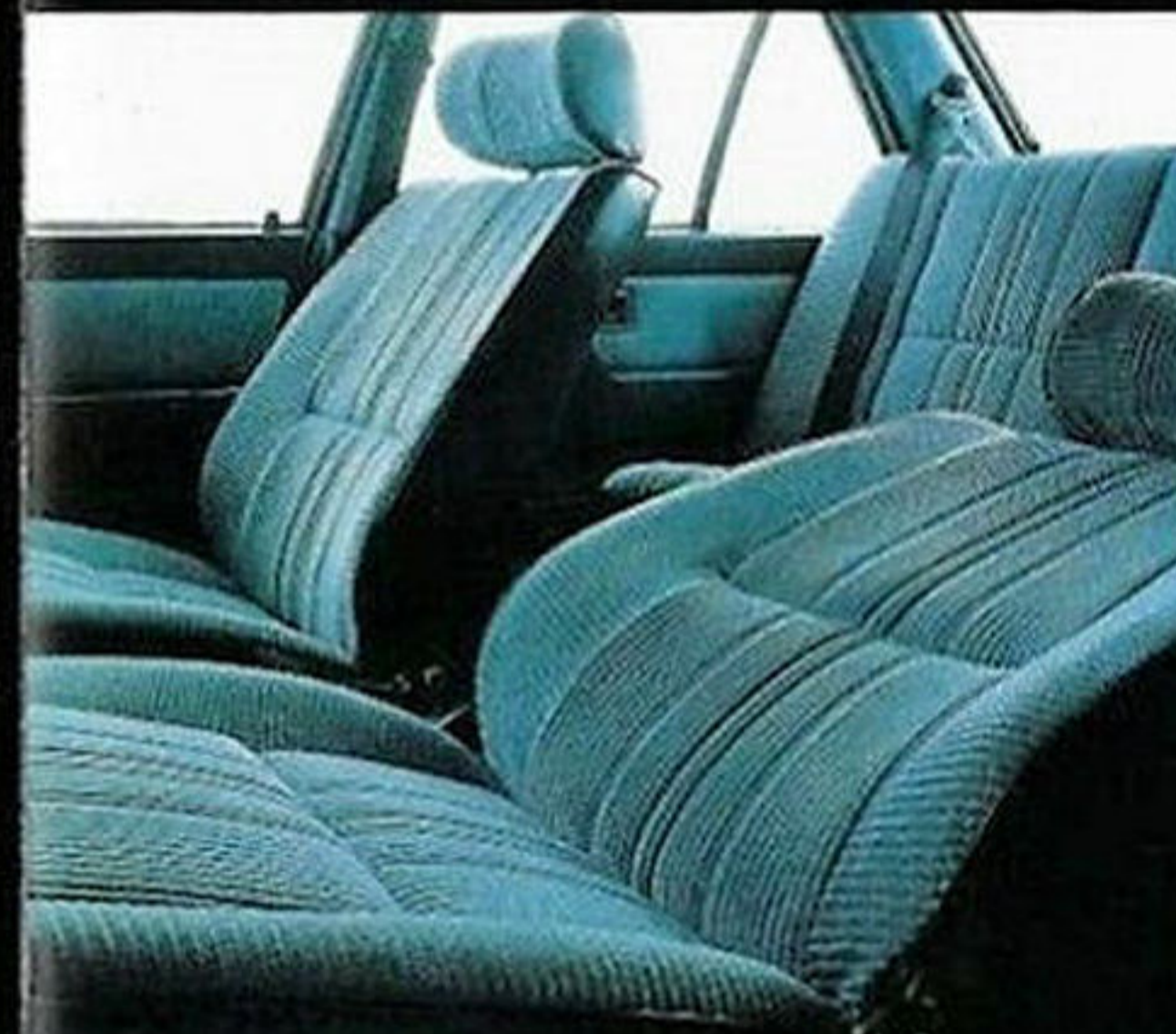
Camira SLX interior trim in comfortable cord cloth, with hard-wearing vinyl backing. Driver's seat features easy-to-use height adjuster.