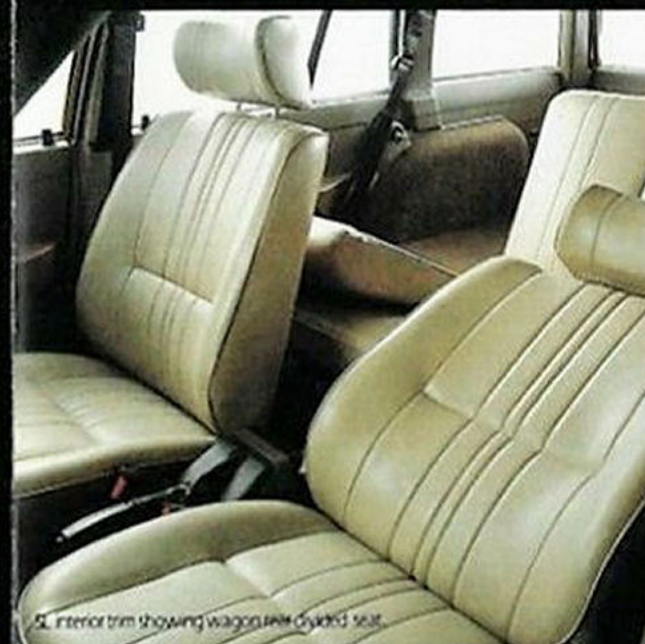
SL interior trim showing wagon rear divided seat.