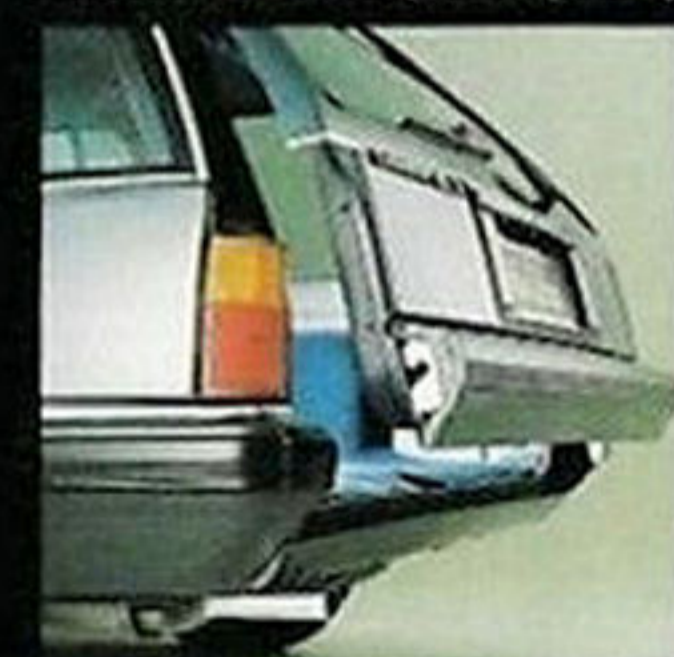
Centre section of wagon bumper is integral with tailgate, allowing you to stand closer to load floor.