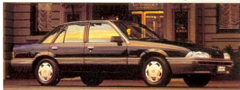
Holden Commodore Berlina Sedan