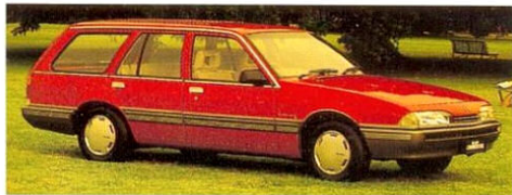
Holden Commodore SL Wagon

And the rear window wash/wipe system is standard on all models.