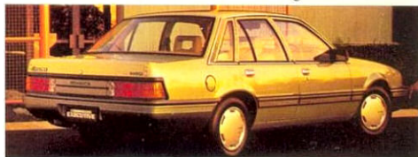
Holden Commodore Executive Sedan