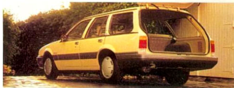
Holden Commodore Executive Wagon