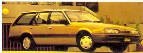
Holden Commodore Berlina Wagon