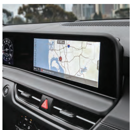
10.25" multimedia interface <sup>1,4</sup> with integrated touch-screen navigation.

The cabin of the Seltos is built around the driver, emphasizing clean design, excellent sightlines and intuitive control over every element of the driving experience.