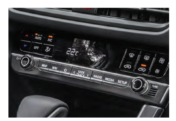
Automatic climate control<sup>1</sup> lets you set your ideal cabin temperature.

The 2025 Seltos tells a story of roominess and comfort, featuring standard heated front seats and available amenities that include automatic climate control, beautiful Sofino leather seating and a convenient driver seat memory function.