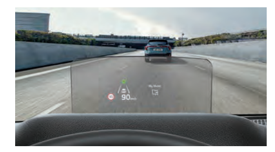
Heads-up display (HUD)¹ subtly projects key driving information on a secondary screen above the steering wheel.