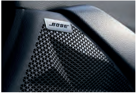
Bose premium audio<sup>1,10</sup> delivers crystal clear and balanced sound.