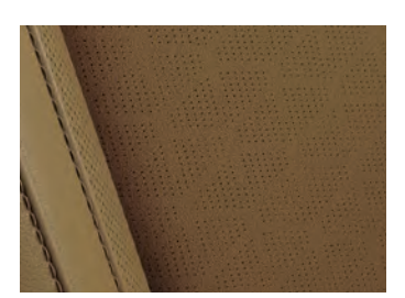
SX Sofino Gentle Brown leather (synthetic)

Some seating, paint and trim configurations may be limited. Visit kia.ca for full details.