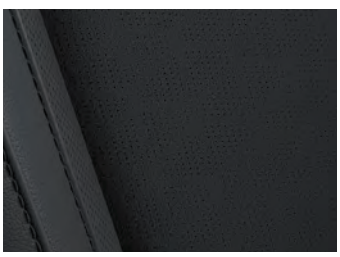
EX, EX Premium, SX, X-Line Sofino Black leather (synthetic)