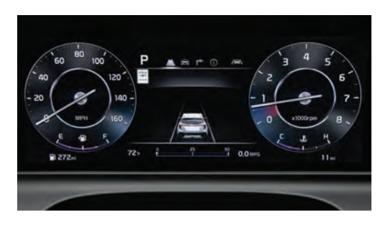
10.25" TFT LCD supervision cluster <sup>1</sup> provides you with vital driving info, while you stay focused on the road.