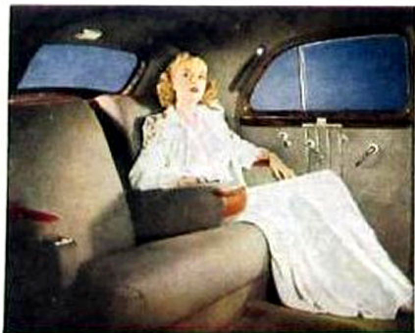
Oldsmobile's Roomiest, Most Luxurious Unisteel Body

You ride in motoring's newest and best interpretation of comfort and luxury when you ride in an Olds Custom 8 Cruiser. This great new car is the longest, lowest, finest Oldsmobile ever built . . . with sweeping exterior beauty and a richly appointed interior unsurpassed in roominess and comfort by any car at or near its price. The Olds Custom 8 Cruiser is a fast-stepping, smooth-operating, precision-built automobile with an imposing array of