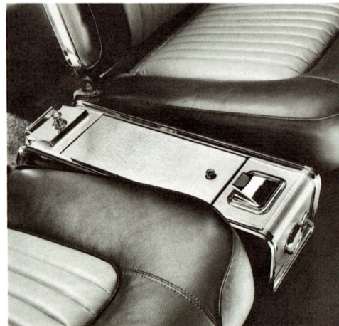
All-vinyl bucket seats with the look of leather—plus convenient console!

Take advantage of this special offer—come drive a Sport Fury today and get—free of charge—the biggest boot out of driving you've ever enjoyed! Caution: handle this car with care—it's hot!