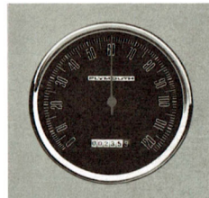
Floor it—and hang onto your hat!