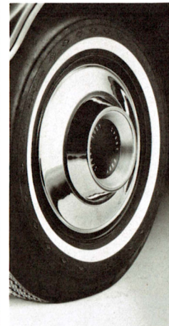
Special stainless steel wheel covers!