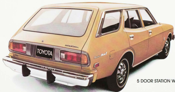
5 DOOR STATION WAGON