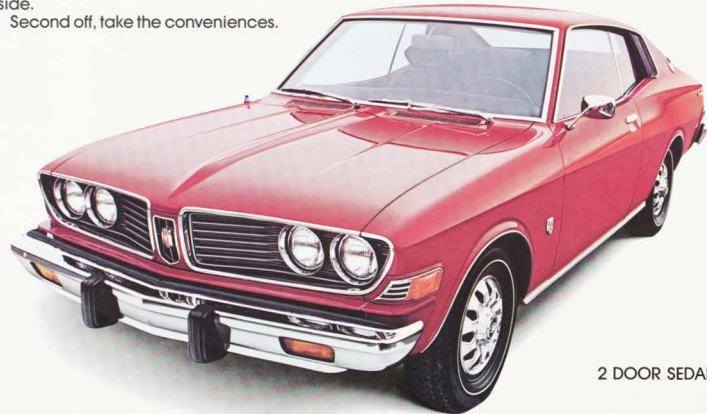
2 DOOR SEDAN

More standard talk: An electric clock. Tinted glass. Peppy 6-cylinder engine. 4-speed manual transmission. Power front disc brakes. 5 MPH recoverable front and rear bumpers.