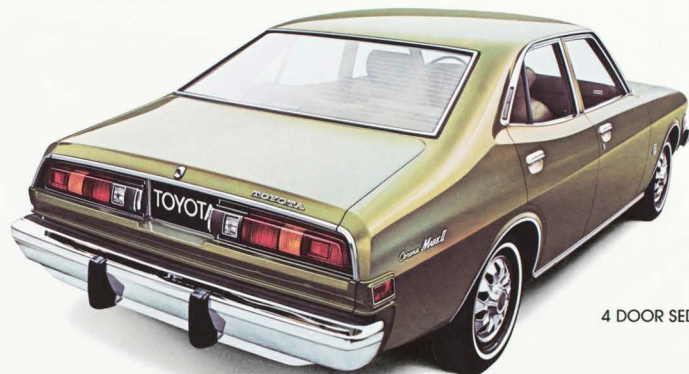
4 DOOR SEDAN