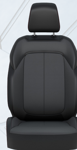
Sicily Leatherette with Axis II Perforations, Blue Agave/Wine Dual Accent Stitching and Rouge Piping — Global Black (Standard)