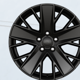
20-inch Gloss Black-Painted Aluminum (Standard)