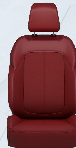
Sicily Leatherette with Axis II Perforations, Blue Agave/Light Slate Gray Dual Accent Stitching and Frost Piping — Black/Radar Red (Available)