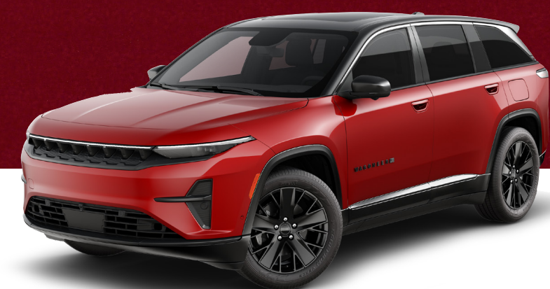
Red Hot Pearl