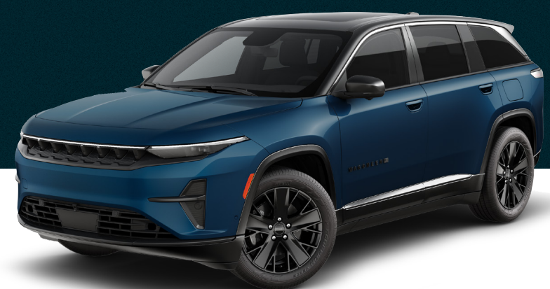
Fathom Blue Pearl