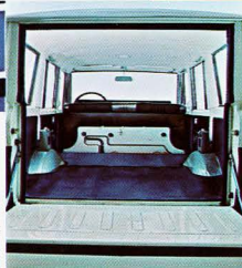
Spacious interior of station wagon. Back seat folds down for extra cargo space. (Carpeting optional.)