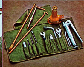
Tool kit. Axle type screw jack.