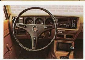
A handsome instrument panel adds a special touch of luxury to the roomy, comfortable interior.