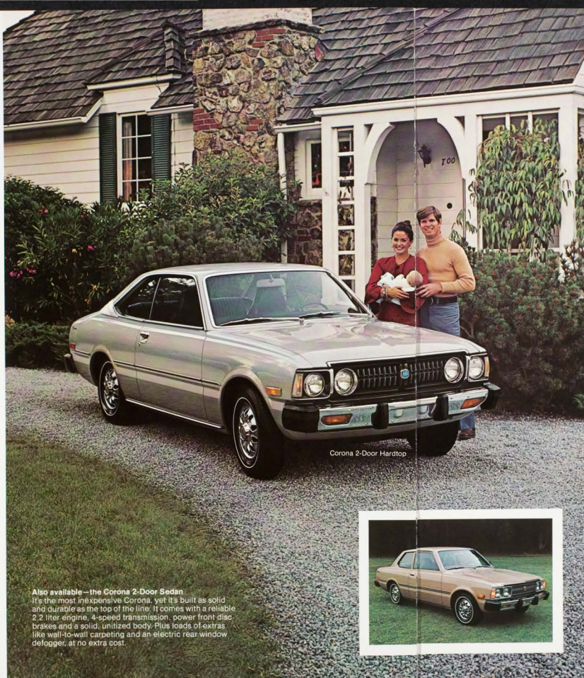
Corona 2-Door Hardtop

Also available—the Corona 2-Door Sedan. It's the most inexpensive Corona, yet it's built as solid and durable as the top of the line. It comes with a reliable 2.2 liter engine, 4-speed transmission, power front disc brakes and a solid, unitized body. Plus loads of extras, like wall-to-wall carpeting and an electric rear window defogger, at no extra cost.