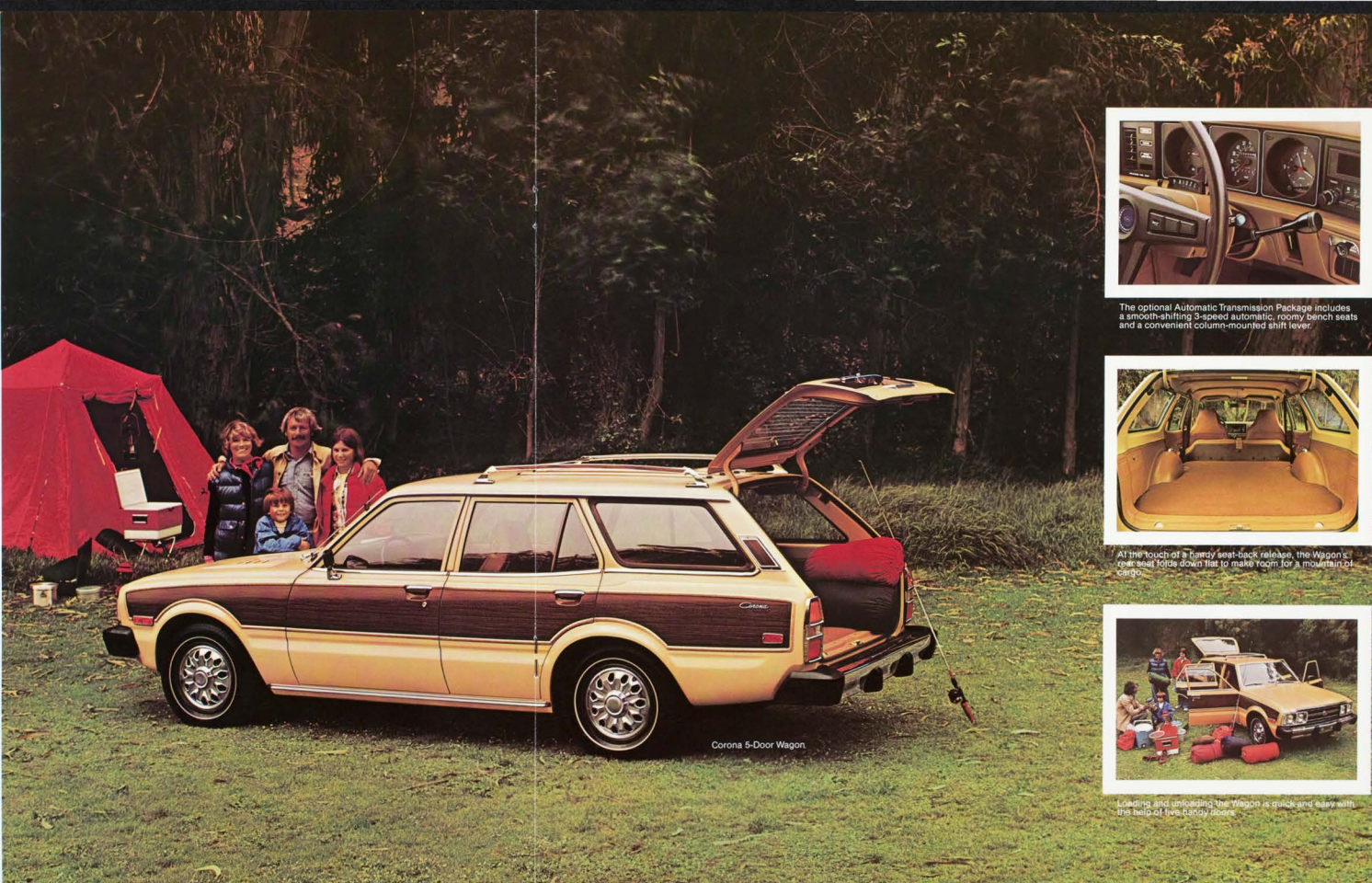
Corona 5-Door Wagon

*See EPA mileage figures on specification page.