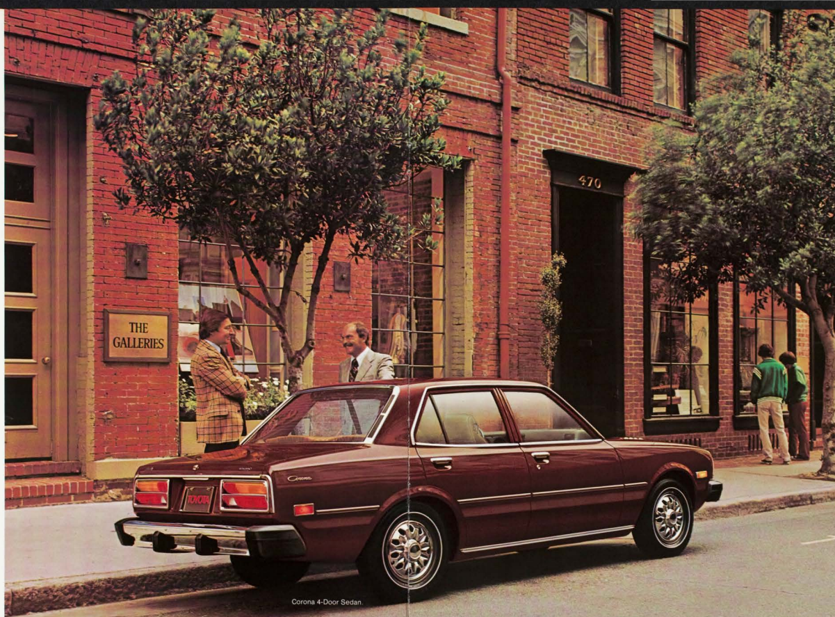
Corona 4-Door Sedan.

*See EPA mileage figures on specification page.