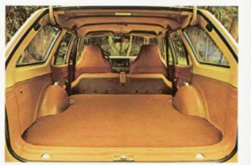
At the touch of a handy seat-back release, the Wagon's rear seat folds down flat to make room for a mountain of cargo.