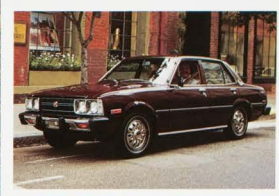
The 4-Door Sedan is classically styled to be as beautiful as the art it's displaying.