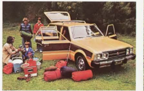
Loading and unloading the Wagon is quick and easy with the help of two handy levers.