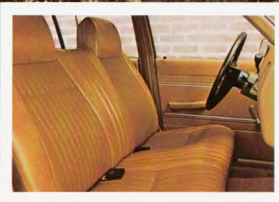
The optional 3-speed automatic transmission package includes roomy bucket seats and a column-mounted shift lever.