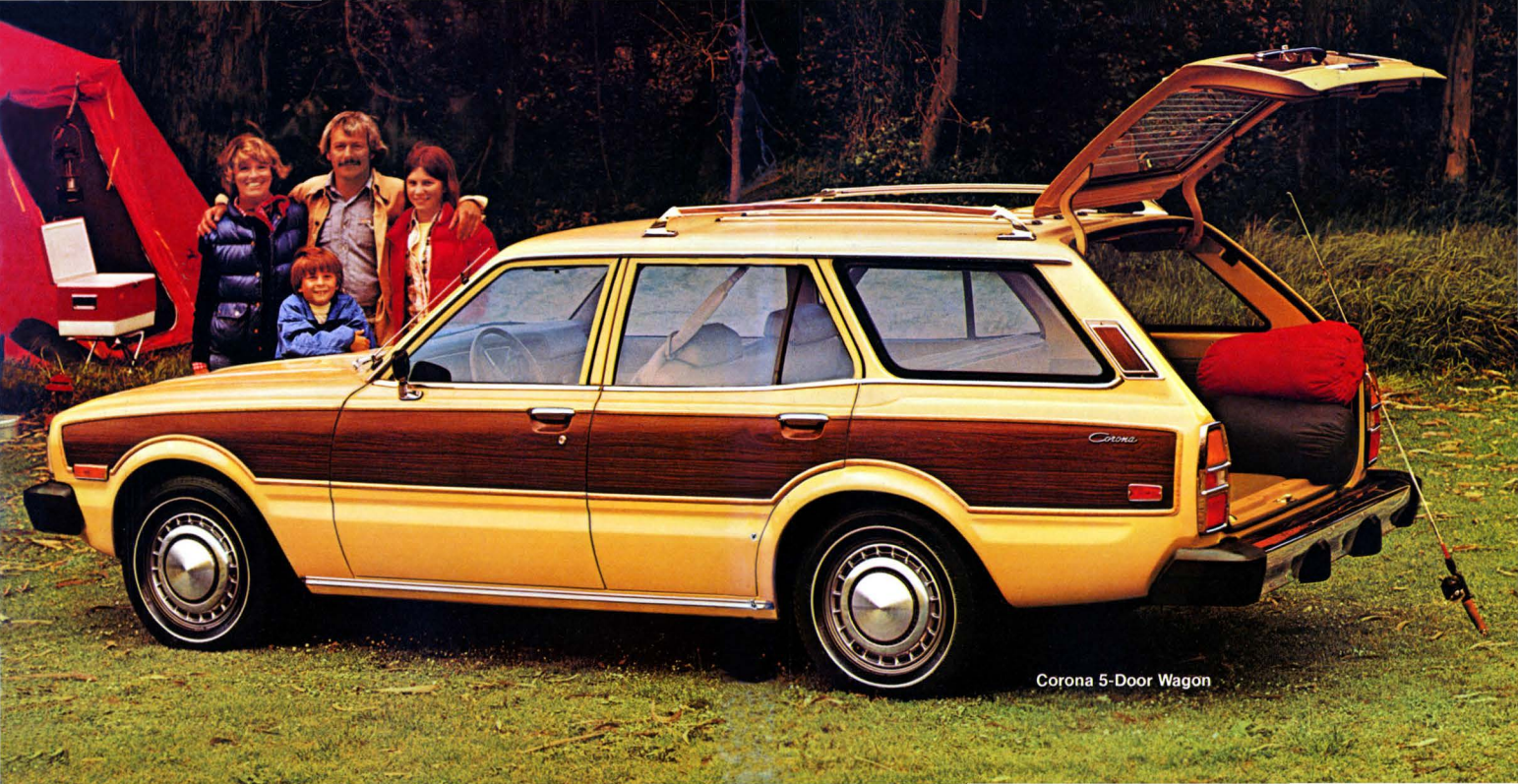
Corona 5-Door Wagon