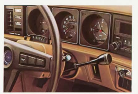
The optional Automatic Transmission Package includes a smooth-shifting 3-speed automatic, roomy bench seats and a convenient column-mounted shift lever.