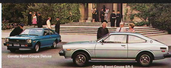
Corolla Sport Coupe Deluxe