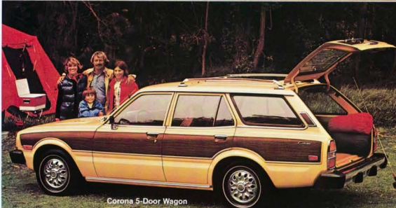
Corona 5-Door Wagon