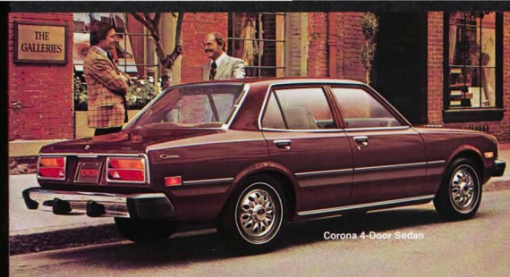
Corona 4-Door Sedan