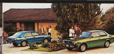
Corolla 4-Door Sedan Deluxe