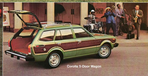
Corolla 5-Door Wagon