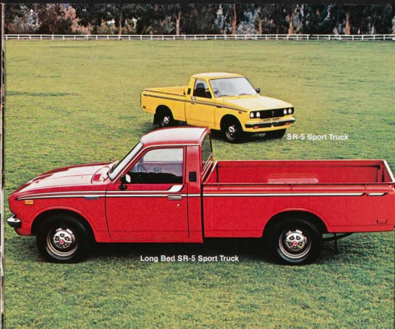
SR-5 Sport Truck