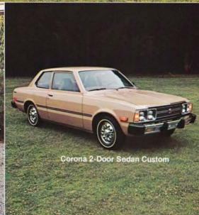
Corona 2-Door Sedan Custom