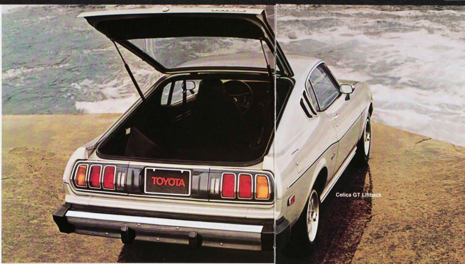
Celica GT Liftback

You asked for sports car excitement plus, you got it. Toyota Celica.