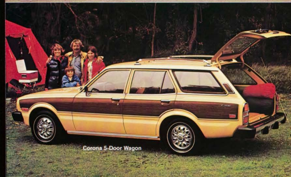
Corona 5-Door Wagon