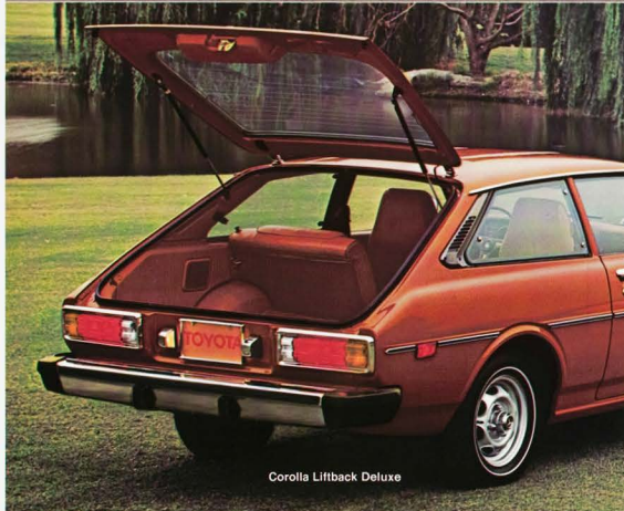
Corolla Liftback Deluxe

*See EPA statement on inside back cover.