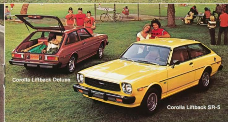
Corolla Liftback Deluxe