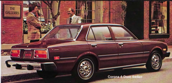
Corona 4-Door Sedan

*See EPA statement on inside back cover.