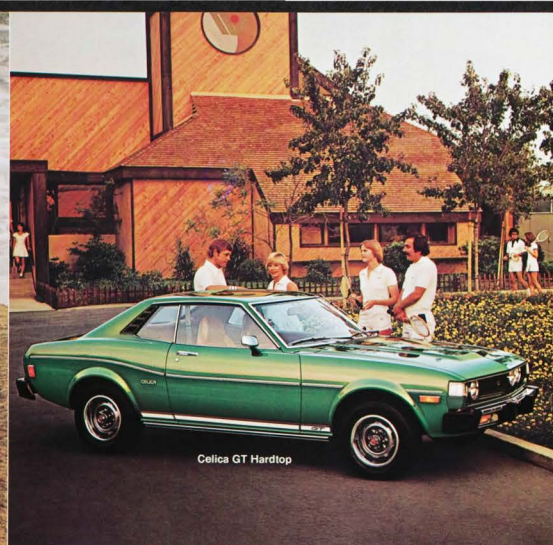
Celica GT Hardtop