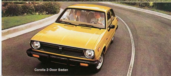
Corolla 2-Door Sedan