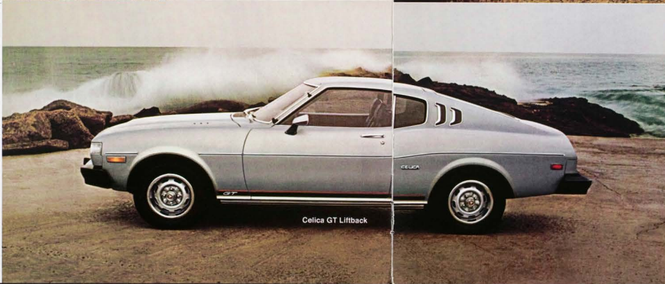
Celica GT Liftback