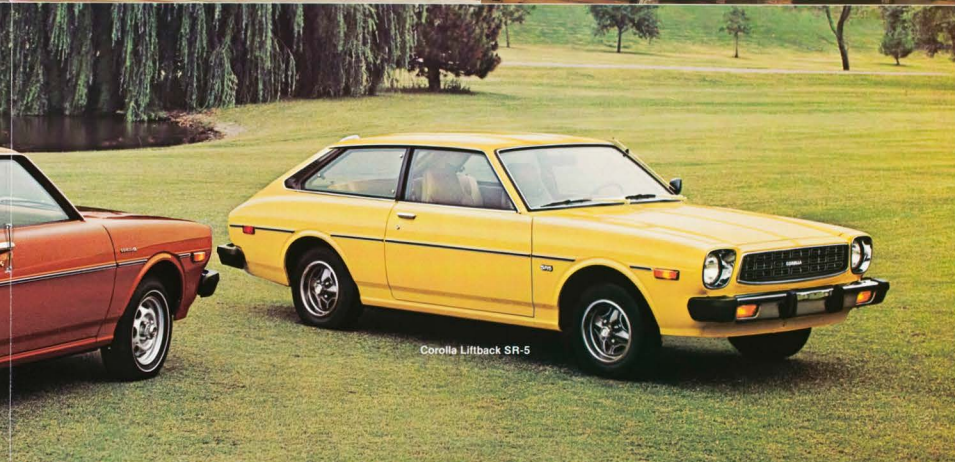
Corolla Liftback SR-5