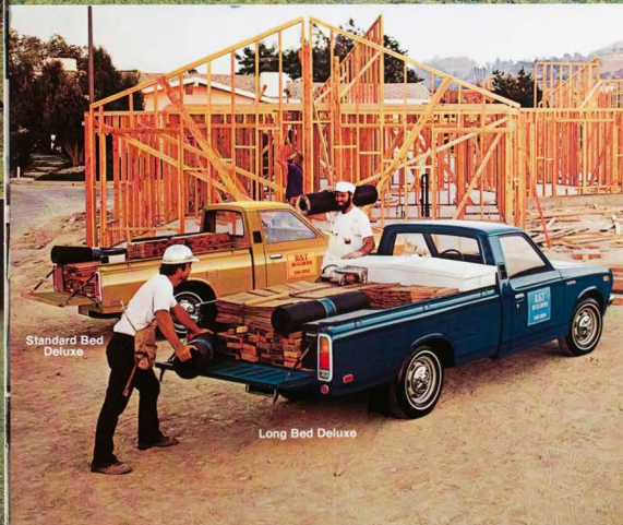
Standard Bed Deluxe