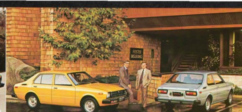
Corolla 4-Door Sedan Custom