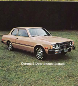
Corona 2-Door Sedan Custom