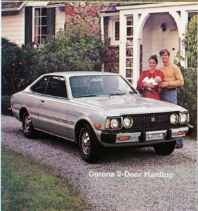
Corona 2-Door Hardtop