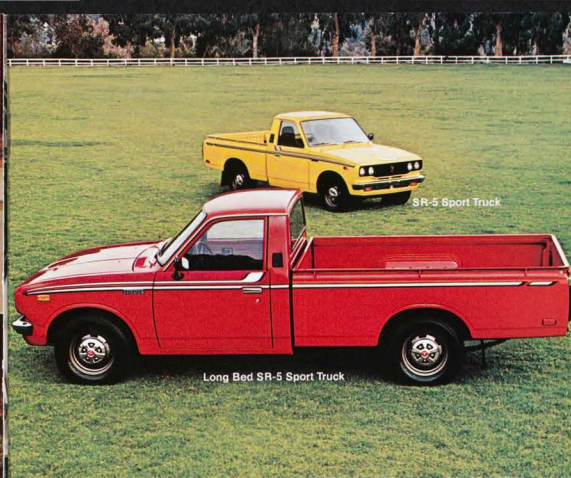
SR-5 Sport Truck