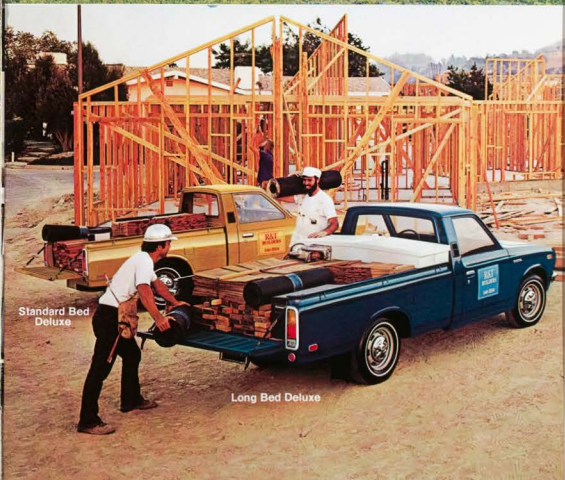
Standard Bed Deluxe