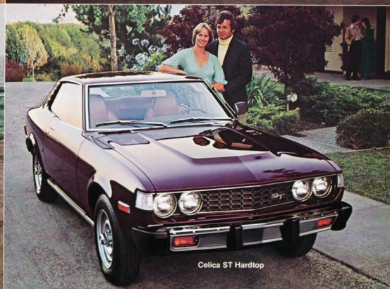
Celica ST Hardtop