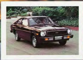
Corolla Deluxe Sport Coupe — another Corolla Sport Coupe that's loaded with standard features. A smooth-shifting 3-speed automatic transmission is optional.