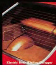
Electric Rear Window Defogger