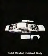
Solid Welded Unitized Body