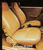
Reclining H-Back Vinyl Front Bucket Seats