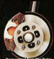
Power-assisted Front Disc Brakes