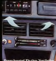
Power-assisted Flo-thru Ventilation