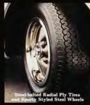
Steel belted Radial Ply Tires and Sporty Styled Steel Wheels