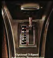
Optional 3-Speed Automatic Transmission