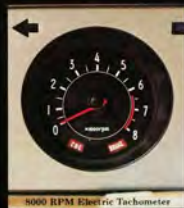
5000 RPM Electric Tachometer