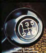
Optional 5-Speed Overdrive Transmission