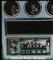
Optional Music Machines