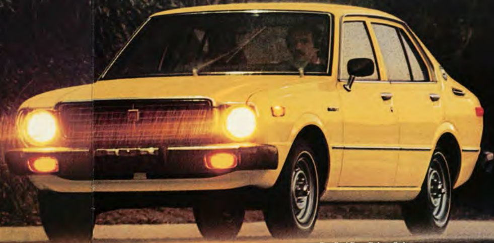
Corolla 4-Door Deluxe Sedan

Corolla 2-Door Deluxe Sedan — all the features of the 4-Door Deluxe Sedan plus flip-out rear quarter windows and an easy-access rear-passenger walk-in device.