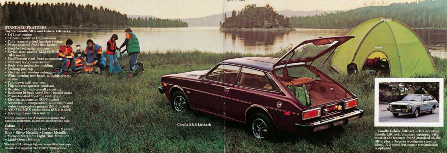
Corolla SR-5 Liftback

*See the EPA mileage figures on specifications page. Shown with optional rear window wiper/washer.