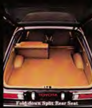
Fold-down Split Rear Seat