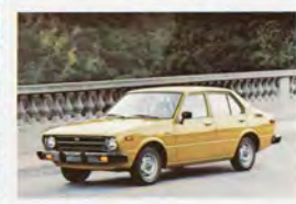
Corolla 4-Door Custom Sedan — equipped just as well as the 2-Door Sedan Custom, plus the convenience of two more doors.