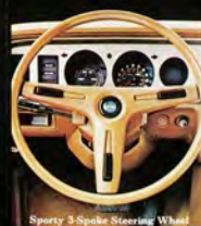
Sporty 3-Spoke Steering Wheel