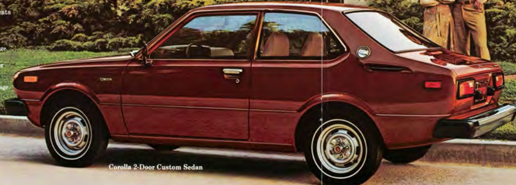
Corolla 2-Door Custom Sedan

*See the EPA mileage figures on specifications page. 1.6 Liter engine in California.