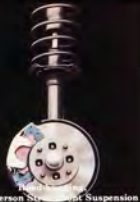
MacPherson Strut Front Suspension