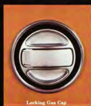
Locking Gas Cap