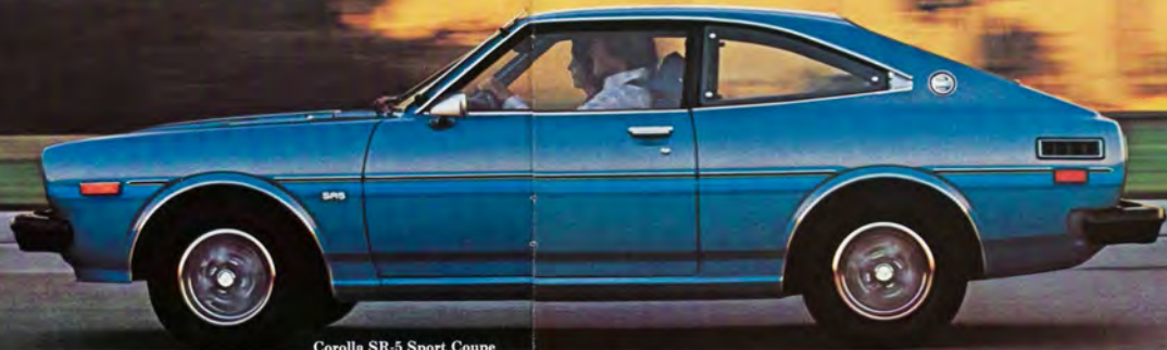
Corolla SR-5 Sport Coupe

*See the EPA mileage figures on specifications page.