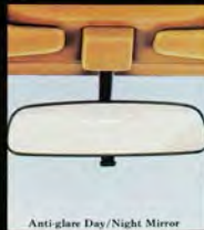
Anti-glass Day/Night Mirror