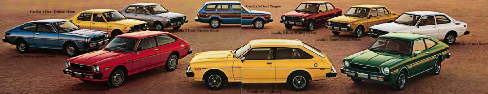
Corolla 4-Door Deluxe Sedan