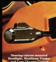
Steering-column-mounted Headlight, Headlamp Flasher and Lane Changer Control