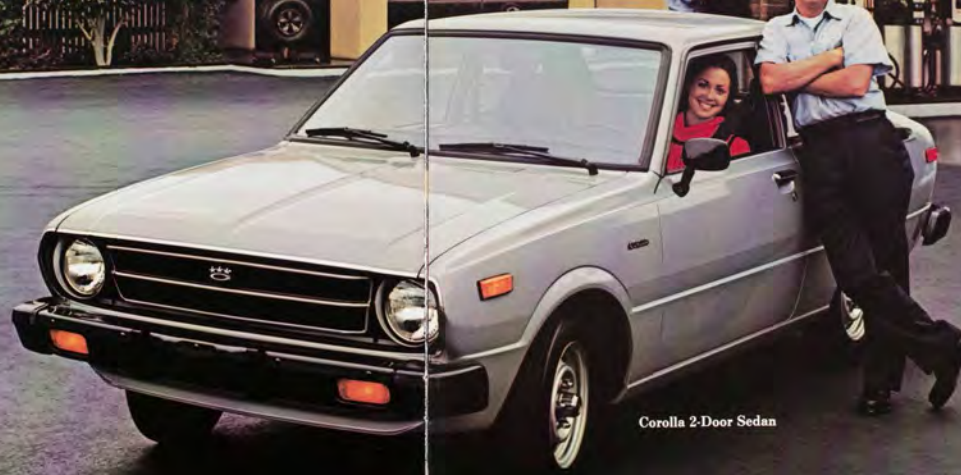
Corolla 2-Door Sedan