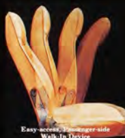
Easy-access, front-right side Walk-In Device