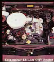
Economical* 1.6 Liter OHV Engine