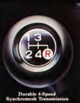
Durable 4-Speed Synchromesh Transmission